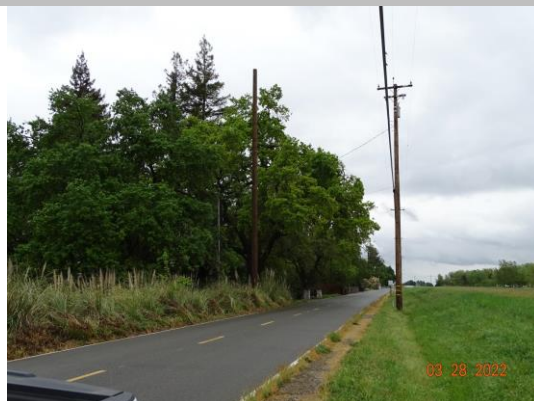
This photo was taken from the crown facing downstream looking down the waterward levee slope at the landscaping.