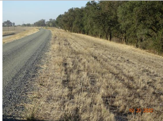
View of annual vegetation on the waterside slope, Fall 2022.