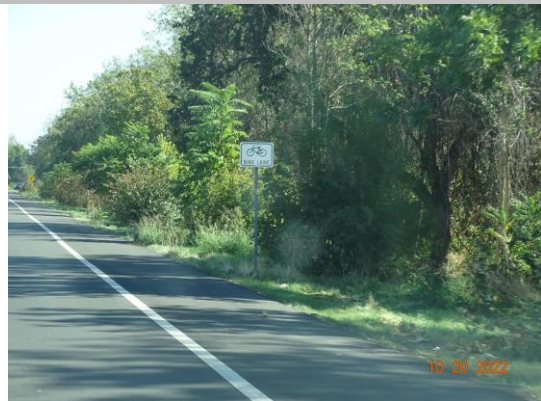
View of starter trees on the waterside slope, Fall 2022.