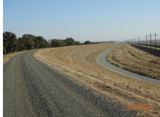
View of annual vegetation on the landside slope, Fall 2022.