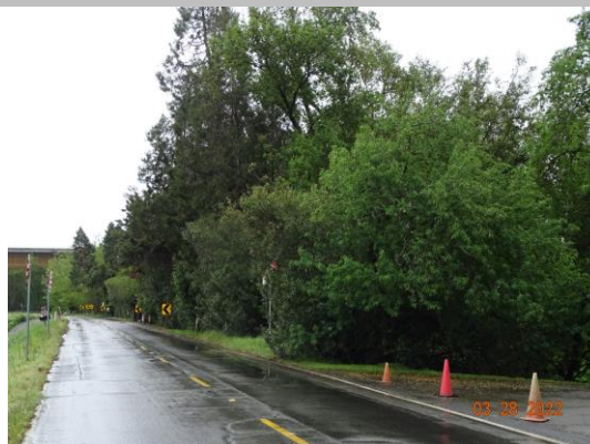
View on waterside looking downstream of property covered by Oleander Bushes.