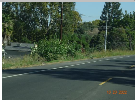
View of starter trees on the landside slope, Fall 2022.