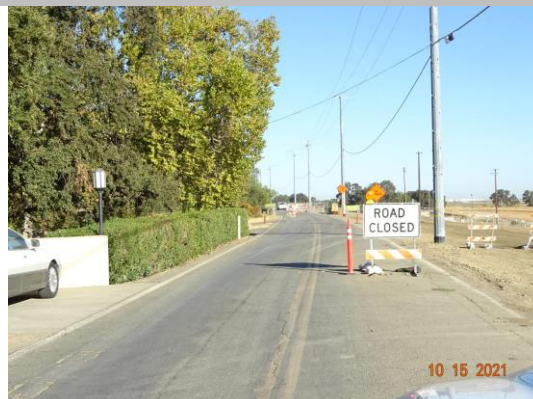
View of construction in Reach B looking upstream, Fall 2021.

* Location LS : Land Side N/A : Not Applicable WS : Water Side CR : Crown