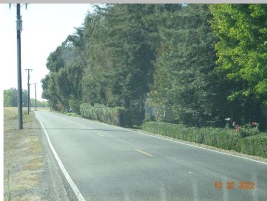
View looking upstream waterside of landscape vegetation that is blocking access and visibility to the levee, Fall 2021.