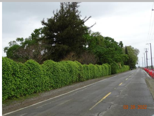
View of the landscaping on the waterside levee slope.