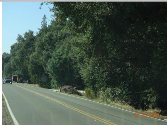
View of waterside levee where the landowner has planted fruit trees and other landscape vegetation, Fall 2022.