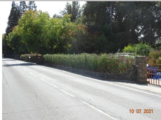
View taken from the crown facing downstream looking at the waterward levee slope at landscaping, Fall 2021.