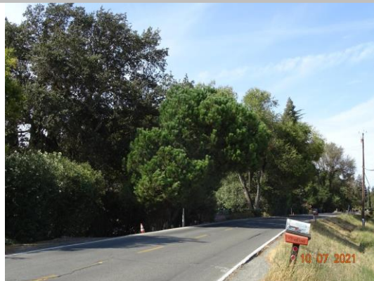
View looking upstream at landscape vegetation blocking visibility and access, Fall 2021.