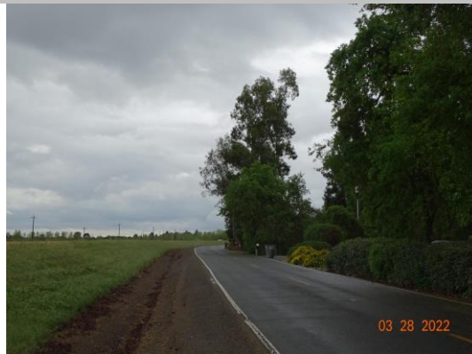
Typical Garden Hwy 'Landscaping'.