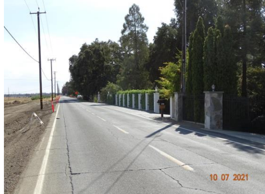
View on waterside looking downstream of where the vegetation covers the front of the fence, Fall 2021