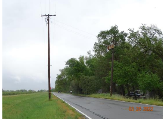
View of landscape vegetation that blocks access and visibility.