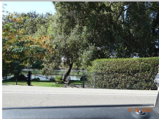
View looking at waterside landscape vegetation that is blocking access and visibility to the levee, Fall 2022.