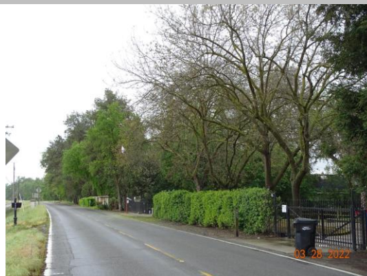
View of the landscaping on the waterside levee slope.