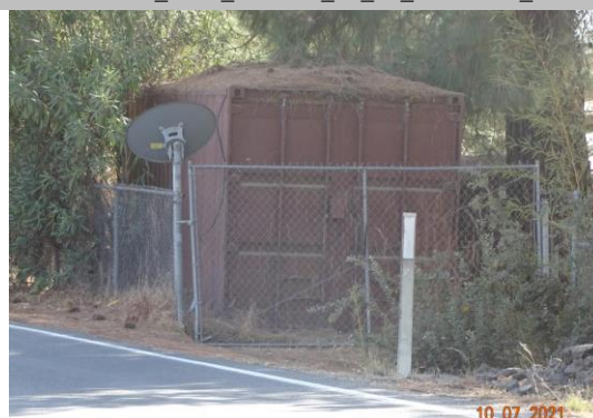
Cargo container on levee shoulder, the property appears to be on fill material, Fall 2021.