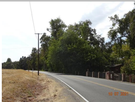
View taken from the crown facing downstream looking at the waterward levee slope at the landscaping, Fall 2021.