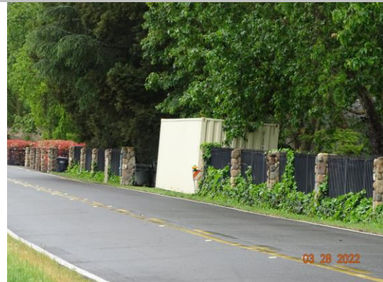
View of shipping container on waterside.