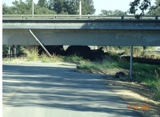
View of debris and tents from campers on the levee crown, Fall 2022.