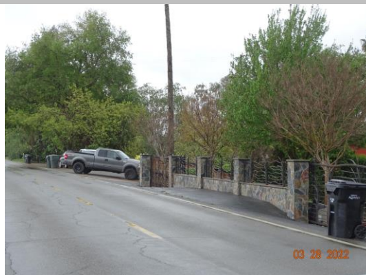
View on waterside looking downstream of a rock and wrought iron fence that partially blocks visibility and access.