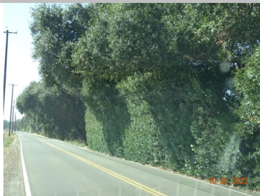
View looking at waterside landscape vegetation that is blocking access and visibility to the levee, Fall 2022.

* Location LS : Land Side N/A : Not Applicable WS : Water Side CR : Crown