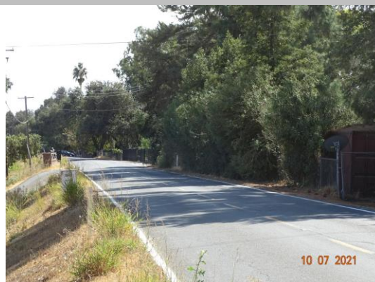
View taken from the crown facing downstream looking at the waterward levee slope at unacceptable landscaping, Fall 2021.