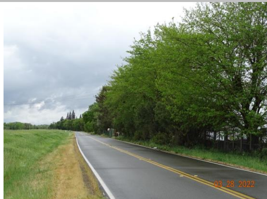
Typical landscape vegetation along the waterside in front of residences.