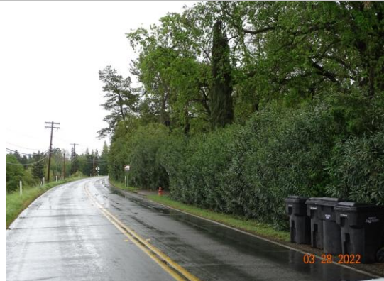
View of fence covered by Oleander Bushes.