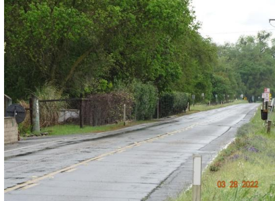
View on waterside looking across at the fence covered by vegetation.