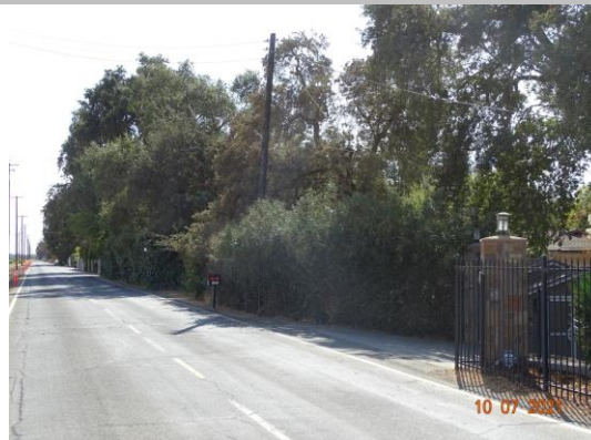
View taken from the crown facing downstream looking at the waterward levee slope at the landscaping, Fall 2021.