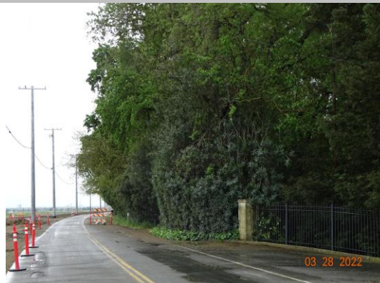
View taken from the crown facing downstream looking at the waterward levee slope at unacceptable landscaping, Spring 2020.