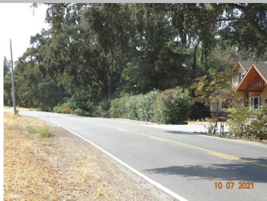
View taken from the crown facing downstream looking at the waterward levee slope at the landscaping, Fall 2021.

* Location LS : Land Side N/A : Not Applicable WS : Water Side CR : Crown