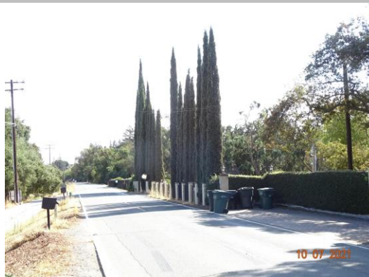
View looking upstream at landscape vegetation blocking visibility and access, Fall 2021.