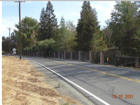
View taken from the crown facing downstream looking at the waterward levee slope at the landscaping, Fall 2021.