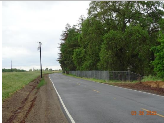
View of the fence encroachment, Spring 2022.