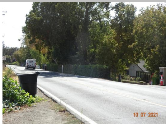
View taken from the crown facing downstream looking at the waterward levee slope at unacceptable landscaping, Fall 2021.