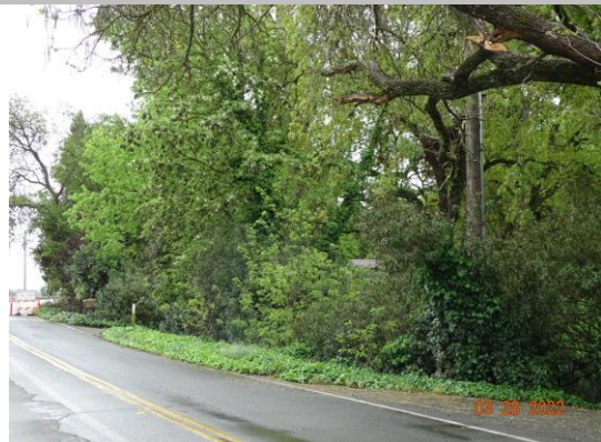
View of the landscaping on the waterside levee slope.