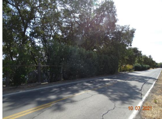
View looking upstream waterside at landscaping that needs to be removed, Fall 2021.