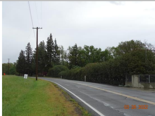
This photo was taken from the crown facing downstream looking down the waterward levee slope at the landscaping.

* Location LS : Land Side N/A : Not Applicable WS : Water Side CR : Crown