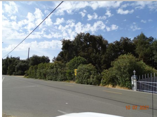
View taken from the crown facing downstream looking at the waterward levee slope at the landscaping, Fall 2021.