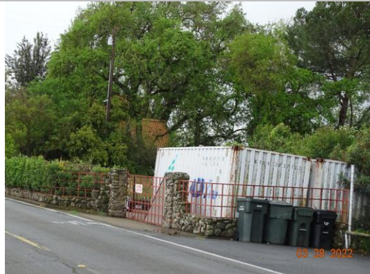
View of storage container from the landside of the crown facing the waterside of the levee.