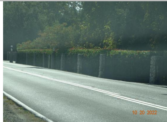
View looking at waterside landscape vegetation that is blocking access and visibility to the levee, Fall 2022.