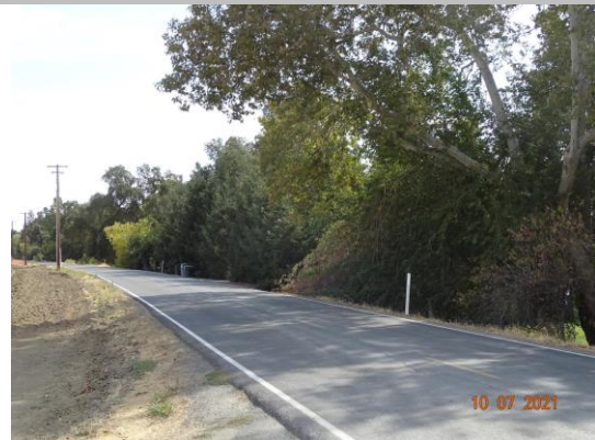
View taken from the crown facing downstream looking at the waterward levee slope at the landscaping, Fall 2021.