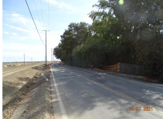
View taken from the crown facing downstream looking at the waterward levee slope at unacceptable landscaping, Fall 2021.