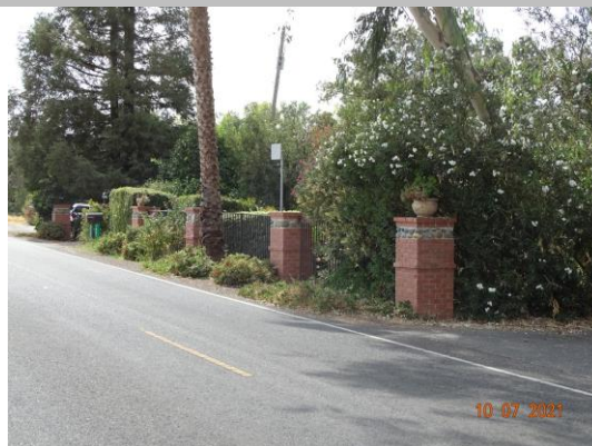
View taken from the crown facing downstream looking at the waterward levee slope at the landscaping, Fall 2021.