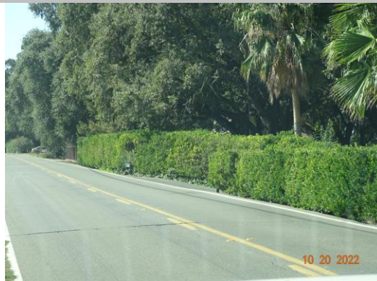
View at landscape vegetation that is blocking visibility and access, Fall 2022.