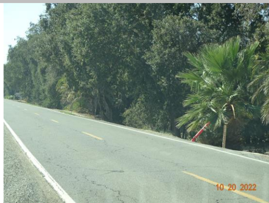
View looking upstream waterside of landscape vegetation that is blocking access and visibility to the levee, Fall 2022.

* Location LS : Land Side N/A : Not Applicable WS : Water Side CR : Crown