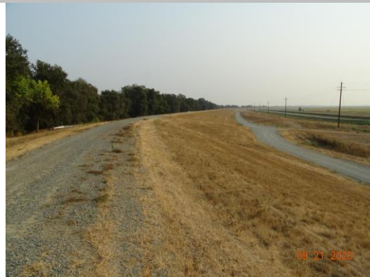
View of annual vegetation on landside slope, Fall 2020.