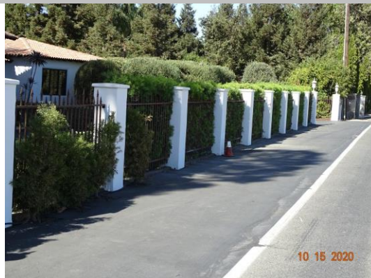
View on waterside looking upstream of where the vegetation covers the front of the fence.