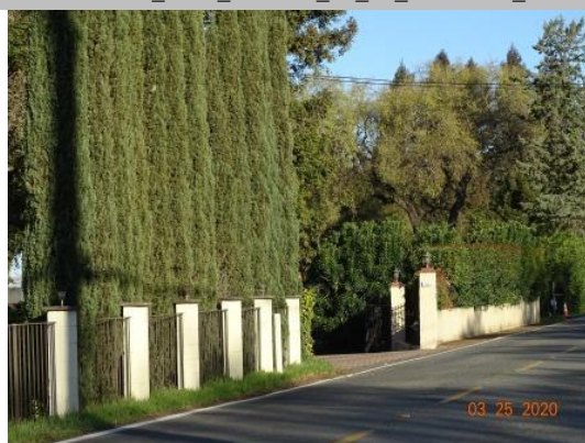
View looking upstream at landscape vegetation blocking visibility and access, Spring 2020.