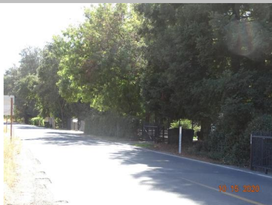
View of the landscaping on the waterside levee slope.