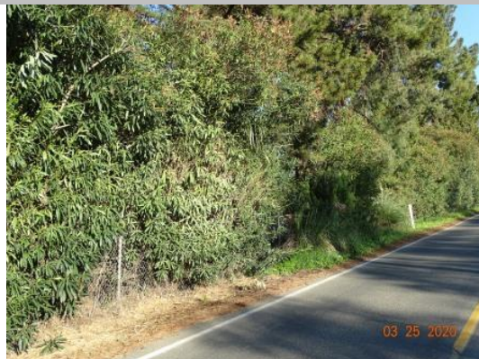
View taken from the crown facing upstream looking at the waterward levee slope at unacceptable landscaping, Spring 2020.