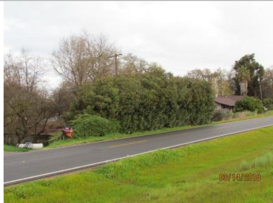
View looking upstream waterside of landscape vegetation that is blocking access and visibility to the levee.