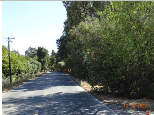
View on waterside looking downstream of property covered by Oleander Bushes.