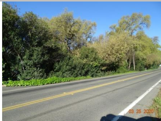
View taken from the crown facing upstream looking at the waterward levee slope at unacceptable landscaping, Spring 2020.