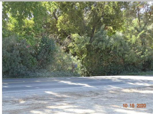
View of the landscaping on the waterside levee slope.