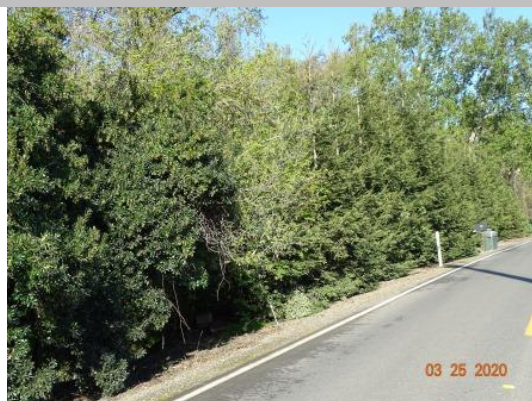
View taken from the crown facing upstream looking at the waterward levee slope at the landscaping, Spring 2020.