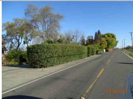
View taken from the crown facing upstream looking at the waterward levee slope at unacceptable landscaping, Spring 2020.