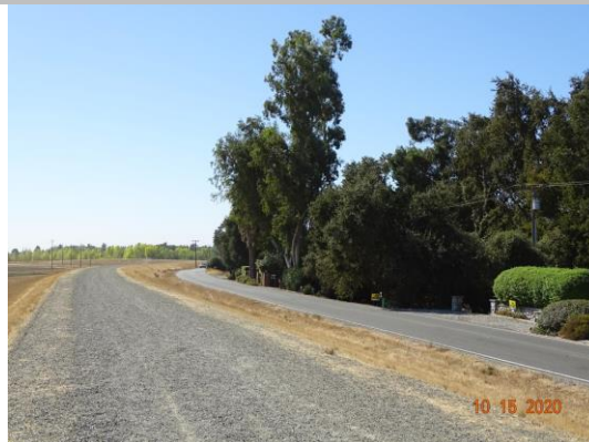
Typical Garden Hwy 'Landscaping'.