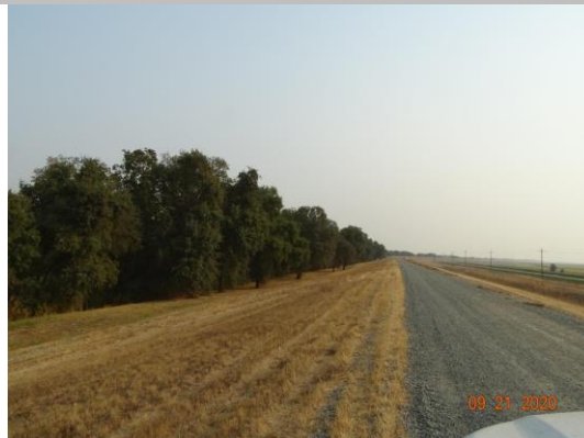
View of annual vegetation on waterside slope, Fall 2020.