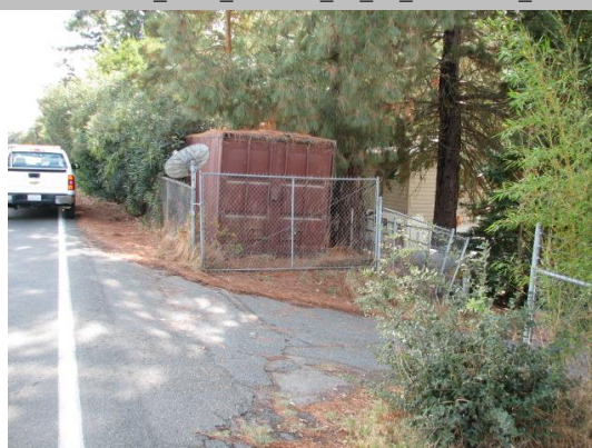
Cargo container on levee shoulder, the property appears to be on fill material.