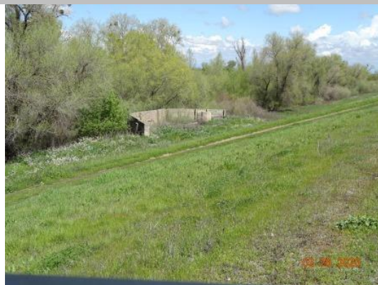
View looking upstream waterside at an old existing wall, Spring 2020.