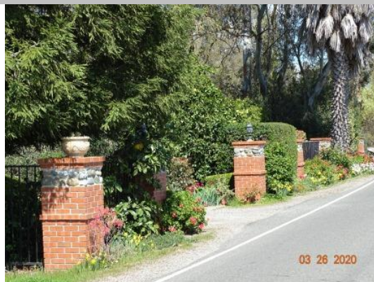
View taken from the crown facing upstream looking at the waterward levee slope at the landscaping, Spring 2020.

* Location LS : Land Side N/A : Not Applicable WS : Water Side CR : Crown