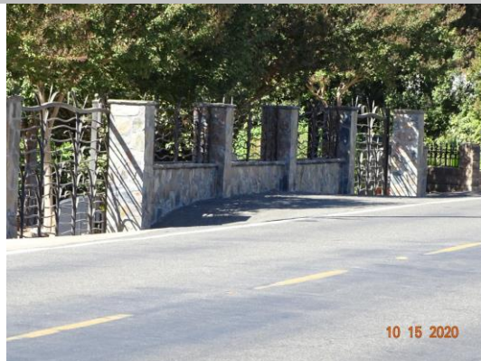
View on waterside looking upstream of a rock and wrought iron fence that partially blocks visibility and access.