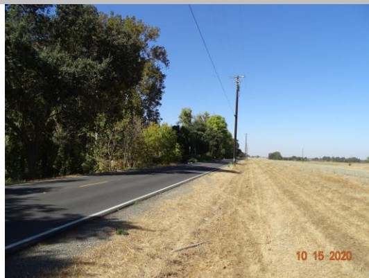
This photo was taken from the crown facing downstream looking down the waterward levee slope at unacceptable landscaping

* Location LS : Land Side N/A : Not Applicable WS : Water Side CR : Crown