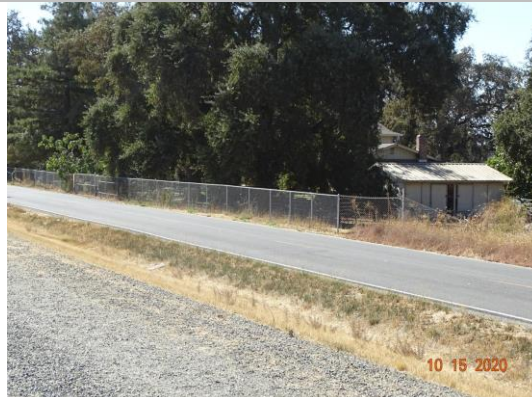
View of the fence encroachment.