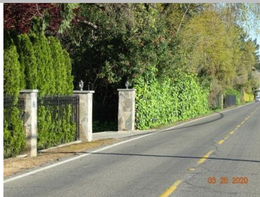
View taken from the crown facing upstream looking at the waterward levee slope at the landscaping, Spring 2020.