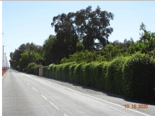
View of the landscaping on the waterside levee slope.