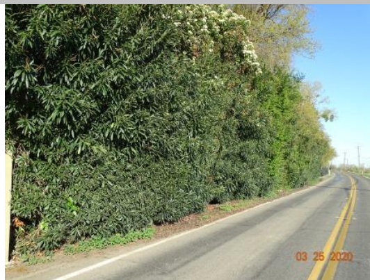
View taken from the crown facing upstream looking at the waterward levee slope at unacceptable landscaping, Spring 2020.