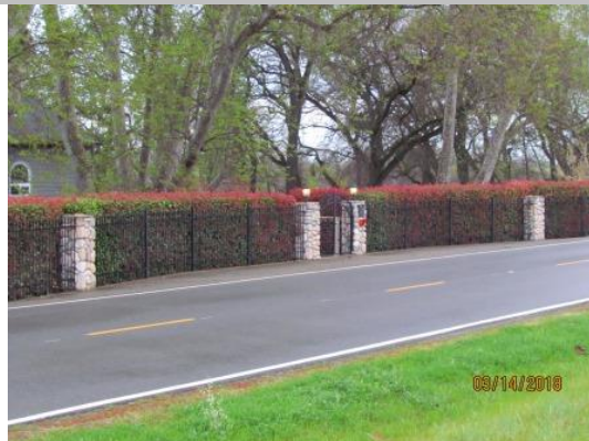
View looking at waterside landscape vegetation that is blocking access and visibility to the levee.