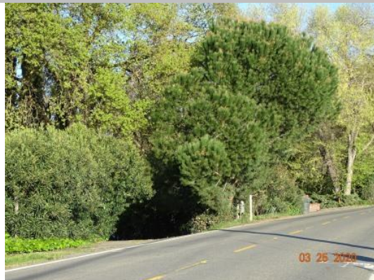
View looking upstream at landscape vegetation blocking visibility and access, Spring 2020.