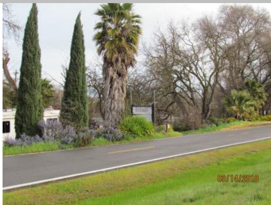
View looking upstream waterside of landscape vegetation that is blocking access and visibility to the levee.