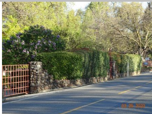
View taken from the crown facing upstream looking at the waterward levee slope at landscaping, Spring 2020.