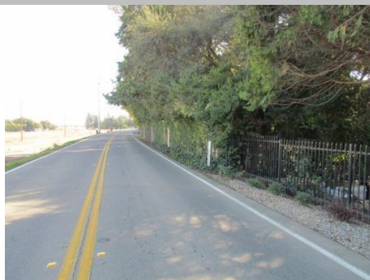
This photo was taken from the crown facing downstream looking down the waterward levee slope at the landscaping.