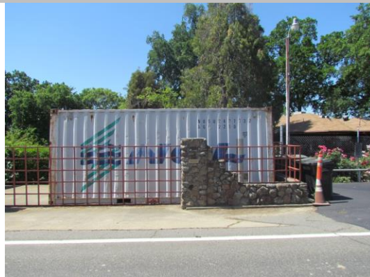
View of storage container from the landside of the crown facing the waterside of the levee.