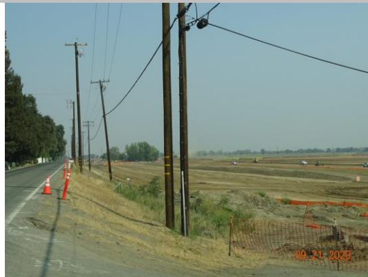
View of construction in Reach B looking upstream, Fall 2020.

* Location LS : Land Side N/A : Not Applicable WS : Water Side CR : Crown