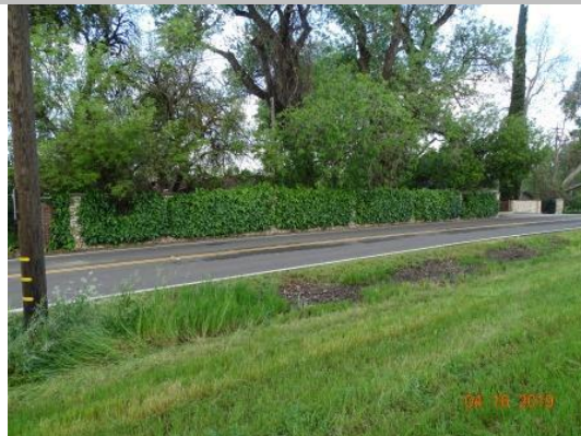
View of landscape vegetation that is blocking visibility and access.