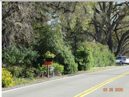
View taken from the crown facing upstream looking at the waterward levee slope at the landscaping, Spring 2020.