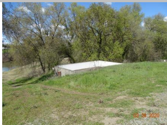
View of an existing concrete basin on the waterside slope, Spring 2020.