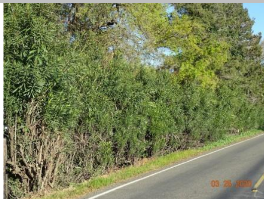
View taken from the crown facing upstream looking at the waterward levee slope at unacceptable landscaping, Spring 2020.

* Location LS : Land Side N/A : Not Applicable WS : Water Side CR : Crown