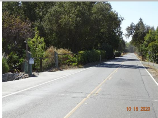
View of fence covered by Oleander Bushes.