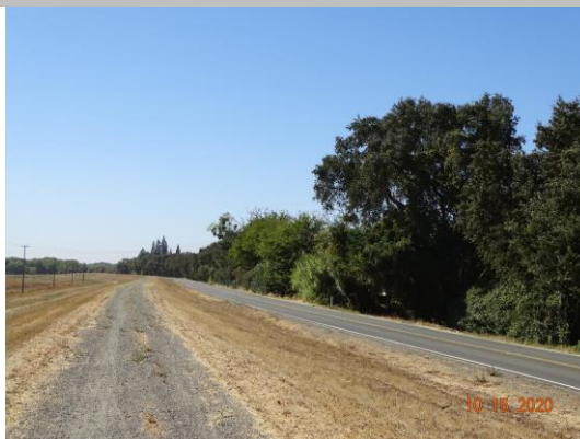
Typical landscape vegetation along the waterside in front of residences.