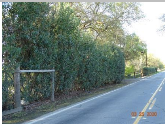
View looking upstream waterside at landscaping that needs to be removed, Spring 2020.