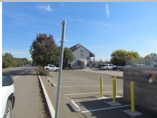
This photo was taken from the crown facing downstream looking down the waterward levee slope at an unpermitted building.

* Location LS : Land Side N/A : Not Applicable WS : Water Side CR : Crown