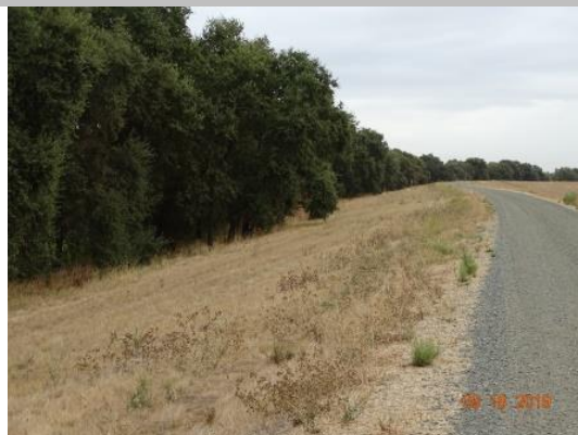
View looking upstream waterside of the well maintained annual vegetation, Fall 2019.

* Location LS : Land Side N/A : Not Applicable WS : Water Side CR : Crown