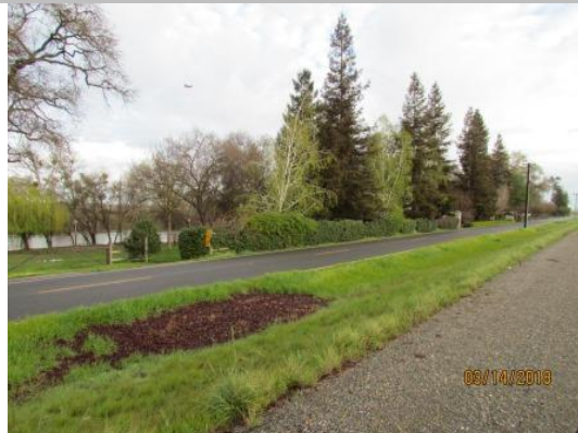
View looking upstream waterside of landscape vegetation that is blocking access and visibility to the levee.

LS : Land Side N/A : Not Applicable WS : Water Side CR : Crown