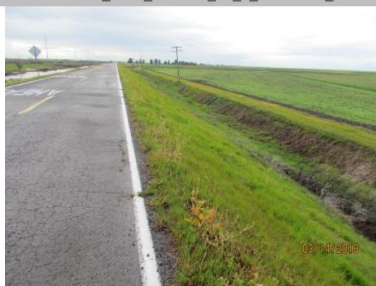
View looking downstream landside at a ditch at the toe.

LS : Land Side N/A : Not Applicable WS : Water Side CR : Crown