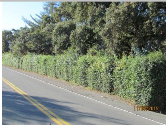
View of the landscaping on the waterside levee slope.