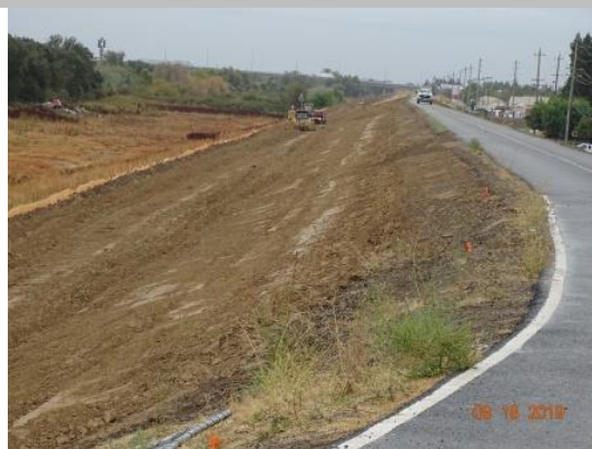
View looking downstream waterside of the levee under construction, Reach H-Army Corp Project, Fall 2019.