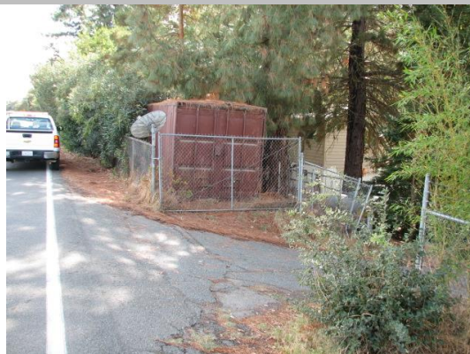
Cargo container on levee shoulder, the property appears to be on fill material.

Photo 1 of 1 : FA_2019_RD1000_31_76_20190904_00032.jpg