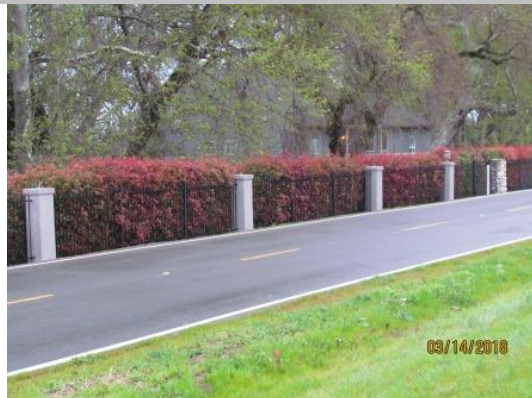
View looking at waterside landscape vegetation that is blocking access and visibility to the levee.