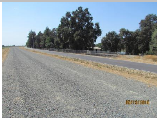
View of an encroachment, 'Fence'.

* Location LS : Land Side N/A : Not Applicable WS : Water Side CR : Crown