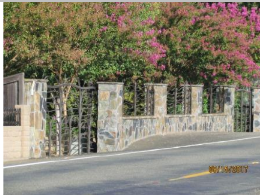
View on waterside looking upstream of a rock and wrought iron fence that partially blocks visibility and access.