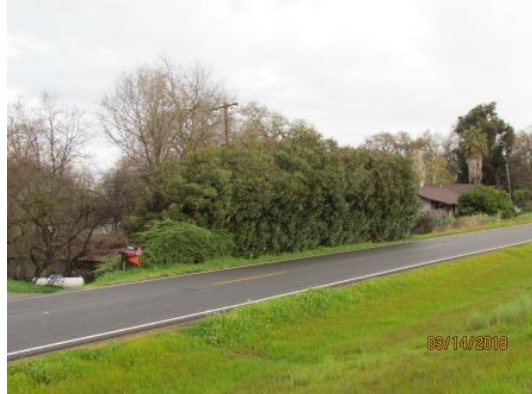
View looking upstream waterside of landscape vegetation that is blocking access and visibility to the levee.