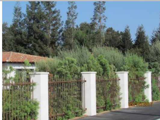
View on waterside looking upstream of where the vegetation covers the front of the fence.