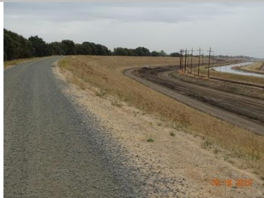
View looking upstream landside of the well maintained annual vegetation, Fall 2019.