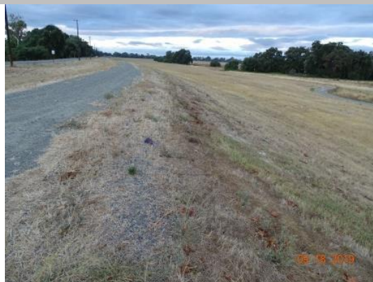
View looking upstream landside of the well maintained annual vegetation, Fall 2019.