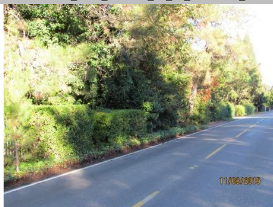
View of the landscaping on the waterside levee slope.

LS : Land Side N/A : Not Applicable WS : Water Side CR : Crown