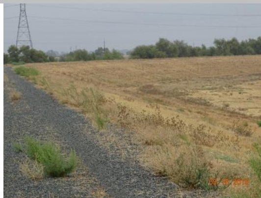
View looking downstream landside at the well maintained annual vegetation, Fall 2019.