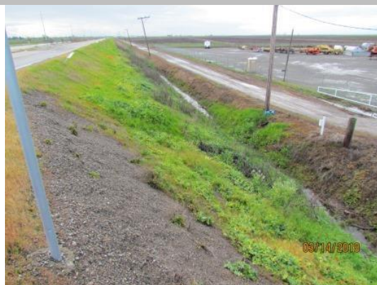
View of landside ditch at toe of levee, looking downstream.