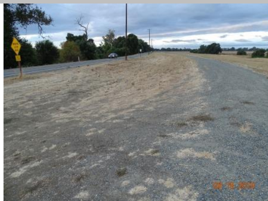
View looking upstream waterside of the well maintained annual vegetation, Fall 2019.