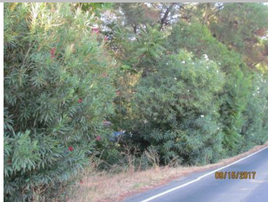
View of fence covered by Oleander Bushes.

LS : Land Side N/A : Not Applicable WS : Water Side CR : Crown