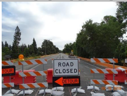
View looking upstream, this unit is under construction with Reach H &amp; I CORP's Project, Fall 2019.