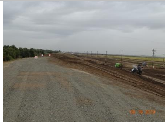
View of the construction area where the old pipes to the old pumping plant have been removed, Fall 2019.