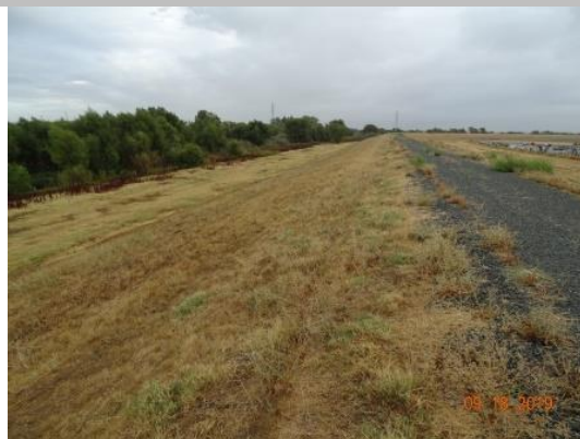
View looking downstream waterside at the well maintained annual vegetation, Fall 2019.