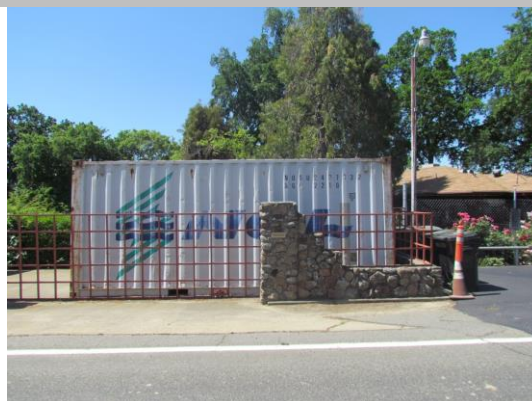
View of storage container from the landside of the crown facing the waterside of the levee.