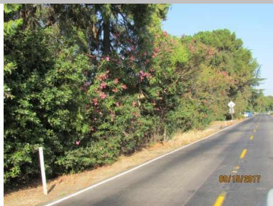
View on waterside looking upstream of property covered by Oleander Bushes.