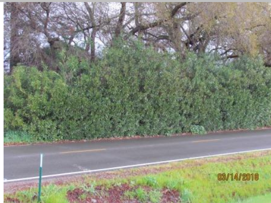
View looking at waterside landscape vegetation that is blocking access and visibility to the levee.