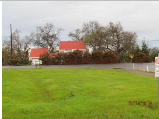
View looking at waterside landscape vegetation that is blocking access and visibility to the levee.

LS : Land Side N/A : Not Applicable WS : Water Side CR : Crown