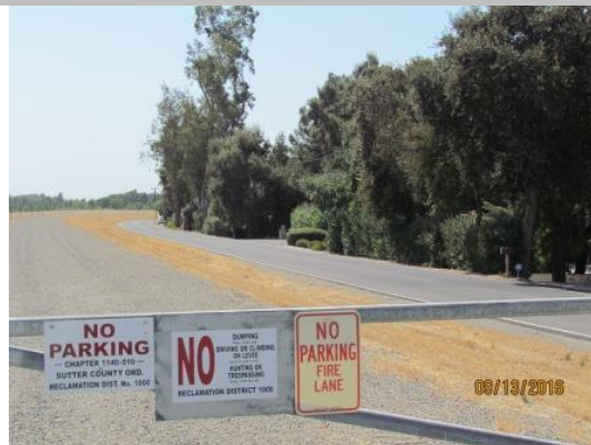
Typical Garden Hwy 'Landscaping'.