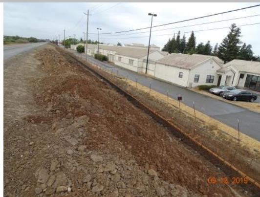
View looking downstream landside of the levee under construction, Reach H-Army Corp Project, Fall 2019.