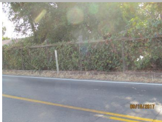
View on waterside looking across at the fence covered by vegetation.