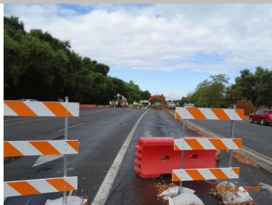
View looking downstream, this unit is under construction with Reach H &amp; I CORP's Project, Fall 2019.