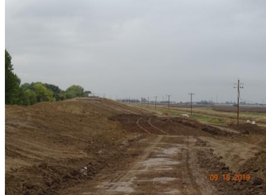
View of the construction area where the new pipes for the new pumping plant have been placed, Fall 2019.