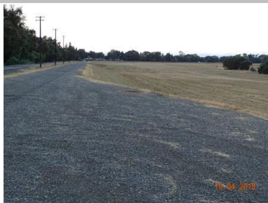
View looking upstream landside of the well maintained vegetation, Fall 2018.