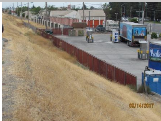
View looking downstream landside of fence that encroaches at levee toe, Fall 2017.