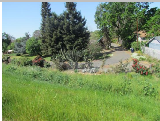
Taken facing the landside looking downstream.