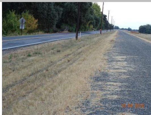
View looking upstream waterside of the well maintained vegetation, Fall 2018.