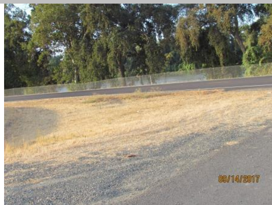
View on waterside of a non-permitted fence.