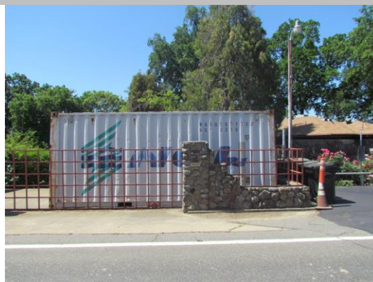
View of storage container from the landside of the crown facing the waterside of the levee.