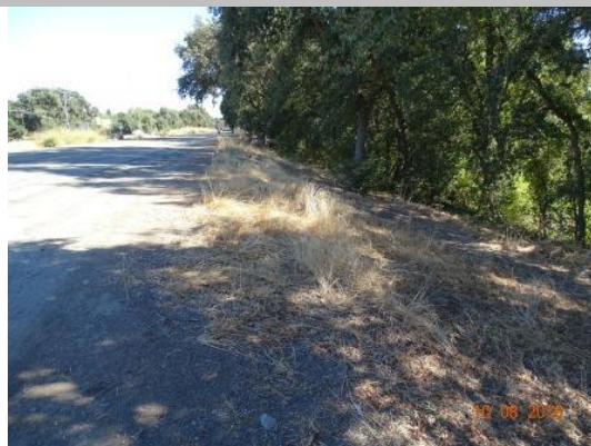
View looking downstream waterside of the well maintained annual Vegetation, Fall 2018.