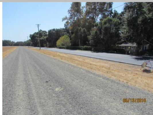
This photo was taken from the crown facing downstream looking down the waterward levee slope at unacceptable landscaping.