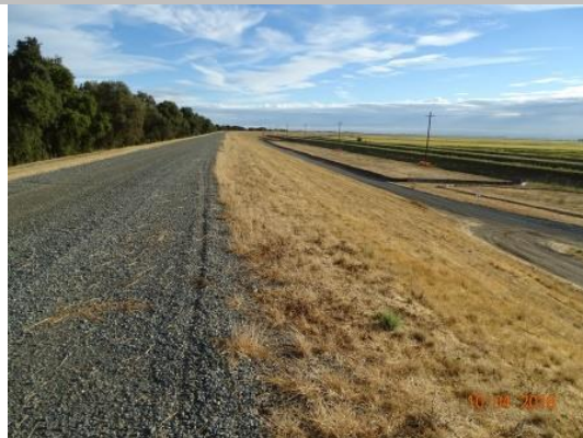
View looking upstream landside of the well maintained annual Vegetation, Fall 2018.