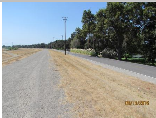
This photo was taken from the crown facing downstream looking down the waterward levee slope at unacceptable landscaping.

LS : Land Side N/A : Not Applicable WS : Water Side CR : Crown