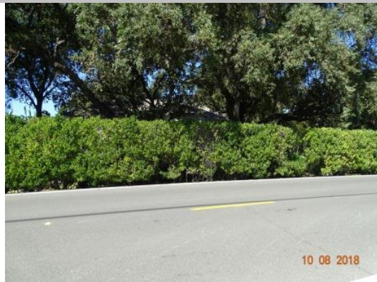
View at landscape vegetation that is blocking visibility and access, Fall 2018.