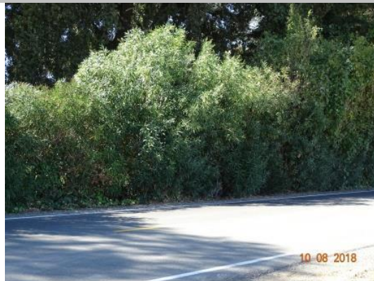
View of landscape vegetation that blocks visibility and access, Fall 2018.