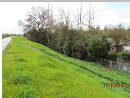
View looking downstream landside of fence at levee toe, Spring 2018.