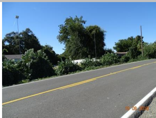
View of landscape vegetation that is blocking visibility and access, Fall 2108.