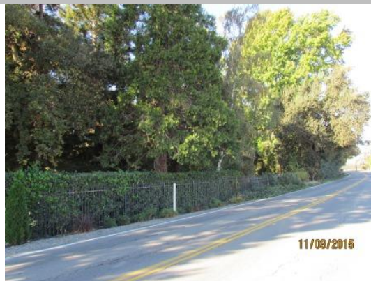
View of the landscaping on the waterside levee slope.