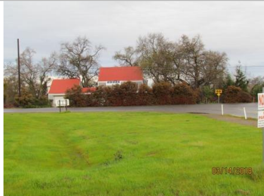
View looking at waterside landscape vegetation that is blocking access and visibility to the levee.