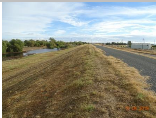
View looking downstream waterside of the well maintained annual vegetation, Fall 2018.