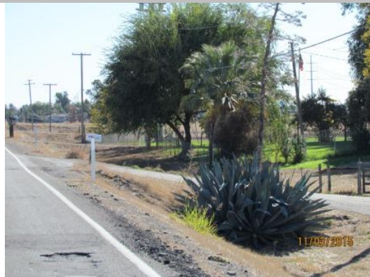
View of the landscaping at the landside levee toe.