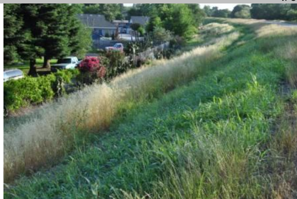
Fence with vegetation at LS toe.