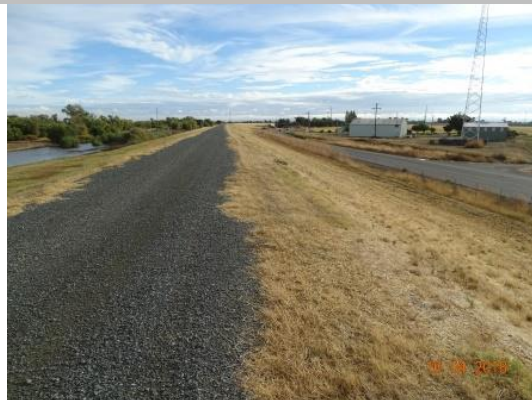
View looking downstream landside of the well maintained annual vegetation, Fall 2018.