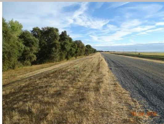
View looking upstream waterside of the well maintained annual Vegetation, Fall 2018.

LS : Land Side N/A : Not Applicable WS : Water Side CR : Crown