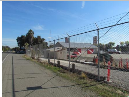
This photo was taken from the crown facing downstream looking down the waterward levee slope at an unacceptable building.

LS : Land Side N/A : Not Applicable WS : Water Side CR : Crown