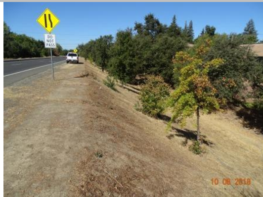
View looking downstream Landside of the well maintained annual Vegetation, Fall 2018.