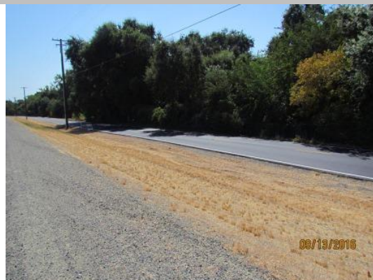
This photo was taken from the crown facing downstream looking down the waterward levee slope at unacceptable landscaping.