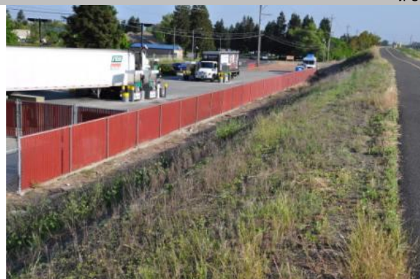
Fence within 10' of L/S toe.