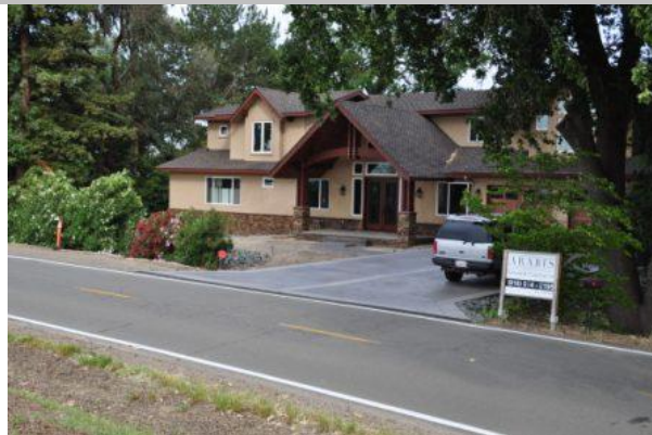
Newly constructed home