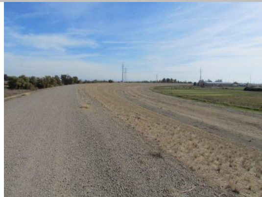
This photo was taken from the crown facing east looking down the landward levee slope at acceptable vegetation maintenance. Fall 2014.

LS : Land Side N/A : Not Applicable WS : Water Side CR : Crown