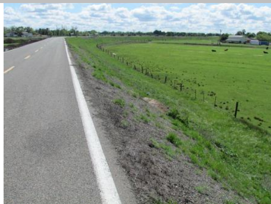
This photo was taken from the crown facing south looking down the landward slope at a rodent hole requiring maintenance. Spring 2014.

LS : Land Side N/A : Not Applicable WS : Water Side CR : Crown