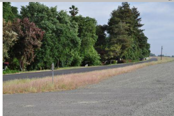
Typical Garden Hwy 'Landscaping'