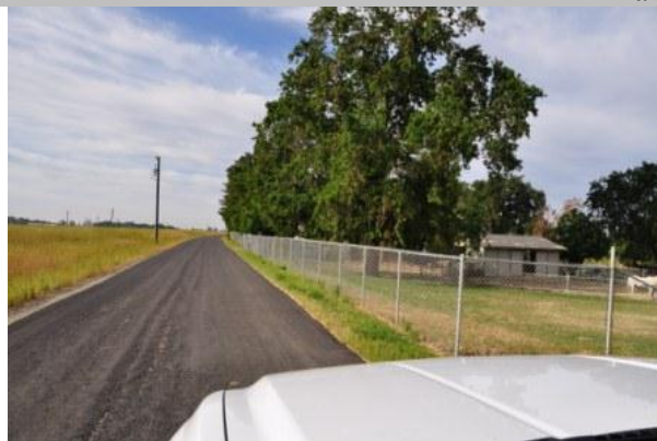
Unauthorized encroachment, 'Fence'