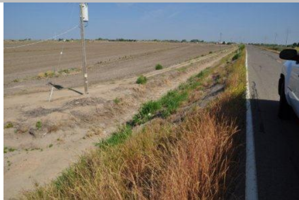
L/S Ag ditch @ L/S toe.