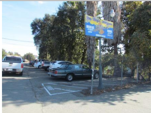
Photo 1 of 1 : FA_2014_RD1000_31_7_20141124_00027.jpg

This photo was taken from the crown facing downstream looking down the waterward levee slope at an unacceptable building. Fall 2014.