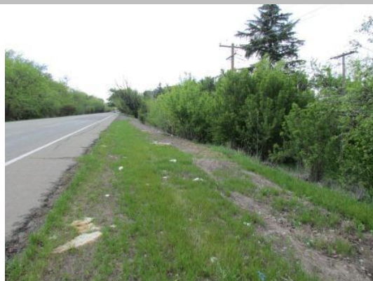
This photo was taken from the crown facing west looking down the landward levee slope at trees requiring maintenance. Spring 2014.