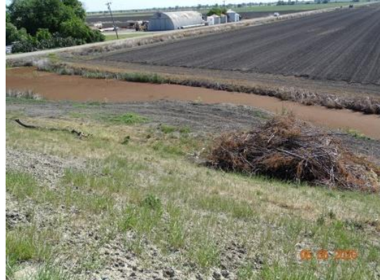
View of prunings at the landside toe. Spring 2020