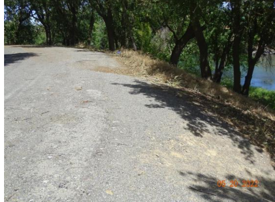
Footpaths on the waterside slope. Spring 2022