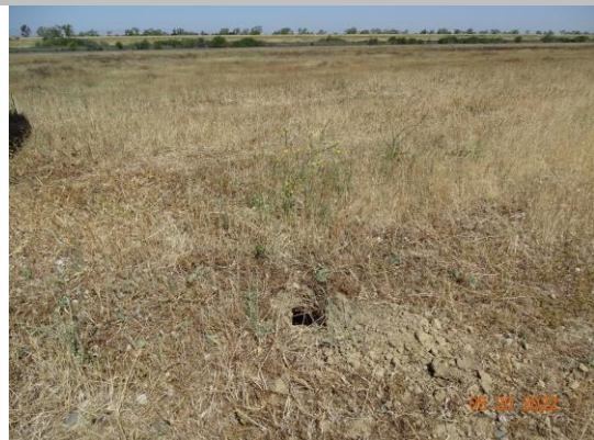
Burrows near the crown on the landside. Spring 2022

* Location LS : Land Side N/A : Not Applicable WS : Water Side CR : Crown