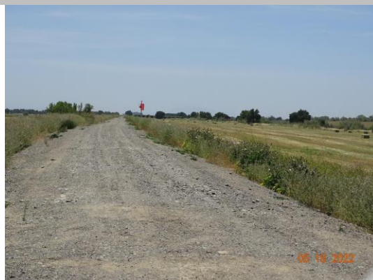
Annual vegetation growth on the waterside slope. Spring 2022