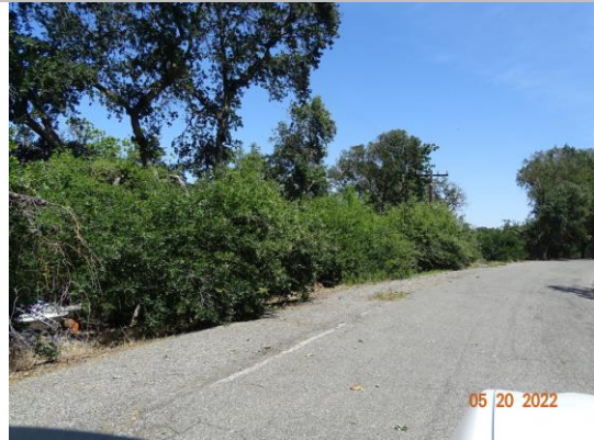
Trees on the landside slope. Spring 2022