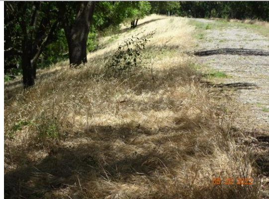
Annual vegetation on the landside slope. Spring 2022