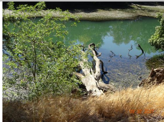
Fallen tree in channel. Fall 2021