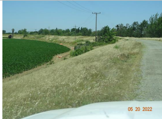
Annual vegetation on the landside slope and toe. Spring 2022