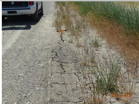
Desiccation cracking on the shoulder. Spring 2022