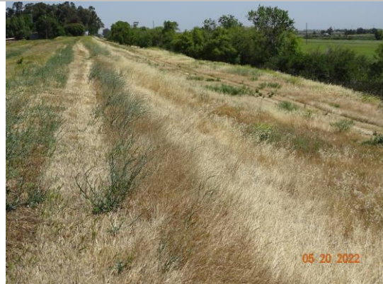
Annual vegetation on the landside slope and toe. Spring 2022