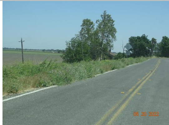
Annual vegetation growth on the landside slope. Spring 2022