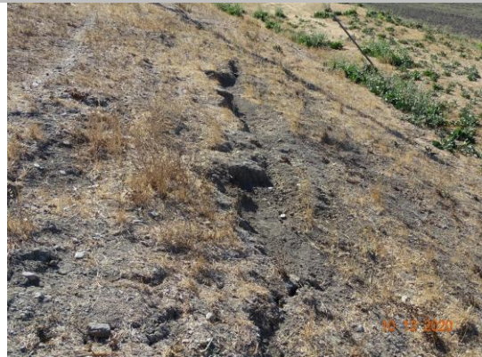
View of soil separation on the waterside slope. Fall 2020