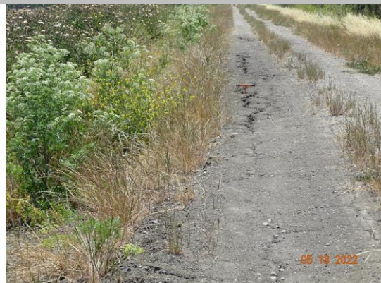
Desiccation cracking on the shoulder. Spring 2022