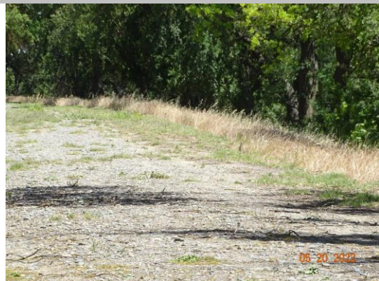
Annual vegetation growth on the waterside slope. Spring 2022