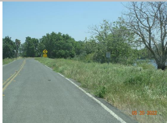
Annual vegetation on the waterside slope. Spring 2022