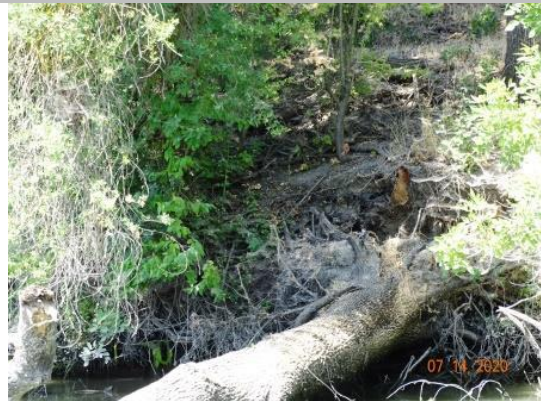
View of scarp around fallen tree. Summer 2020