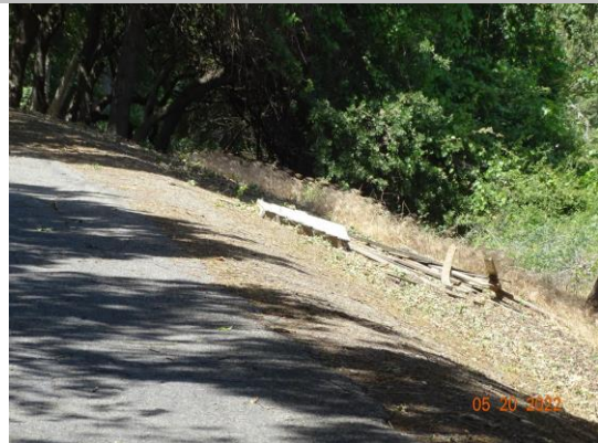
Debris on the waterside shoulder. Spring 2022