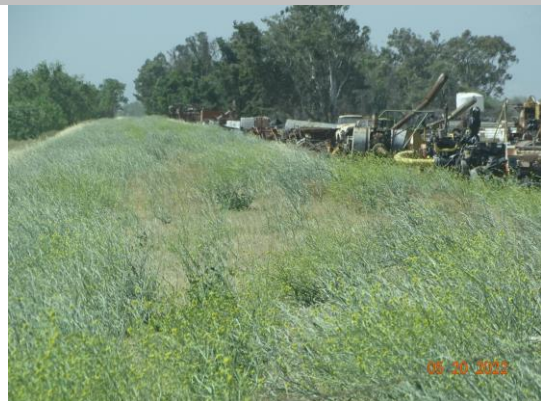
Annual vegetation on the waterside slope. Spring 2022