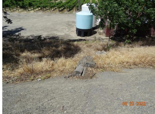
Tree stump and logs on the landside slope. Spring 2022