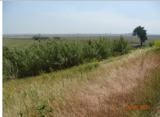
View of Arundo growth at the landside toe. Spring 2020