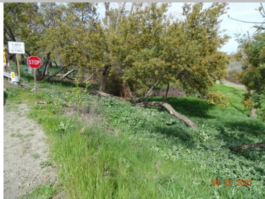
View of the fallen trees on the LS levee slope. Spring 2021.