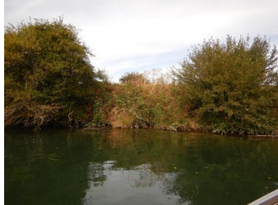
USACE 2018 Erosion Photo #2