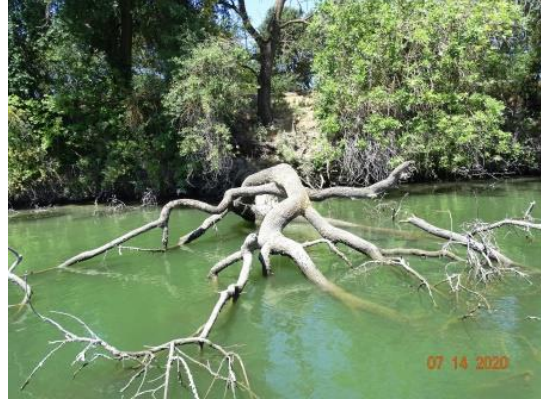
View of large, fallen tree with exposed rootball. Summer 2020