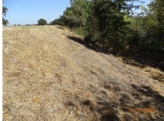
View of slope damage on the waterside slope due to vehicle traffic. Fall 2020