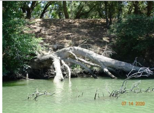
View of slope erosion around fallen tree from the waterside. Summer 2020