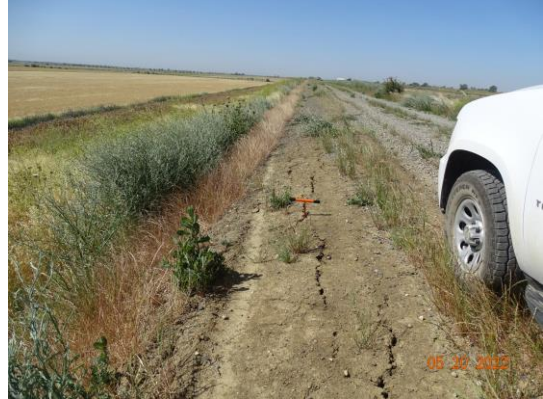
Desiccation cracking on the shoulder. Spring 2022