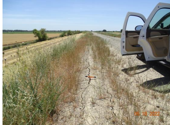
Desiccation cracking on the shoulder. Spring 2022