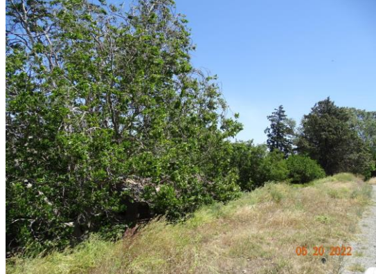
Tree growth on the landside slope and toe. Spring 2022