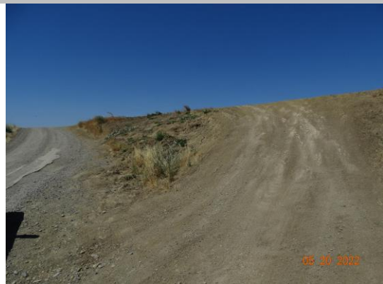
Erosion from vehicle traffic between two ramps. Spring 2022

* Location LS : Land Side N/A : Not Applicable WS : Water Side CR : Crown