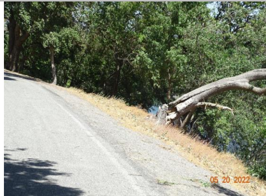
Fallen tree on the waterside slope. Spring 2022