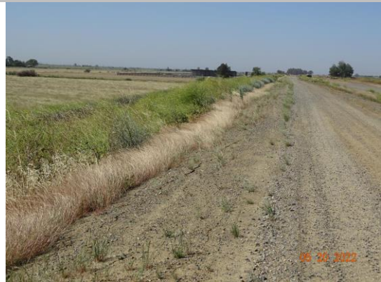
Desiccation cracking on the shoulder. Spring 2022