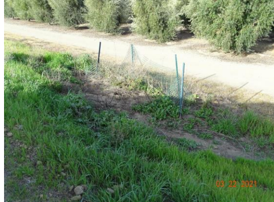
View of the signs of rodent activity. Spring 2021.