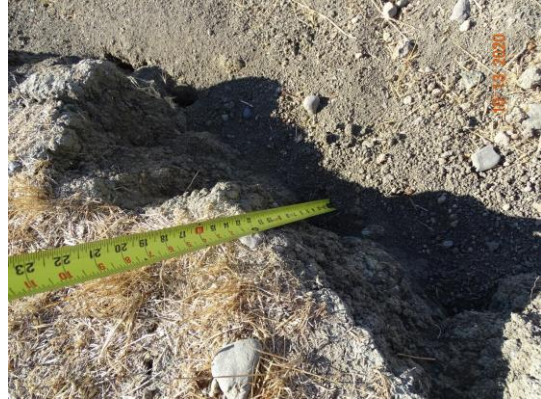
View of soil separation on the waterside slope. Fall 2020