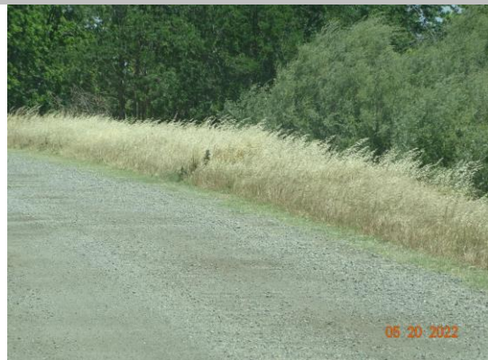
Annual vegetation growth on the waterside slope. Spring 2022