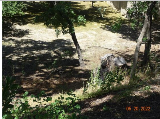
Tree stump at the landside toe. Spring 2022