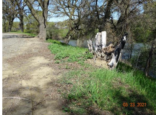
View of the tree stump on the WS levee slope. Spring 2021.