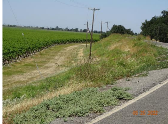
Annual vegetation on the landside slope. Spring 2022