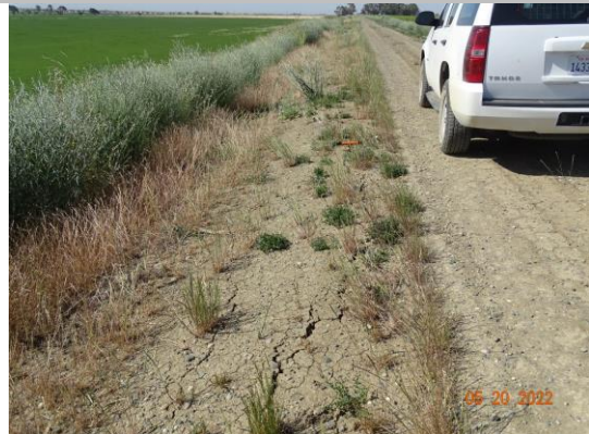
Desiccation cracking on the shoulder. Spring 2022