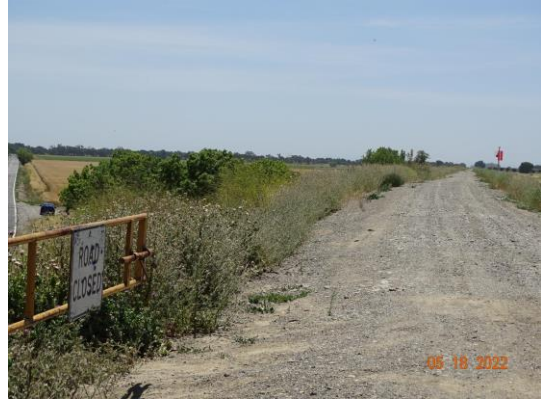
Annual vegetation on the landsides slope. Spring 2022