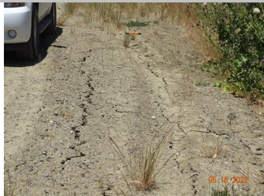
Desiccation cracking on the shoulder. Spring 2022