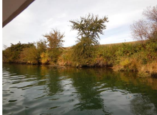
USACE 2018 Erosion Photo #2