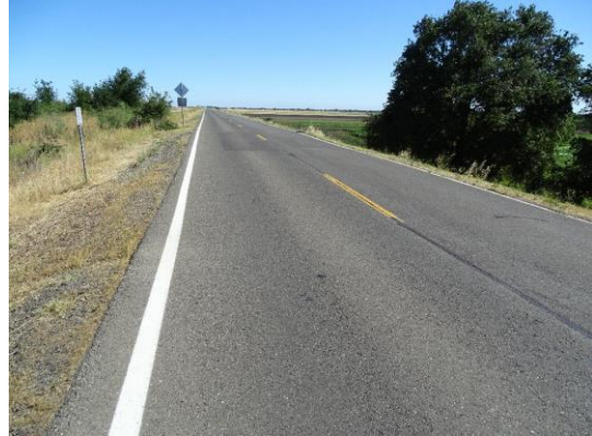
Top of Levee: view of crown.