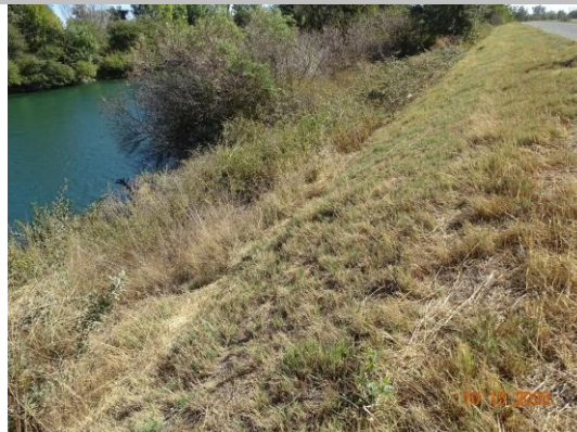
View of waterside slope at LM 0.59 looking downstream. Fall 2020