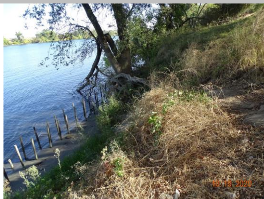
View of a split tree and bank erosion near LM 0.11. Fall 2020

LS : Land Side N/A : Not Applicable WS : Water Side CR : Crown