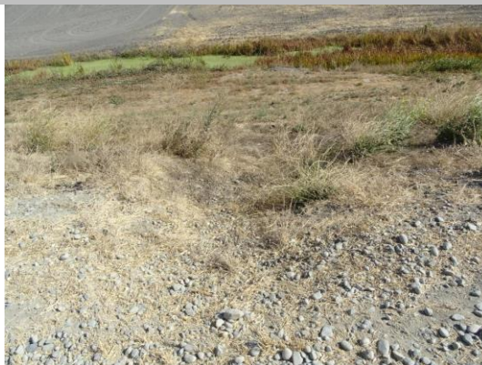
View of caving on landward slope. Fall 2018