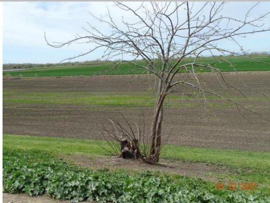
View of the tree and stump at the WS levee toe. Spring 2021.

LS : Land Side N/A : Not Applicable WS : Water Side CR : Crown