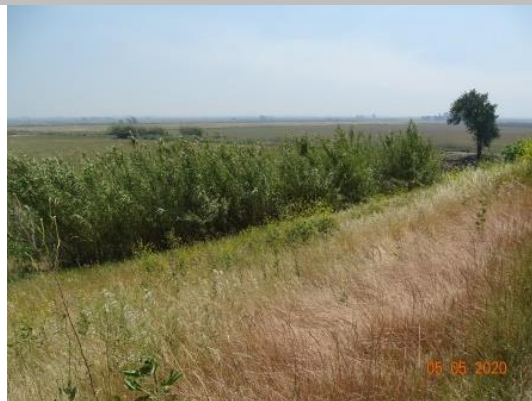
View of Arundo growth at the landside toe. Spring 2020

* Location LS : Land Side N/A : Not Applicable WS : Water Side CR : Crown