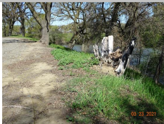
View of the tree stump on the WS levee slope. Spring 2021.

* Location LS : Land Side N/A : Not Applicable WS : Water Side CR : Crown