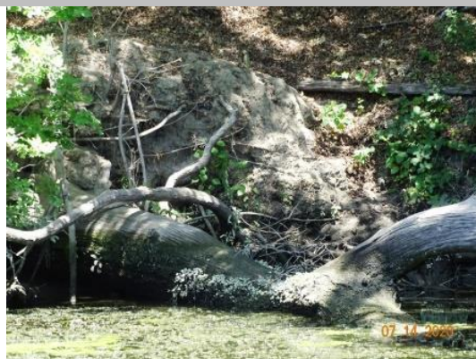
View of slope damage near fallen tree. Summer 2020

Photo 1 of 1 : SP_2021_RD0999_236_99_20210308_00037.jpg