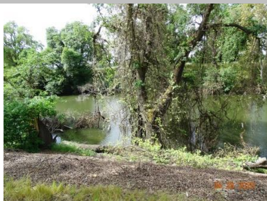
View of fallen tree on the waterside slope. Spring 2020