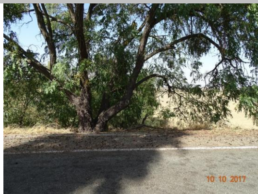
View of trees on landside slope looking north. Fall 2017