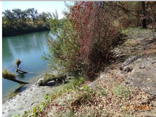
View of a large scarp on the waterside berm. Fall 2020