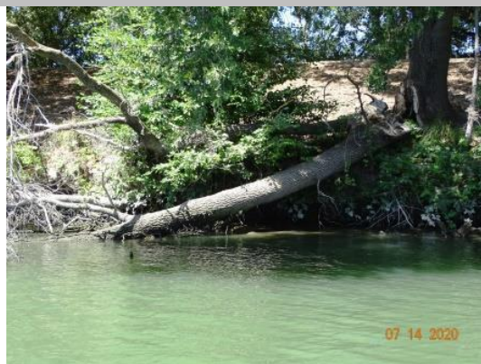
View of a split tree on the waterside bank. Summer 2020