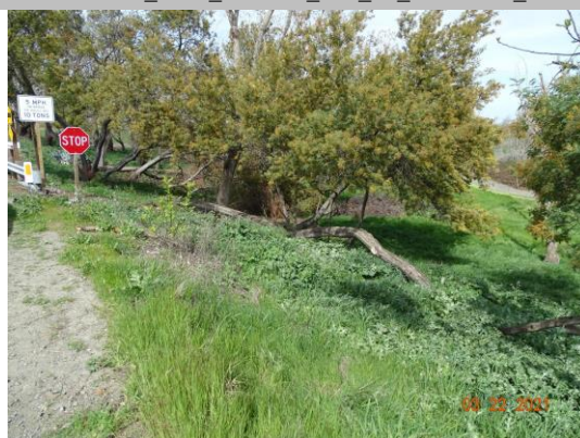
View of the fallen trees on the LS levee slope. Spring 2021.