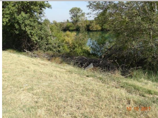
View of waterside slope looking east. Fall 2017