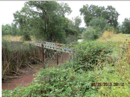
Pump platform visible off LS toe, but no appurtenances remain.