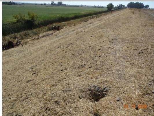
View of large animal holes on the landside slope. Fall 2020