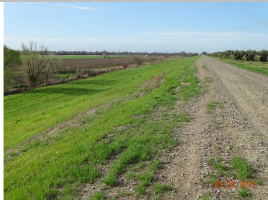
View of the depression on the LS levee slope. Spring 2021.