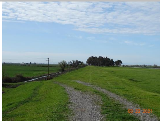
View of the grassy crown. Spring 2021.