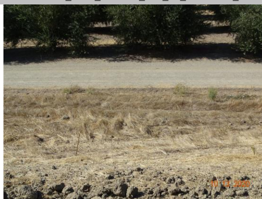
View of animal holes at the waterside toe. Fall 2020