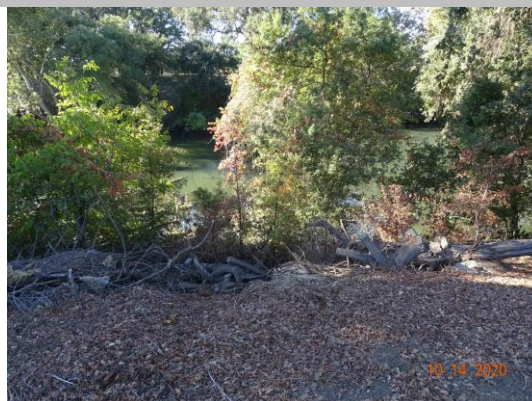
View of tree logs and limbs on the waterside slope. Fall 2020