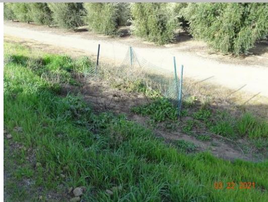
View of the signs of rodent activity. Spring 2021.

* Location LS : Land Side N/A : Not Applicable WS : Water Side CR : Crown