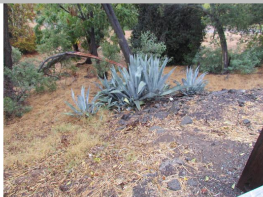
Looking north at century plant at landward toe. Fall 2015.