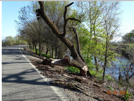
View of the fallen tree on the WS levee slope. Spring 2021.