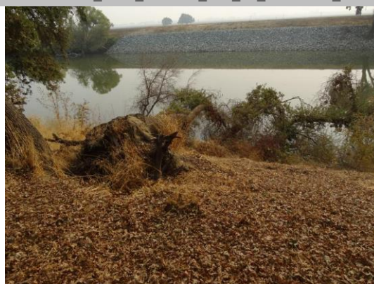
View of dead tree on slope. Fall 2018