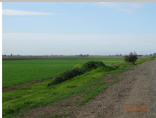
View of the bull thistle on the LS levee slope. Spring 2021.