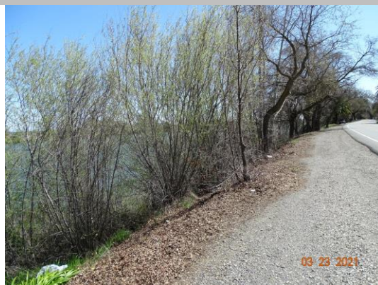
View of the trees on the WS levee slope. Spring 2021.