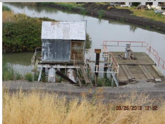
Pumphouse on LS toe.