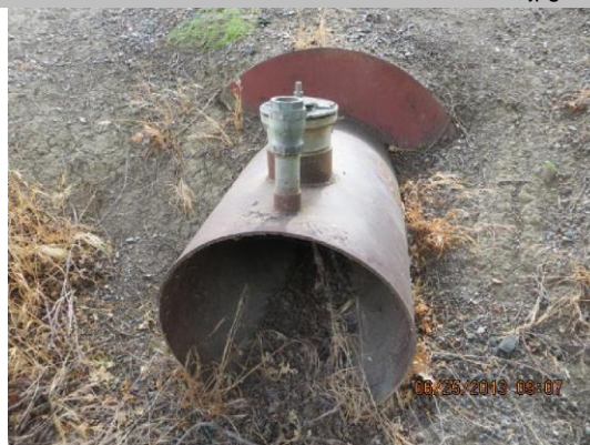
Pipe open on WS slope