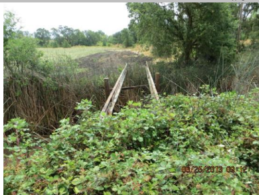
Pump platform visible off LS toe, but no appurtenances remain.