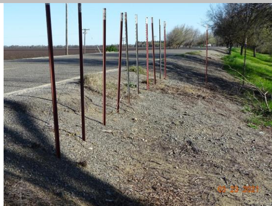
View of the sloughing and fence posts below the WS levee shoulder. Spring 2021.

* Location LS : Land Side N/A : Not Applicable WS : Water Side CR : Crown