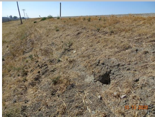
View of a large animal hole on the landside slope. Fall 2020