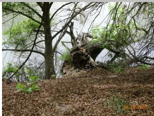
View of a fallen tree on the waterside slope. Spring 2020