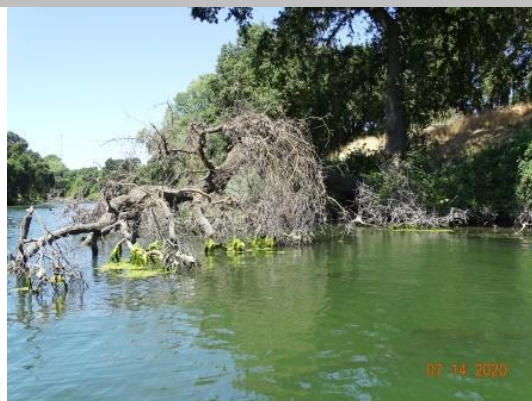
View of fallen tree split at the base. Summer 2020