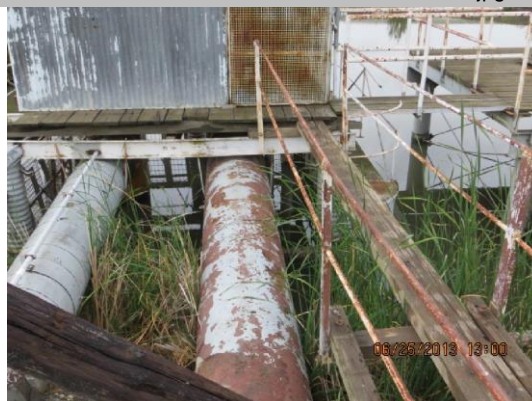
Closeup of pipe at pumphouse on LS toe.