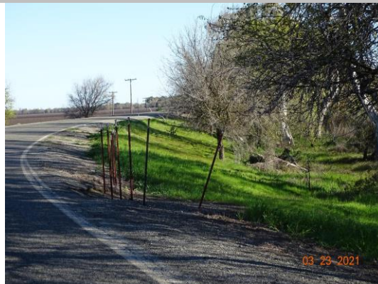
View of the sloughing and fence posts below the WS levee shoulder. Spring 2021.