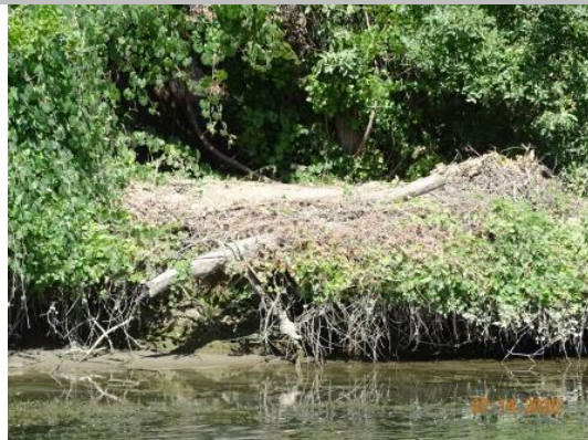
View of scarp with vegetation growth. Summer 2020