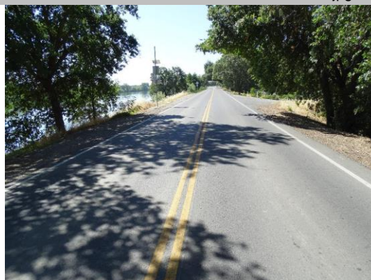
Top of Levee: view of crown.