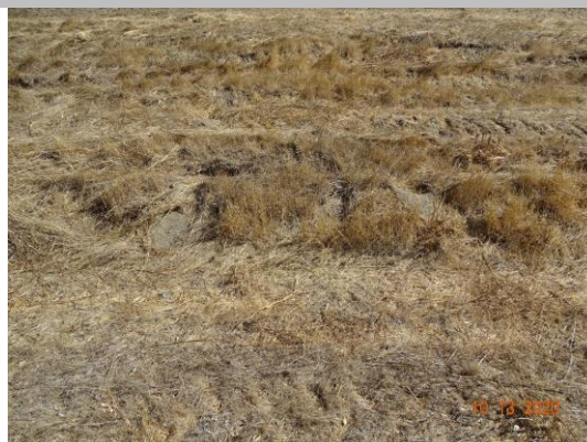
View of animal holes at the waterside toe. Fall 2020