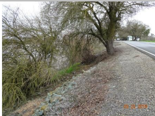
View looking downstream at low-hanging tree branches on levee slope. Spring 2019

* Location LS : Land Side N/A : Not Applicable WS : Water Side CR : Crown