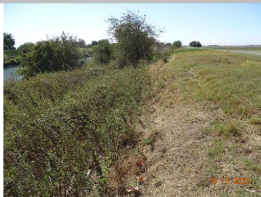
View of the waterside slope near LM 1.10. The short slope is consistent to at least LM1.00. Fall 2020