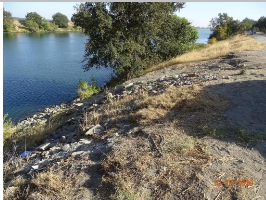
View of erosion on the waterside slope with broken concrete riprap. Fall 2020