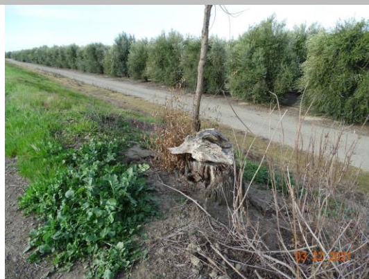
View of the tree stump on the WS levee slope. Spring 2021.