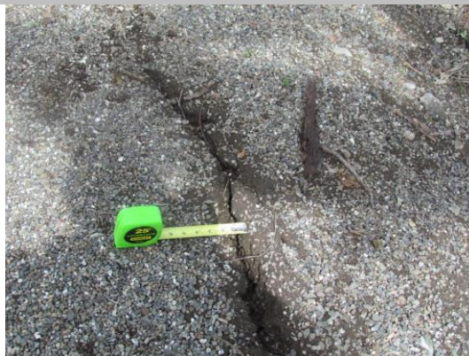
Looking at two inch plus crack on waterward shoulder.