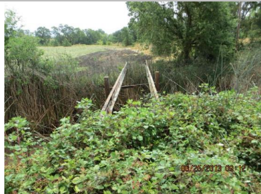
Pump platform visible off LS toe, but no appurtances remain.