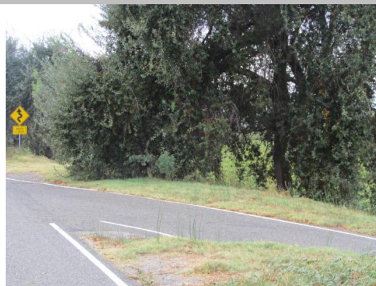
Looking at untrimmed trees on landward slope and toe. (Spring 2016)