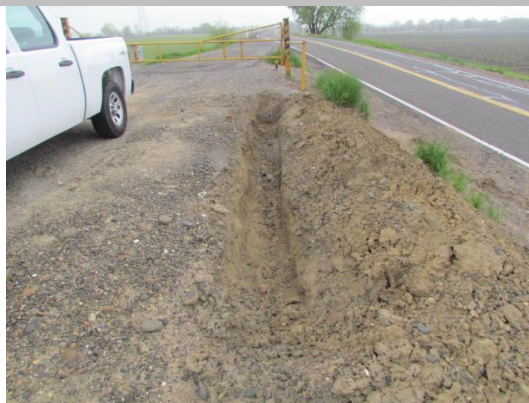
Looking north at excavation on landside shoulder.