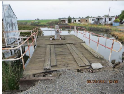
Pump and platform on LS toe.