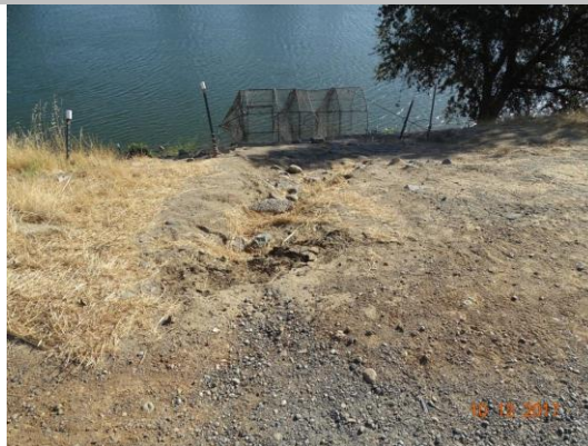
Looking east at the waterside slope.