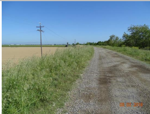
Vegetation landside looking north.