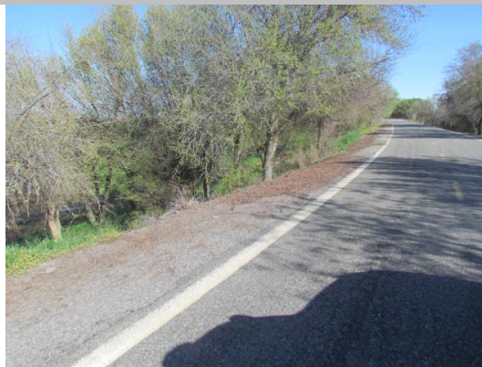
Looking northwest at dense vegetation on landward slope. (Spring 2016)