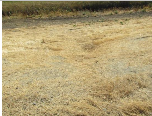
Looking northeast at depression on landward slope.