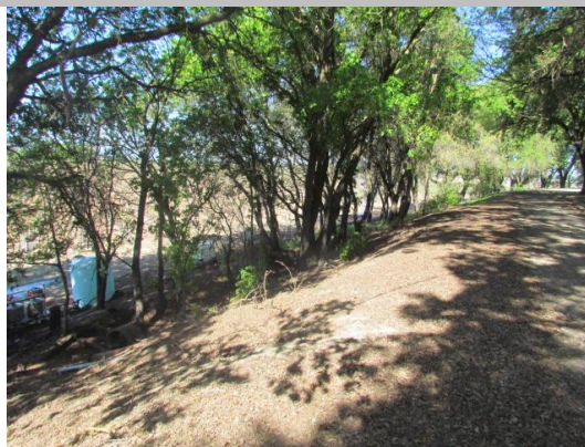
Looking north at dense trees on landward slope. (Spring 2015)