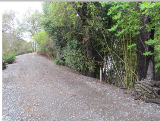
Looking northeast at dense vegetation on waterside slope.