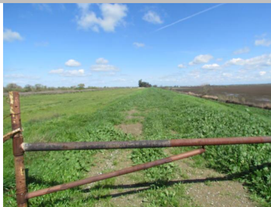
Looking north at growth on levee crown.