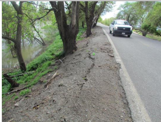
Looking downstream at crack along waterward shoulder.