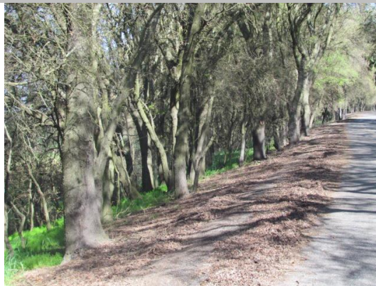
Looking east at dense trees on landward slope.