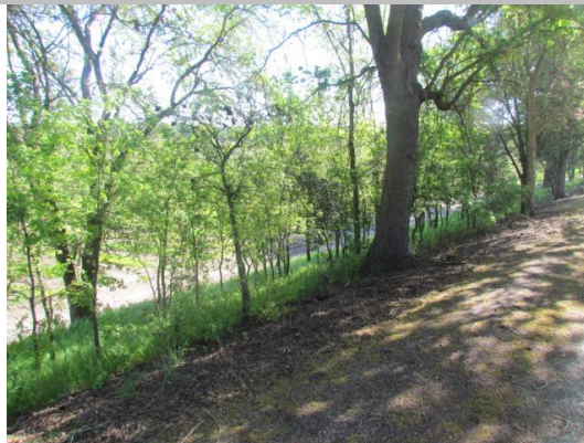
Looking west at dense trees on landward slope. (Spring 2015)