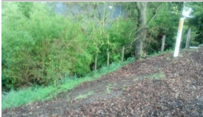
Looking at dense trees on landside slope and toe.