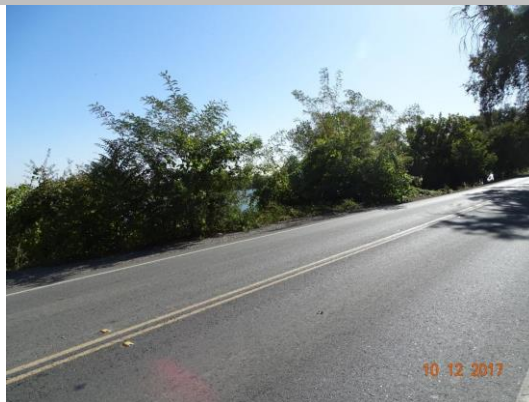
Looking southeast at the waterside slope.