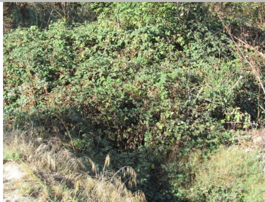
Looking at dense vines at landward toe. Fall 2015.