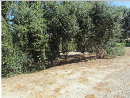
Looking west at untrimmed trees on landward toe.