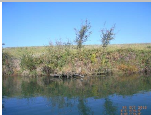
USACE 2013 Photo #1