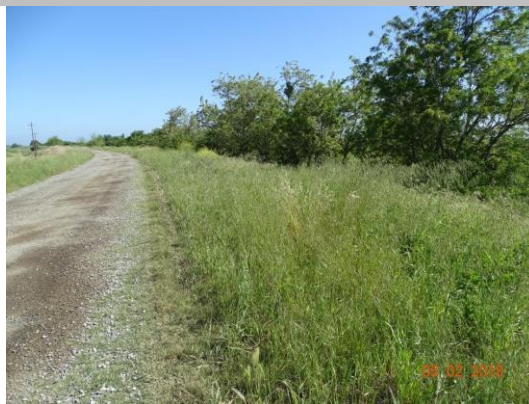
Vegetation waterside looking north.