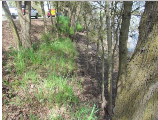
Looking upstream at 2ft plus vertical erosion on waterward slope.