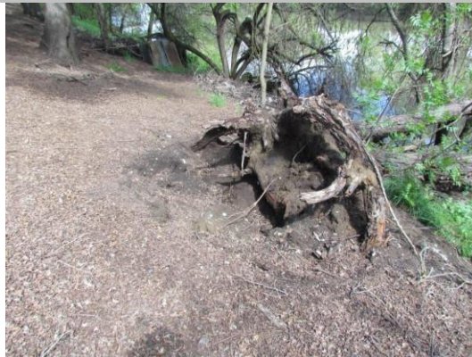
Looking east at fallen tree on waterward slope.