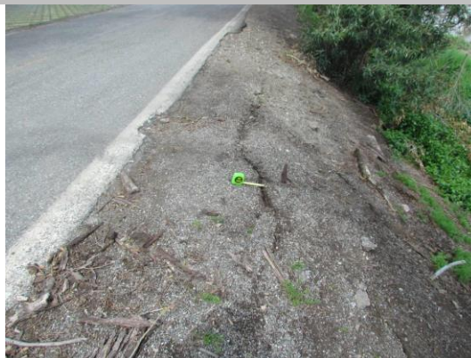
Looking upstream at cracking along waterward shoulder.