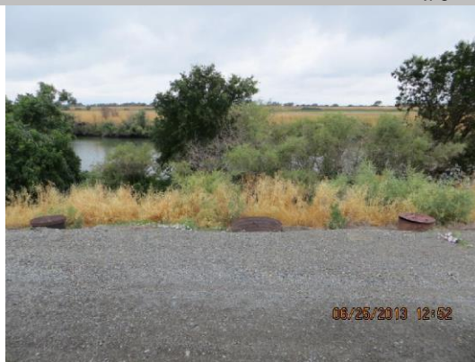
siphon breaker in steel riser on WS shoulder