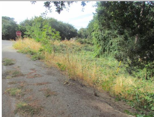
Looking southwest at dense vegetation on landward slope and toe. (Fall 2016)