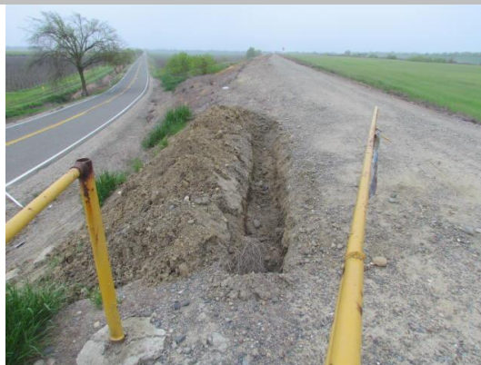
Looking south at excavation on landside shoulder.