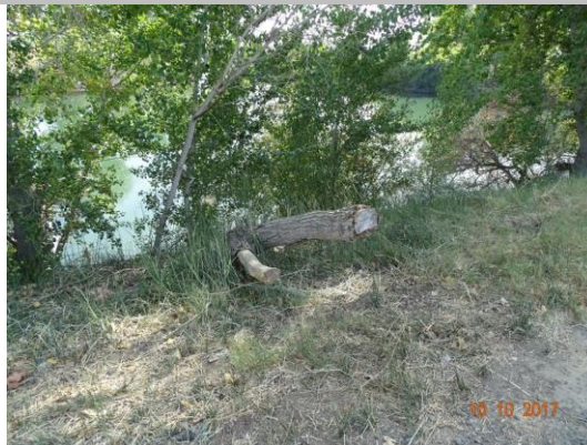
View of waterside slope looking east.