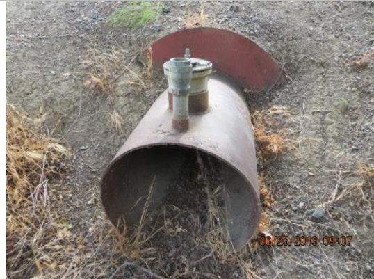
Pipe open on WS slope