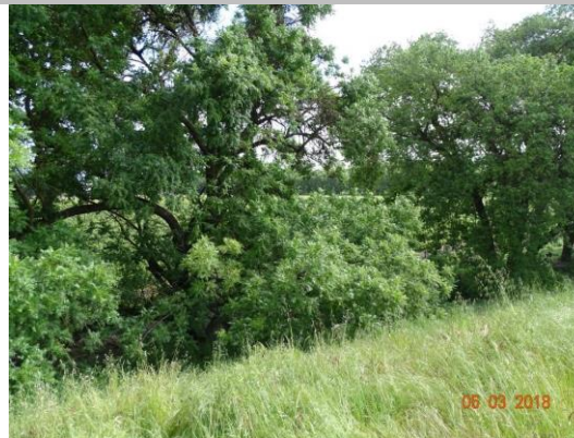
Trim thin trees landside looking north.