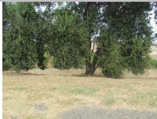
Looking at untrimmed trees on landward slope and toe. (Fall 2016)