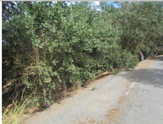
Looking west at untrimmed trees on landward slope and toe.