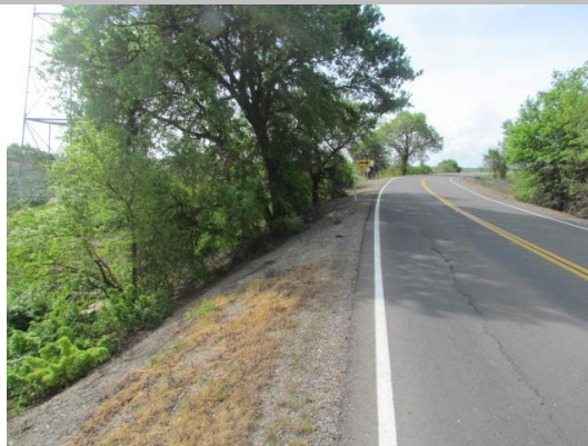
Looking southeast at untrimmed trees on landward slope. (Spring 2016)