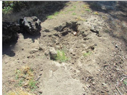
Looking at hole from falling tree on waterward shoulder. (Fall 2016)