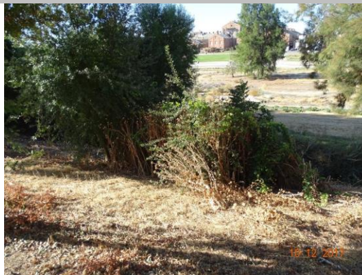
Looking west at the landside slope.

Photo 1 of 1 : SP_2018_RD0999_235_50_20180301_00041.jpg