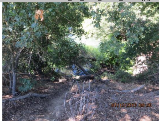
Toe of LS at approximate location of outlet/inlet.