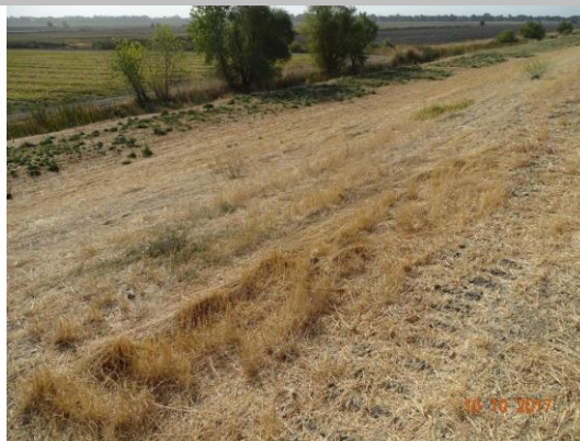
View of landside slope looking south.