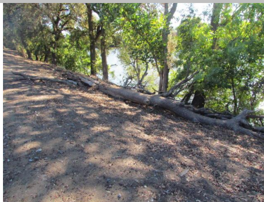
Looking at downed tree branch on waterward slope.