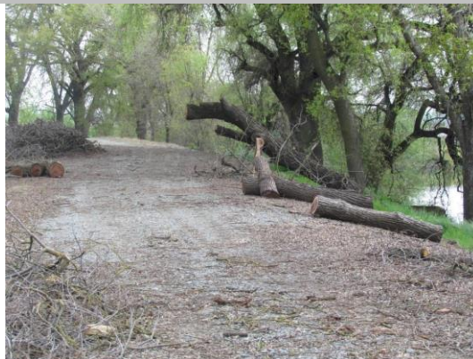
Looking east at tree branches and limbs on waterward and landward shoulder and slope.