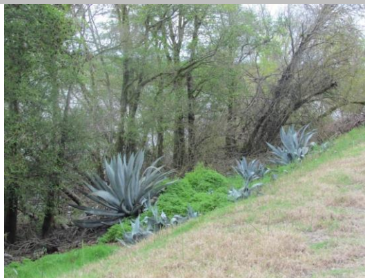
Looking east at century plants on waterward slope.