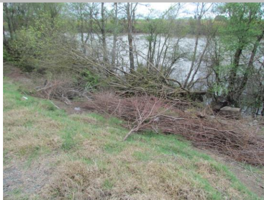
Looking east large pruning piles on waterward slope.