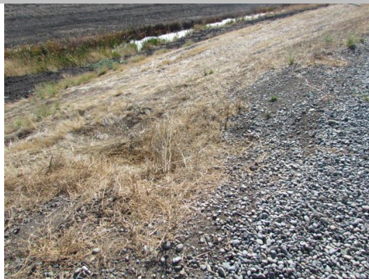
Looking southeast at caving on landward slope fall 2015.