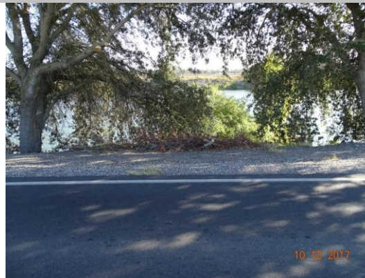
Looking east at the waterside slope.