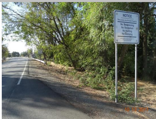
Looking south at dense trees on landside slope.