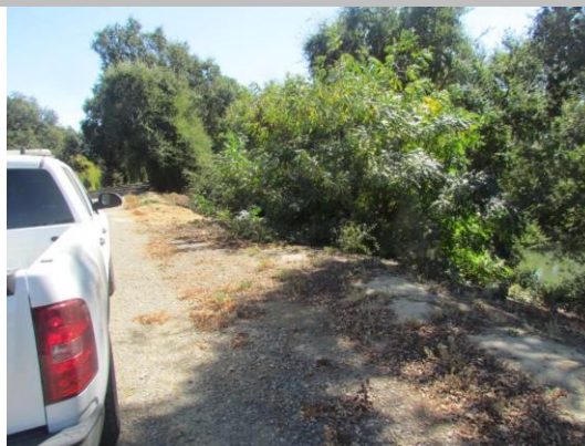
Looking northeast at untrimmed trees on watward slope.