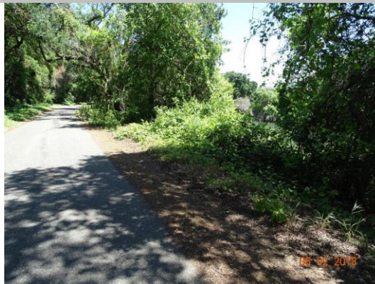
Vegetation waterside looking north.