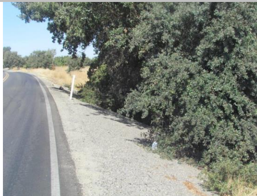
Looking north at untrimmed trees on landward slope. ( Fall 2016)

* Location LS : Land Side N/A : Not Applicable WS : Water Side CR : Crown