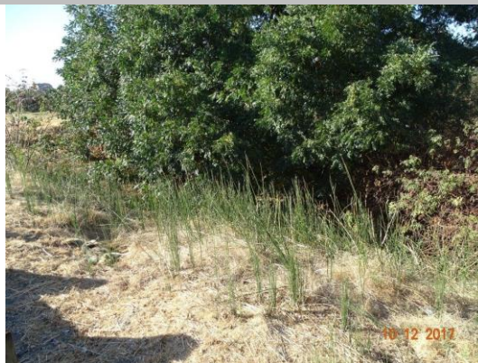
Looking south at the dense vegetation on the landside slope.

LS : Land Side N/A : Not Applicable WS : Water Side CR : Crown