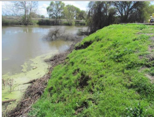
Looking downstream at finger erosion on downstream side of slough.