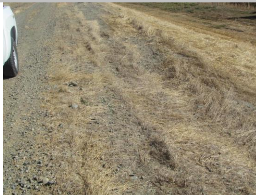
Looking northeast at depression on landward slope. (Fall 2016)