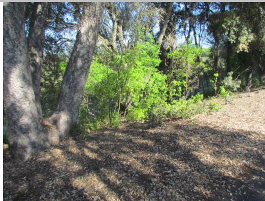
Looking northwest at dense trees on landward slope. (Spring 2015)

* Location LS : Land Side N/A : Not Applicable WS : Water Side CR : Crown