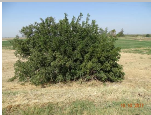
View of landside slope looking north.