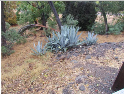
Looking north at century plant at landward toe fall 2015.