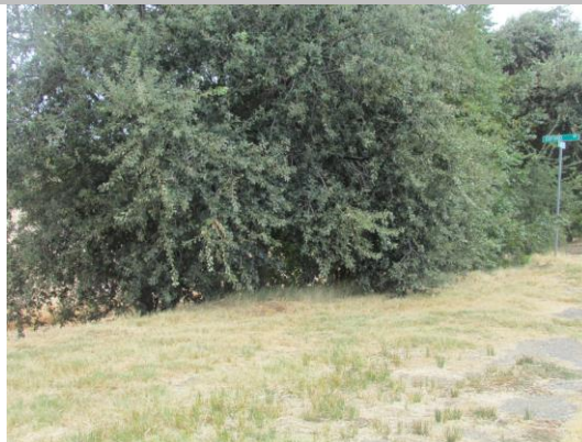
Looking east at untrimmed trees on landward slope.