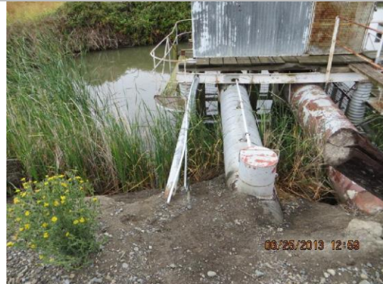
Closeup of 24-inch pipe on LS toe.