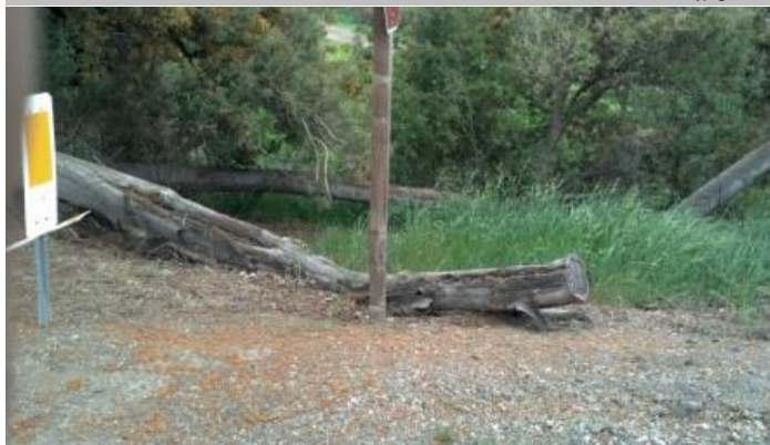
Looking northwest at tree limb on landside slope.

LS : Land Side N/A : Not Applicable WS : Water Side CR : Crown