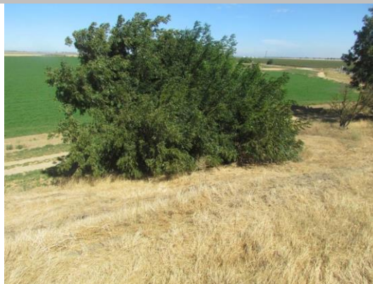
Looking at untrimmed tree on landward slope and toe. (Fall 2016)