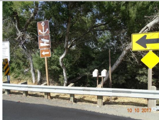
View of landside slope looking north.