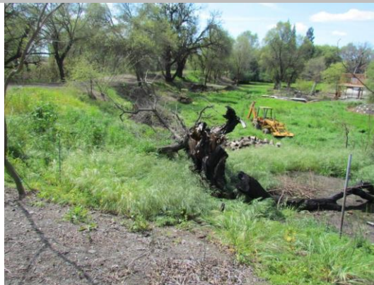
Looking west at fallen tree on landward slope.