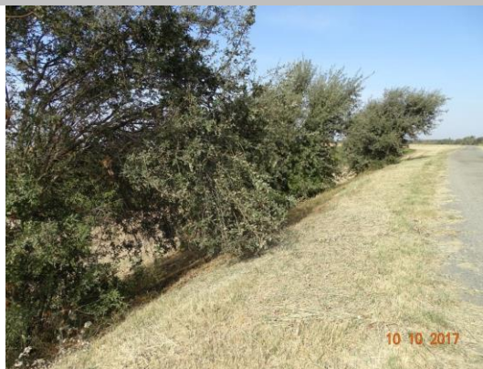
View of landside slope looking northeast.