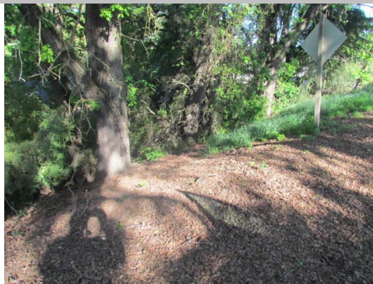
Looking northwest at untrimmed trees on landward slope. (Spring 2015)