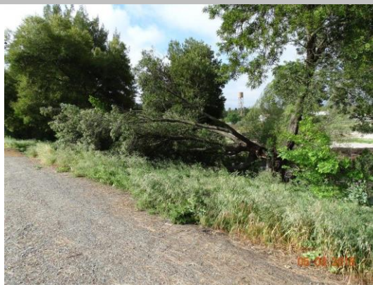
Downed tree landside looking southwest.