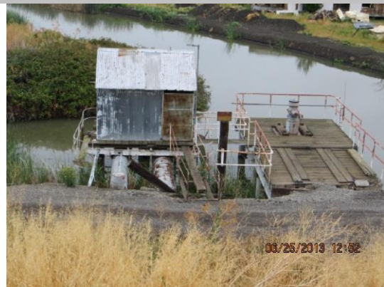
Pumphouse on LS toe.