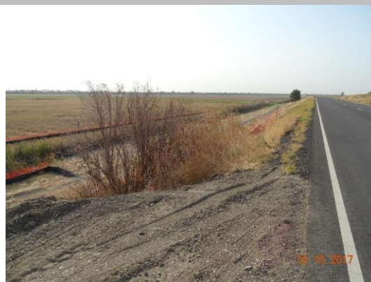
View of landside slope looking south.