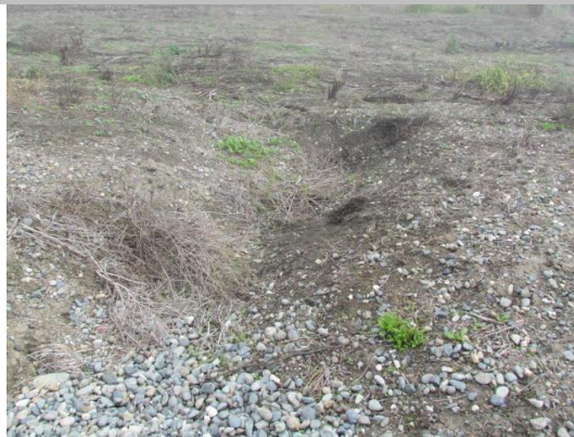
Looking east caving on landside slope.