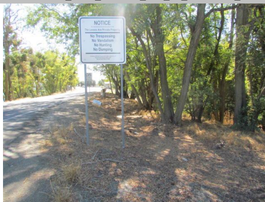
Looking south at dense trees on landward slope.