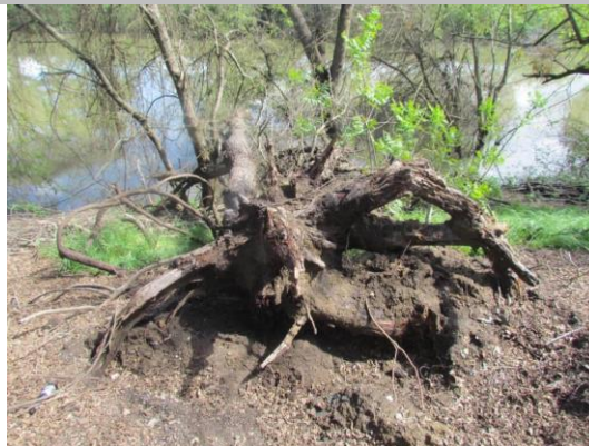
Looking downstream at fallen tree on waterward slope.