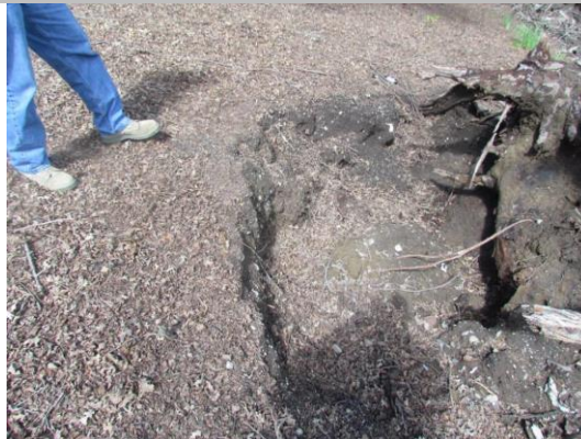
Looking at hole left by fallen tree on waterward slope.