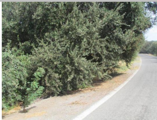
Looking northwest at dense vegetation on landward slope. (Fall 2016)