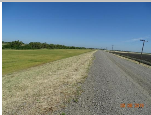
Good vegetation control waterside looking north.

* Location LS : Land Side N/A : Not Applicable WS : Water Side CR : Crown