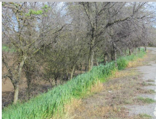
Looking northwest at untrimmed trees on landward slope. (Spring 2016)