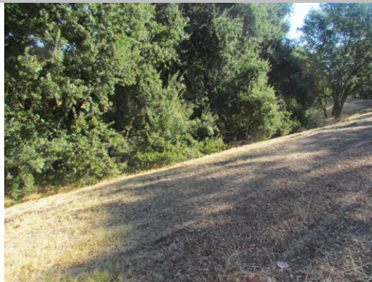
Looking northwest at untrimmed trees on landward toe. (Fall 2016)