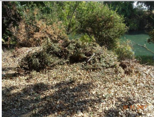
Looking southeast at the waterside slope.