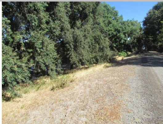
Looking northwest at untrimmed trees on landward slope and toe.

* Location LS : Land Side N/A : Not Applicable WS : Water Side CR : Crown