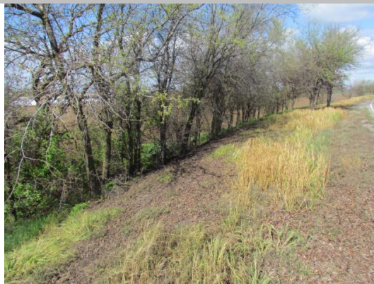
Looking northwest at dense vegetation on landward slope and toe. (Spring 2016)