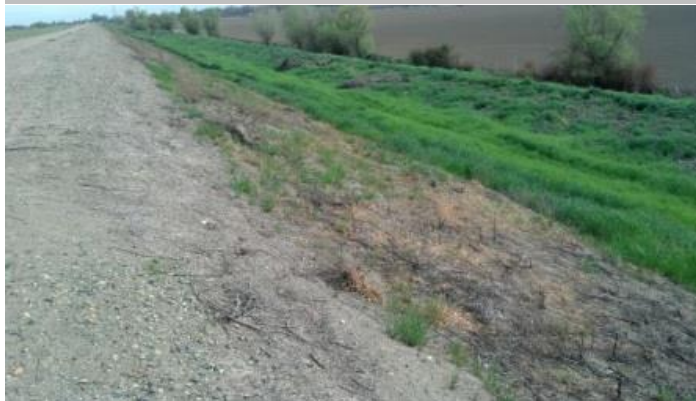
Looking north at depression on landside shoulder and slope. (Spring 2016)