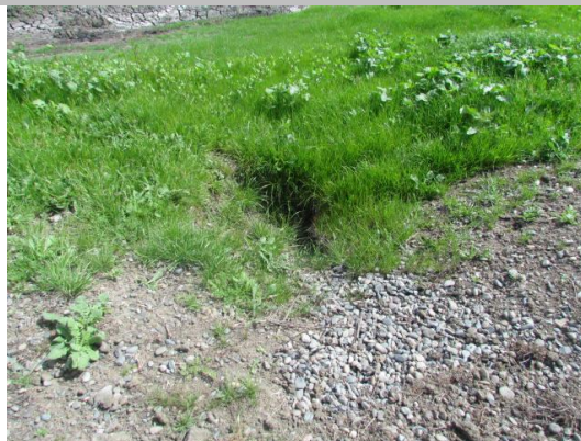
Looking east at caving on landward shoulder and slope. (Spring 2015)