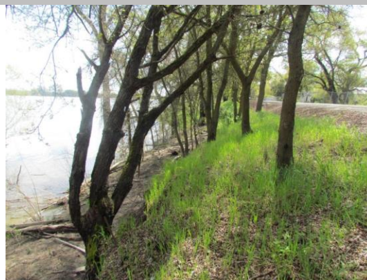
Looking downstream at 2ft plus vertical erosion on waterward slope.