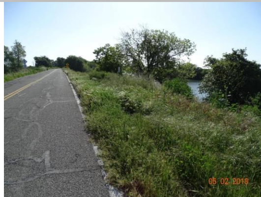
Vegetation waterside looking east.