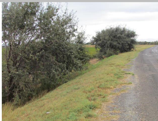
Looking at untrimmed trees on landward slope and toe.