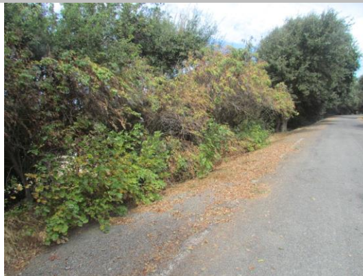
Looking northwest at dense vegetation on landward slope.