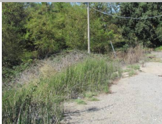
Looking north at dense vegetation on landside slope near ramp.