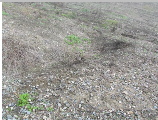
Looking southeast at caving on landside slope.