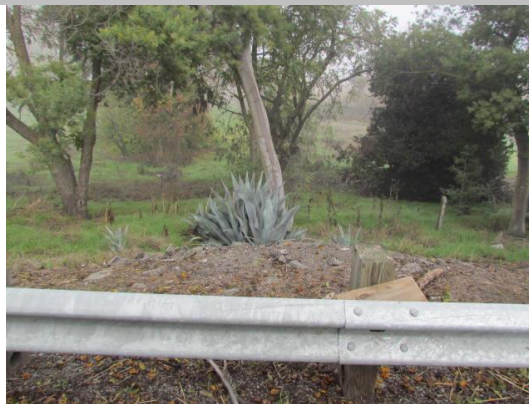
Looking north at century plant at landside toe.