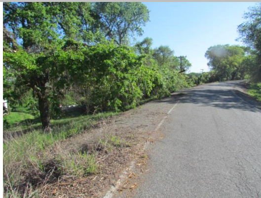
Looking north at untrimmed trees on landward slope and toe.