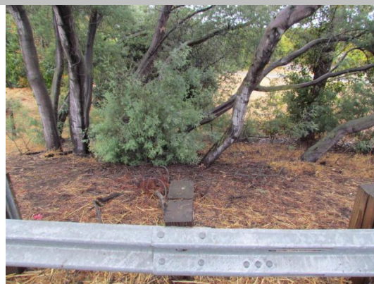
Looking north at untrimmed trees to be thinned at landward toe fall 2015.