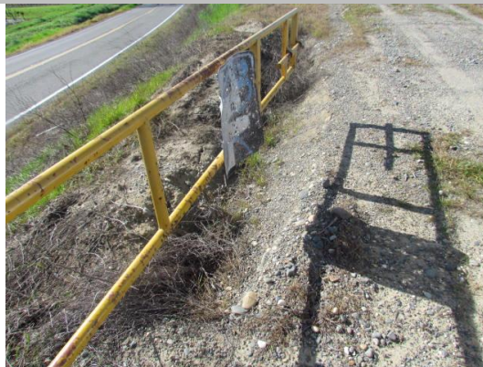
Looking south at trench along landward shoulder. (spring 2016)