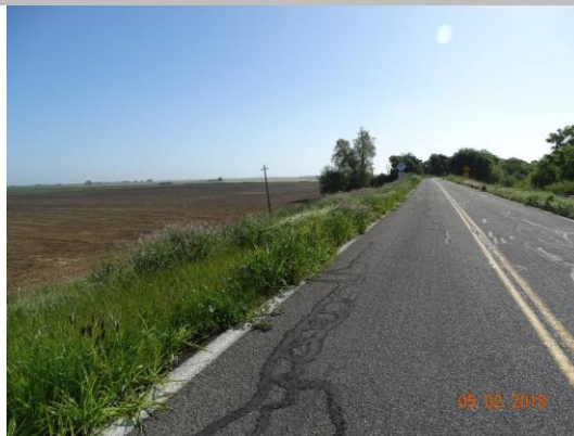
Vegetation landside looking east.