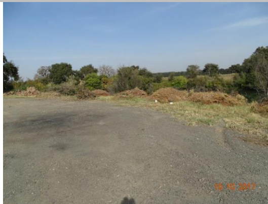
View of waterside slope looking east.