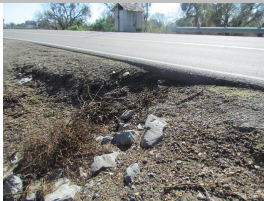
Looking west at foot erosion on waterward shoulder and slope.