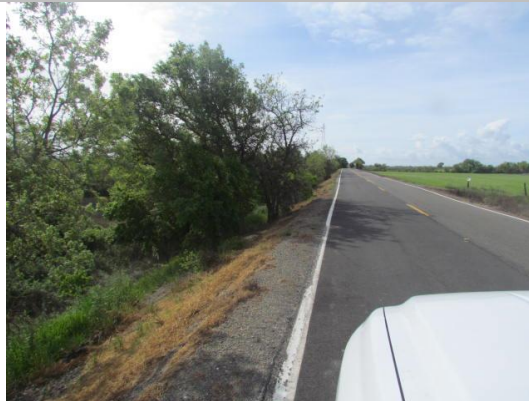
Looking southeast at dense trees on landward slope. (Spring 2016)