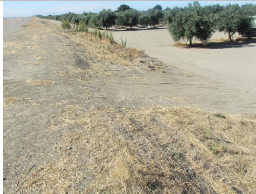
Looking at slope damage cause by vehicle traffic on waterward slope. (Fall 2016)