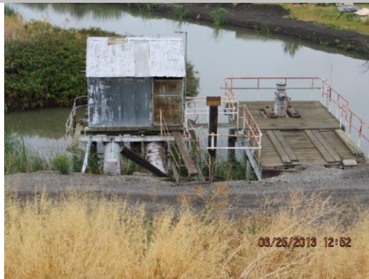
Pump in pumphouse on LS toe.