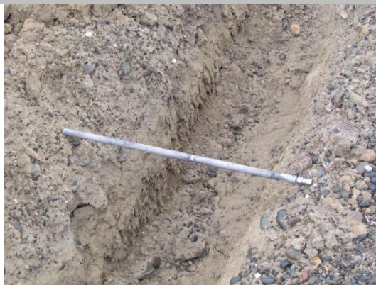
Looking south at close-up view of excavation on landside shoulder.