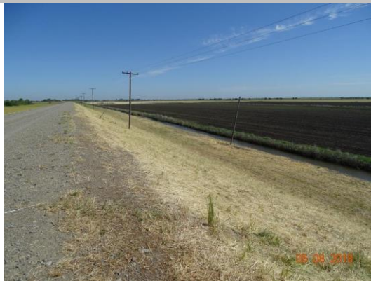
Good vegetation control landside looking north.