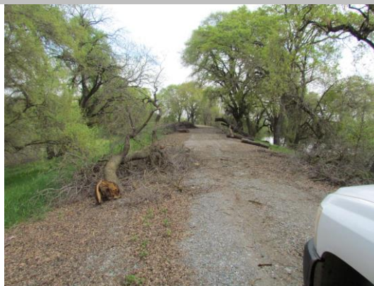
Looking east at fallen tree and pruning on landward and waterward shoulder and slope.

* Location LS : Land Side N/A : Not Applicable WS : Water Side CR : Crown