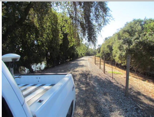
Looking at the tree overhanging the levee crown.

* Location LS : Land Side N/A : Not Applicable WS : Water Side CR : Crown