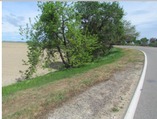
Looking north at untrimmed trees on landward toe. (Spring 2015)