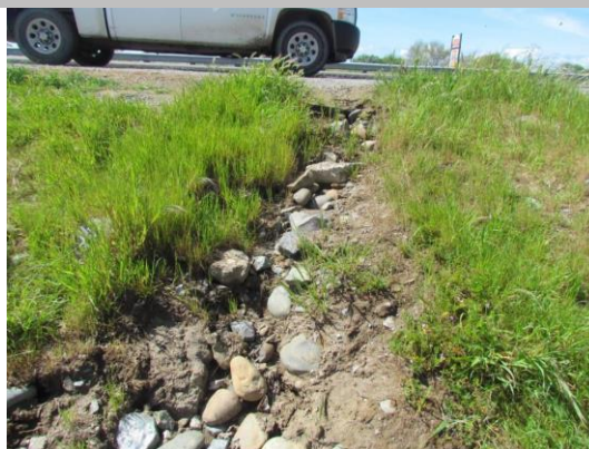
Looking west at runoff erosion on waterward slope.