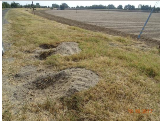
View of landside slope looking southwest.