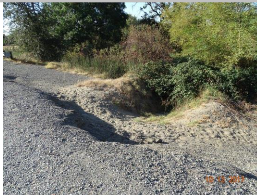
Looking southwest at the landside slope.

* Location LS : Land Side N/A : Not Applicable WS : Water Side CR : Crown