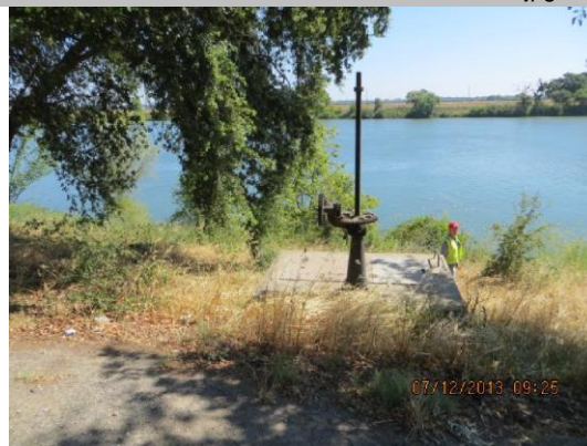
Slide gate in concrete vault on WS shoulder.