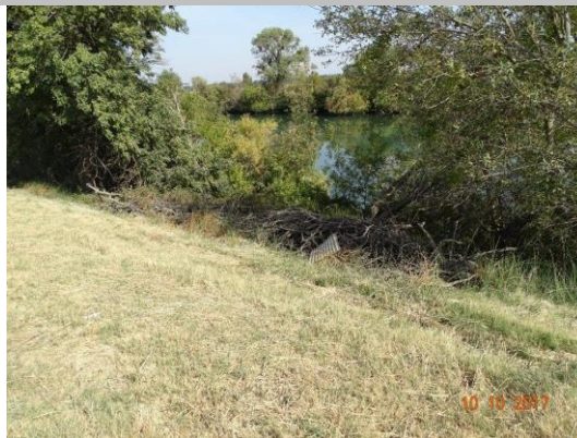
View of waterside slope looking east.