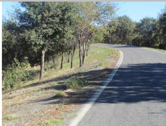
Looking north at trimmed trees on landward slope.