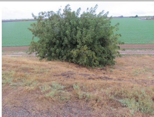
Looking at untrimmed tree on landward slope. (Spring 2016)