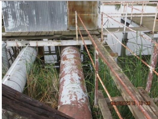
Closeup of pipe at pump house on LS toe.