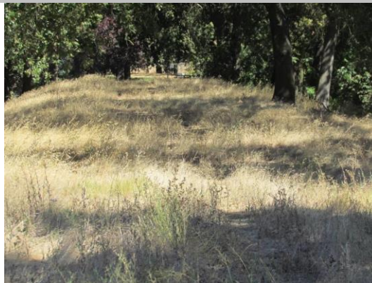
Looking east at overgrowth on levee crown.