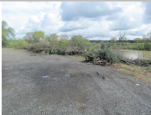
Looking east at several large pruning piles on waterward slope.