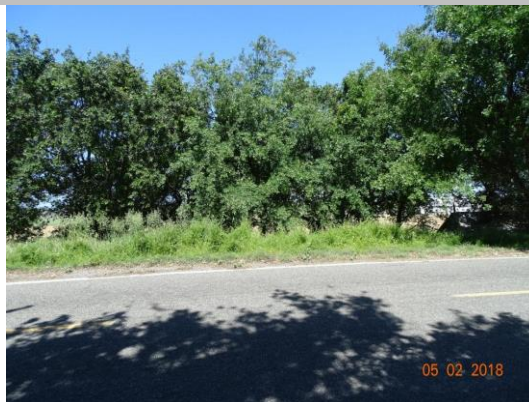
Trim thin trees landside looking west.