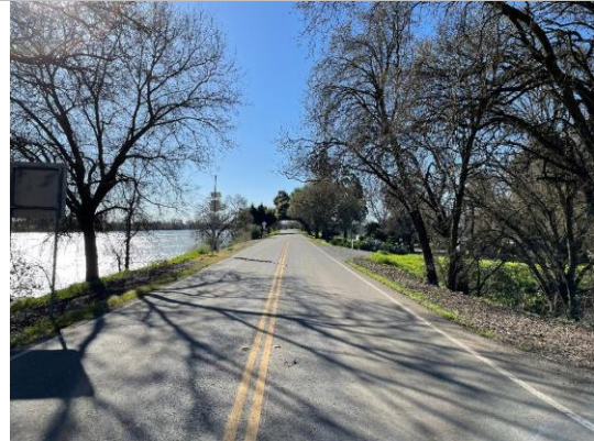
Overview of levee crown looking D/S.