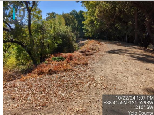
Prunings on the WS shoulder. Fall 2024