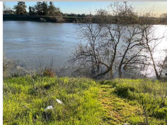
WS view: overview of WS.