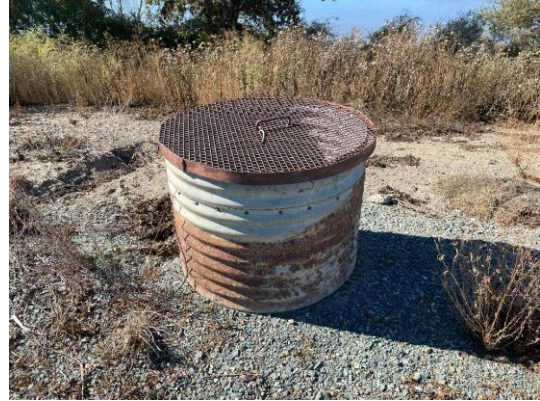
WS view: CMP riser with siphon breaker inside.