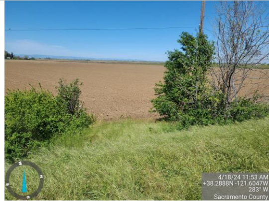
Trees on the LS slope. Spring 2024