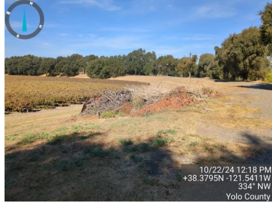
Pruning pile on the LS slope. Fall 2024