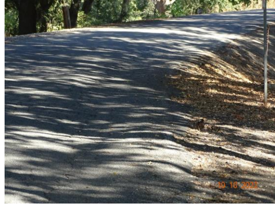
Crown depression. Fall 2022