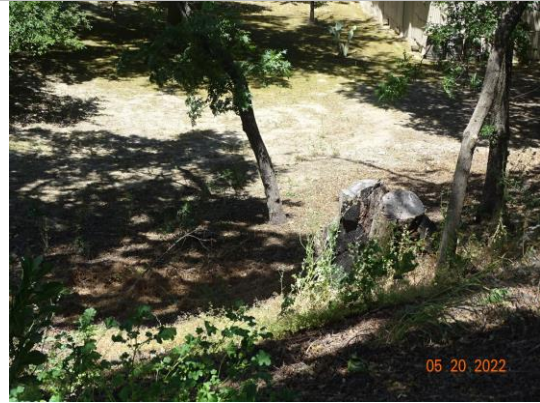
Tree stump at the landside toe. Spring 2022