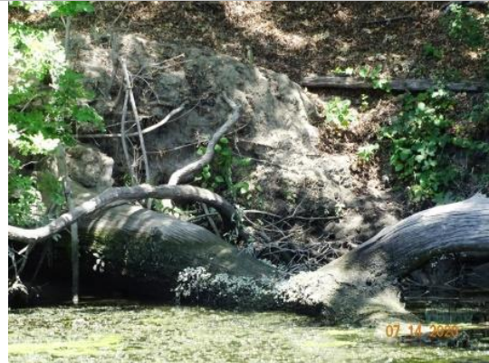
View of slope damage near fallen tree. Summer 2020