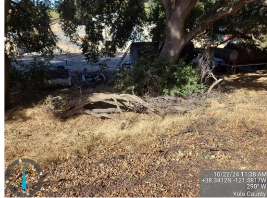
Tree on the LS slope. Fall 2024