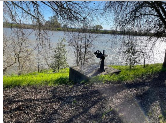
WS view: Overview of WS with concrete vault on shoulder.