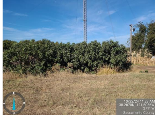
Trees on the LS slope. Fall 2024