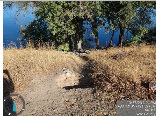
Footpath on the WS slope. Fall 2023