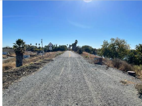
Overview of levee crown looking D/S.