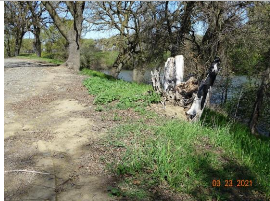
View of the tree stump on the WS levee slope. Spring 2021.