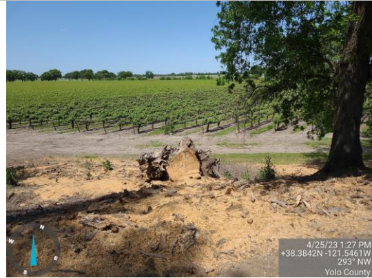
Stumps on the LS slope. Spring 2023