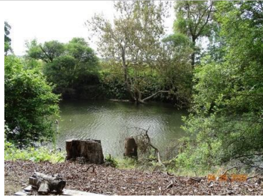
View of a large tree stump on the waterside slope. Spring 2020