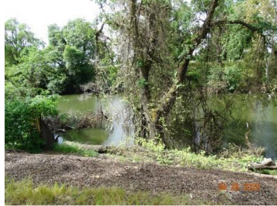
View of fallen tree on the waterside slope. Spring 2020