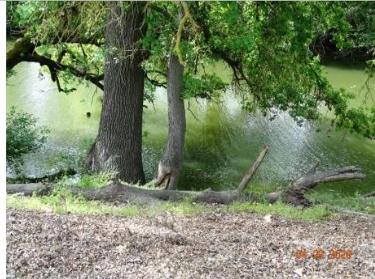
View of a tree log on the waterside slope. Spring 2020