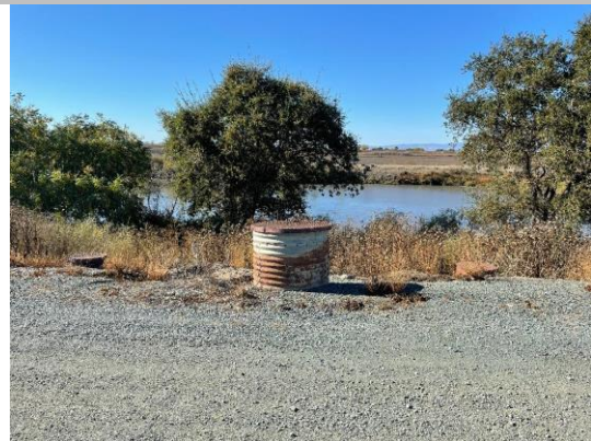
WS view: overview of WS.