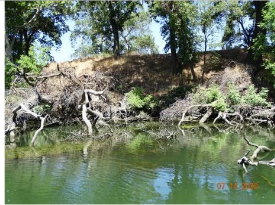
View of two fallen trees. Summer 2020