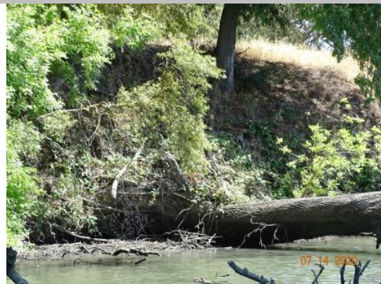
View of a fallen tree with exposed root ball. Summer 2020