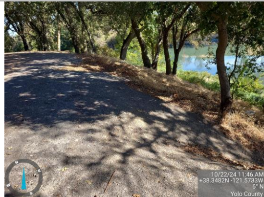
Footpaths on the WS slope. Fall 2024