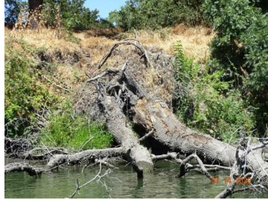
View of large, fallen tree on the waterside slope. Summer 2020