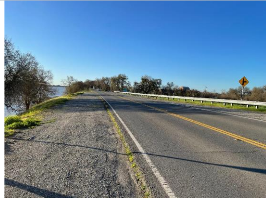
Overview of levee crown looking D/S.