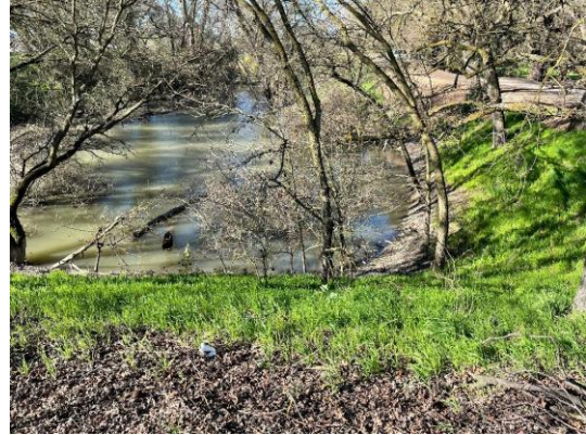
LS view: overview of LS slope and drainage channel.