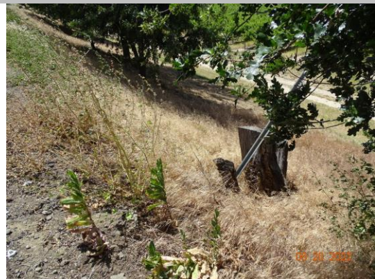
Stumps on the landside slope. Spring 2022