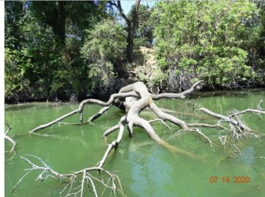
View of large, fallen tree with exposed root ball. Summer 2020