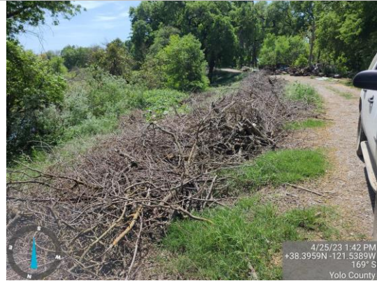
Prunings on the WS shoulder. Spring 2023