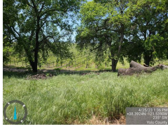
Logs and prunings on the LS slope. Spring 2023