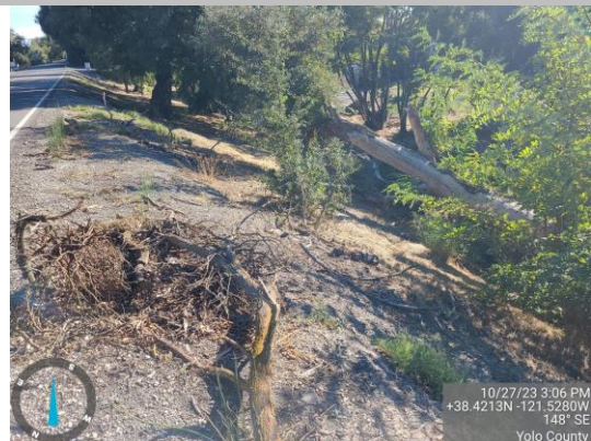
Fallen tree on the LS slope. Fall 2023