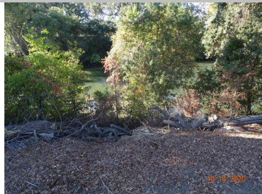
View of tree logs and limbs on the waterside slope. Fall 2020