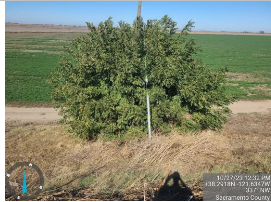
Tree on the LS slope. Fall 2023