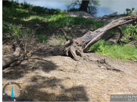
Tree with root ball on the WS slope. Spring 2023