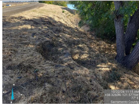
Bench in the WS slope. Fall 2024