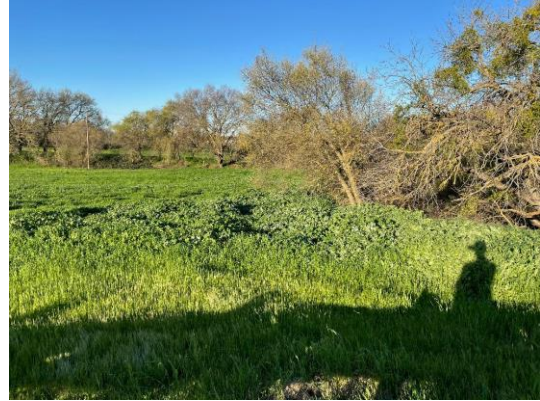
LS view: overview of LS.