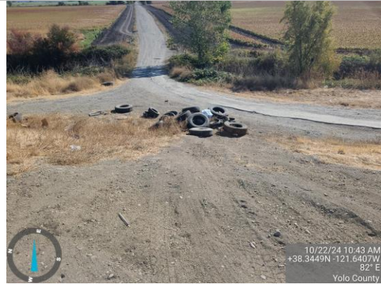
Rutting and tires on the LS slope. Fall 2024