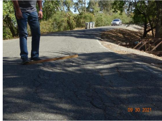
Depth of sloughing on WS crown. Fall 2021