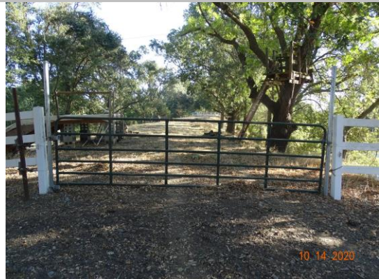
View of energized wire fencing across the levee crown behind the metal gate. Fall 2020