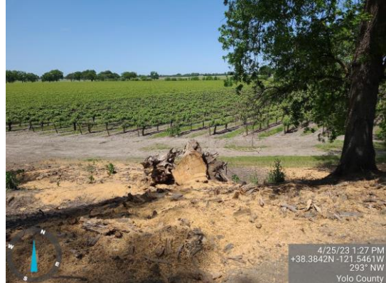
Stumps on the LS slope. Spring 2023