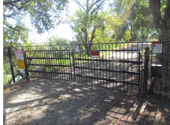
Looking west at code pad on right side of gate.