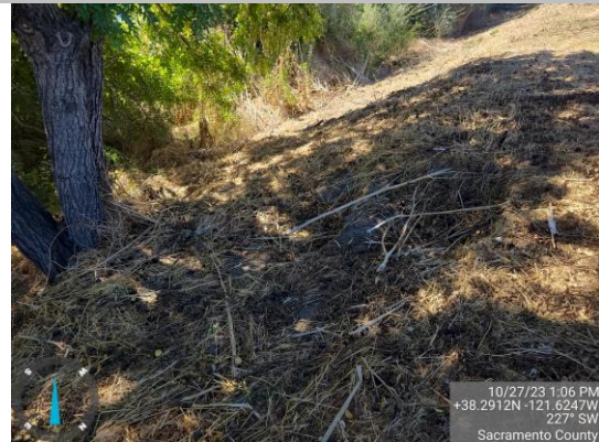
Bench in the WS slope. Fall 2023