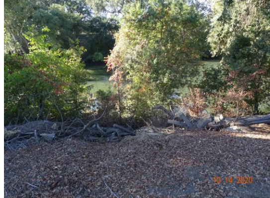
View of tree logs and limbs on the waterside slope. Fall 2020