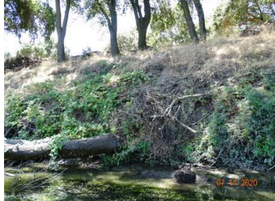
View of fallen trees and scarp. Summer 2020