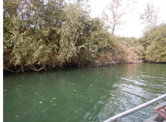
USACE 2018 Erosion Photo #2