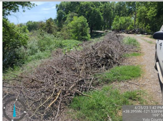
Prunings on the WS shoulder. Spring 2023