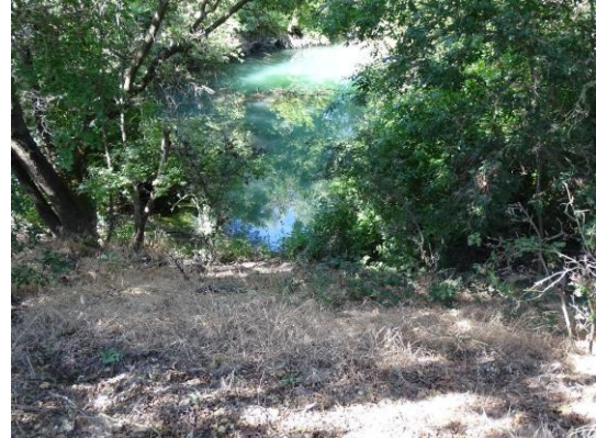
Land-Side: view of LS slope and channel at toe.