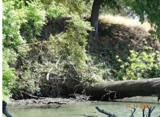
View of a fallen tree with exposed root ball. Summer 2020