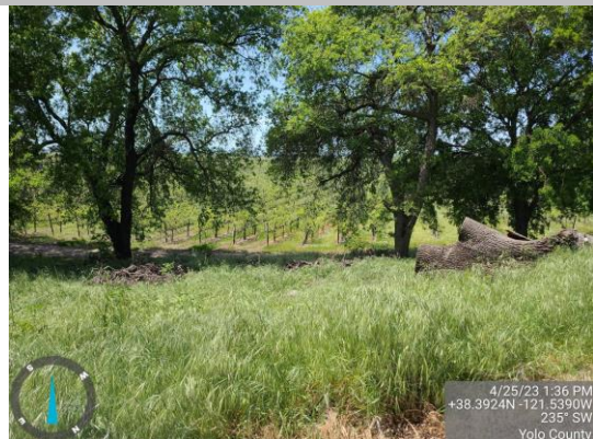
Logs and prunings on the LS slope. Spring 2023