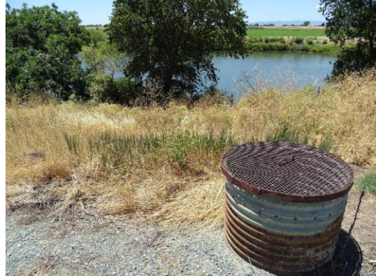
Water-Side: view of WS slope and pipe riser.