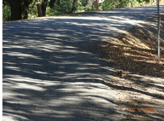
Crown depression. Fall 2022