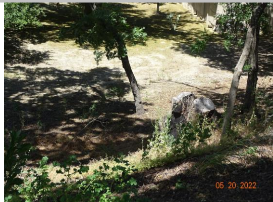
Tree stump at the landside toe. Spring 2022