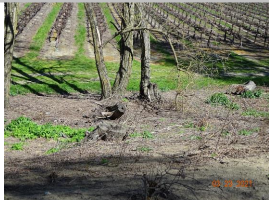
View of the tree stumps on the LS levee slope and toe. Spring 2021.