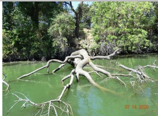
View of large, fallen tree with exposed root ball. Summer 2020