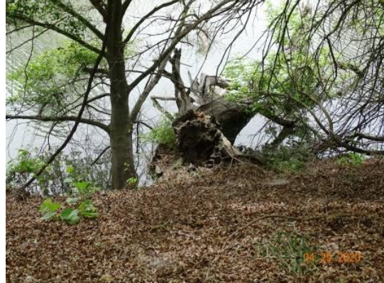
View of a fallen tree on the waterside slope. Spring 2020