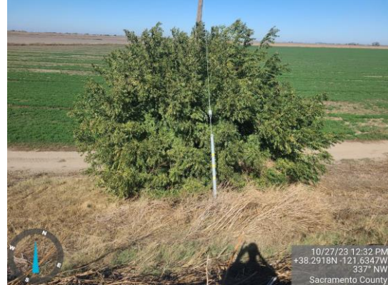
Tree on the WS slope. Fall 2023