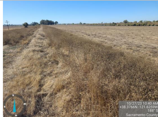
Vegetation on the WS slope. Fall 2023