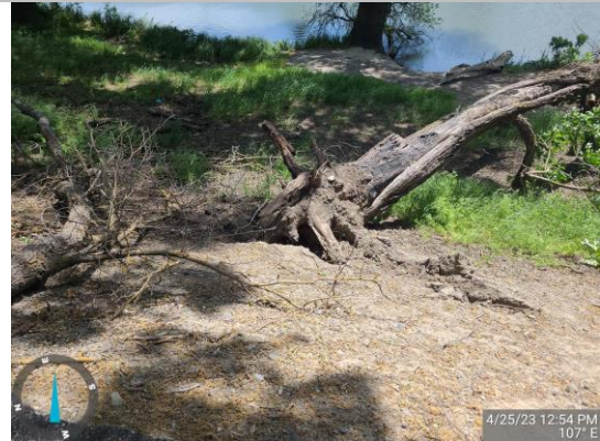
Tree with root ball on the WS slope. Spring 2023