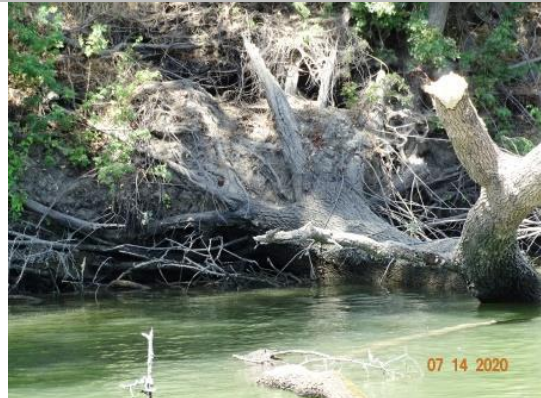
View of fallen tree with exposed root ball. Summer 2020