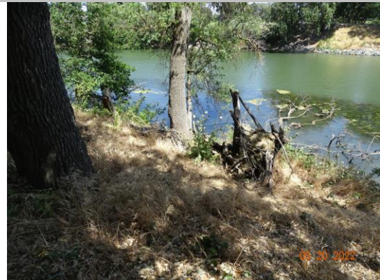
Void from root ball on the waterside slope. Spring 2022