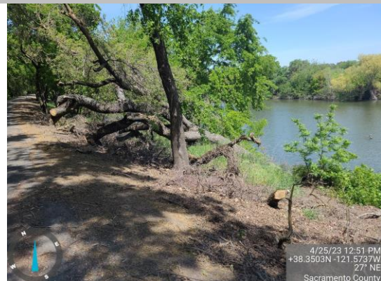
Tree with root ball on the WS slope. Spring 2023