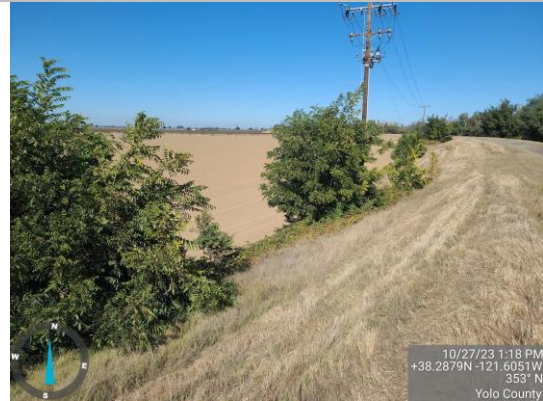
Trees on the LS slope. Fall 2023