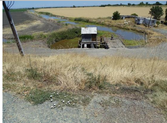
Land-Side: view of LS slope and pumphouse at toe.