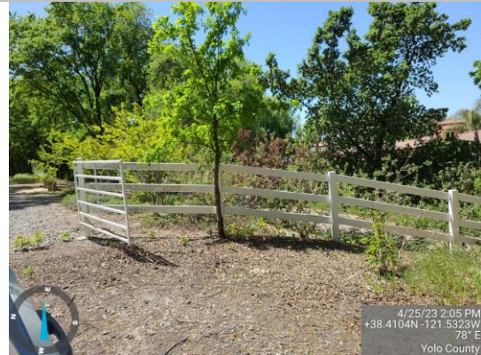
Fence and gate on the slopes and crown. Spring 2023