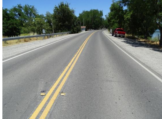
Top of Levee: view of crown.