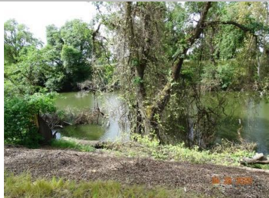
View of fallen tree on the waterside slope. Spring 2020