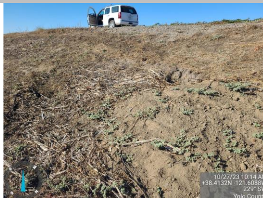
Burrows on the LS slope. Fall 2023