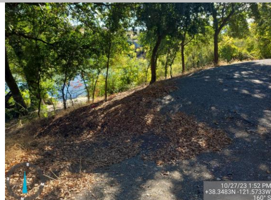
Footpath on the WS slope. Fall 2023