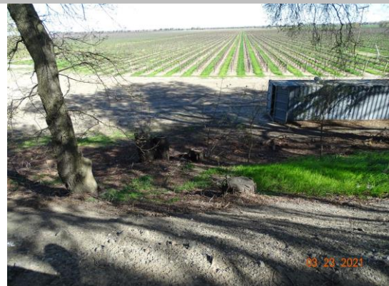
View of the tree stumps on the LS levee slope. Spring 2021.