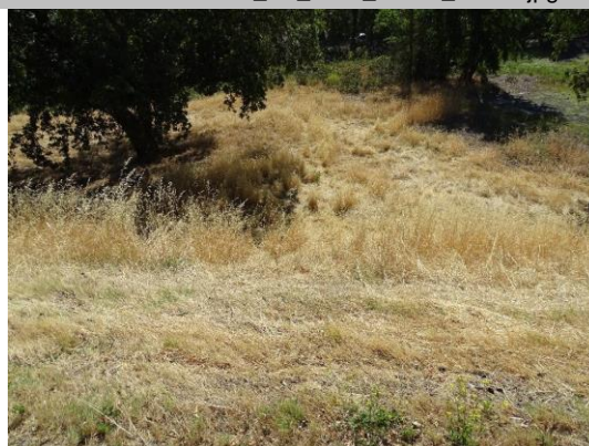
Land-Side: view of LS slope and pump platform off in distance.