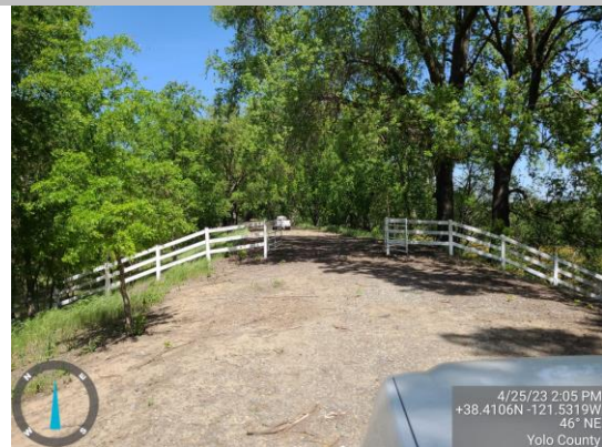
Gate and fence on the levee. Spring 2023