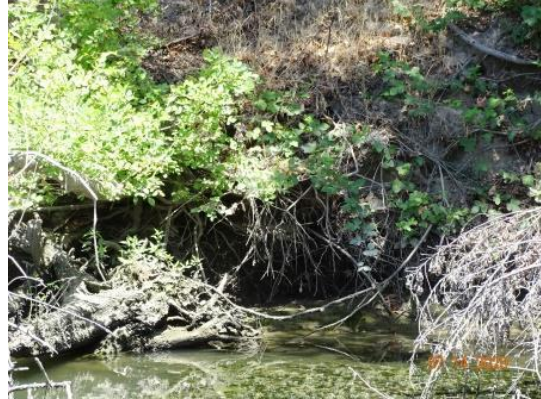
View of large scarp near two fallen trees. Summer 2020