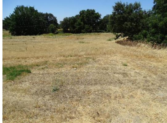
Land-Side: view of LS slope.