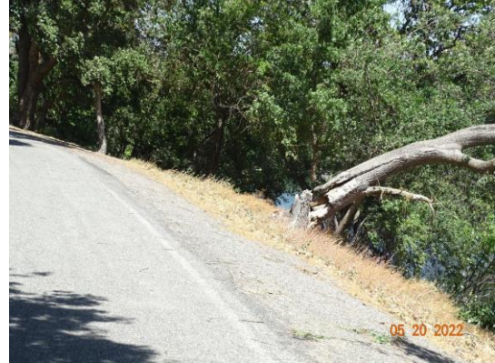
Fallen tree on the waterside slope. Spring 2022