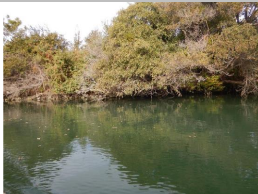
USACE 2018 Erosion Photo #1