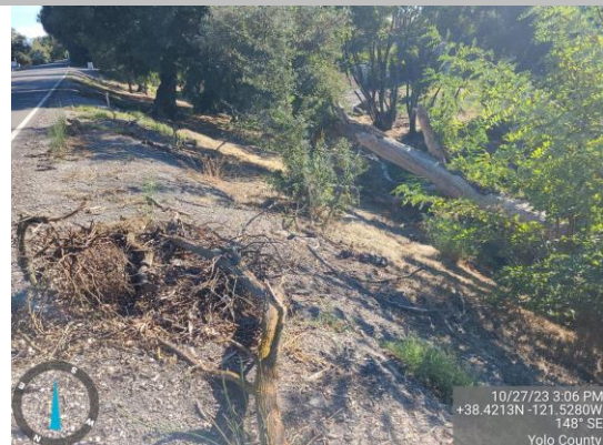
Fallen tree on the LS slope. Fall 2023