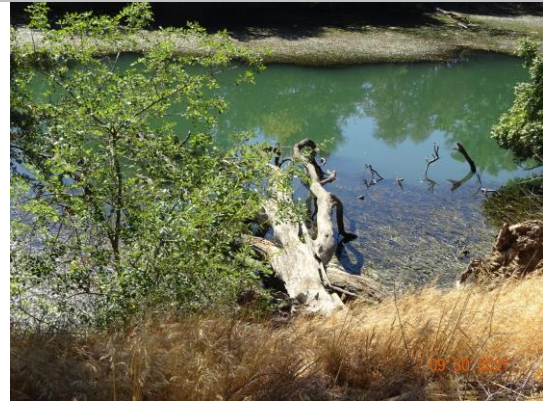
Fallen tree in channel. Fall 2021