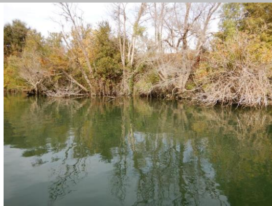
USACE 2018 Erosion Photo #2