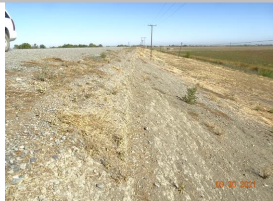
LS slope sloughing. Fall 2021

Photo 1 of 1 : FA_2023_RD0999_232_38_20230905_00012.jpg