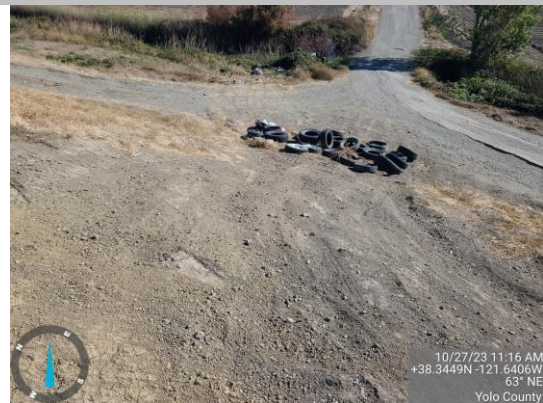
Rutting and tires on the LS slope. Fall 2023