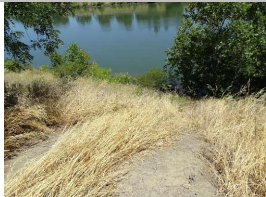
Water-Side: view of WS slope.