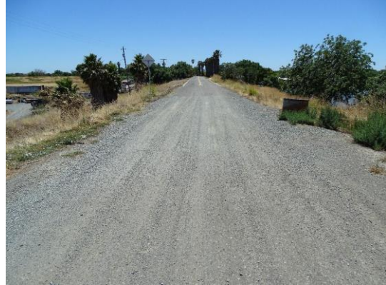
Top of Levee: view of crown with riser to this pipe on WS shoulder.