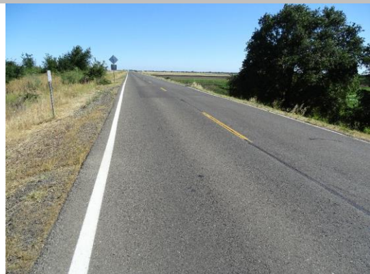
Top of Levee: view of crown.