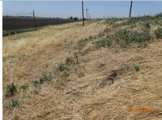
Desiccation cracking and sloughing on the landside slope. Spring 2022