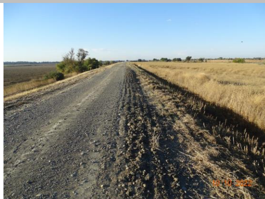
Disced and compacted desiccation areas. Fall 2022