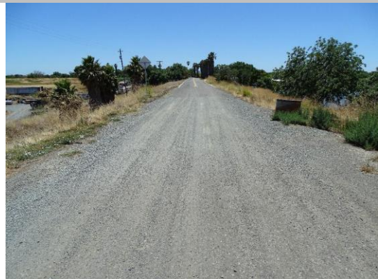
Top of Levee: view of crown with riser to this pipe on WS shoulder.