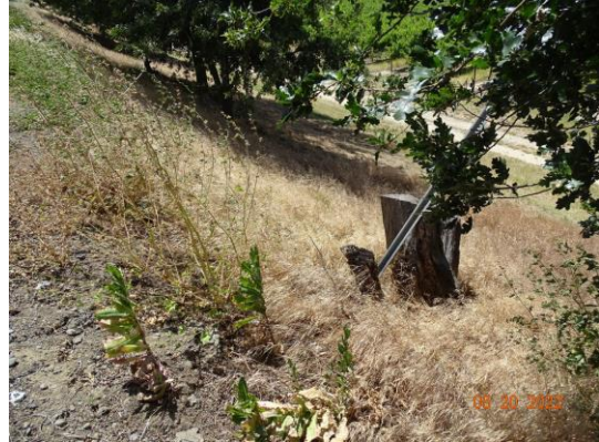
Stumps on the landside slope. Spring 2022