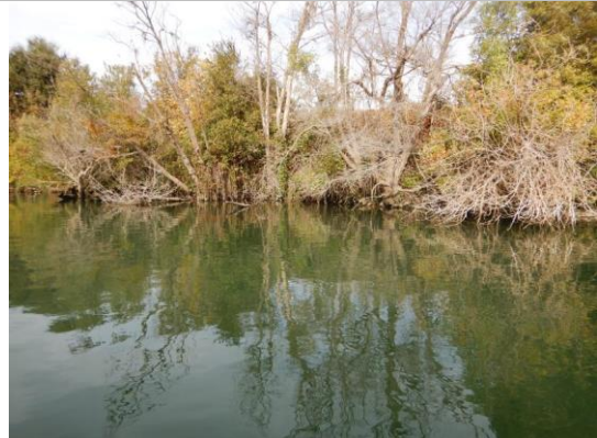
USACE 2018 Erosion Photo #2