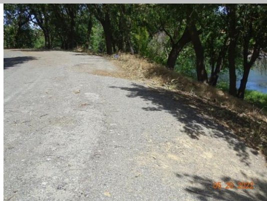
Footpaths on the waterside slope. Spring 2022