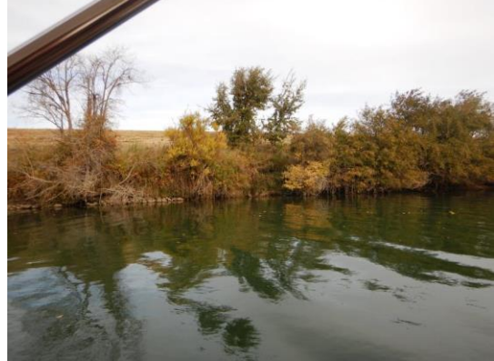
USACE 2018 Erosion Photo #1