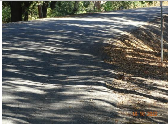
Crown depression. Fall 2022