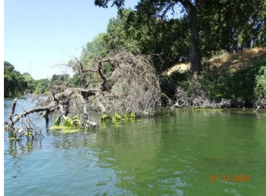
View of fallen tree split at the base. Summer 2020