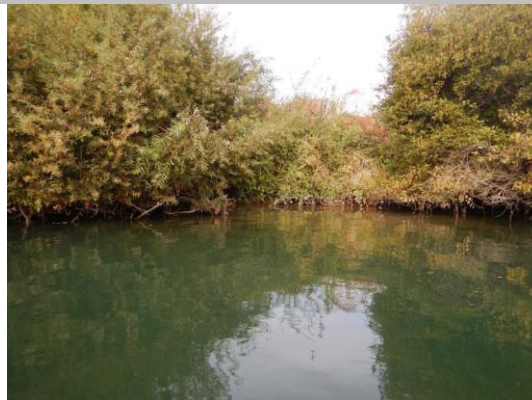
USACE 2018 Erosion Photo #1