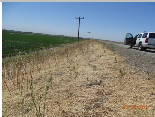
Desiccation cracking on the shoulder. Spring 2022