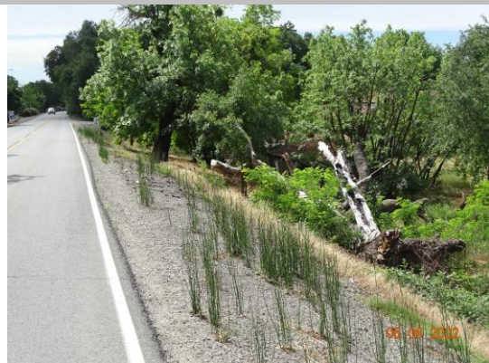
Fallen tree on the landside slope. Spring 2022