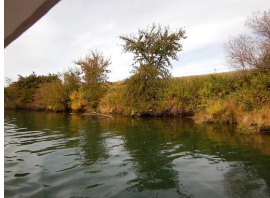
USACE 2018 Erosion Photo #2