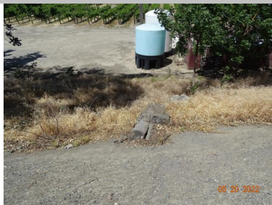
Tree stump and logs on the landside slope. Spring 2022