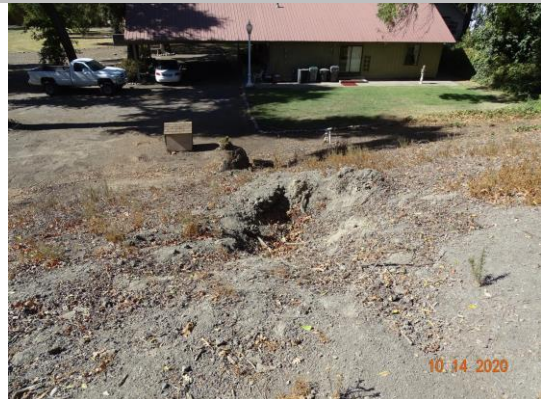
View of a large hole on the landside slope. Fall 2020