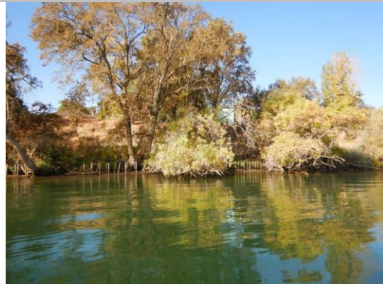
USACE 2018 Erosion Photo #1