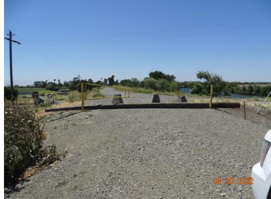
Telephone pole and concrete blocks prevent access. Gate in disrepair. Spring 2022