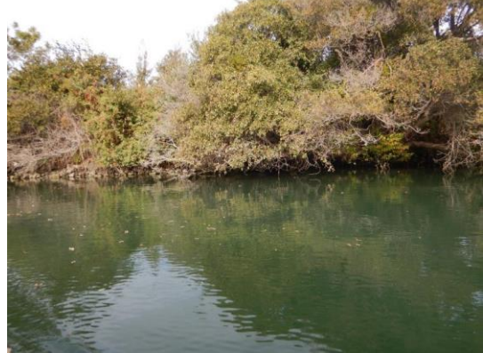
USACE 2018 Erosion Photo #1