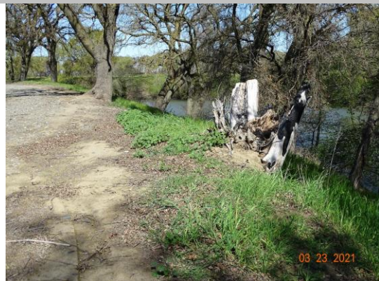
View of the tree stump on the WS levee slope. Spring 2021.