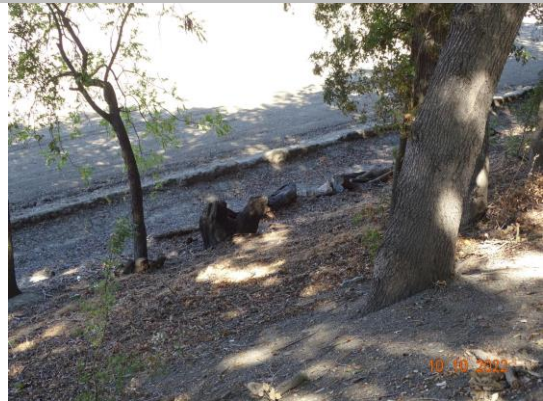
Cut logs and stumps on the LS toe. Fall 2022