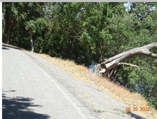
Fallen tree on the waterside slope. Spring 2022

LS : Land Side N/A : Not Applicable WS : Water Side CR : Crown