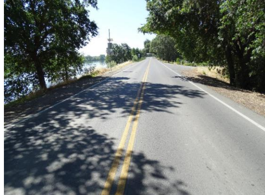
Top of Levee: view of crown.