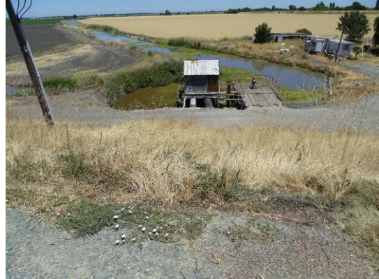
Land-Side: view of LS slope and pumphouse at toe.