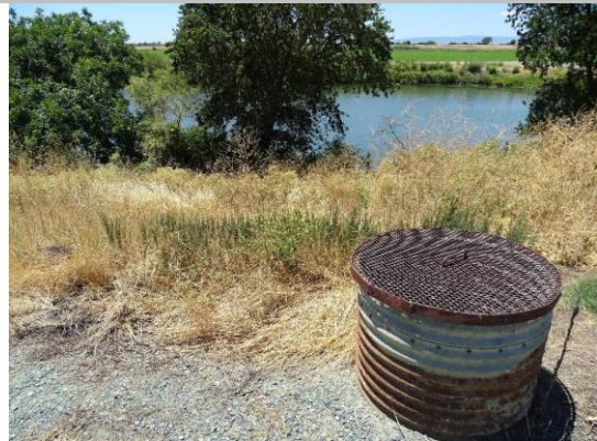
Water-Side: view of WS slope and pipe riser.