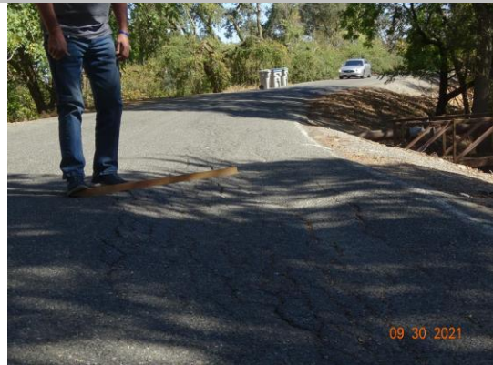
Depth of sloughing on WS crown. Fall 2021