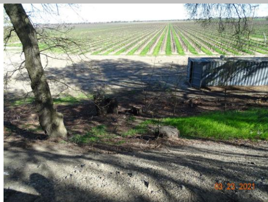
View of the tree stumps on the LS levee slope. Spring 2021.