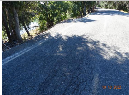
View of minor cracks near a ramp. Fall 2022