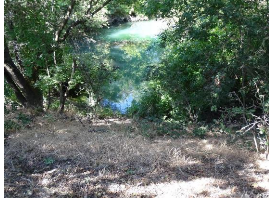
Land-Side: view of LS slope and channel at toe.