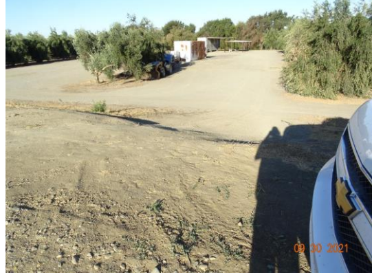
WS slope damage from vehicle and equipment traffic. Fall 2021