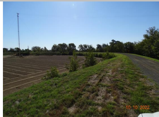
Saplings and small trees are on the LS slope and toe. Fall 2022