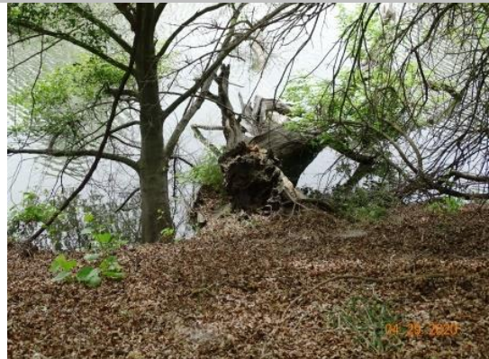
View of a fallen tree on the waterside slope. Spring 2020

* Location LS : Land Side N/A : Not Applicable WS : Water Side CR : Crown