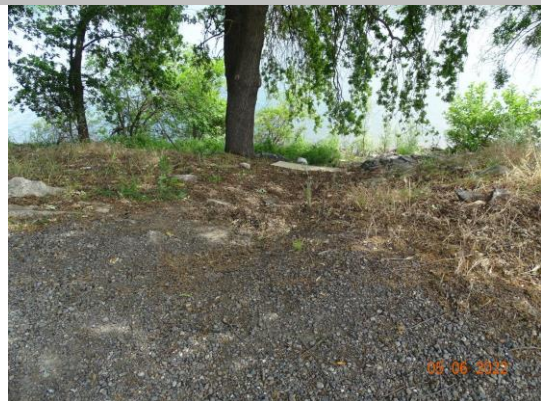
Footpath on the waterside slope. Spring 2022