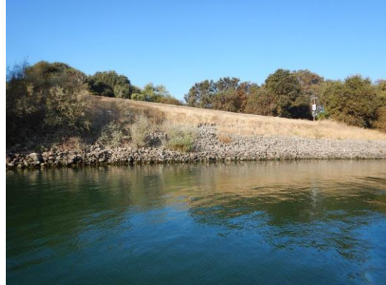
USACE 2018 Erosion Photo #2