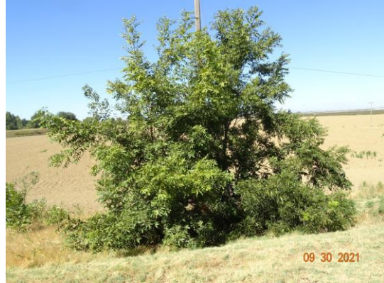
Tree near pole/guy wire on the LS. Fall 2021