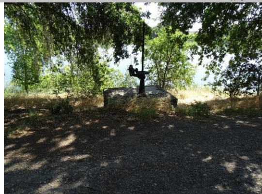
Water-Side: view of WS slope and concrete vault.