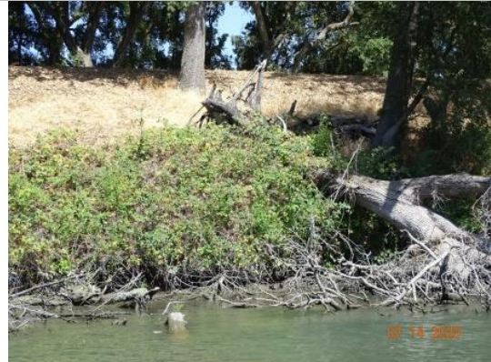
View of fallen tree with exposed rootball. Summer 2020