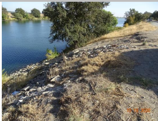
View of erosion on the waterside slope with broken concrete riprap. Fall 2020