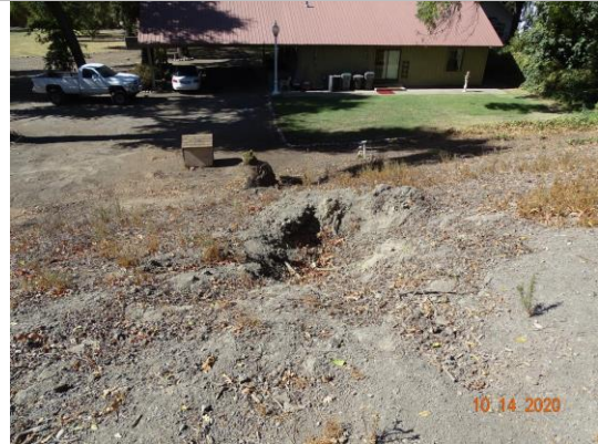
View of a large hole on the landside slope. Fall 2020