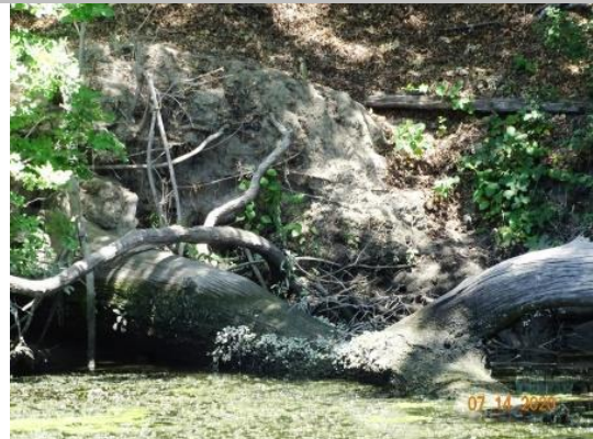
View of slope damage near fallen tree. Summer 2020