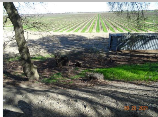
View of the tree stumps on the LS levee slope. Spring 2021.