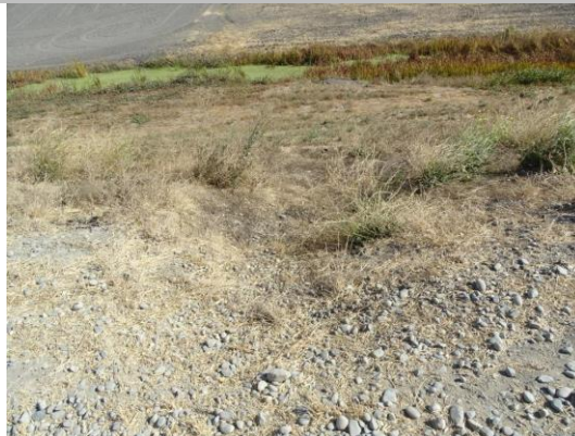
View of caving on landward slope. Fall 2018