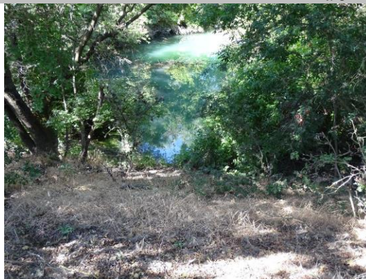
Land-Side: view of LS slope and channel at toe.