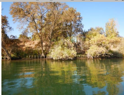
USACE 2018 Erosion Photo #1