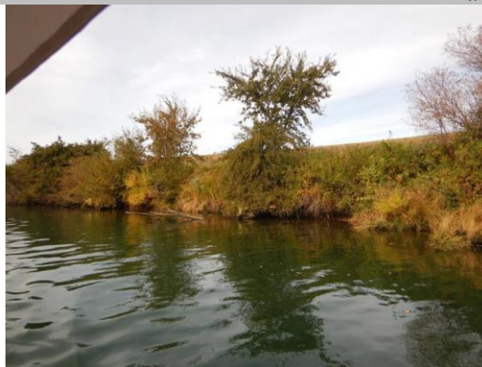
USACE 2018 Erosion Photo #2