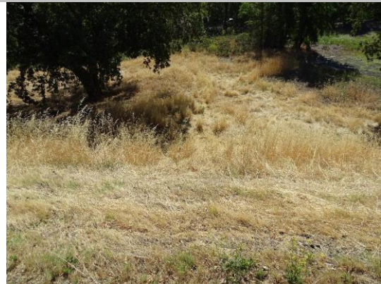
Land-Side: view of LS slope and pump platform off in distance.