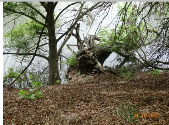
View of a fallen tree on the waterside slope. Spring 2020