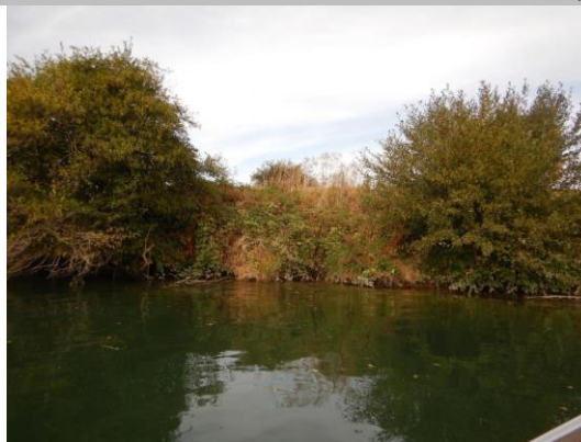
USACE 2018 Erosion Photo #2