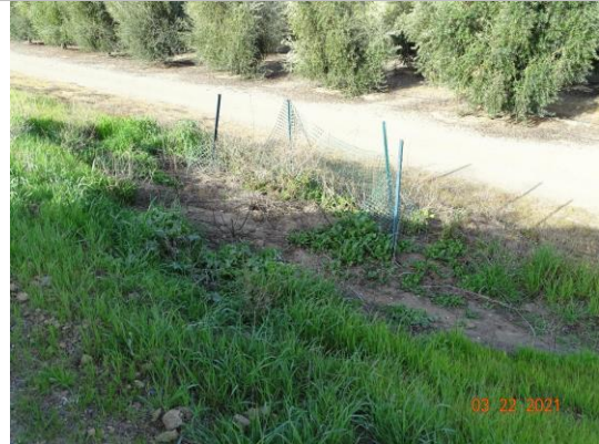
View of the signs of rodent activity. Spring 2021.