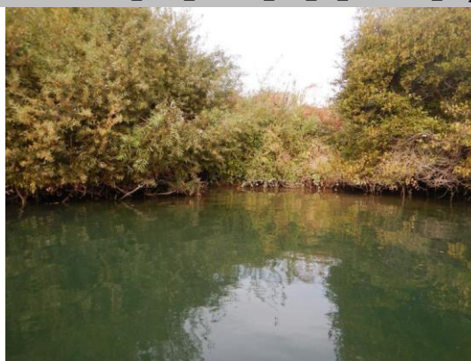
USACE 2018 Erosion Photo #1