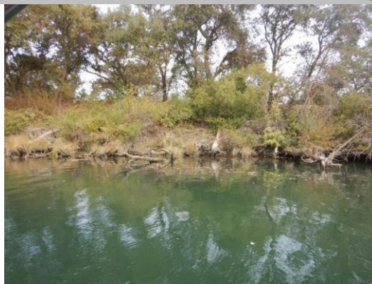
USACE 2018 Erosion Photo #1