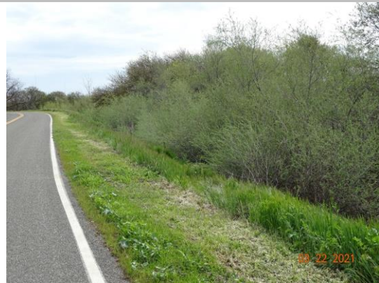
View of the trees on the WS levee slope. Spring 2021.