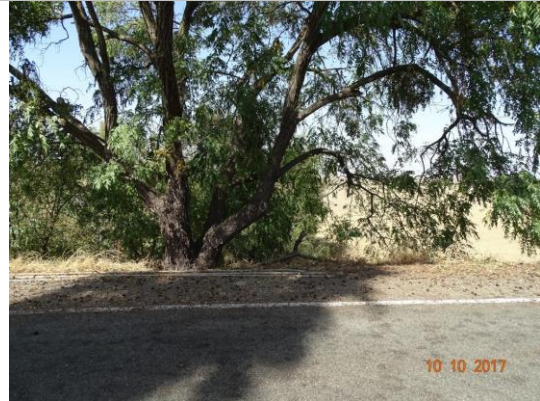
View of trees on landside slope looking north. Fall 2017