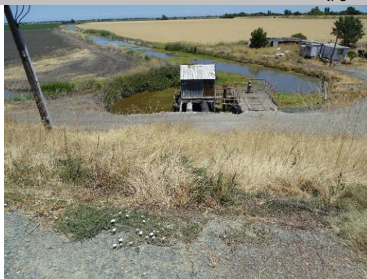
Land-Side: view of LS slope and pumphouse at toe.