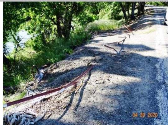
View of minor cracks near a ramp. Spring 2020