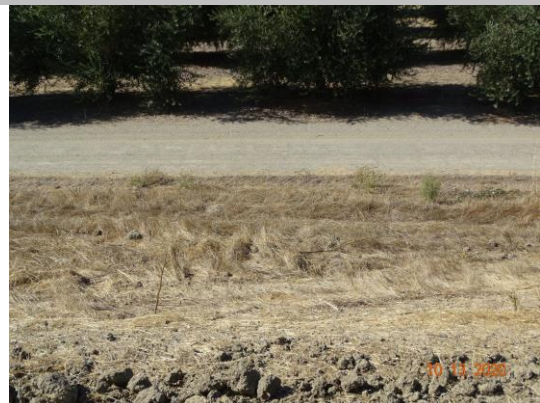
View of animal holes at the waterside toe. Fall 2020