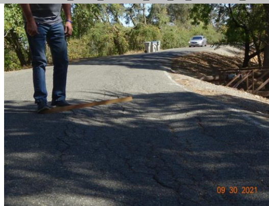
Depth of sloughing on WS crown. Fall 2021