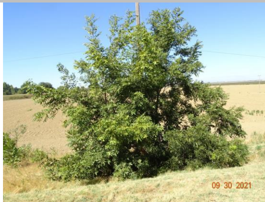
Tree near pole/guy wire on the LS. Fall 2021