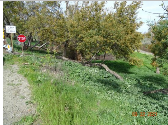
View of the fallen trees on the LS levee slope. Spring 2021.