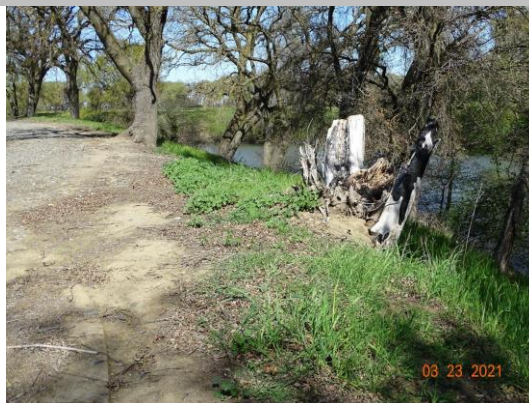
View of the tree stump on the WS levee slope. Spring 2021.