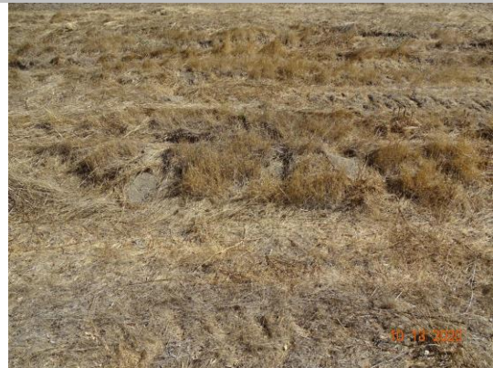
View of animal holes at the waterside toe. Fall 2020