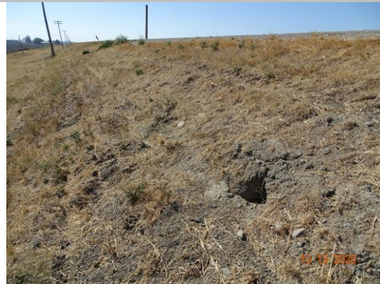
View of a large animal hole on the landside slope. Fall 2020