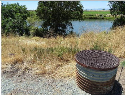
Water-Side: view of WS slope and pipe riser.