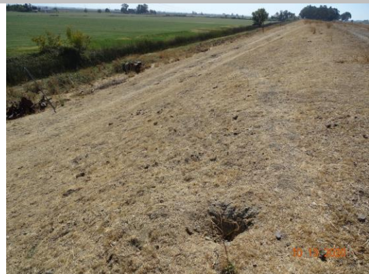
View of large animal holes on the landside slope. Fall 2020