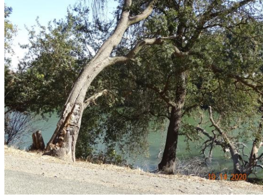
View of a tree on the waterside slope that split at the trunk. Fall 2020