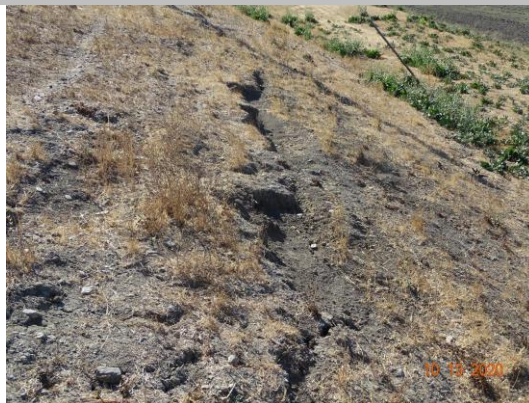
View of soil separation on the waterside slope. Fall 2020