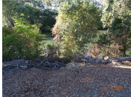
View of tree logs and limbs on the waterside slope. Fall 2020