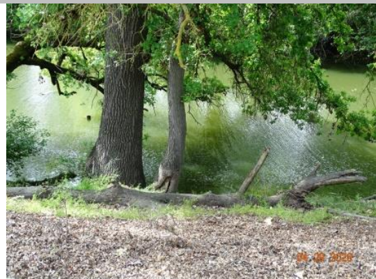
View of a tree log on the waterside slope. Spring 2020