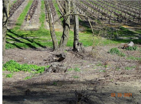
View of the tree stumps on the LS levee slope and toe. Spring 2021.