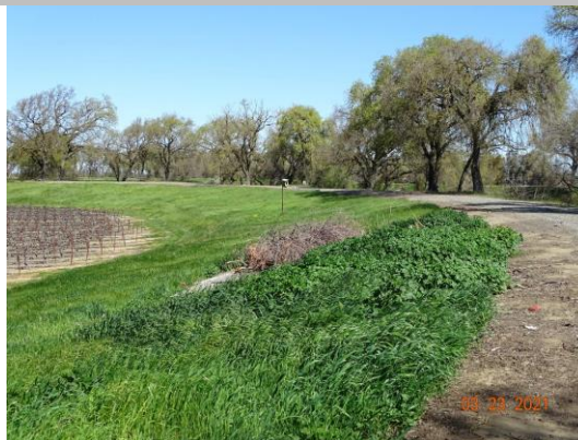
View of the debris and pruning pile on the LS levee slope. Spring 2021.