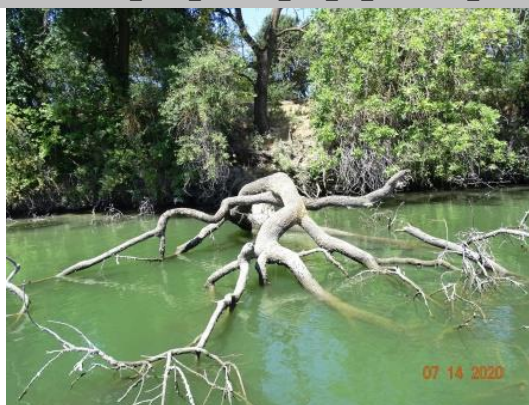
View of large, fallen tree with exposed rootball. Summer 2020