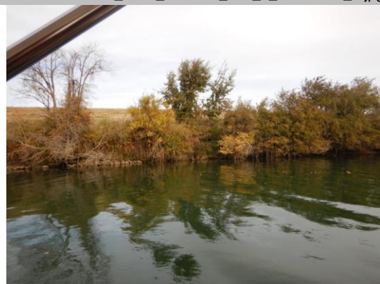
USACE 2018 Erosion Photo #1