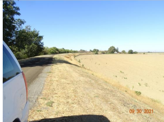
LS slope annual growth on lower portion. Fall 2021