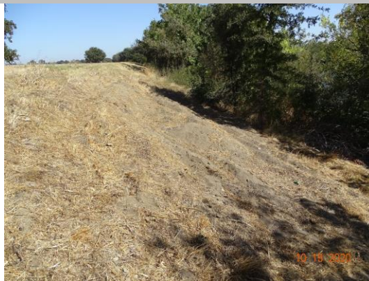
View of slope damage on the waterside slope due to vehicle traffic. Fall 2020