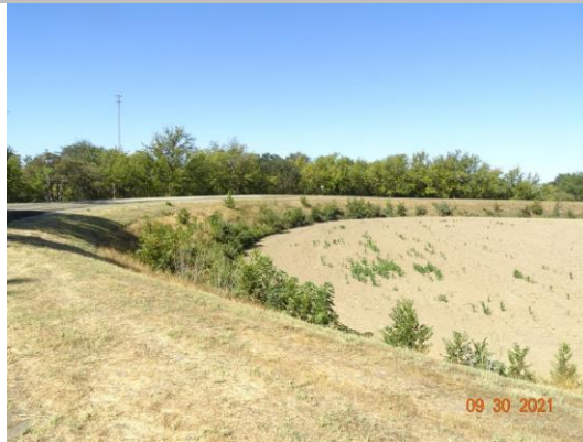
Sapling growth on the LS slope/toe. Fall 2021