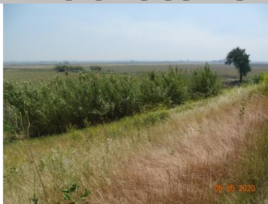
View of Arundo growth at the landside toe. Spring 2020