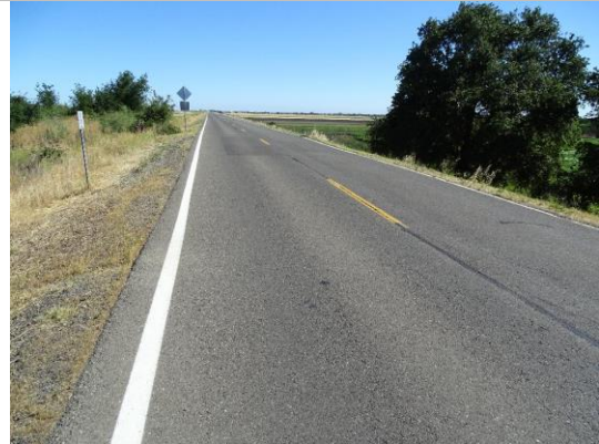
Top of Levee: view of crown.