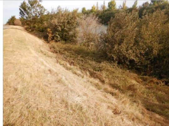
USACE 2018 Erosion Photo #1