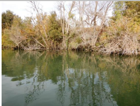
USACE 2018 Erosion Photo #2