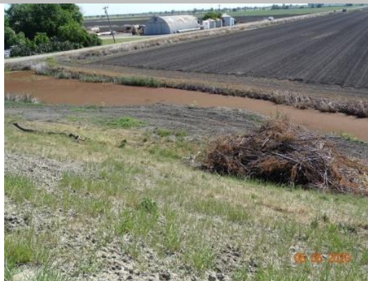
View of prunings at the landside toe. Spring 2020

LS : Land Side N/A : Not Applicable WS : Water Side CR : Crown