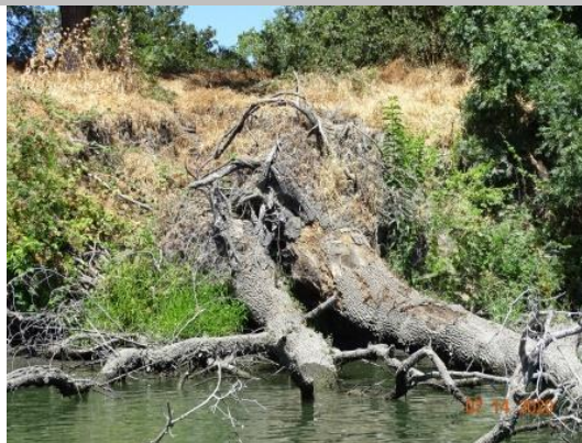
View of large, fallen tree on the waterside slope. Summer 2020