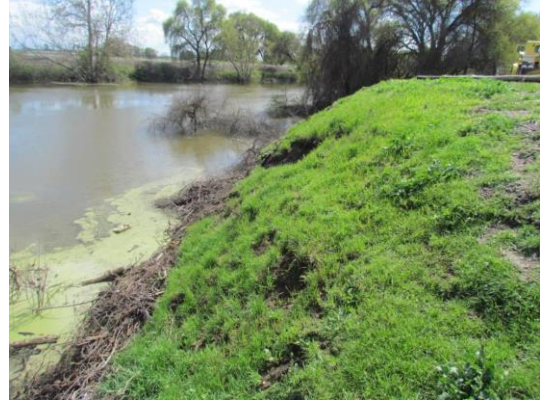
Looking downstream at finger erosion on downstream side of slough.