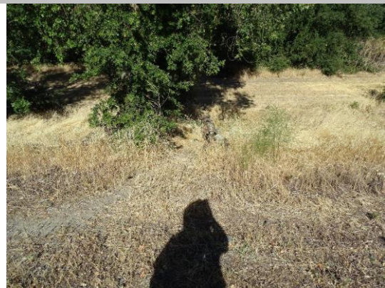
Water-Side: view of WS slope and broken crossing at toe.