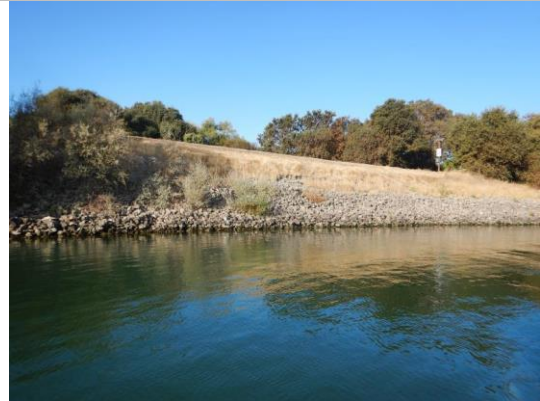
USACE 2018 Erosion Photo #2