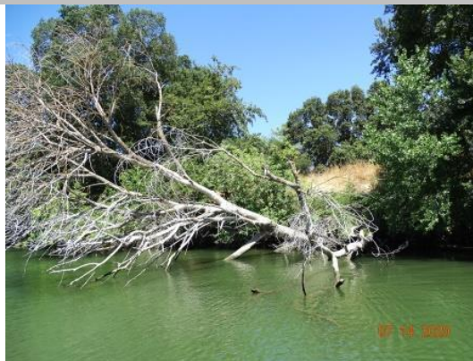
View of fallen tree and slope damage. Summer 2020