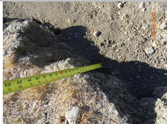
View of soil separation on the waterside slope. Fall 2020