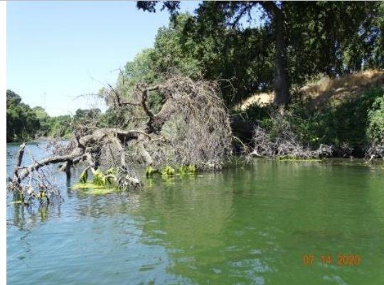
View of fallen tree split at the base. Summer 2020