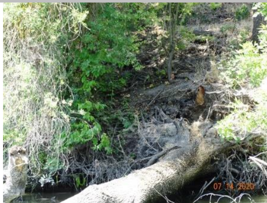
View of scarp around fallen tree. Summer 2020