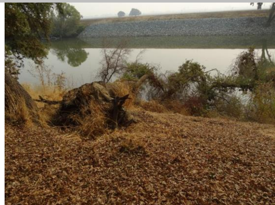
View of dead tree on slope. Fall 2018