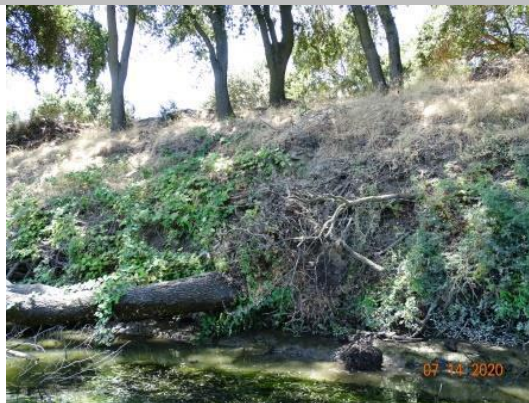
View of fallen trees and scarp. Summer 2020