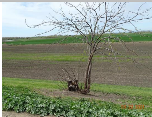
View of the tree and stump at the WS levee toe. Spring 2021.