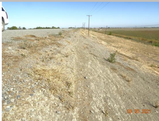
LS slope sloughing. Fall 2021