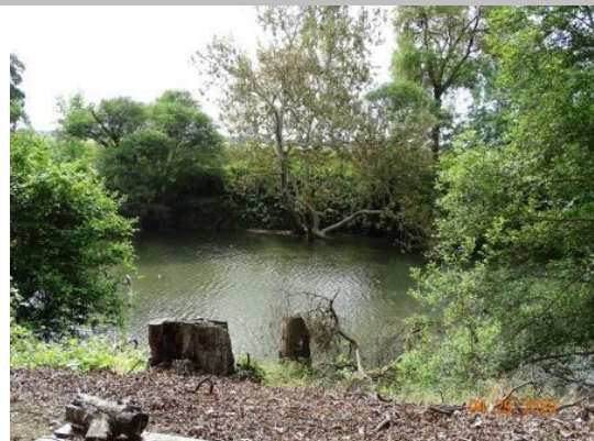
View of a large tree stump on the waterside slope. Spring 2020