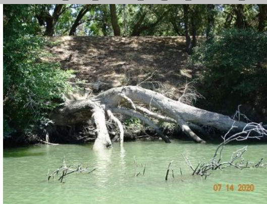
View of slope erosion around fallen tree from the waterside. Summer 2020