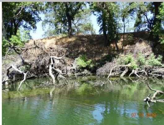
View of two fallen trees. Summer 2020