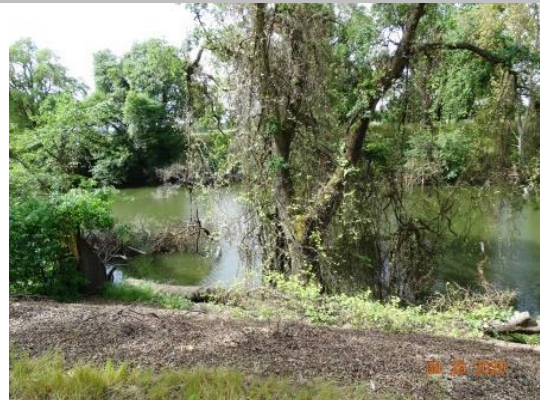
View of fallen tree on the waterside slope. Spring 2020