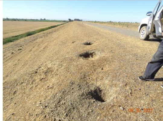
Rodent burrows on LS slope. Fall 2021