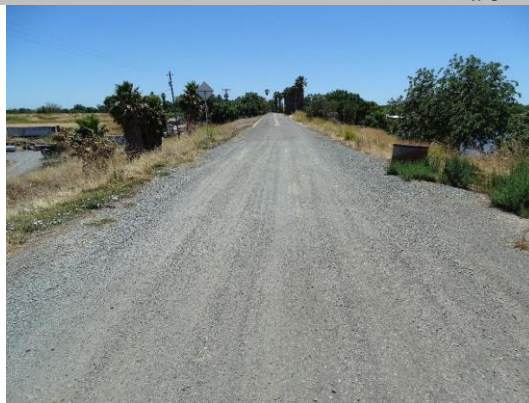
Top of Levee: view of crown with riser to this pipe on WS shoulder.