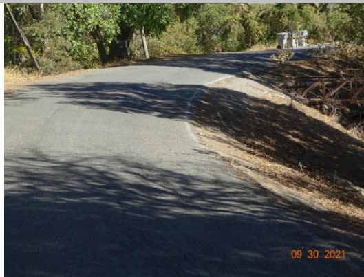
Length of sloughing on WS crown. Fall 2021