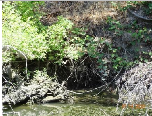
View of large scarp near two fallen trees. Summer 2020