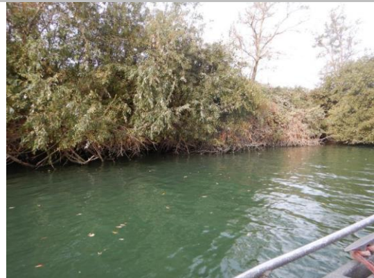
USACE 2018 Erosion Photo #2