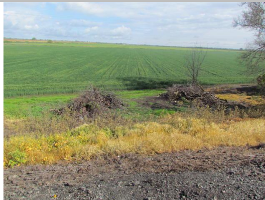
Looking west at prunings on landside berm.