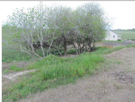
Looking southwest at trimmed trees on landside toe. (Spring 2012)