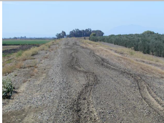
Looking south at rutting on levee crown.