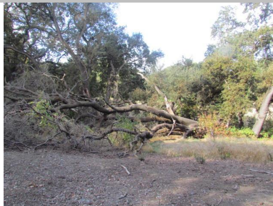
Looking southwest at downed tree on landward toe. (Fall 2014)