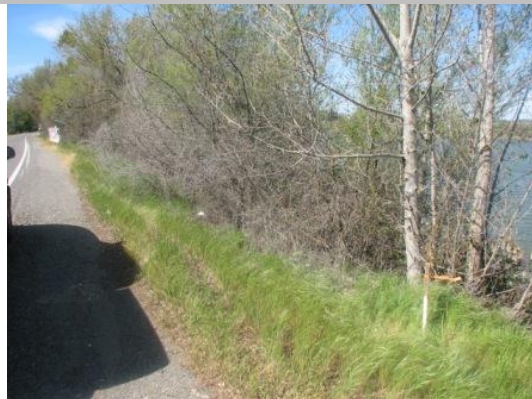
Side view of dense trees along waterside slope.