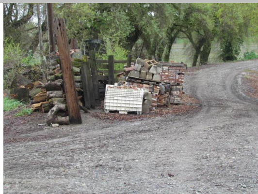
Looking northeast at firewood and other material on landside shoulder. (Spring 2012)