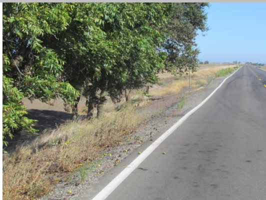
Looking northwest at trimmed trees on waterward slope.