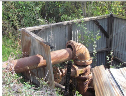
Looking east at pipe disconnected from pump.

LS : Land Side N/A : Not Applicable WS : Water Side CR : Crown