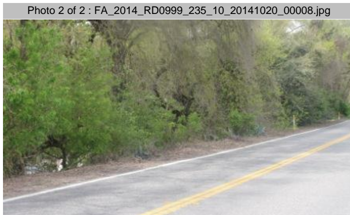
Looking west at dense trees on waterside slope.