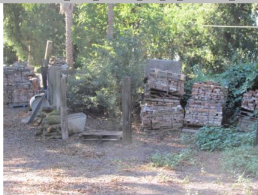
Looking south at firewood and other material on landside shoulder and crown.