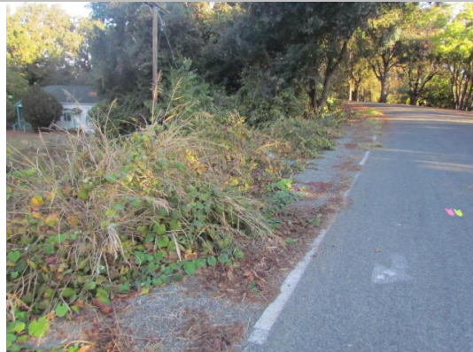
Looking northwest at dense vegetation on landward slope.