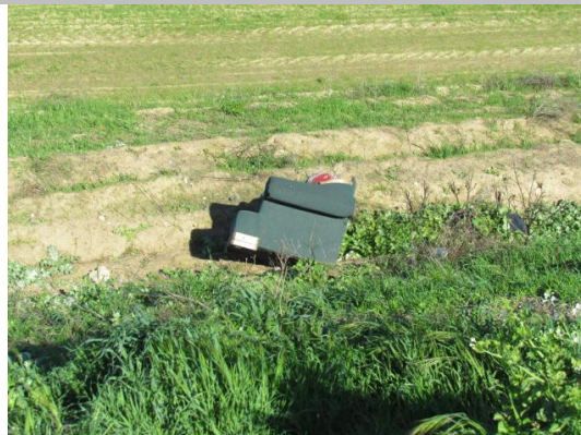
Looking west at garbage (sofa) on waterward toe.