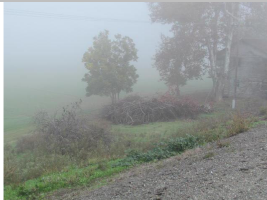
Looking west at prunings on landside toe. (Fall Inspection 2012)