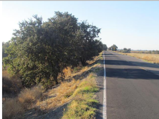
Looking south at typical view of untrimmed trees on landward slope.