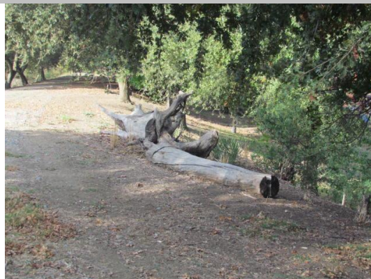
Looking southwest at tree limbs on landward shoulder.

LS : Land Side N/A : Not Applicable WS : Water Side CR : Crown