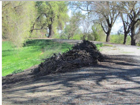
Looking east prunings on landward slope.