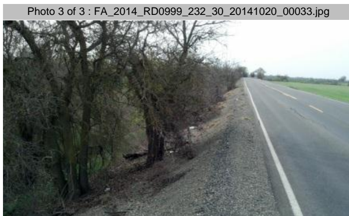
Looking southeast at dense trees on landside slope and toe. (2013)