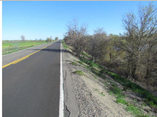
Looking north at several untrimmed trees on landside slope.