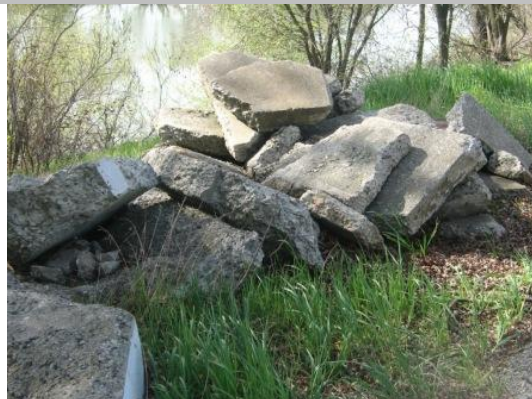
Concrete rubble on waterside sholder at LM 1.97