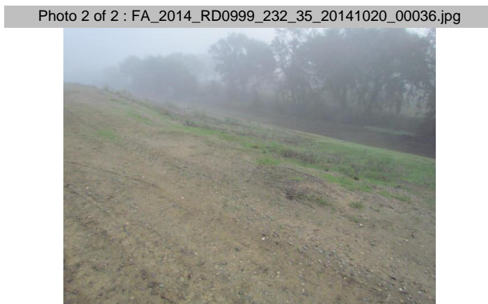
Looking east at slope damage on landside slope.