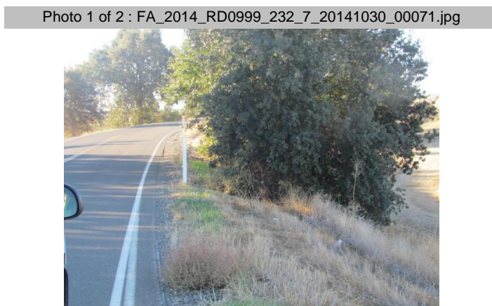
Looking south at untrimmed trees on waterward slope. (Fall 2014)