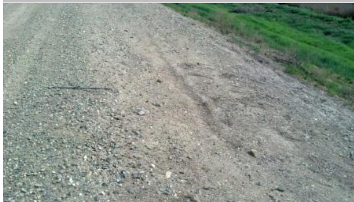
Looking northeast at depression on landside shoulder.

LS : Land Side N/A : Not Applicable WS : Water Side CR : Crown