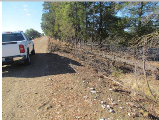
Looking southwest at downed tree on waterward slope.