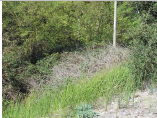
Looking northwest at dense wild roses and berry vines on landside toe near ramp.