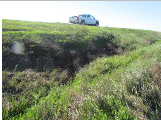
Looking southeast at depression on waterward toe.

Photo 1 of 2 : FA_2014_RD0999_232_65_20141020_00059.jpg