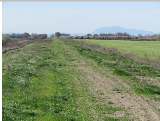
Looking south at growth and ruts on levee crown.

LS : Land Side N/A : Not Applicable WS : Water Side CR : Crown