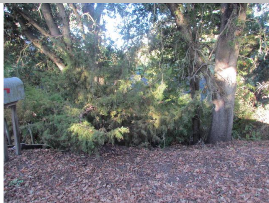
Looking west at dense vegetation on landward slope and toe.

LS : Land Side N/A : Not Applicable WS : Water Side CR : Crown