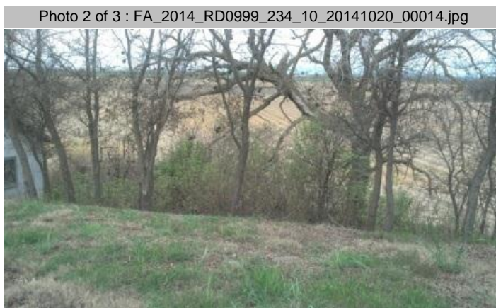
Looking west at dense trees on landside toe.