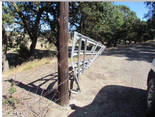
Looking northwest at damaged gate on levee crown.