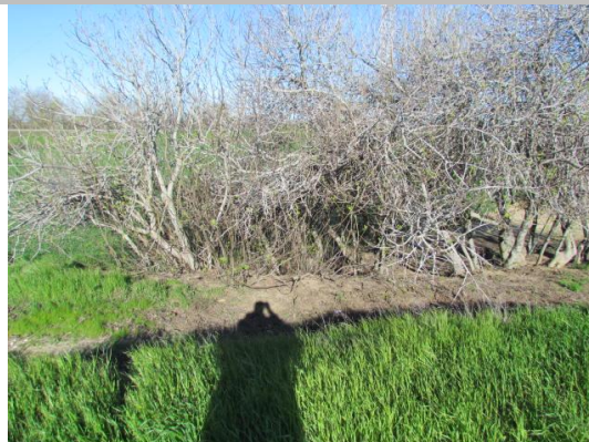
Looking west at dense fig trees at landside toe.