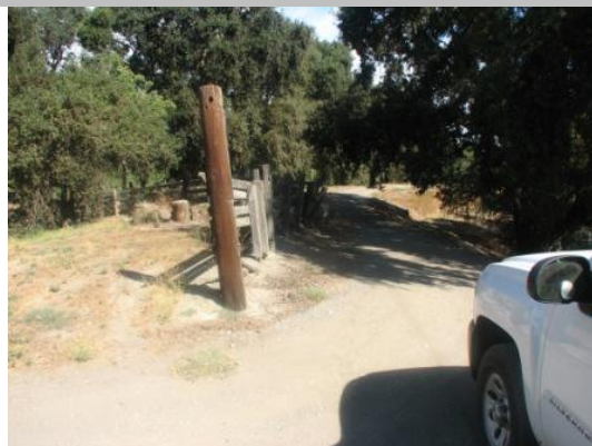
Fence, firewood and material at landside shoulder.

LS : Land Side N/A : Not Applicable WS : Water Side CR : Crown