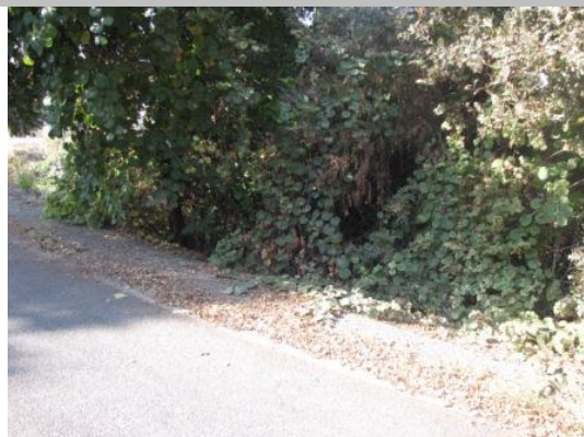
Looking west at dense trees on landside slope and toe.(Spring 2011)

LS : Land Side N/A : Not Applicable WS : Water Side CR : Crown