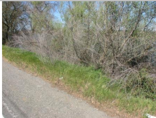
Front view of dense trees along waterside slope.