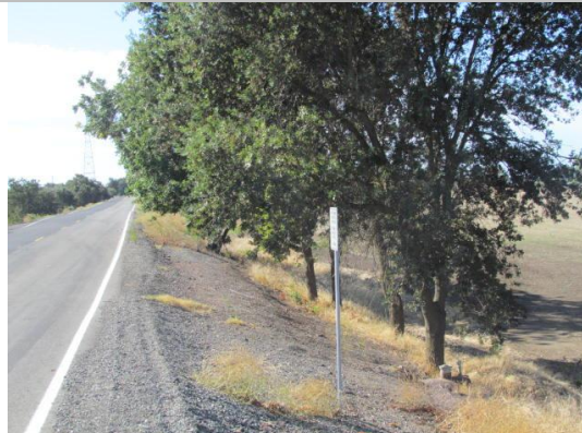
Looking southwest at trimmed trees on waterward slope.