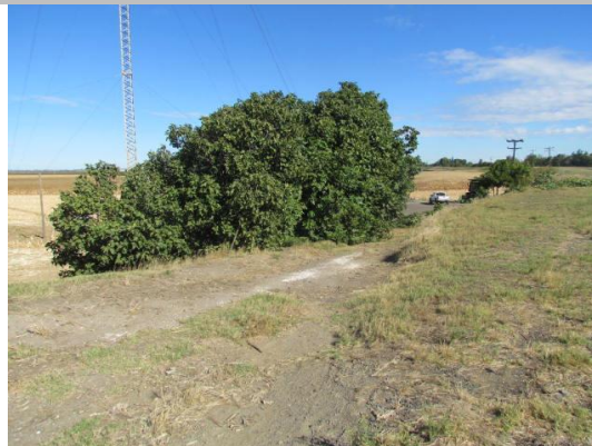
Looking northwest at dense fig tree on landward slope and toe. 2013