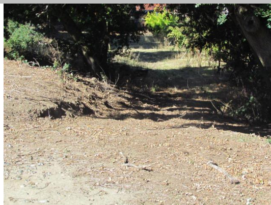
Looking west at levee damage due to vehicle traffic.