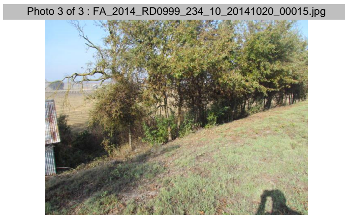
Looking northwest at dense vegetation at landside slope and toe.