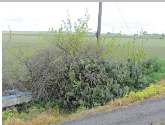
Looking southwest at dense vegetation and cactus on landside slope. (Spring 2012)