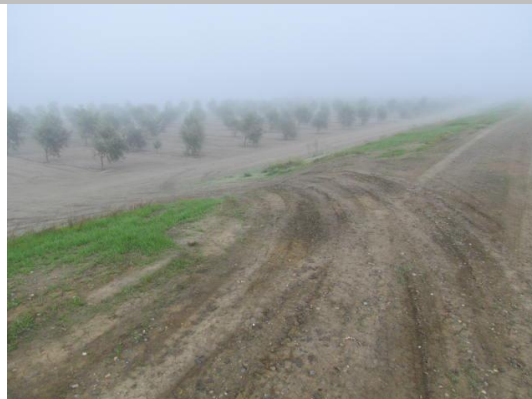
Looking northwest at slope damage caused by vehicle traffic.