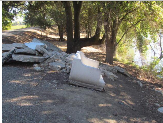
Looking northeast at garbage (sofa) on waterward slope.

LS : Land Side N/A : Not Applicable WS : Water Side CR : Crown