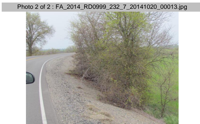
Looking southwest at untrimmed trees on waterside slope.