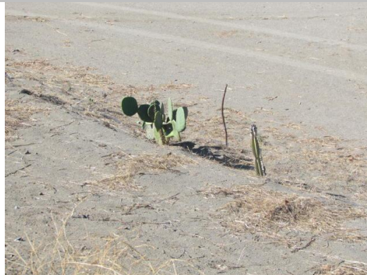
Looking west at cactus on waterward toe.