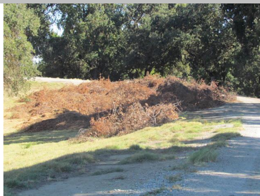
Looking northeast at large prunings on landward slope.