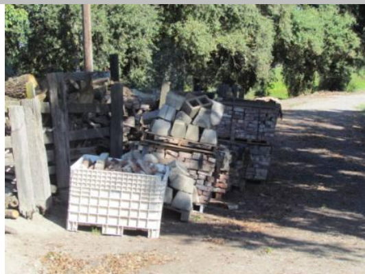
Looking north at firewood and other material on landside shoulder and crown.