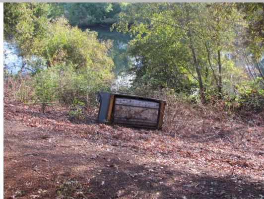
Looking east at garbage (sofa) on waterward slope.