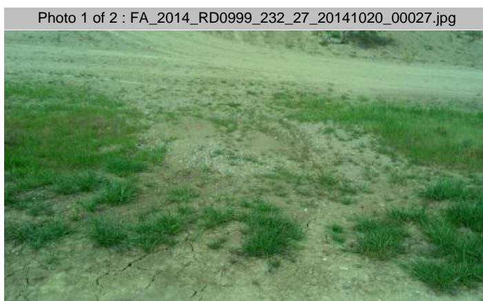
Looking west at slope damage on waterside slope.