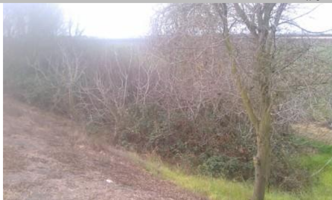
Looking southwest at dense berry vines on landside toe.