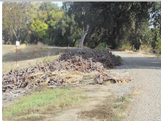
Looking northeast at prunings on landward slope. (Fall 2014)