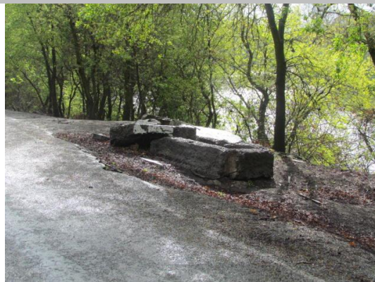
Looking east at large concrete blocks at the top of ramp on waterside shoulder.