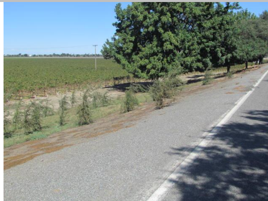
Looking west at small oak trees on landward slope.