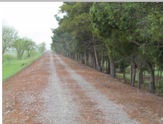
Looking south at trimmed pine trees on waterside shoulder and slope. (Spring 2012)

LS : Land Side N/A : Not Applicable WS : Water Side CR : Crown