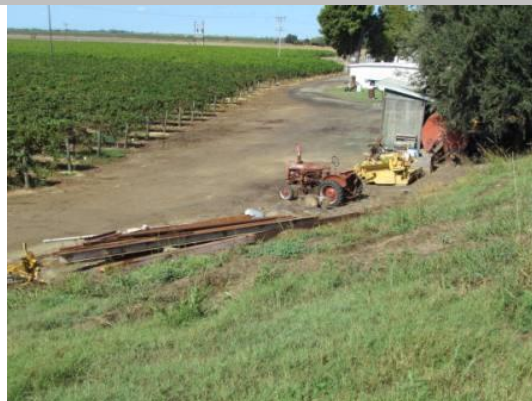
Looking northwest at equipment at landside toe.