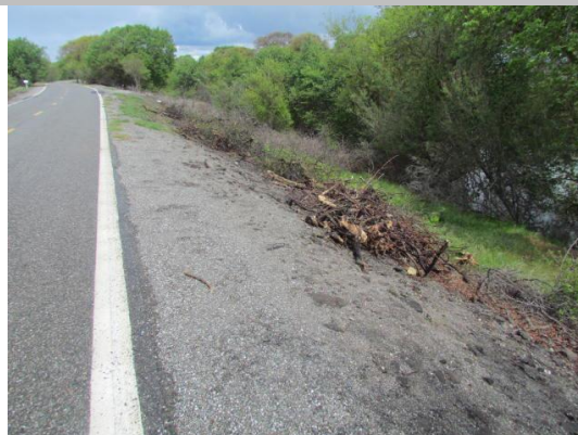
Looking northeast at prunings on waterside slope.