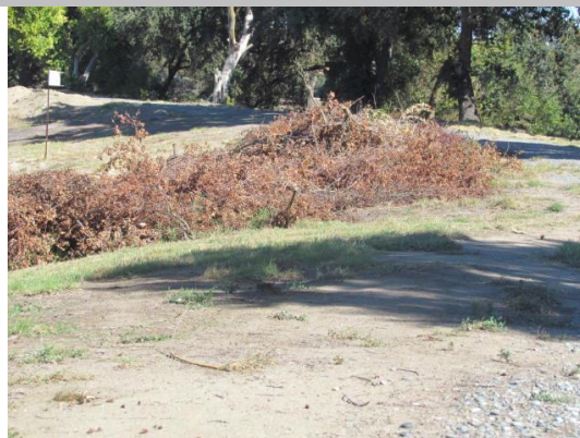
Looking northeast at prunings on landward slope.

LS : Land Side N/A : Not Applicable WS : Water Side CR : Crown