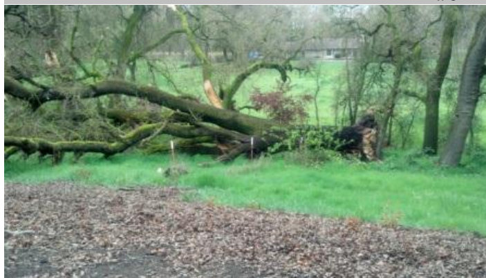
Looking west at large tree on landside slope and toe.

LS : Land Side N/A : Not Applicable WS : Water Side CR : Crown