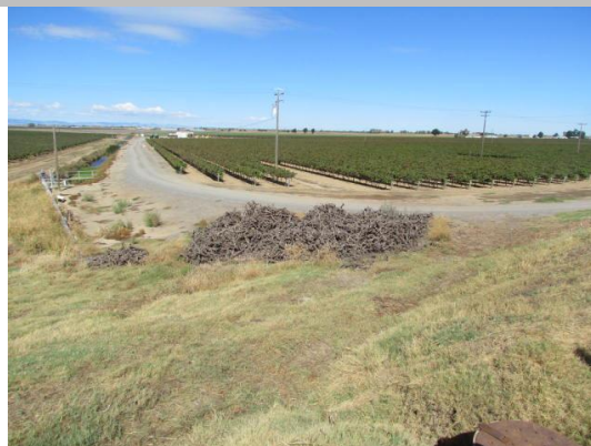
Looking west at prunings on landward berm.