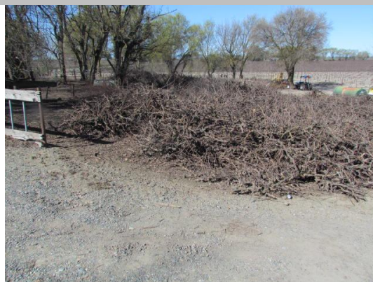
Looking west at prunings on landward slope and toe.