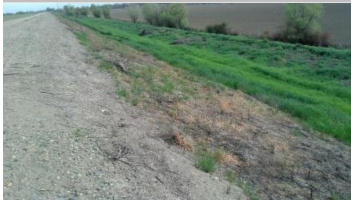
Looking north at depression on landside should and slope.