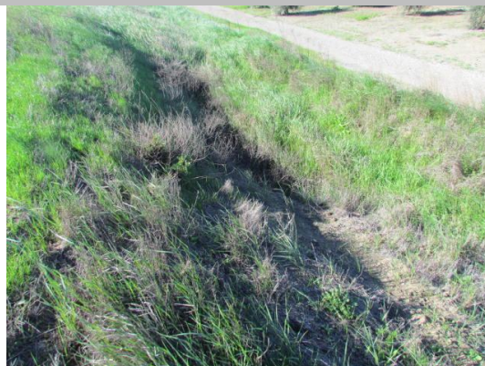
Looking southwest at depression on waterward toe.