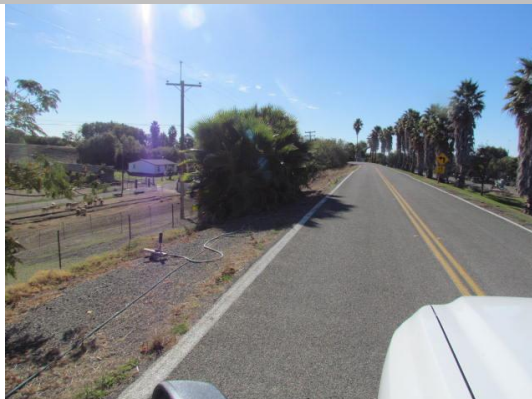
Looking east at maturing plam trees on landward shoulder and slope. (Fall 2014)