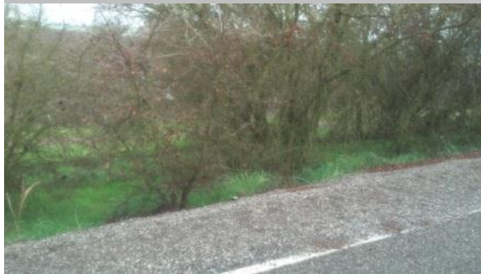
Looking west at dense trees on landside slope and toe.

LS : Land Side N/A : Not Applicable WS : Water Side CR : Crown