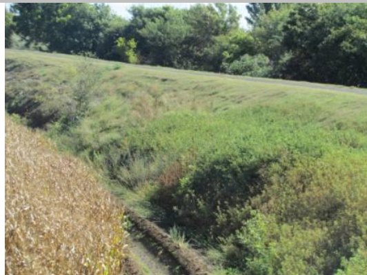
Looking east at dense wild roses on landside toe. (Spring 2011)