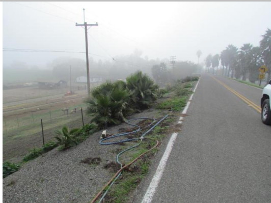
Looking east at newly planted palm trees on landside shoulder and slope.