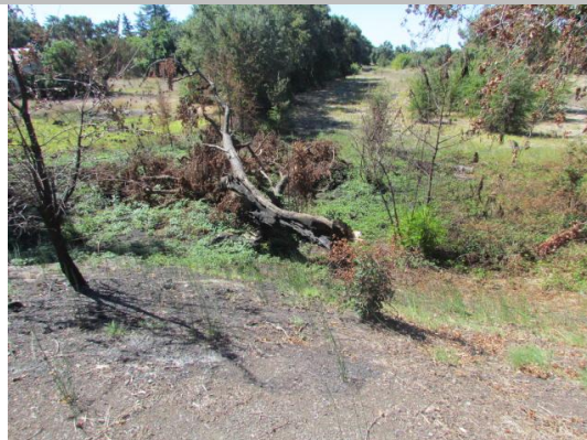
Looking west at dead tree on landward toe and berm.