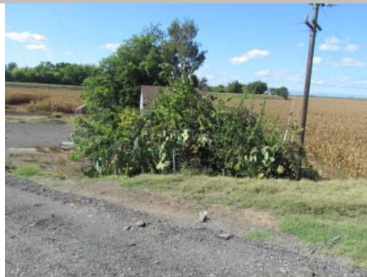
Looking west at dense vegetation on landside slope near ramp. (Spring 2011)