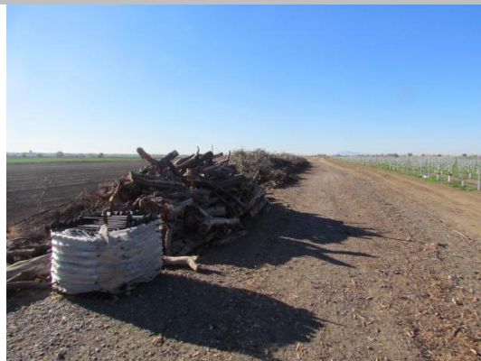
Looking south at pruning piles on landward shoulder. (Fall 2014)

LS : Land Side N/A : Not Applicable WS : Water Side CR : Crown