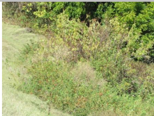
Looking north at wild roses on landside toe. (Spring 2011)