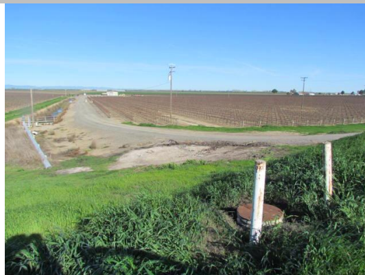
Looking west at burned prunings on landward berm.