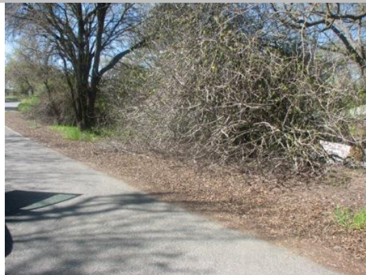
Front view of dense trees at landside shoulder.(Spring 2011)

LS : Land Side N/A : Not Applicable WS : Water Side CR : Crown