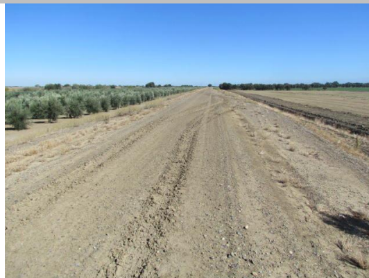
Looking north at rutting on levee crown.