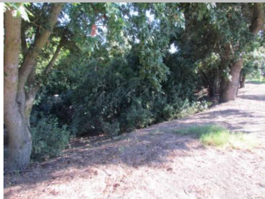
Looking northwest at dense trees on landside slope.(Spring 2011)

* Location LS : Land Side N/A : Not Applicable WS : Water Side CR : Crown