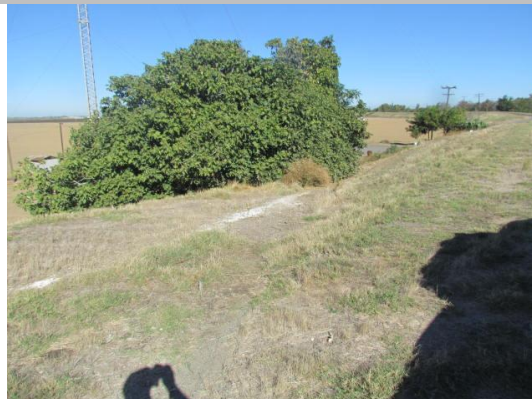
Looking northwest at dense fig tree on landward toe. 2014