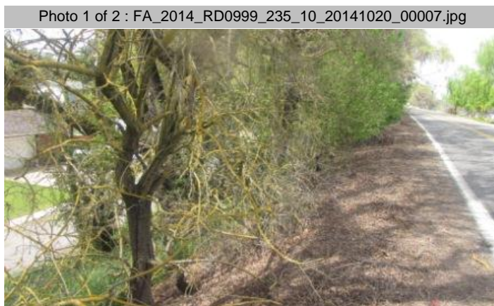
Looking northwest at dense trees on landside slope and toe.