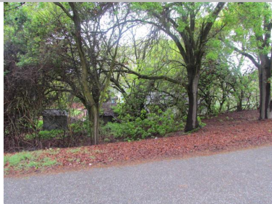
Looking west at trimmed trees on landside slope.(Spring 2012)