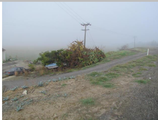
Looking northeast at vegetation on landside slope and toe. (Fall Inspection 2012)