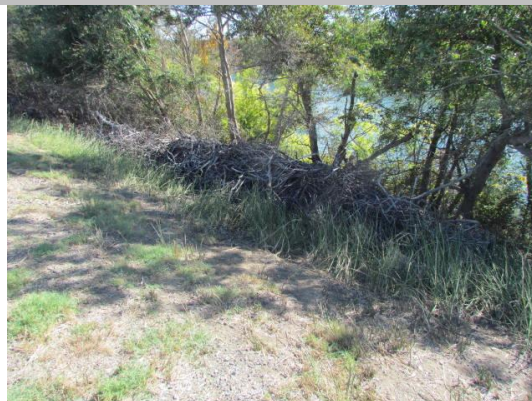
Looking east at prunings on waterward slope.