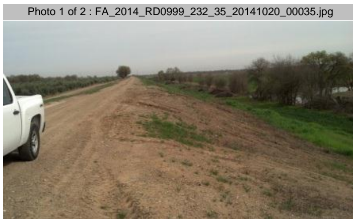
Looking north at slope damage caused by vehicle traffic.