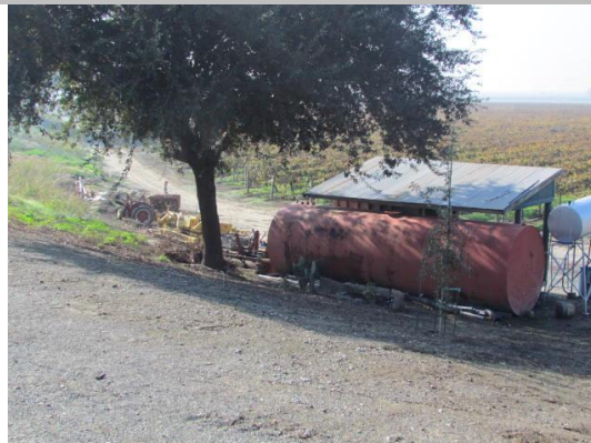
Looking southwest at farm equipment stored at landside toe. (Fall Inspection 2012)