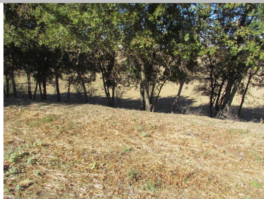
Looking west at trimmed trees at landward toe. (Fall 2014)

LS : Land Side N/A : Not Applicable WS : Water Side CR : Crown