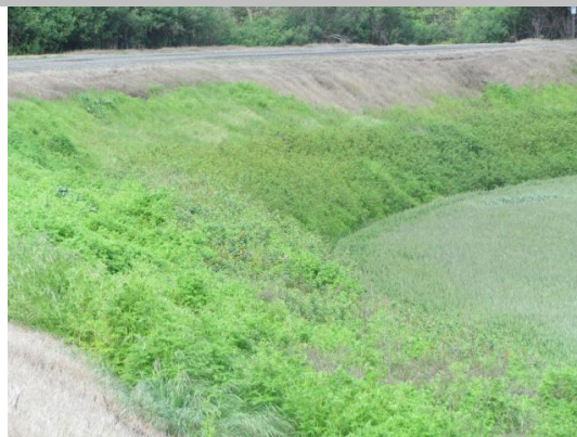
Looking southeast to wild roses on landside slope and toe. (Spring 2012)