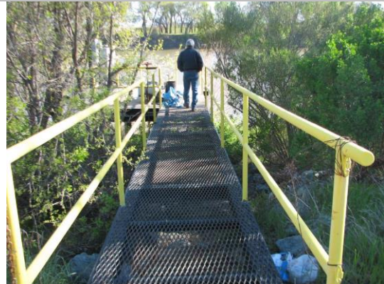
Platform for pump located on waterward side.