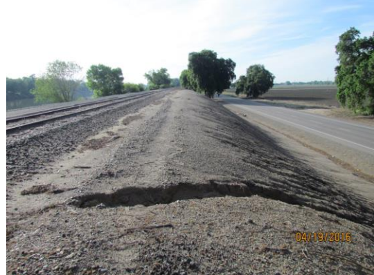
View of the erosion on the landward side of the levee looking downstream. Spring 2016.