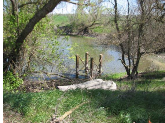
Reminise piles located on landward side.