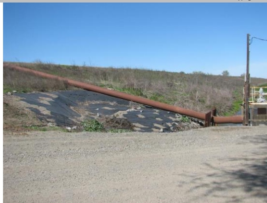
Pipe exposed on landward side.