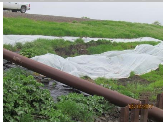
View of erosion and visqueen on landside levee slope. Spring 2017.