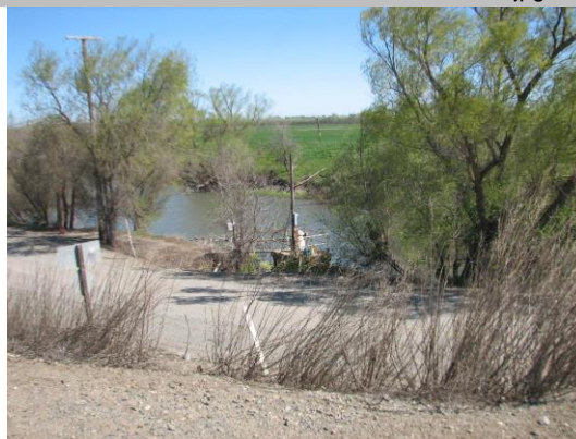
Pump station located on landward side.