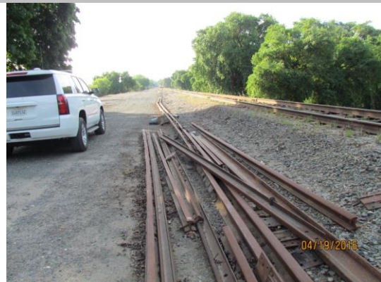
View of the rails on the crown of the levee looking downstream. Spring 2016.