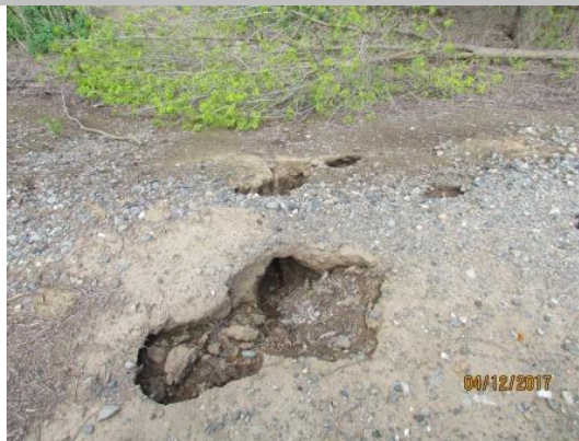
Updated view of erosion on waterside levee slope. Spring 2017.