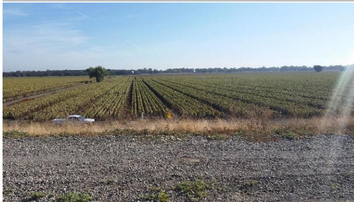
View of LS.