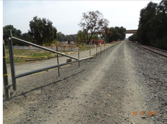
View of fence on crown. Fall 2017.