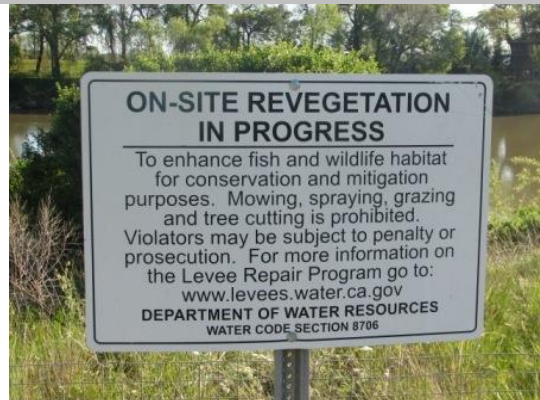
Revegetation site spring 2012.