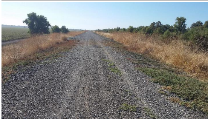
View of levee crown at crossing--yellow flag markers visible on both WS and LS shoulder.