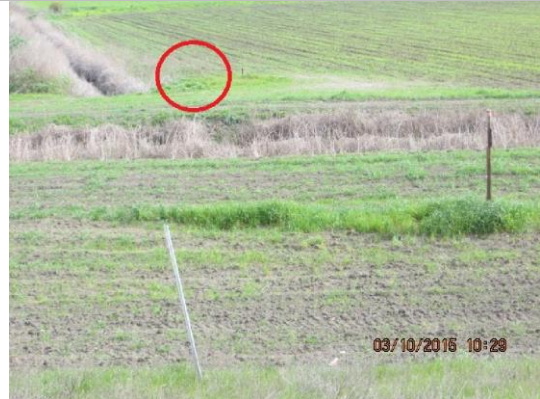
Pipe visible east of ditch approximately 150 ft off LS toe.