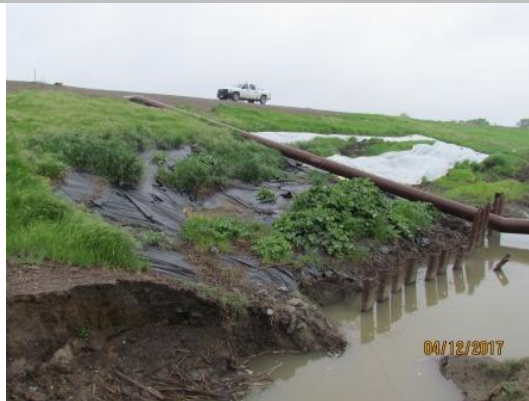
Additional view of erosion on landside levee slope. Spring 2017.