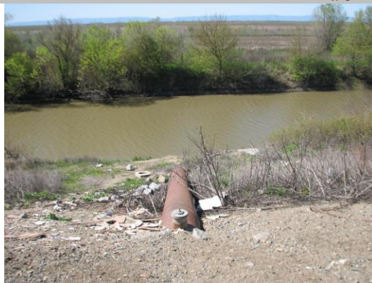
Pipe exposed on waterward side.