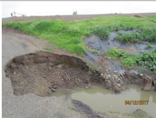
Another view of erosion on landside levee slope. Spring 2017.