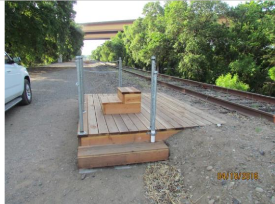
View of the stairs on the crown of the levee looking downstream. Spring 2016.