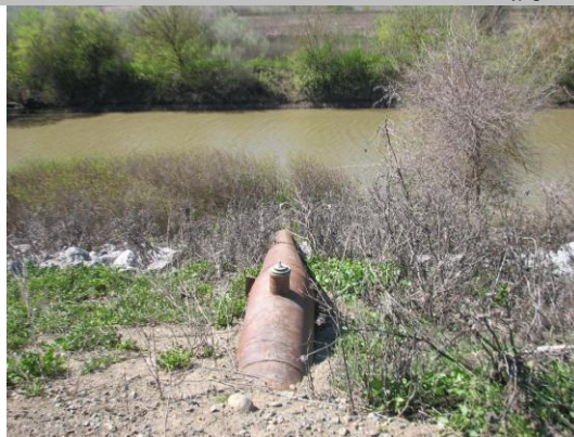
View of pipe visible on waterward side.