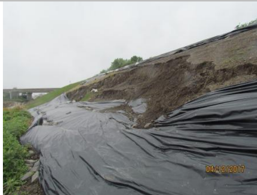
View of sloughing on landside levee slope. LMA placed visqueen to prevent further erosion, which has since fallen down. Spring 2017.