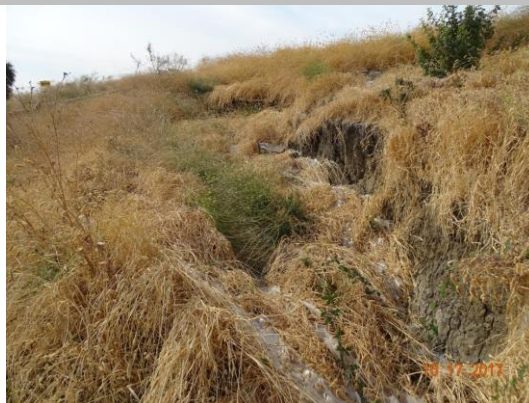
Updated view of sloughing on landside slope. Fall 2017.