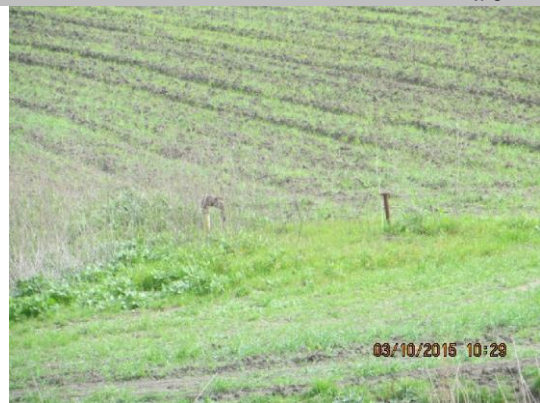
Yellow pipe visible off LS toe.