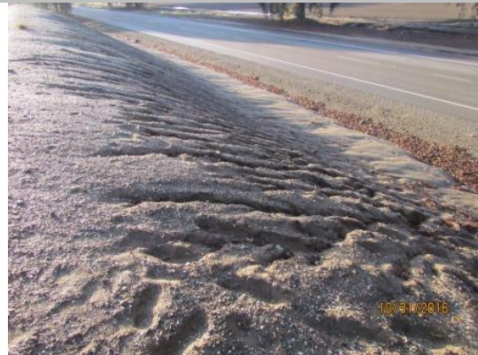
Updated view of runoff erosion site. LS slope. Fall 2016.