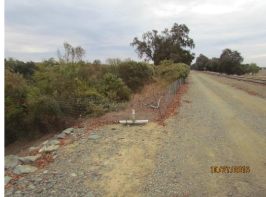
View of the revegetation site on the waterward side of the levee looking downstream. Fall 2015.