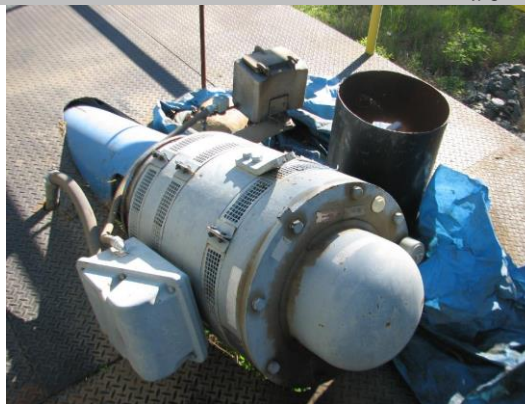
Slant pump located on waterward side.