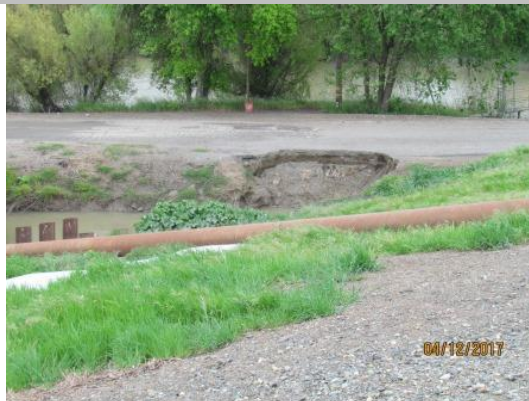
Looking down levee slope. Spring 2017.