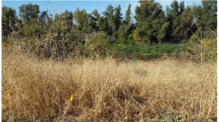
View of WS--Tule Canal.