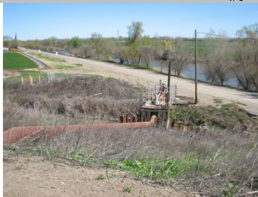
View of landward side.