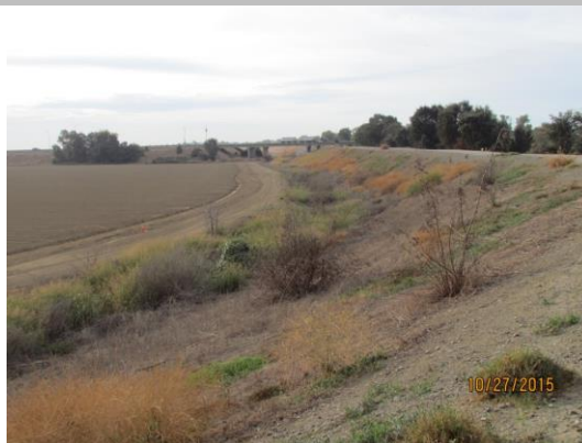
View of the ditch on the landward side of the levee looking downstream. Fall 2015.