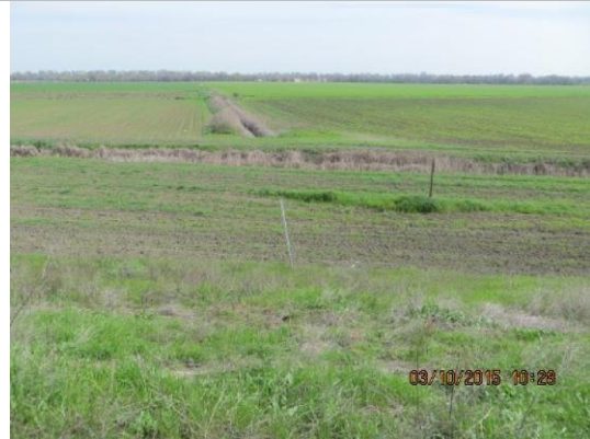
View of LS.