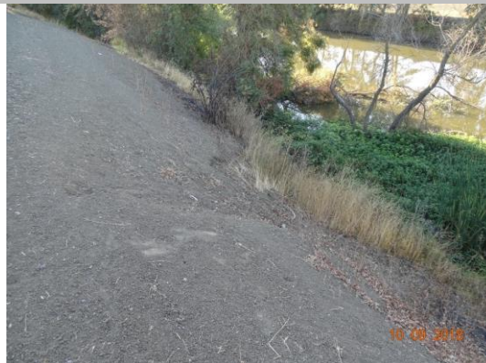
View of erosion, facing downstream. Fall 2018.

LS : Land Side N/A : Not Applicable WS : Water Side CR : Crown