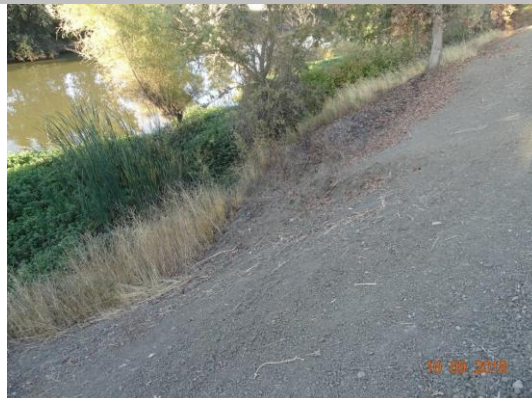
View of erosion on the waterside slope, facing upstream. Fall 2018.