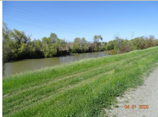
View of vegetation on waterside slope adjacent to waterside toe road. Spring 2020.