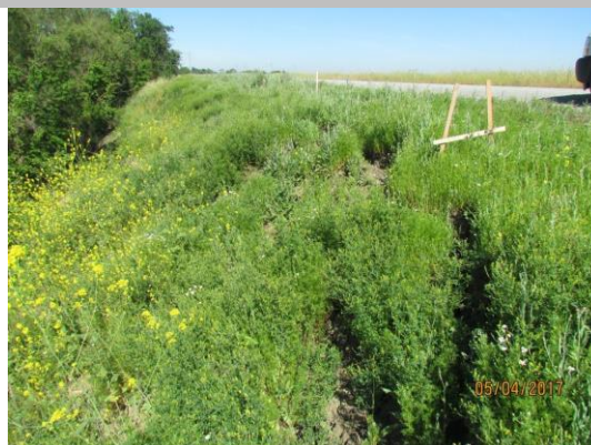
View of sloughing on waterside slope. Spring 2017.