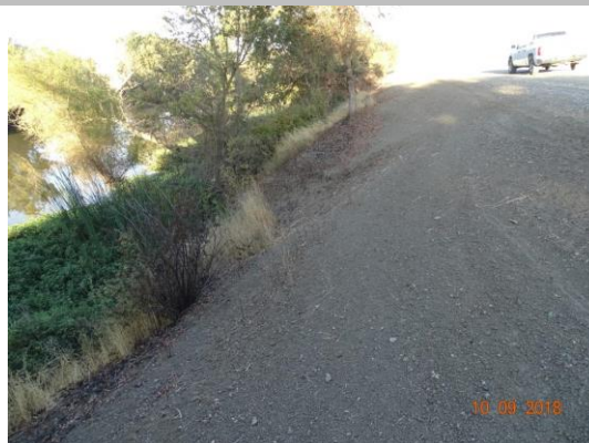
Additional view of erosion, facing upstream. Fall 2018.