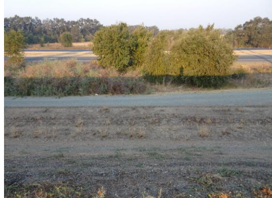
Landside view from crown.