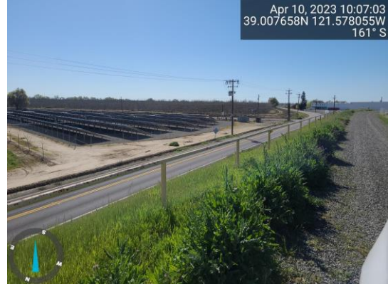
View of annual vegetation on the landside slope, Spring 2023.