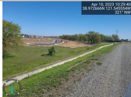
View of annual vegetation on the landside slope, Spring 2023.