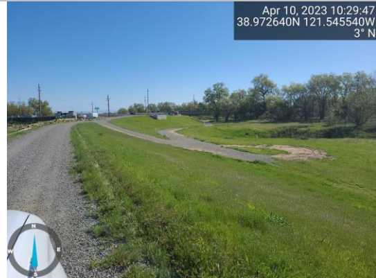
View of annual vegetation on the waterside slope, Spring 2023.