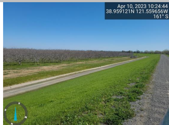
View of annual vegetation on the landside slope, Spring 2023.