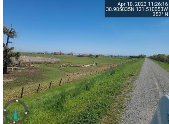
View of annual vegetation on the landside slope, Spring 2023.