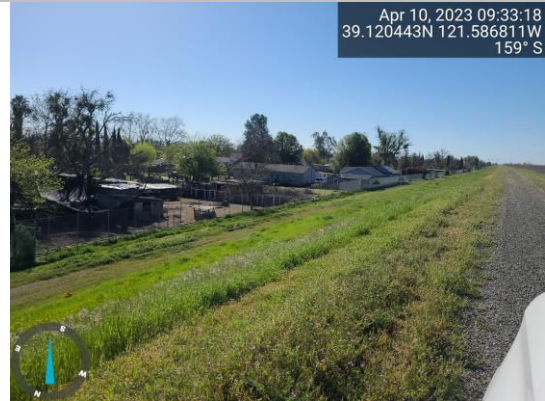
View of annual vegetation on the landside slope, Spring 2023.