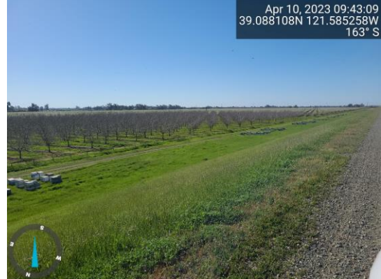
View of annual vegetation on the landside slope, Spring 2023.