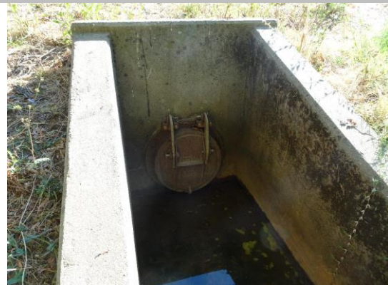
Water-Side: Outlet structure with flap gate at waterside toe.