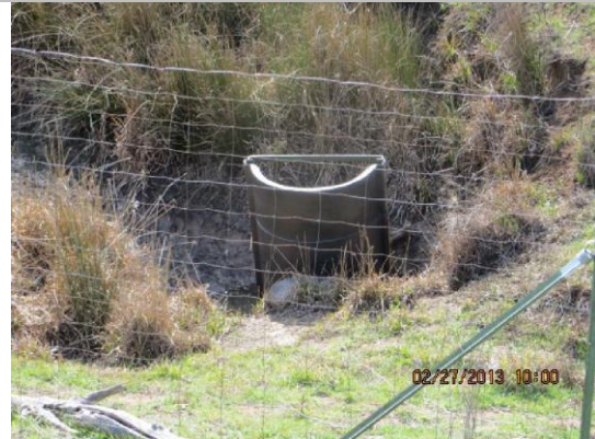
PVC weir inlet on LS toe.