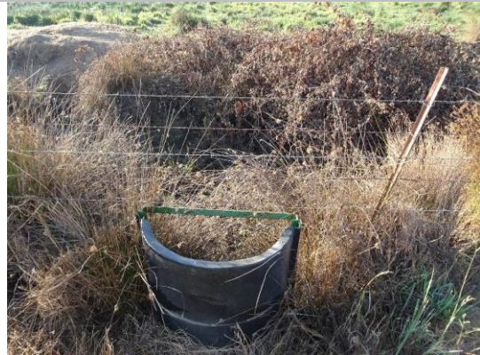
Land-Side: Inlet structure at landside toe.