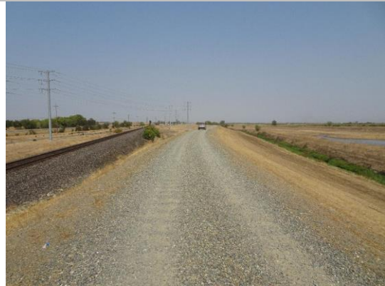
Overview of Levee: looking upstream from the crown.