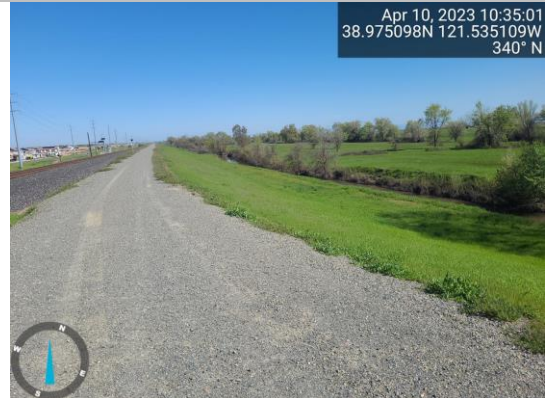
View of annual vegetation on the waterside slope, Spring 2023.