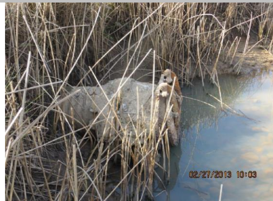
Flap gate at WS toe.