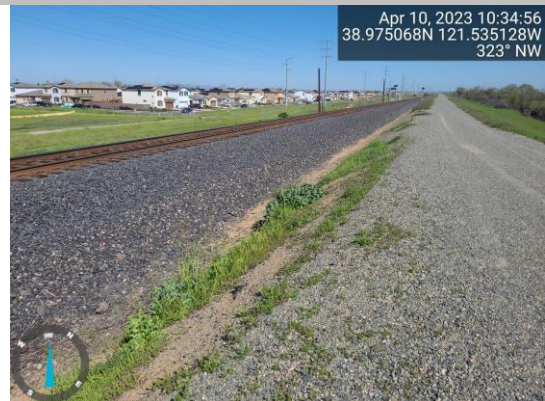
View of annual vegetation on the landside slope, Spring 2023.