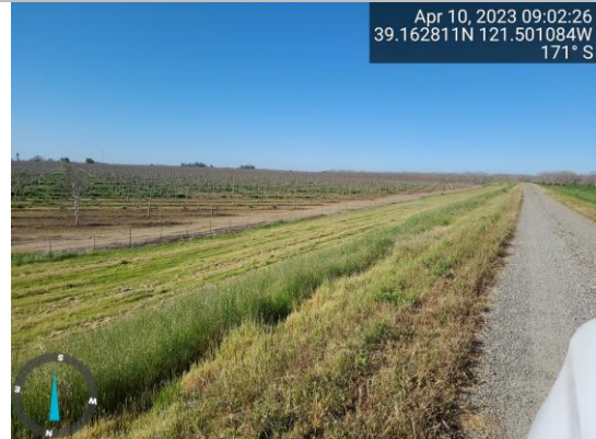
View of annual vegetation on the landside slope, Spring 2023.