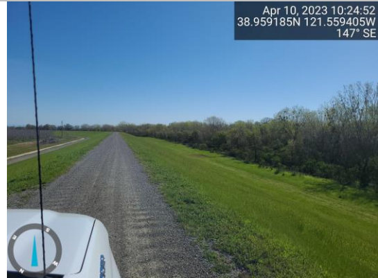
View of annual vegetation on the waterside slope, Spring 2023.