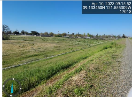
View of annual vegetation on the landside slope, Spring 2023.