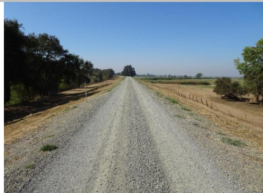
Overview of Levee: Looking downstream from crown.