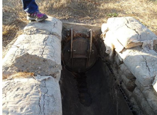
Water-Side: Outlet structure with flap gate at waterside toe.