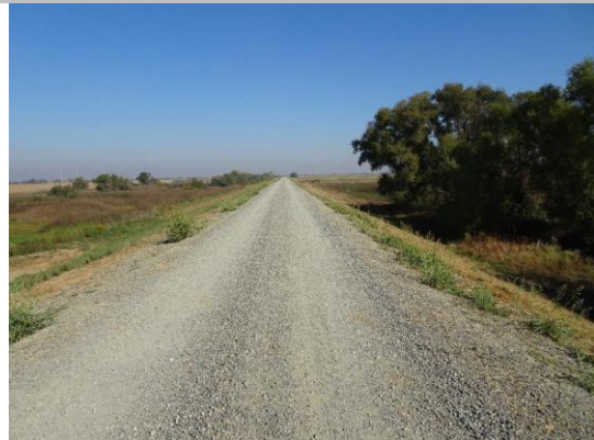
Overview of Levee: Looking upstream from crown.