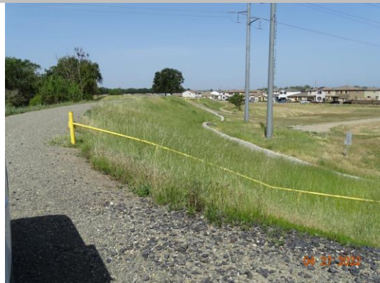
View of annual vegetation on the landside slope, Spring 2022.