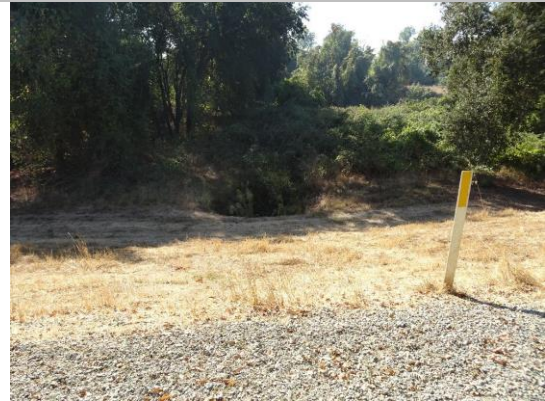
Water-Side: View of waterside looking from crown.