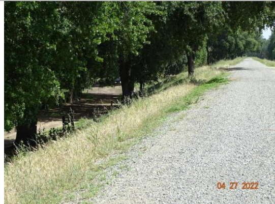
View of annual vegetation on the landside slope, Spring 2022.