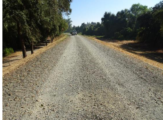
Overview of Levee: Looking upstream from crown.