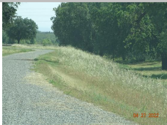
View of annual vegetation on the waterside slope, Spring 2022.

* Location LS : Land Side N/A : Not Applicable WS : Water Side CR : Crown