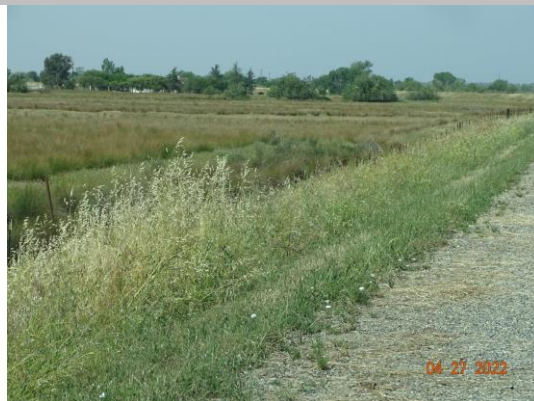
View of annual vegetation on the landside slope, Spring 2022.

* Location LS : Land Side N/A : Not Applicable WS : Water Side CR : Crown