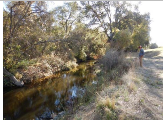
USACE 2018 Erosion Photo #2