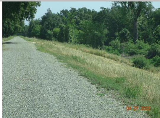
View of annual vegetation on the waterside slope, Spring 2022.