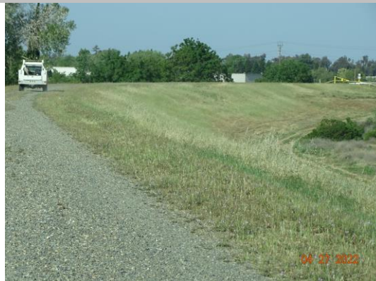
View of vegetation on the waterside slope, Spring 2022.