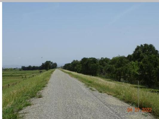
View of annual vegetation on the waterside slope, Spring 2022.

* Location LS : Land Side N/A : Not Applicable WS : Water Side CR : Crown