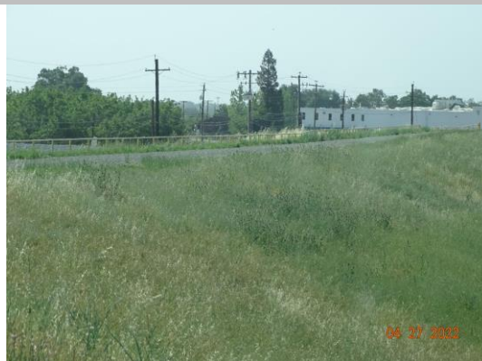
View of annual vegetation on the waterside slope, Spring 2022.

* Location LS : Land Side N/A : Not Applicable WS : Water Side CR : Crown