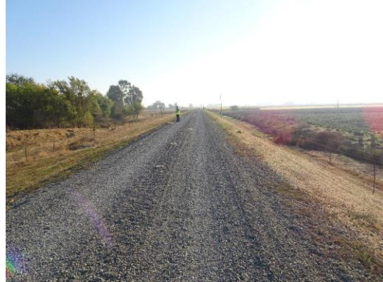
Overview of Levee: Looking upstream from crown.