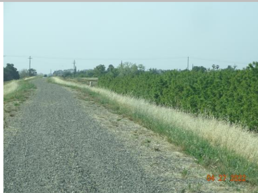
View of annual vegetation on the waterside slope, Spring 2022.