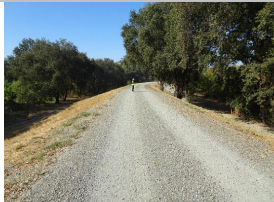
Overview of Levee: Looking downstream from crown.