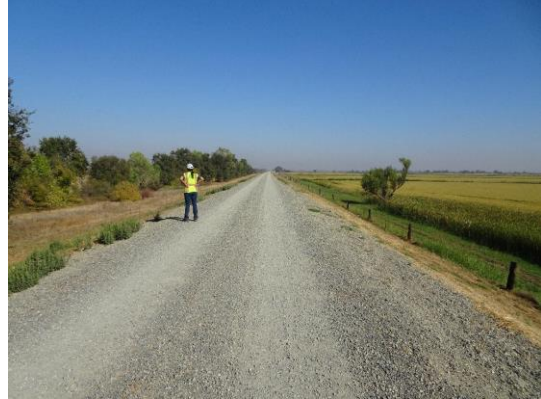
Overview of Levee: Looking upstream from crown.