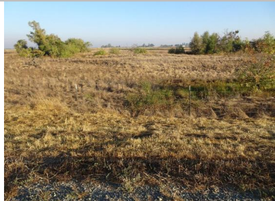
Water-Side: View from crown. Outlet not visible.