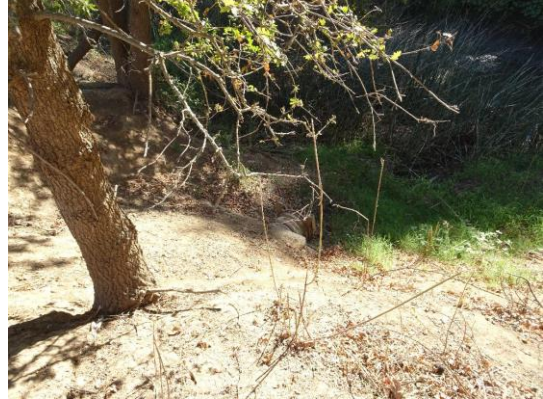
Water-Side: Headwall, outlet, and flap gate on waterside.