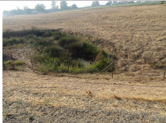
Land-Side: Inlet structure at landside toe.