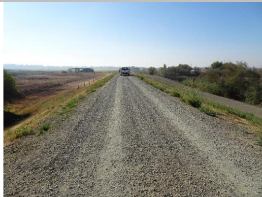
Overview of Levee: Looking downstream from crown.