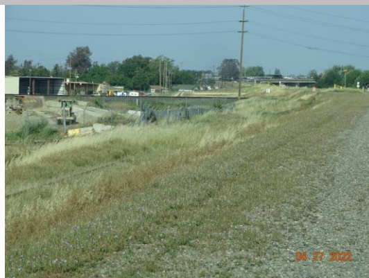
View of annual vegetation on the landside slope, Spring 2022.

* Location LS : Land Side N/A : Not Applicable WS : Water Side CR : Crown