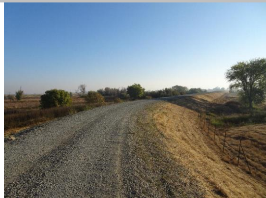
Overview of Levee: Looking upstream from crown.