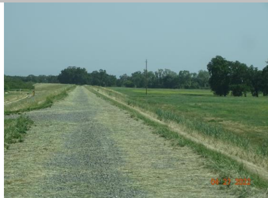
View of annual vegetation on the waterside slope, Spring 2022.