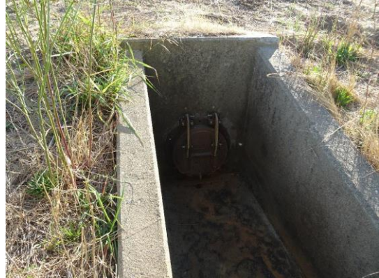
Water-Side: Outlet structure with flap gate at waterside toe.