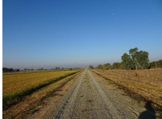
Overview of Levee: Looking downstream from crown.