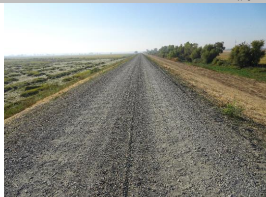
Overview of Levee: Looking downstream from crown.