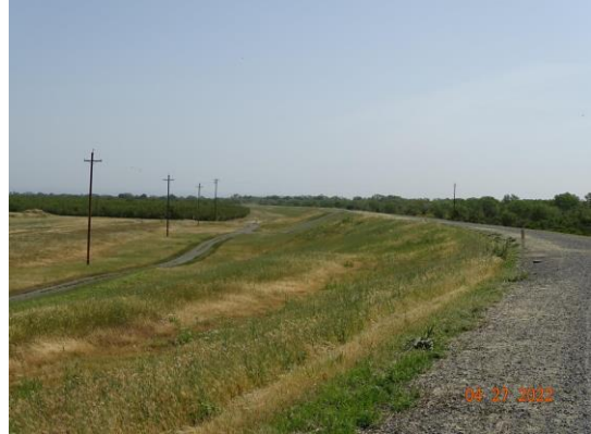
View of annual vegetation on the landside slope, Spring 2022.