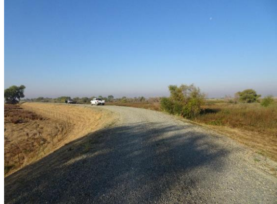
Overview of Levee: Looking downstream from crown.