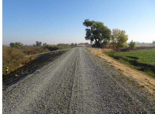
Overview of Levee: Looking upstream from crown.