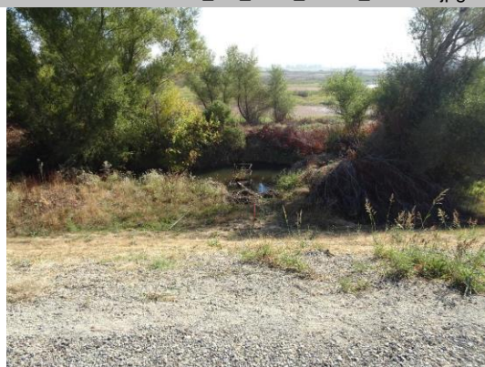
Land-Side: Drop inlet at landside toe.