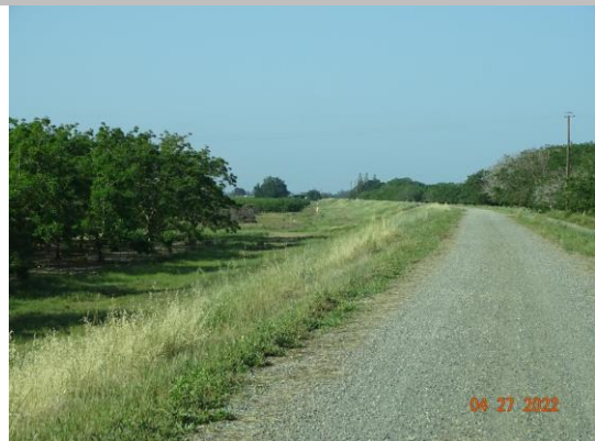
View of annual vegetation on the landside slope, Spring 2022.