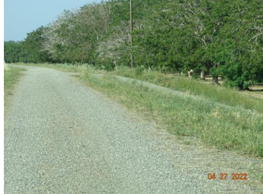
View of annual vegetation on the waterside slope, Spring 2022.