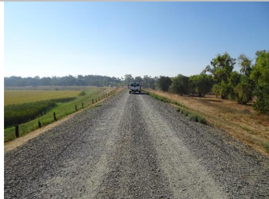
Overview of Levee: Looking downstream from crown.