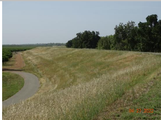
View of annual vegetation on the landside slope, Spring 2022.