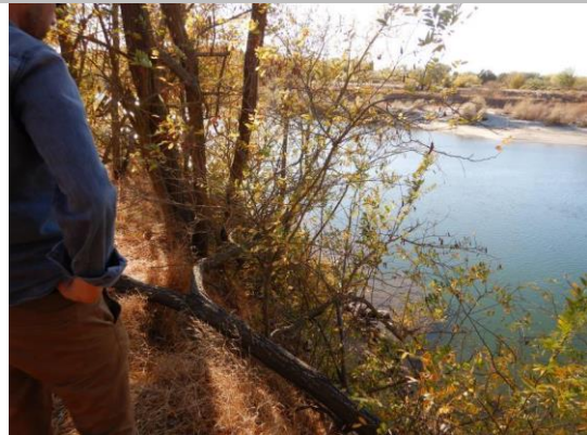
USACE 2018 Erosion Photo #2