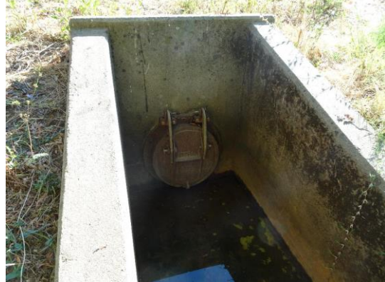
Water-Side: Outlet structure with flap gate at waterside toe.