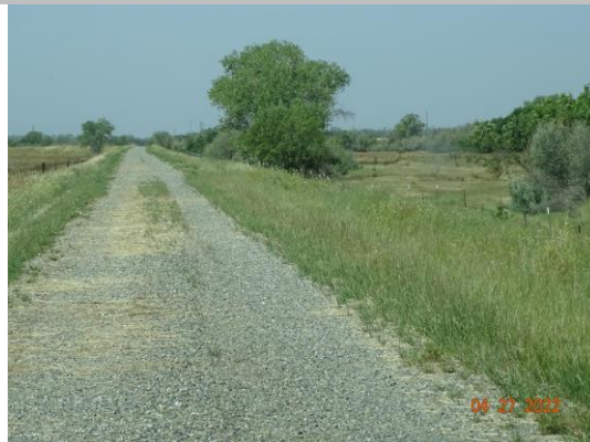
View of annual vegetation on the waterside slope, Spring 2022.