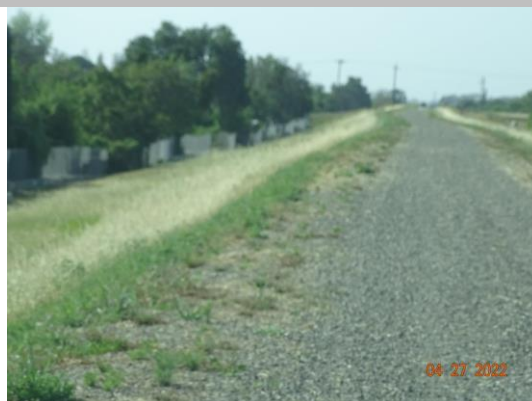
View of annual vegetation on the landside slope, Spring 2022.

* Location LS : Land Side N/A : Not Applicable WS : Water Side CR : Crown