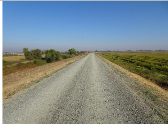
Overview of Levee: Looking upstream from crown.