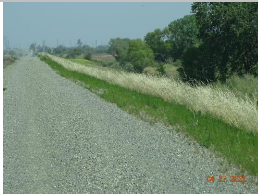
View of annual vegetation on the waterside slope, Spring 2022.