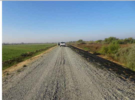
Overview of Levee: Looking downstream from crown.