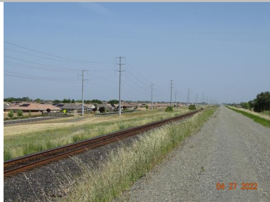
View of annual vegetation on the landside slope, Spring 2022.