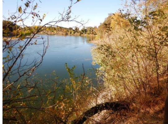
USACE 2018 Erosion Photo #1