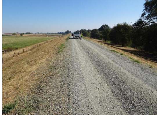
Overview of Levee: Looking upstream from crown.