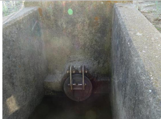
Water-Side: Outlet structure with flap gate at waterside toe.