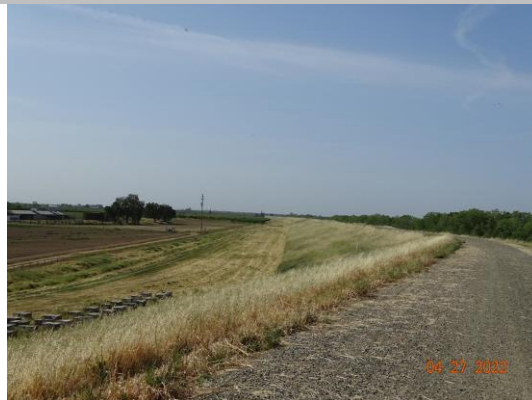
View of annual vegetation on the landside slope, Spring 2022.