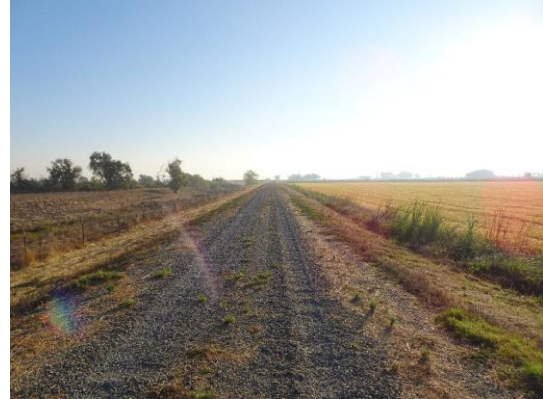
Overview of Levee: Looking upstream from crown.