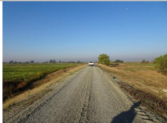
Overview of Levee: Looking downstream from crown.