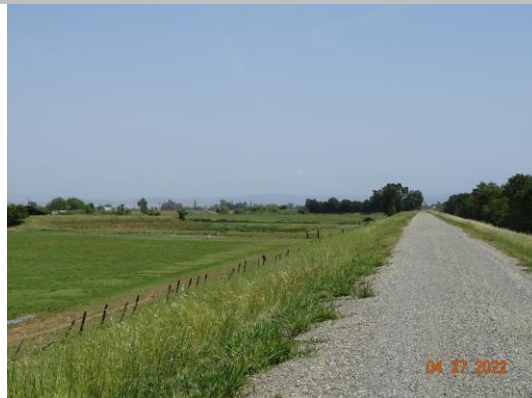
View of annual vegetation on the landside slope, Spring 2022.