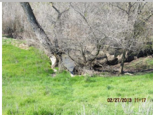
Concrete U-shaped outlet on WS toe.