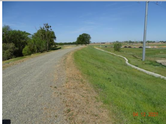
View of annual vegetation on landside slope, Spring 2021.