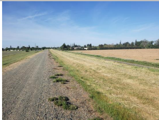
View of annual vegetation on waterside levee slope, Spring 2021.