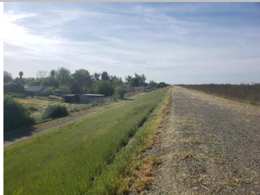
View of annual vegetation on landside slope, Spring 2021.