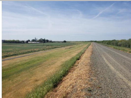
View of annual vegetation on landside slope, Spring 2021.