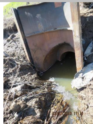
inlet control structure on LS toe.