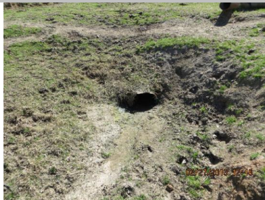
Partially clogged inlet pipe at LS toe.