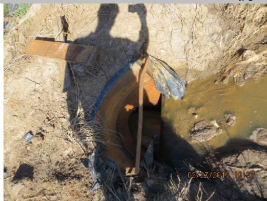
Inlet with PVC weir on LS toe.