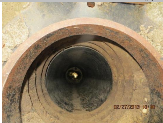
Pipe showing sliplined PVC insert. some erosion of PV at outlet and it may be disjointed internally.