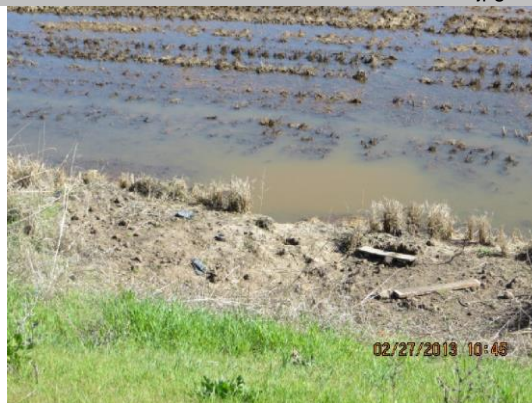
Debris covered inlet on LS toe.