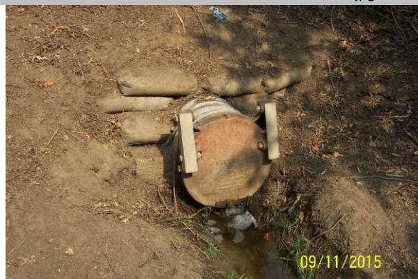
Flap Gate is clear as of 9/11/15.