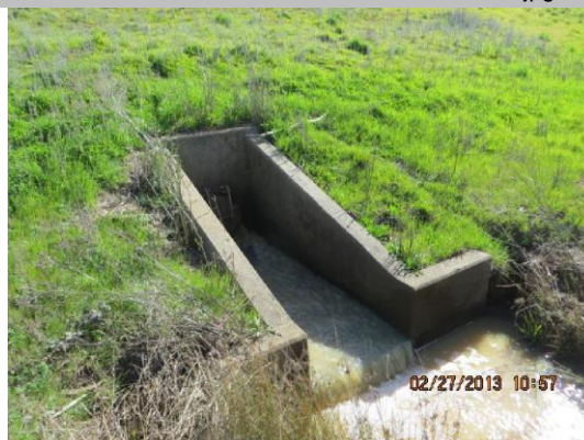
Concrete U-shaped headwall and flap gate on WS toe.