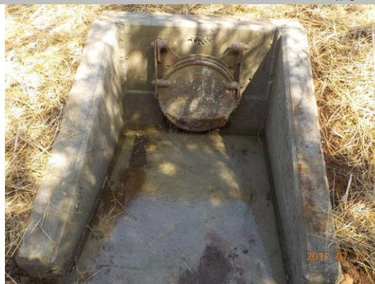
Concrete collar completed around the waterside exterior flap gate section.