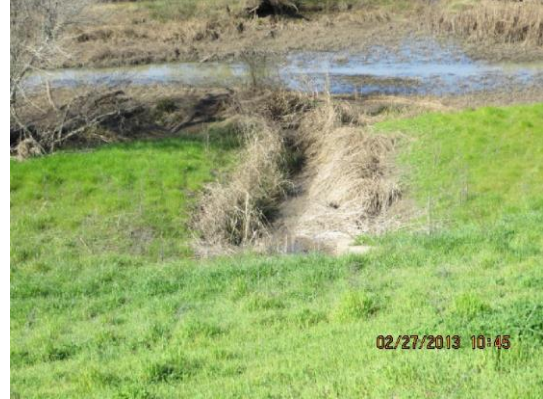
Drainage outlet on WS toe.