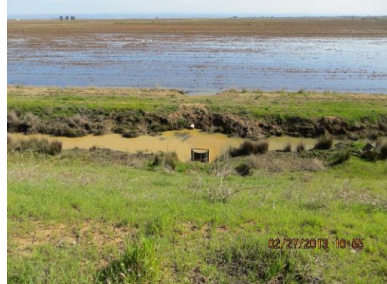
Pvc weir on inlet at LS toe.