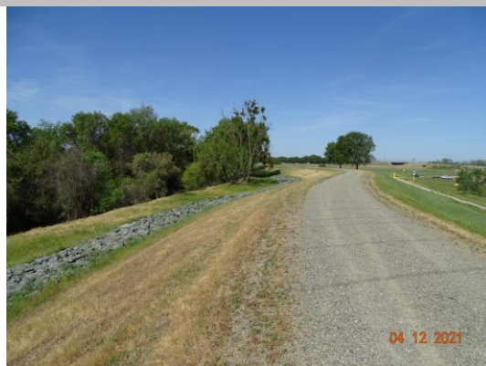
View of annual vegetation on waterside slope, Spring 2021.

* Location LS : Land Side N/A : Not Applicable WS : Water Side CR : Crown