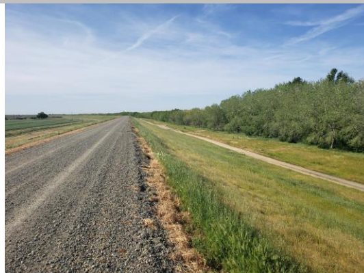
View of annual vegetation on waterside slope, Spring 2021.

* Location LS : Land Side N/A : Not Applicable WS : Water Side CR : Crown