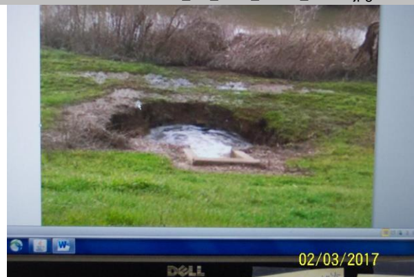
After photo after excess pipe was cut off. Actual photo date was 1/31/2017