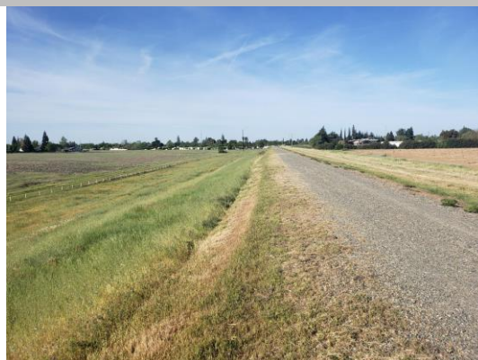
View of annual vegetation on landside levee slope, Spring 2021.

* Location LS : Land Side N/A : Not Applicable WS : Water Side CR : Crown