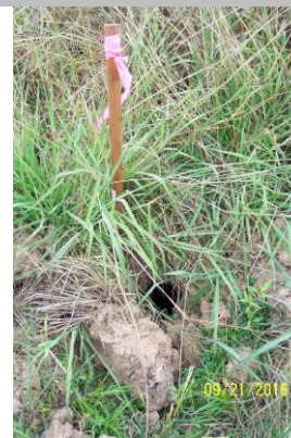
Possible location of the inlet on the LS toe