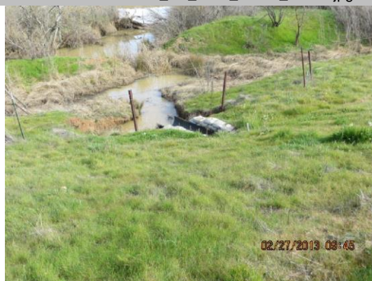
Concrete outlet on WS toe.