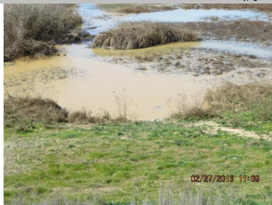
Outlet with riprap on WS toe.