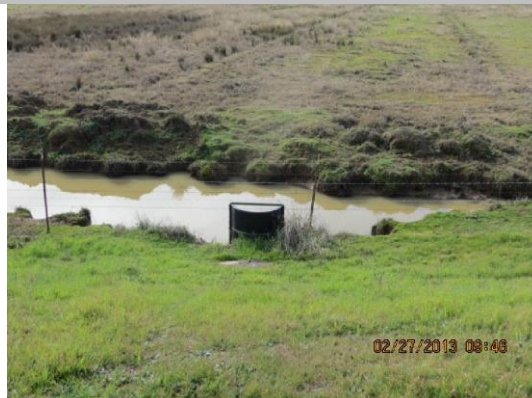
PVC weir at inlet on LS toe.