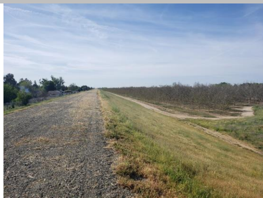
View of annual vegetation on waterside slope, Spring 2021.

* Location LS : Land Side N/A : Not Applicable WS : Water Side CR : Crown