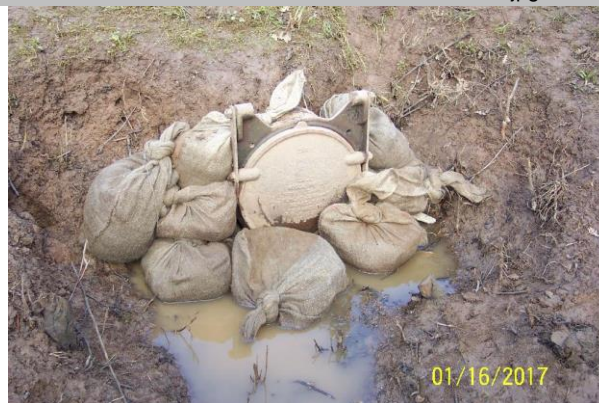
Sandbags temporarily placed in front of flapgate.