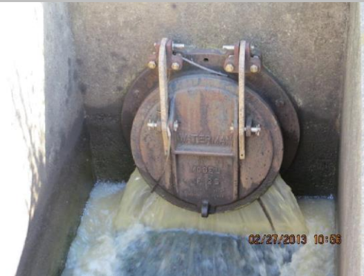
Concrete U-shaped headwall and flap gate on WS toe.