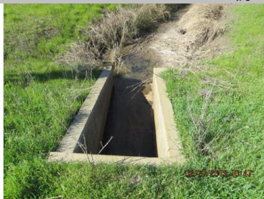
Concrete U-shaped outlet and flap-gate on WS toe.