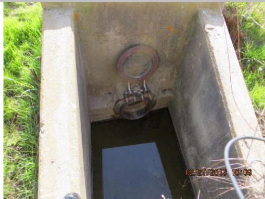
Concrete U-shaped headwall and flap gate on WS toe.