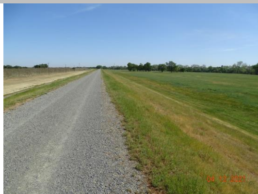
View of annual vegetation on waterside slope, Spring 2021.

* Location LS : Land Side N/A : Not Applicable WS : Water Side CR : Crown