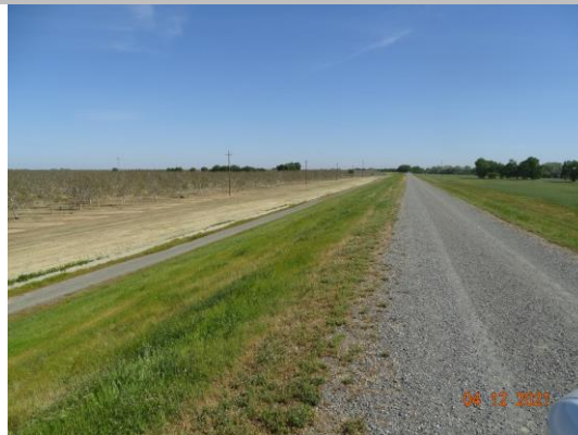
View of annual vegetation on landside slope, Spring 2021.