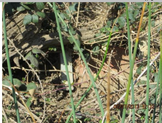
Flap gate blocked by vegetation at WS.