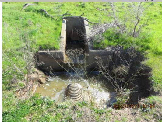
Concrete U-shaped headwall on WS toe with Flap gate showing erosion at outlet.