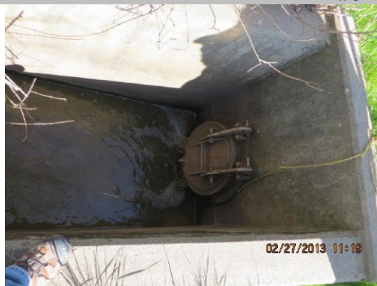
Concrete U-shaped outlet with flap gate on WS toe.