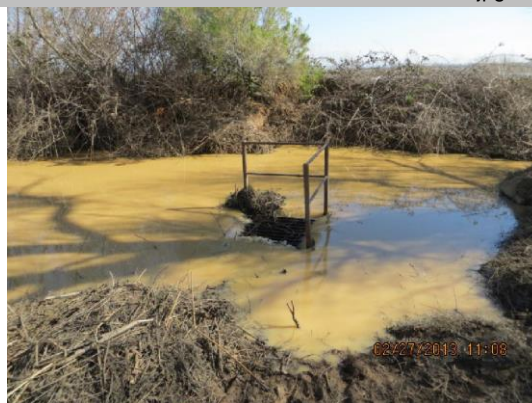
Concrete drop-inlet at LS toe.