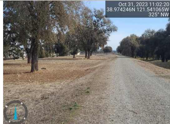
View of annual vegetation on the landside slope, Fall 2023.