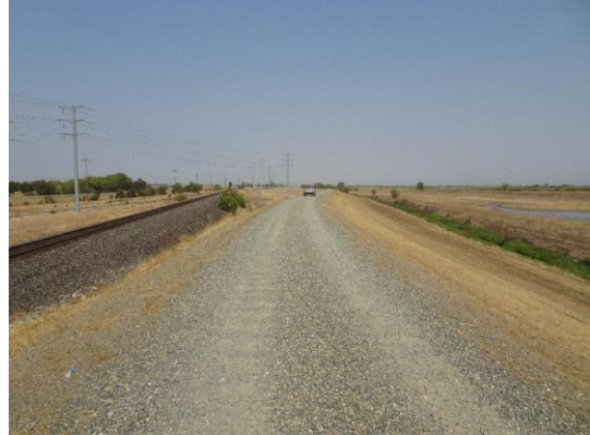
Overview of Levee: looking upstream from the crown.