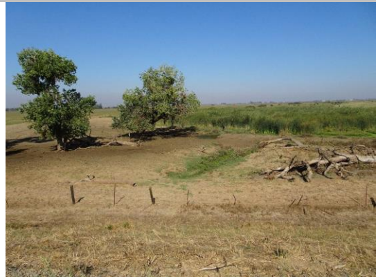
Land-Side: Inlet channel and pipe debris on landside.