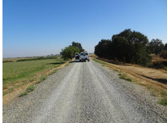
Overview of Levee: Looking upstream from crown.