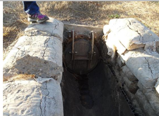
Water-Side: Outlet structure with flap gate at waterside toe.