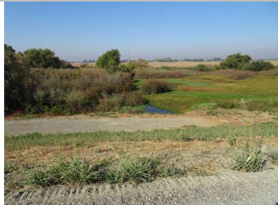
Water-Side: Outlet underwater at waterside toe.