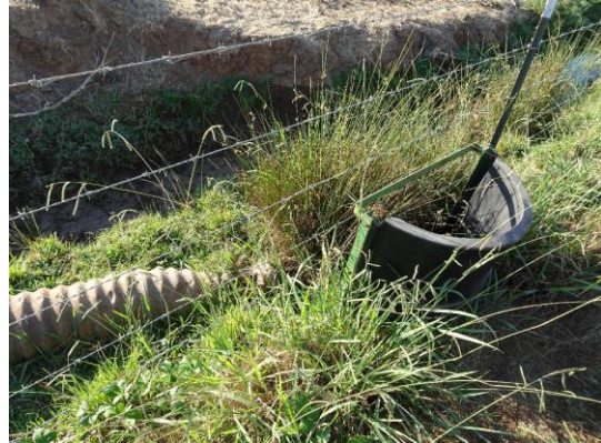
Land-Side: Inlet structure at landside toe.