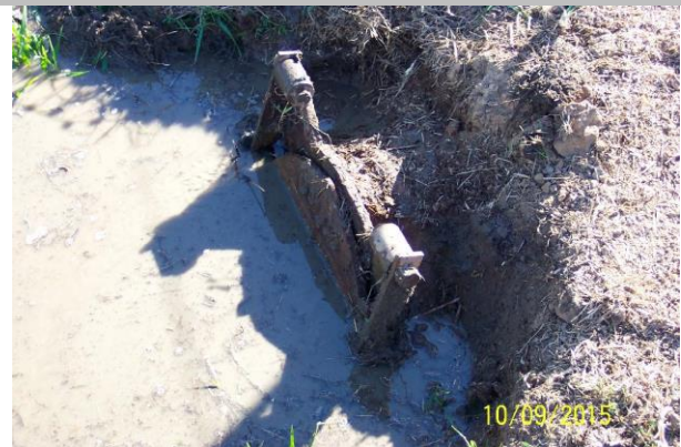
Flap gate at waterside toe partially under water