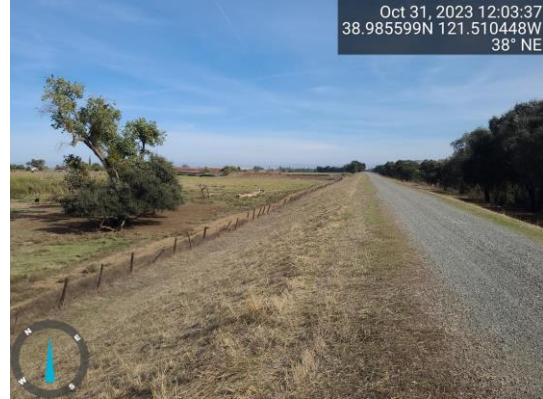
View of annual vegetation on the landside slope, Fall 2023.