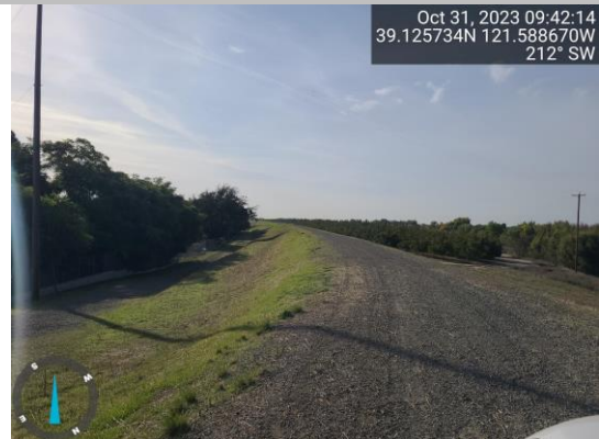
View of annual vegetation on the landside slope, Fall 2023.