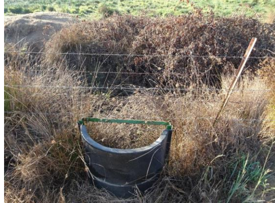
Land-Side: Inlet structure at landside toe.