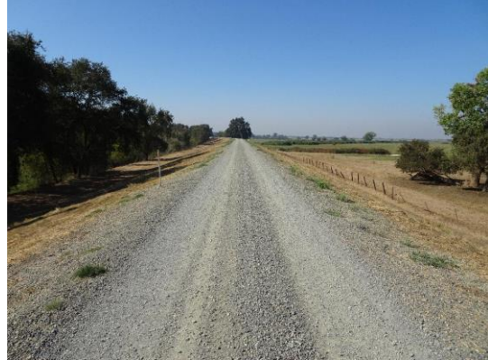
Overview of Levee: Looking downstream from crown.