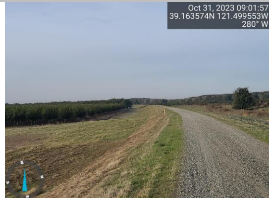
View of annual vegetation on the landside slope, Fall 2023.