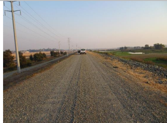
Overview of Levee: looking upstream from crown.