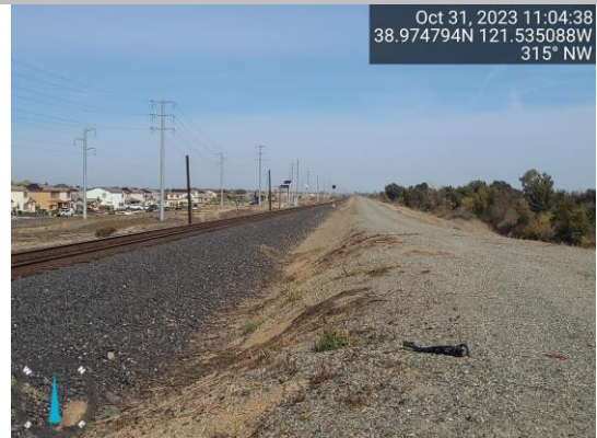
View of annual vegetation on the landside slope, Fall 2023.