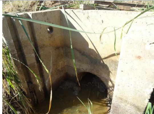
Land-Side: Inlet structure with open pipe at landside toe.