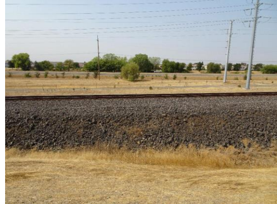
View of landside from crown, no indicator of pipe.