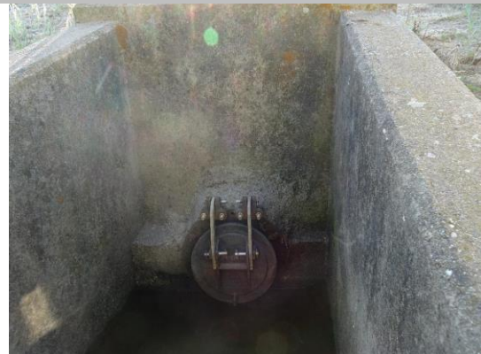
Water-Side: Outlet structure with flap gate at waterside toe.