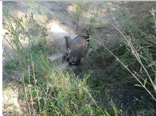
Water-Side: Pipe outlet and flap gate at waterside toe.