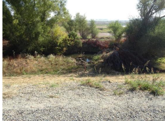
Land-Side: Drop inlet at landside toe.