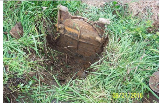
Flap gate on the WS toe is exposed