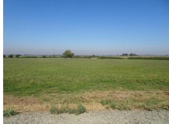
Land-Side: View of landside looking from crown.