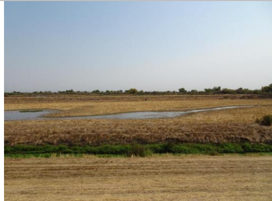
View of waterside from crown, no indicator of pipe.