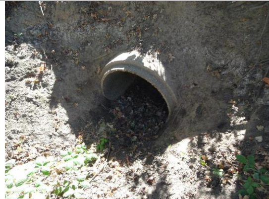
Land-Side: Pipe inlet beyond landside toe.