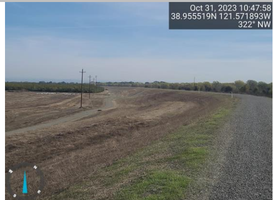
View of annual vegetation on the landside slope, Fall 2023.