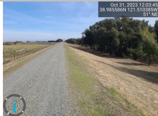
View of annual vegetation on the waterside slope, Fall 2023.