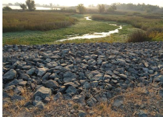
Waterside view from crown. Riprap on slope.