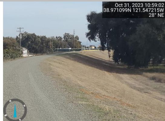
View of annual vegetation in the waterside slope, Fall 2023.