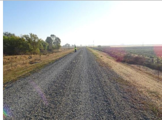
Overview of Levee: Looking upstream from crown.