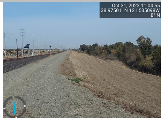
View of annual vegetation on the waterside slope, Fall 2023.