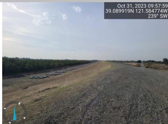
View of vegetation on the landside slope, Fall 2023.