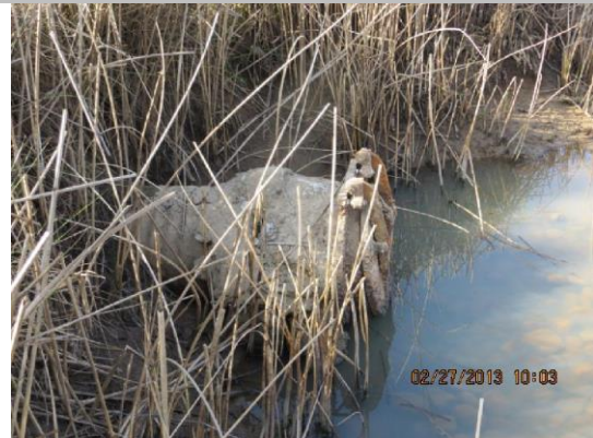
Flap gate at WS toe.