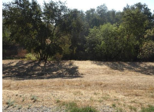
Water-Side: View of waterside looking from crown.