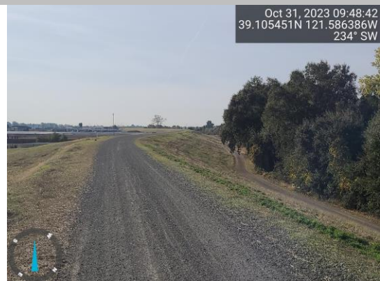
View of annual vegetation on the waterside slope, Fall 2023.