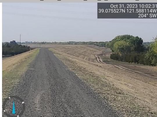
View of annual vegetation on the waterside slope, Fall 2023.