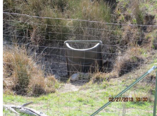
PVC weir inlet on LS toe.