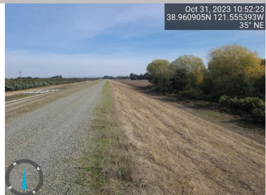
View of annual vegetation on the waterside slope, Fall 2023.