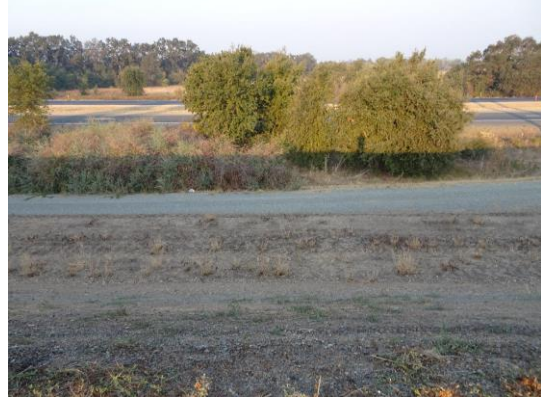
Landside view from crown.