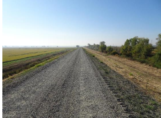
Overview of Levee: Looking downstream from crown.