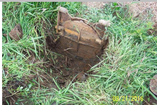
Flap gate on the WS toe is exposed