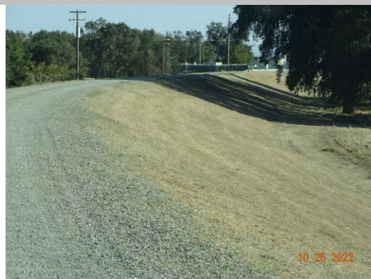
Annual vegetation is well maintained, Fall 2022.