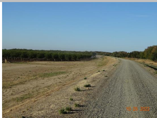
Annual vegetation is well maintained, Fall 2022.