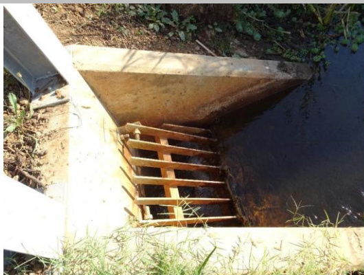
Land-Side: Inlet structure with grate at landside toe.