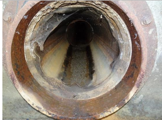
Water-Side: View of pipe lining material.