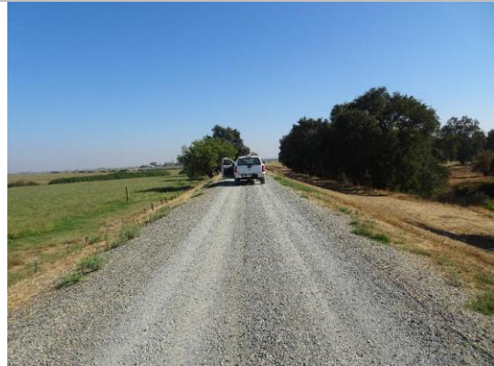
Overview of Levee: Looking upstream from crown.