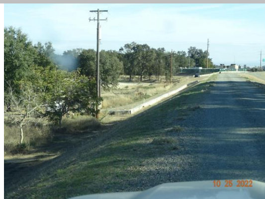
Annual vegetation is well maintained, Fall 2022.