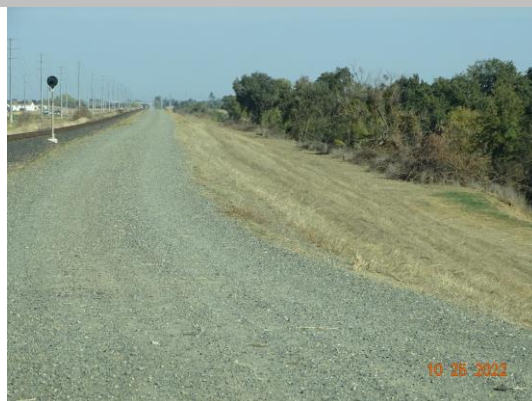
Annual vegetation is well maintained, Fall 2022.