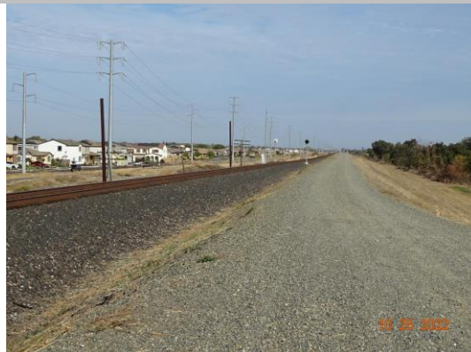
Annual vegetation is well maintained, Fall 2022.