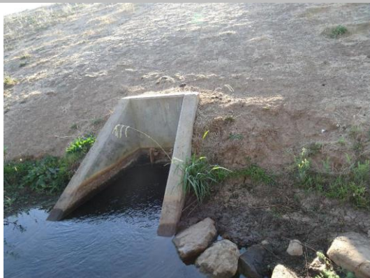
Water-Side: Outlet structure with flap gate at waterside toe.