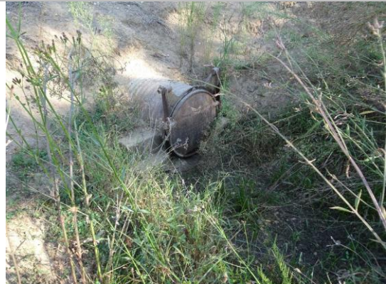
Water-Side: Pipe outlet and flap gate at waterside toe.