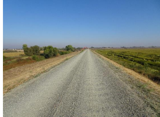
Overview of Levee: Looking upstream from crown.