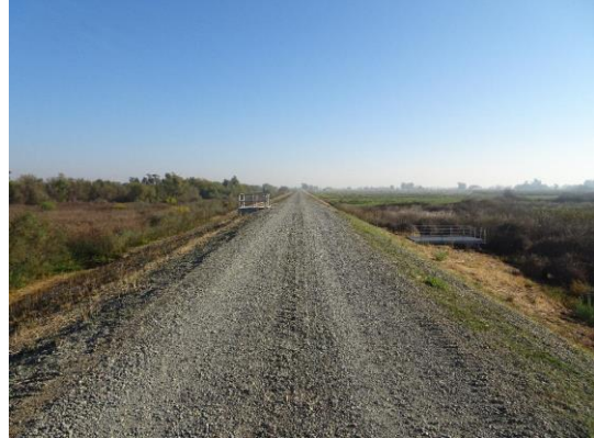
Overview of Levee: Looking upstream from crown.