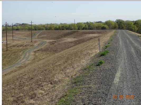
Annual vegetation is well maintained, Fall 2022.