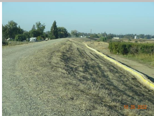
View of annual vegetation on waterside slope, Fall 2022.

* Location LS : Land Side N/A : Not Applicable WS : Water Side CR : Crown