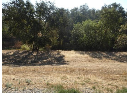
Water-Side: View of waterside looking from crown.