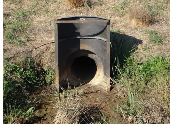
Land-Side: Inlet at landside toe.