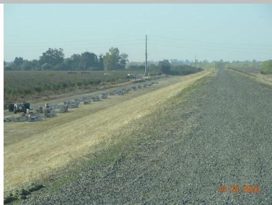
Annual vegetation is well maintained, Fall 2022.