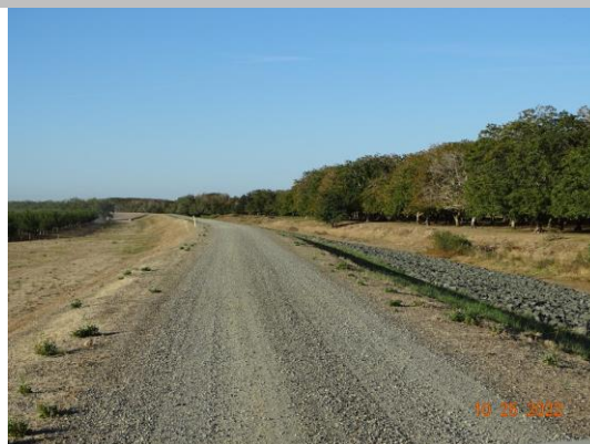
Annual vegetation is well maintained, Fall 2022.

* Location LS : Land Side N/A : Not Applicable WS : Water Side CR : Crown