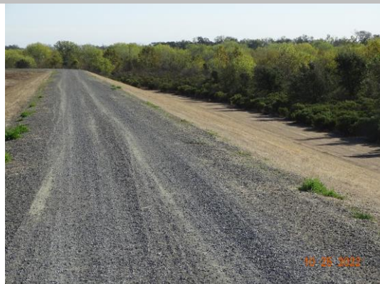
Annual vegetation is well maintained, Fall 2022.