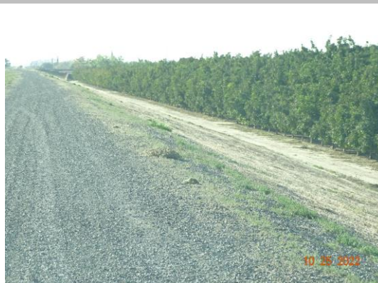
Annual vegetation is well maintained, Fall 2022.