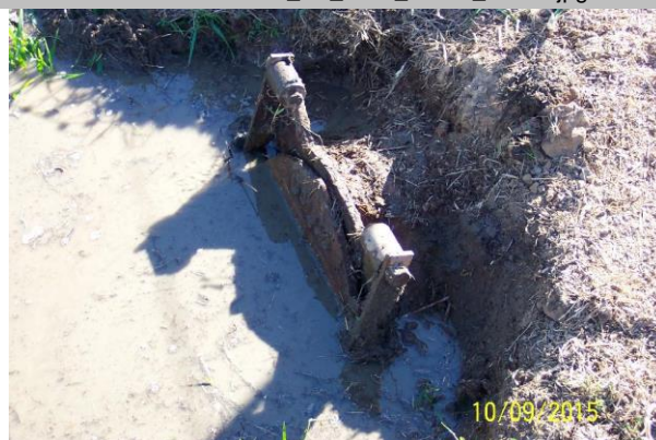
Flap gate at waterside toe partially under water