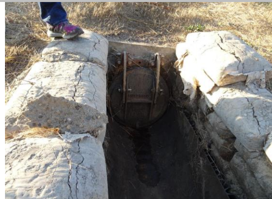
Water-Side: Outlet structure with flap gate at waterside toe.