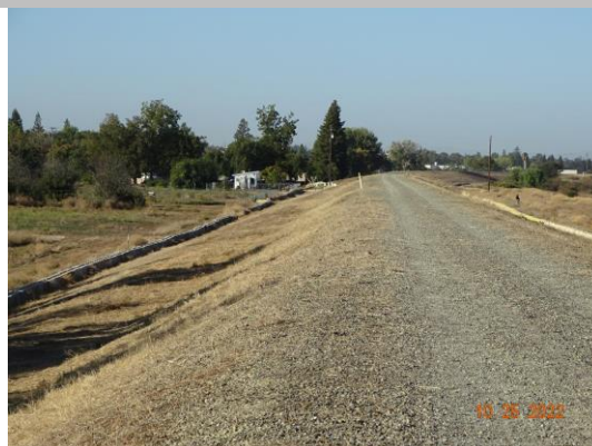
View of annual vegetation on landside slope, Fall 2022.