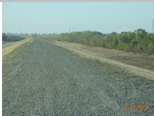
Annual vegetation is well maintained, Fall 2022.