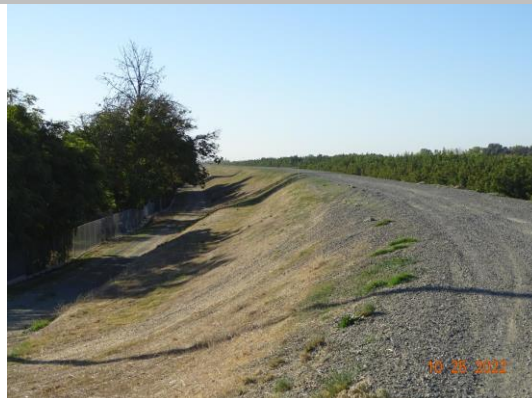
Annual vegetation is well maintained, Fall 2022.