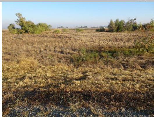
Water-Side: View from crown. Outlet not visible.