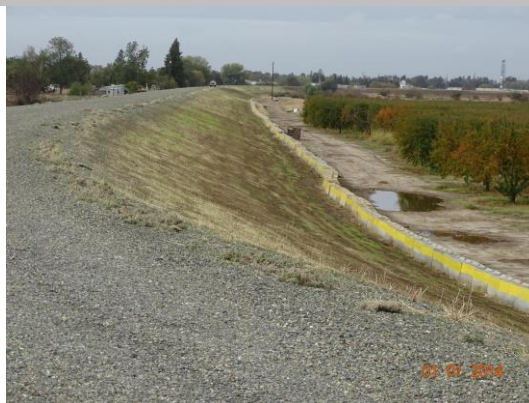
View of the well maintained annual vegetation, Fall 2021.