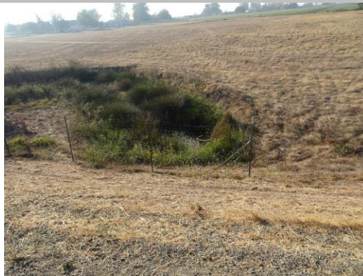
Land-Side: Inlet structure at landside toe.