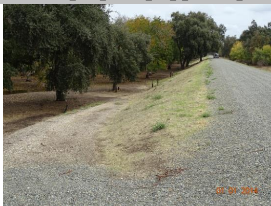
View of the well maintained annual vegetation, Fall 2021.