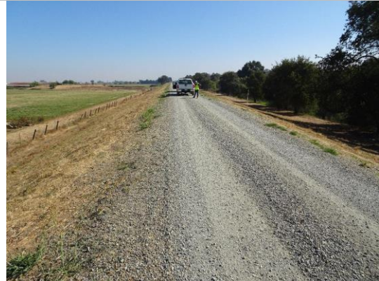
Overview of Levee: Looking upstream from crown.