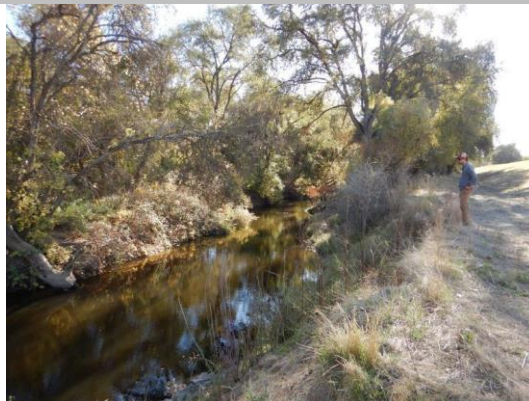
USACE 2018 Erosion Photo #2