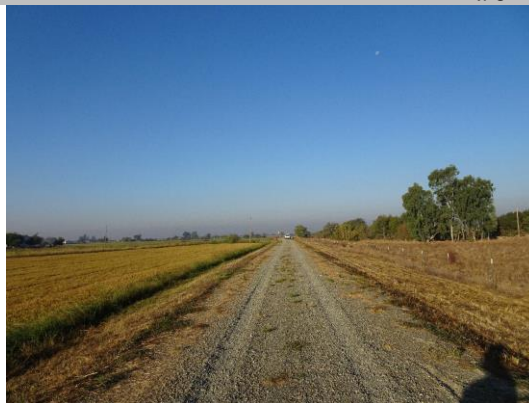
Overview of Levee: Looking downstream from crown.