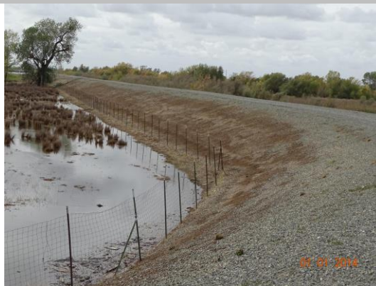
View of the well maintained annual vegetation, Fall 2021.