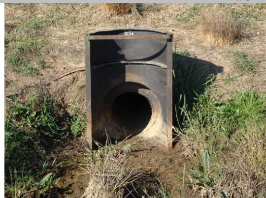
Land-Side: Inlet at landside toe.