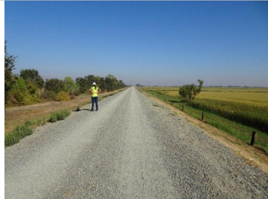
Overview of Levee: Looking upstream from crown.