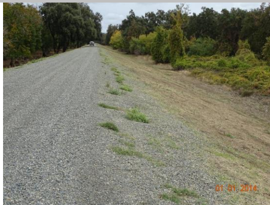
View of the well maintained annual vegetation, Fall 2021.