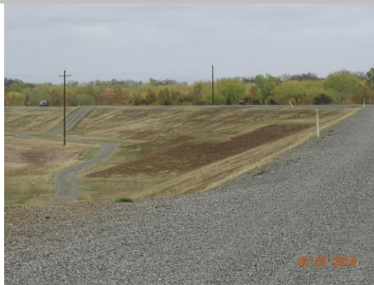
View of the well maintained annual vegetation, Fall 2021.