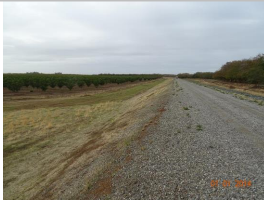
View of the well maintained annual vegetation, Fall 2021.