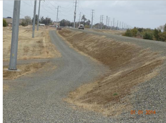
View of the well maintained annual vegetation, Fall 2021.