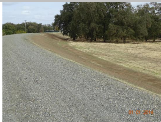
View of the well maintained annual vegetation, Fall 2021.

* Location LS : Land Side N/A : Not Applicable WS : Water Side CR : Crown