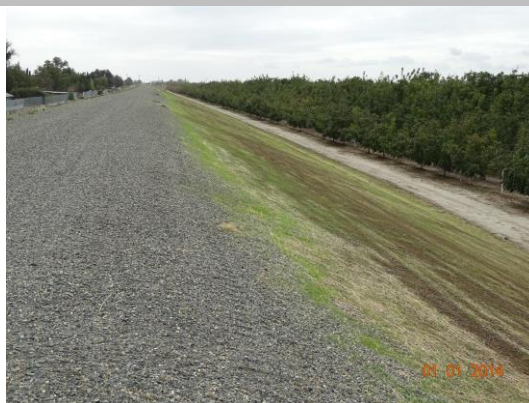
View of the well maintained annual vegetation, Fall 2021.