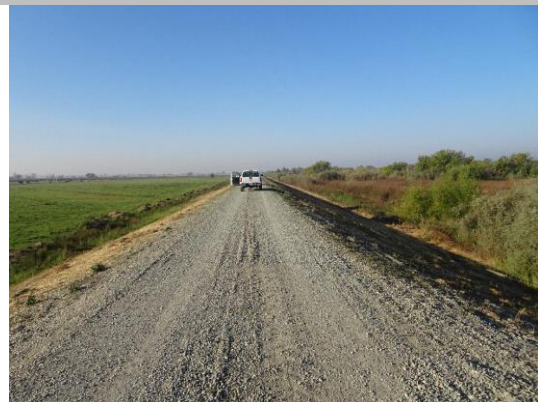
Overview of Levee: Looking downstream from crown.