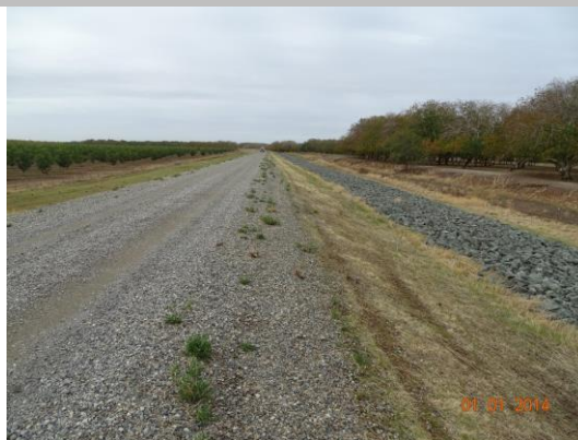
View of the well maintained annual vegetation, Fall 2021.

* Location LS : Land Side N/A : Not Applicable WS : Water Side CR : Crown