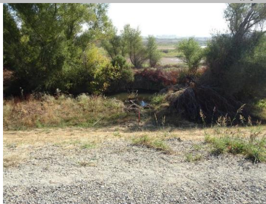
Land-Side: Drop inlet at landside toe.