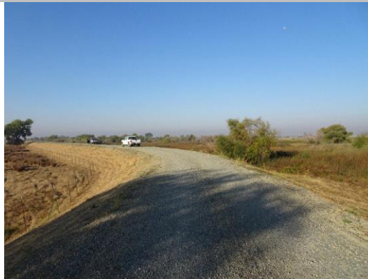
Overview of Levee: Looking downstream from crown.