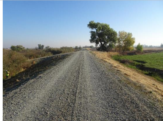
Overview of Levee: Looking upstream from crown.