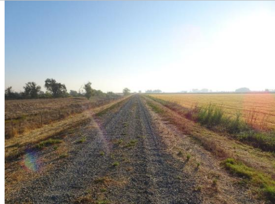
Overview of Levee: Looking upstream from crown.