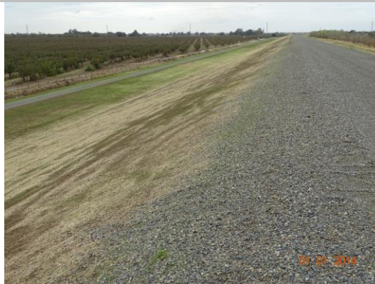
View of the well maintained annual vegetation, Fall 2021.