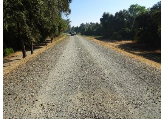
Overview of Levee: Looking upstream from crown.