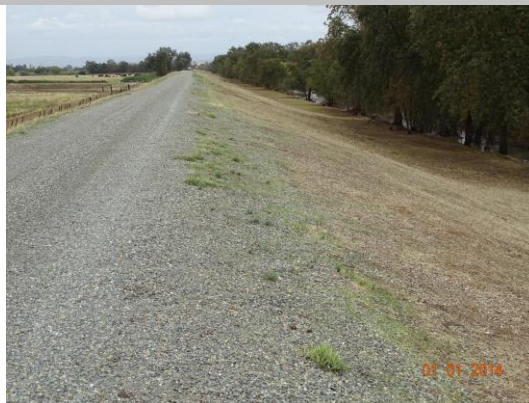
View of the well maintained annual vegetation, Fall 2021.