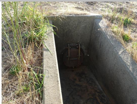
Water-Side: Outlet structure with flap gate at waterside toe.