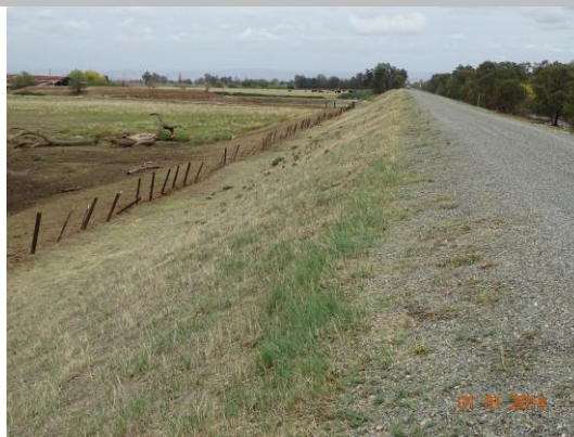
View of the well maintained annual vegetation, Fall 2021.