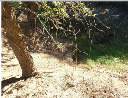
Water-Side: Headwall, outlet, and flap gate on waterside.