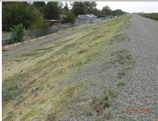
View of the well maintained annual vegetation, Fall 2021.