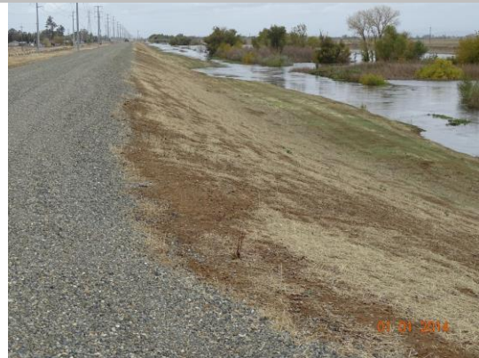
View of the well maintained annual vegetation, Fall 2021.