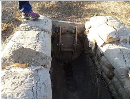
Water-Side: Outlet structure with flap gate at waterside toe.