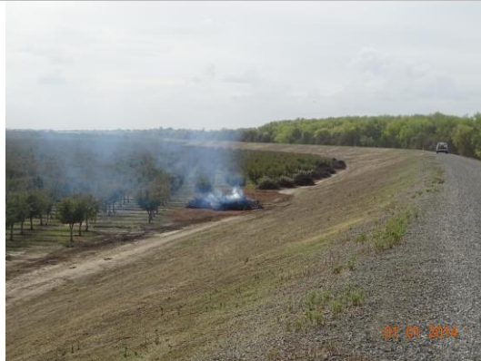
View of the well maintained annual vegetation, Fall 2021.