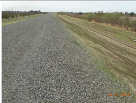
View of the well maintained annual vegetation, Fall 2021.