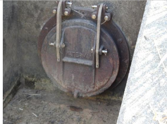
Water-Side: Outlet structure with flap gate at waterside toe.