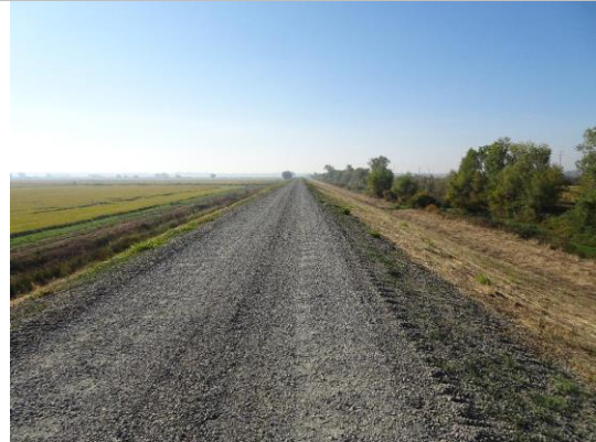
Overview of Levee: Looking downstream from crown.