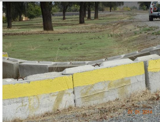
View of the well maintained annual vegetation, Fall 2021.