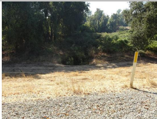
Water-Side: View of waterside looking from crown.