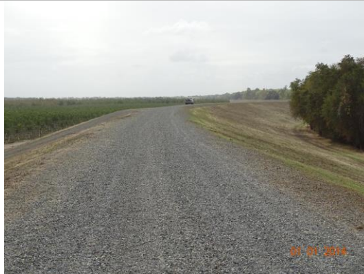
View of the well maintained annual vegetation, Fall 2021.