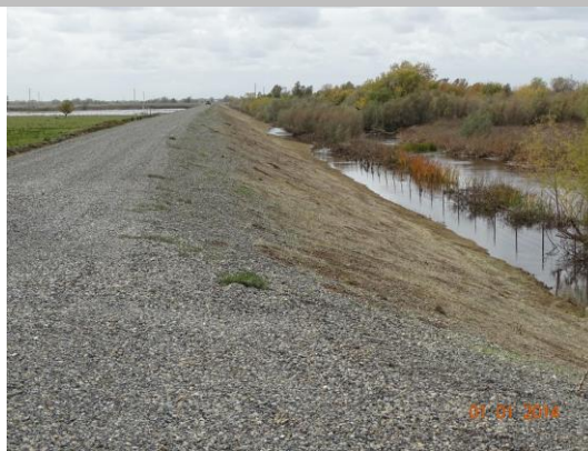
View of the well maintained annual vegetation, Fall 2021.