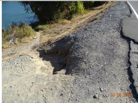
View of footpath on the waterside slope. Fall 2020