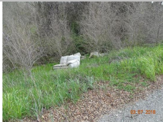
View of sofa debris dumped on slope. Spring 2018