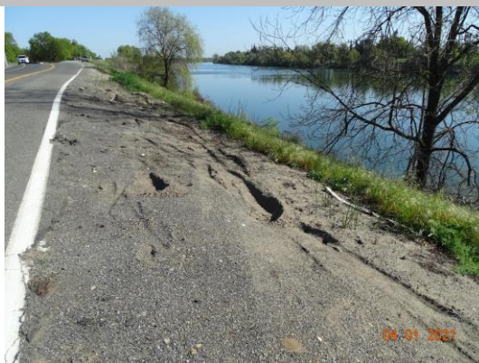
View of the WS levee slope damaged by vehicle traffic. Spring 2021.

Photo 1 of 1 : SP_2021_RD0765_211_42_20210426_00053.jpg