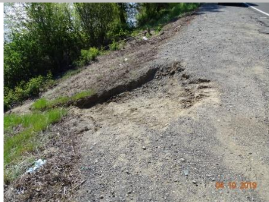
View looking downstream at footpath that cuts into levee slope. Spring 2019

* Location LS : Land Side N/A : Not Applicable WS : Water Side CR : Crown