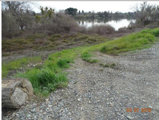
View looking southeast at slope instability due to vehicle traffic. Spring 2018