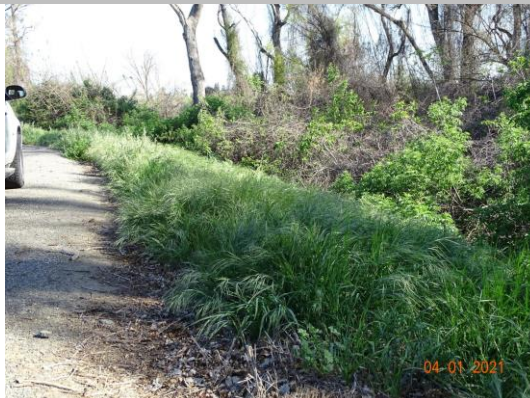
View of the annual vegetation on the WS levee slope. Spring 2021.