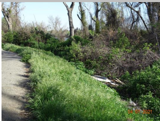
View of the tree limb on the WS levee slope. Spring 2021.

* Location LS : Land Side N/A : Not Applicable WS : Water Side CR : Crown