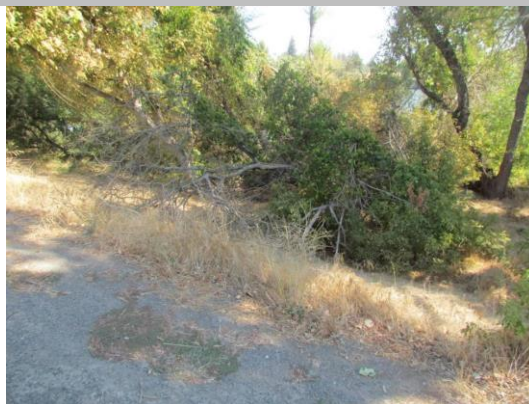
Looking northeast at fallen tree on waterward slope.