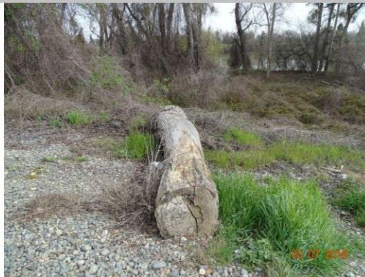
Encroachment downed tree waterside used to control vehicle access looking northeast.