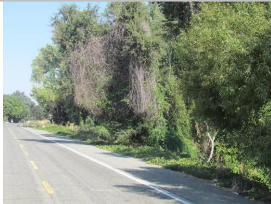
Looking northeast at untrimmed trees and other vegetation on waterward slope. (Fall 2016)