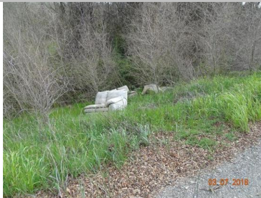
Encroachment sofa waterside looking east.