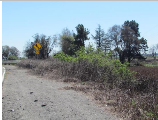
Looking southwest at dead vines and other veg on landward slope. (Spring 2017)