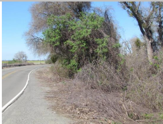
Looking north at dense untrimmed trees on waterward slope. (Spring 2017)