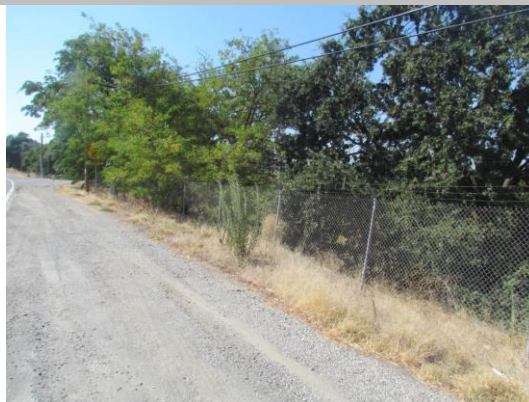
Looking southwest at untrimmed trees on landward slope. (Fall 2016)