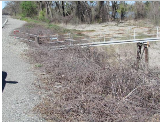
Looking north at dead vines on waterward slope. (Spring 2017)