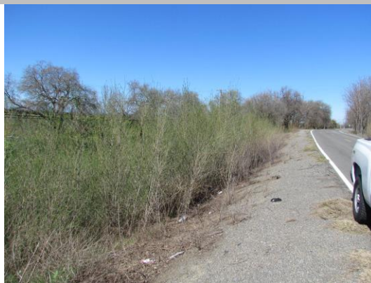
Looking north at dense willows on landward slope. (Spring 2017)