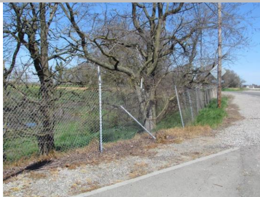
Looking north at untrimmed trees along landward slope. (Spring 2017)