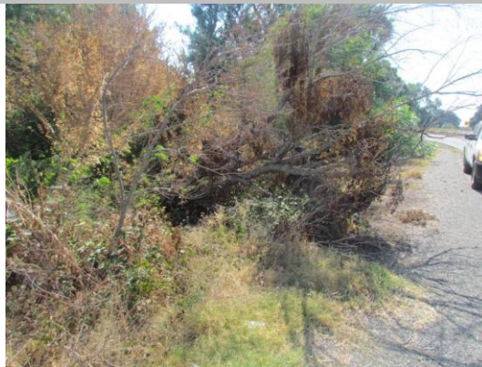
Looking north at fallen tree on waterward slope.