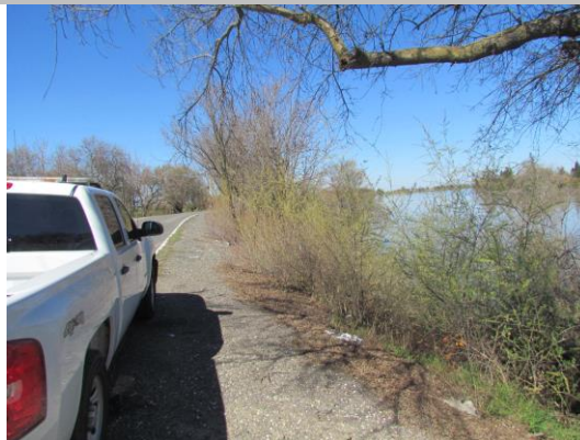
Looking north at willows and other veg. on waterward slope. (Spring 2017)