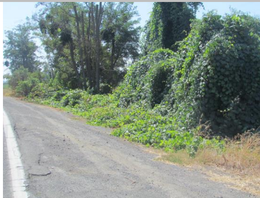
Looking west at dense vegetation (grapevines) on landward slope. (Fall 2016)