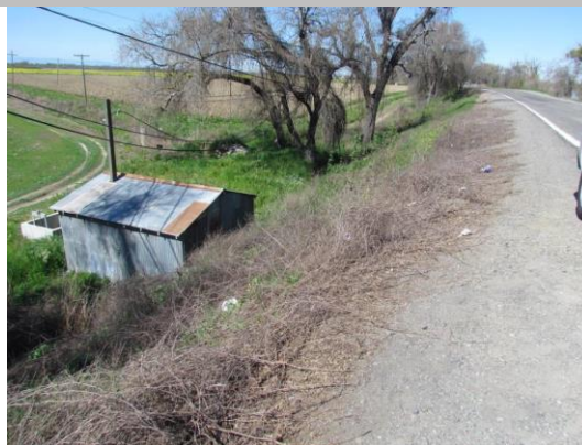
Looking northwest at dense dead berryvines on landward slope. (Spring 2017)