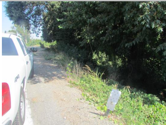
Looking north at dense vegetation on waterward slope.