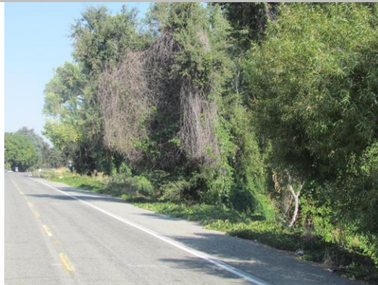
Looking northeast at untrimmed trees and other vegetation on waterward slope. (Fall 2016)

* Location LS : Land Side N/A : Not Applicable WS : Water Side CR : Crown