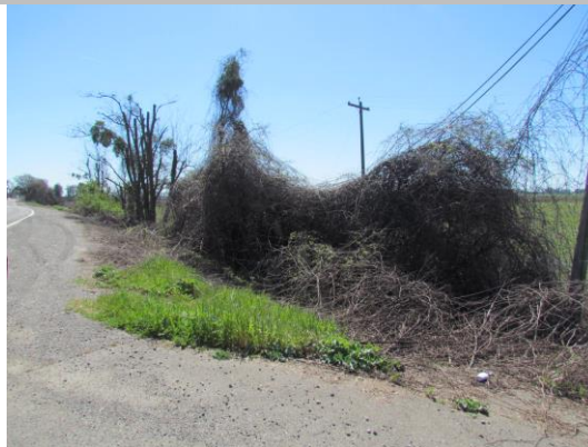
Looking west at dead vines on landward slope. (Spring 2017)