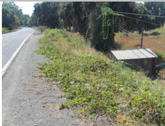
Looking south at dense wildroses on landward slope. (Fall 2016)