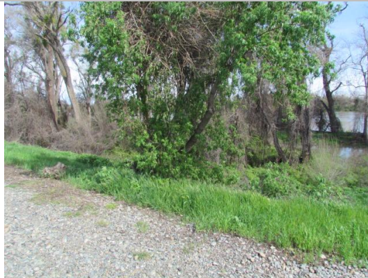
Looking east at untrimmed tree on waterward slope.