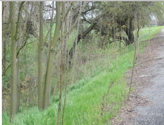
Looking northwest at trees (saplings) on landward slope.