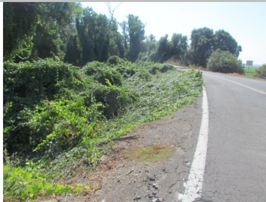
Looking south on at dense berryvines on waterward slope.

LS : Land Side N/A : Not Applicable WS : Water Side CR : Crown