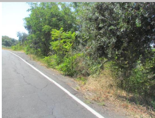
Looking southwest at dense vegetation on landward shoulder and slope. (Fall 2016)