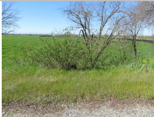
Looking west at moderate veg on landward slope.

* Location LS : Land Side N/A : Not Applicable WS : Water Side CR : Crown