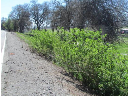
Looking south at new growth on landward slope. (Spring 2017)