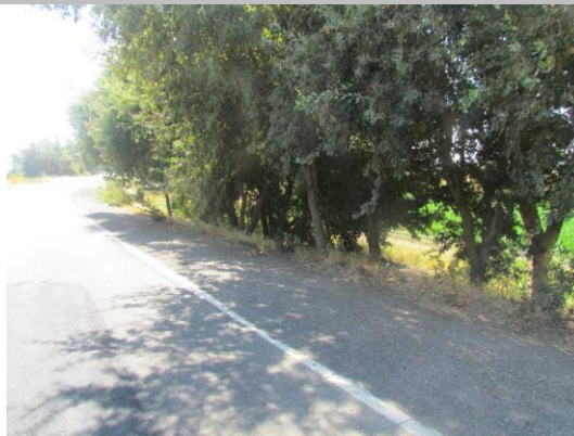
Looking northwest at untrimmed trees on landward slope.