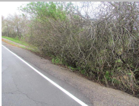
Looking southwest at fig trees and other trees on landside slope and toe. (Fall 2016)