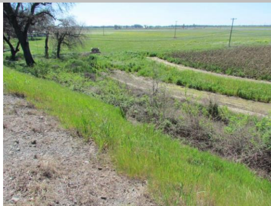
Looking west at berryvine at bottom half of landward slope. (Spring 2017)