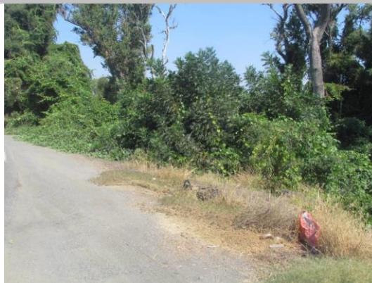
Looking north at dense vegetation on waterward slope. (Fall 2016)