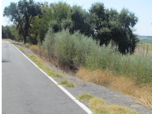
Looking northwest at dense vegetation on landward slope. (Fall 2016)