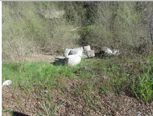
Looking east at sofa on waterward slope.