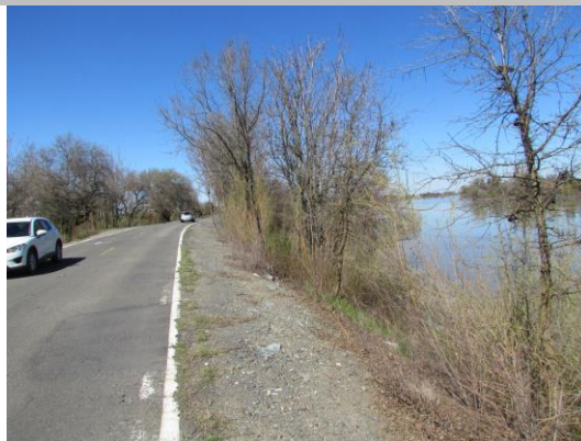
Looking north at dense veg on waterward slope. (Spring 2017)