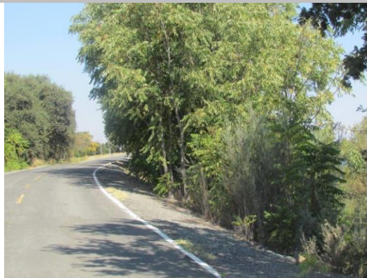
Looking northeast at large cluster of trees on waterward slope. (Fall 2016)