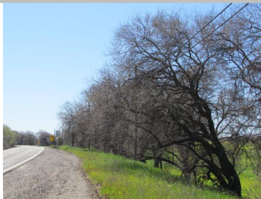
Looking southwest at untrimmed trees on landward slope. (Spring 2017)