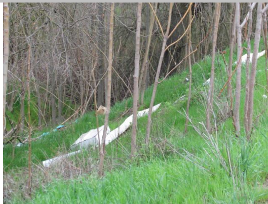
Looking northwest at garbage on landside slope.