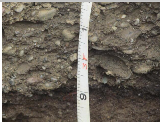
Looking depth of hole on landward shoulder and slope.