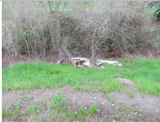
Looking west at garbage on landside slope.