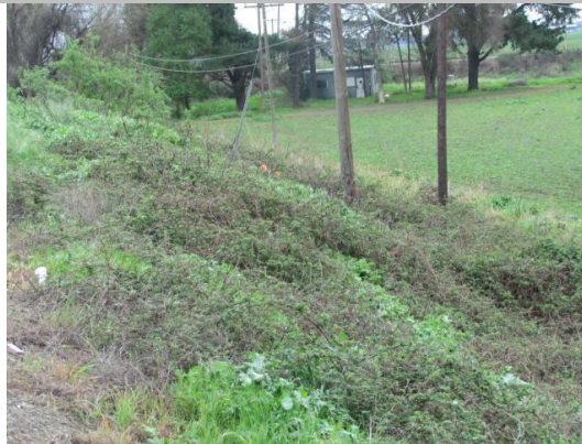
Looking southwest at ground cover on landward slope.