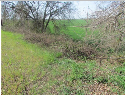
Looking at wild berryvines or wild roses on landside slope and toe.