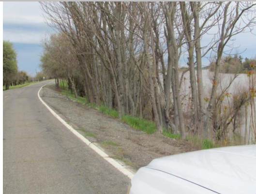
Looking northeast at cluster of trees on waterward slope.