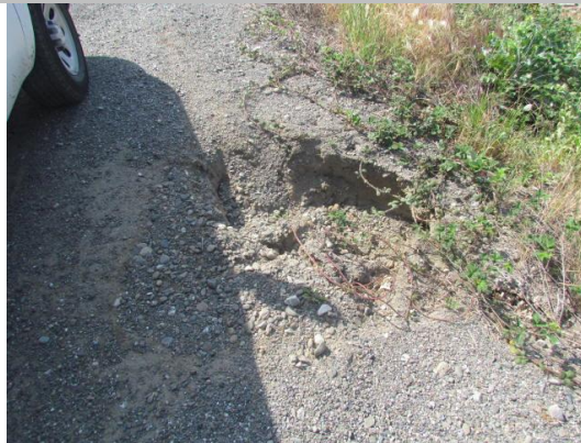
Looking south at caving on landward shoulder.