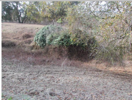
Looking west at dense berryvines on landside toe.