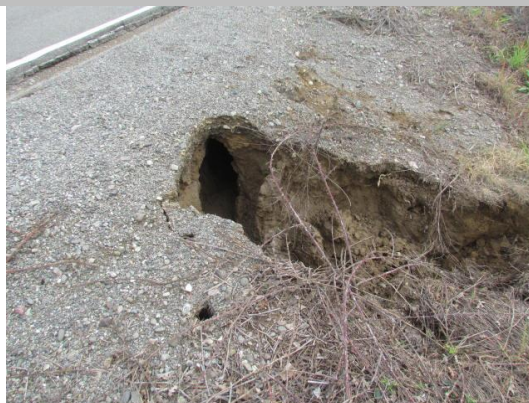
Looking south at large hole on landward shoulder and slope.