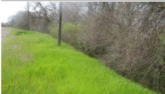
Looking downstream (south) at trees on landside slope &amp; toe.