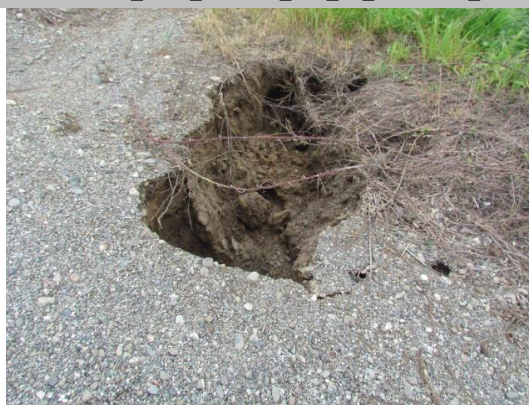
Looking southwest at large hole on landward shoulder and slope.