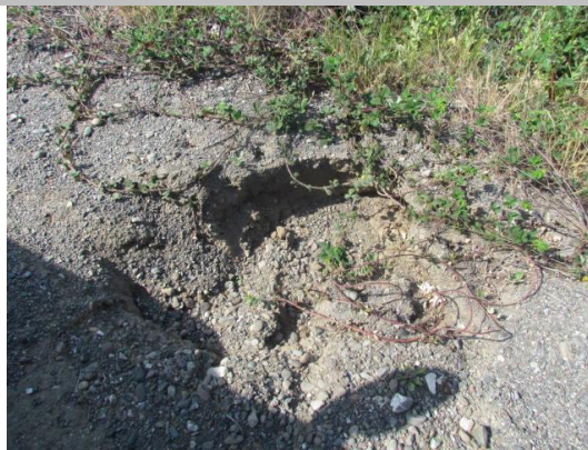
Looking east at caving on landward shoulder.