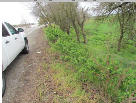
Looking southwest at wildroses on landward slope.