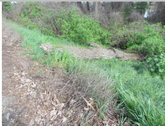
Looking northwest at tree limb on waterward slope.