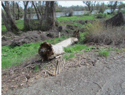
Looking southeast at branch on waterward slope.