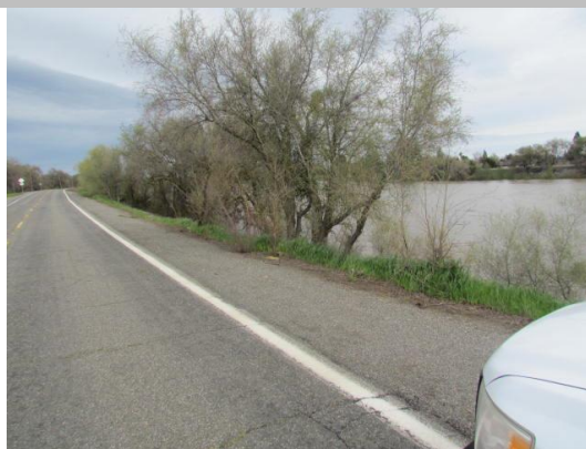
Looking northeast at trees along waterward shoulder and slope.