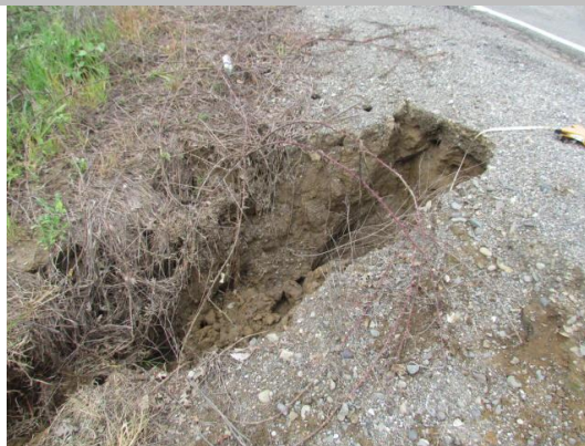
Looking north at hole on landward shoulder and slope.