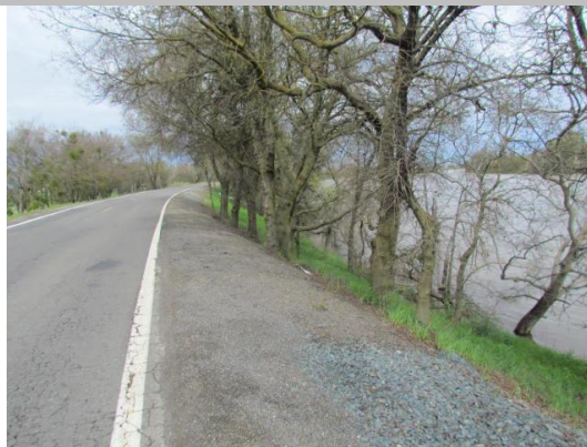
Looking northeast at trees on waterward slope.