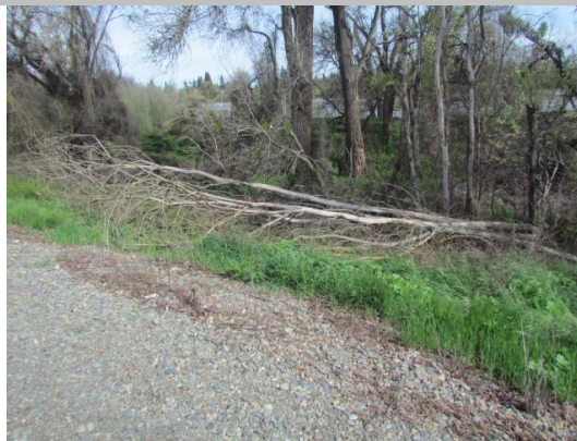
Looking at fallen tree on waterward slope and toe.