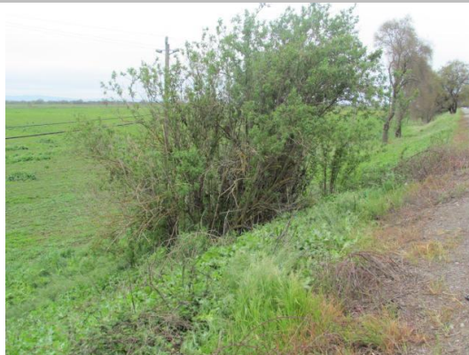
Looking northwest at dense vegetation on landward slope and toe.