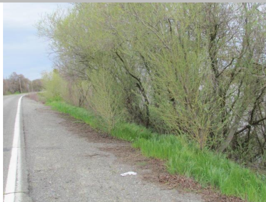
Looking southwest at trees along landward shoulder and slope.