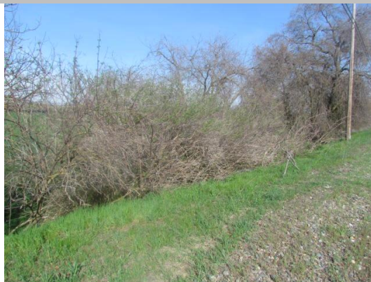
Looking northwest at dense vegetation on landside slope.