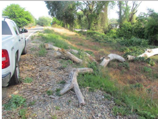
Looking north at down tree across waterward slope.(2015)