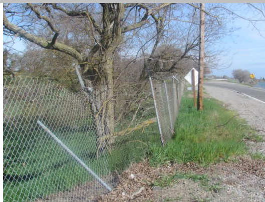
Looking north (upstream) at trees on landside slope.