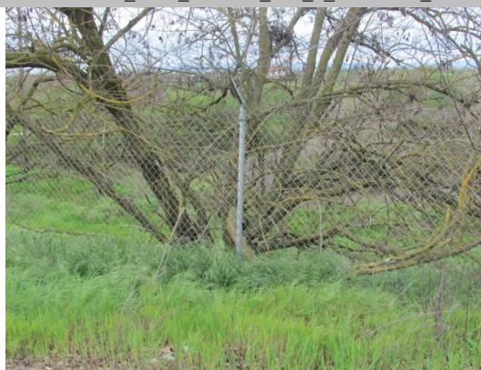
Looking west at tree on landward slope.