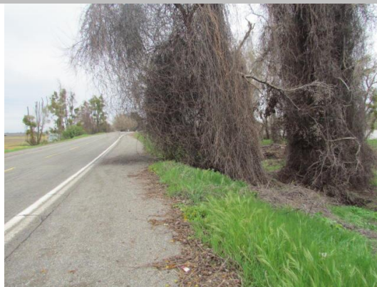
Looking north at untrimmed trees on waterward slope.