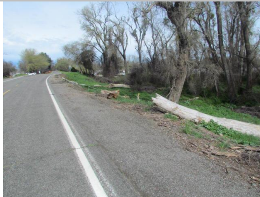
Looking northeast at tree limbs on waterward slope.