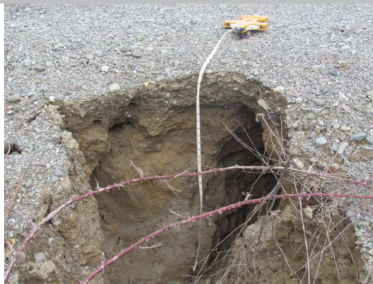
Looking east at large hole on landward shoulder and slope.