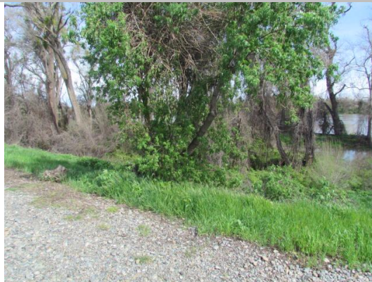
Looking east at untrimmed tree on waterward slope.