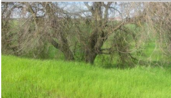
Looking west at trees on landside toe.