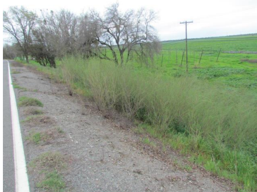
Looking northwest at dense vegetation on landward slope.