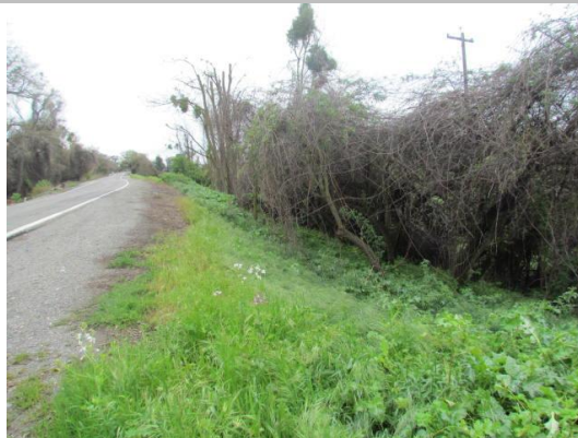
Looking west at dense vegetation on landward toe.