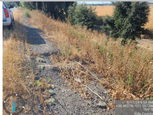
Erosion on the LS slope. Fall 2024