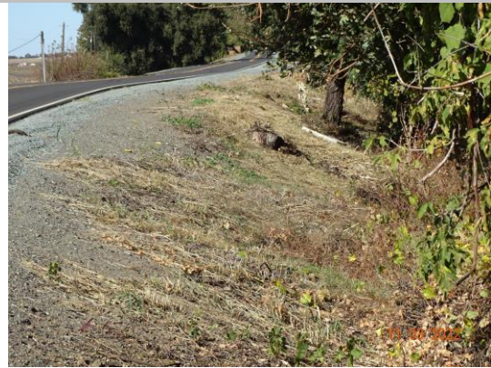
Tree stump on the WS slope. Fall 2022