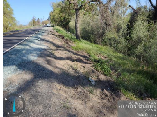
Rutting on the WS shoulder. Spring 2023