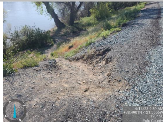
Erosion at the footpath on the WS slope. Spring 2023