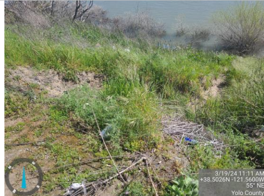
Footpath on the WS slope. Spring 2024