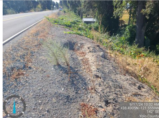
Rutting on the LS shoulder. Fall 2024