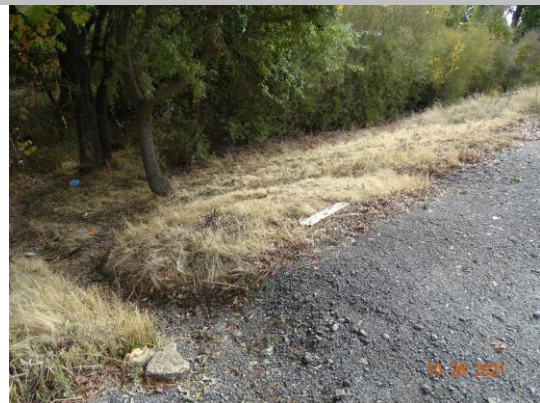
Footpaths on the WS slope. Fall 2021

Photo 1 of 1 : FA_2024_RD0765_211_10_20240911_00005.jpg