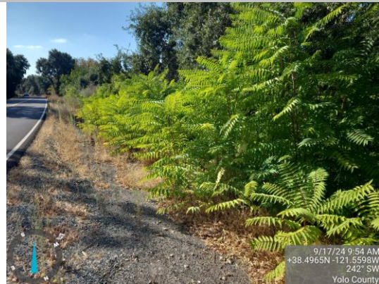
Trees on the LS slope. Fall 2024