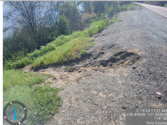
Erosion on the WS footpath. Spring 2024