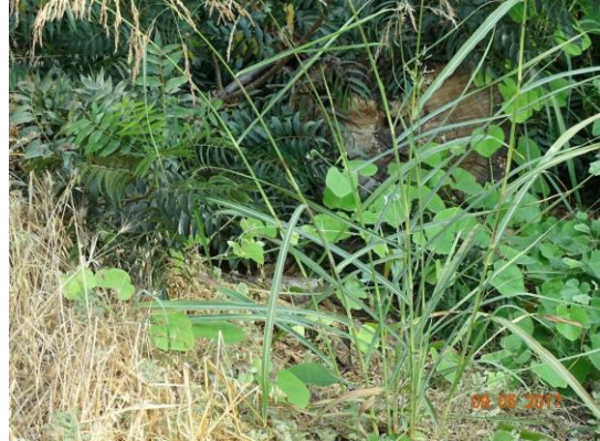
Looking northwest at tree limb in vegetation on waterside slope. Fall 2017