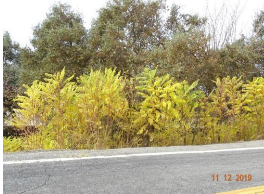
View of invasive wild growth on the landside slope. Fall 2019