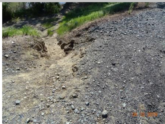
View looking east at footpath that cuts into levee slope. Spring 2019