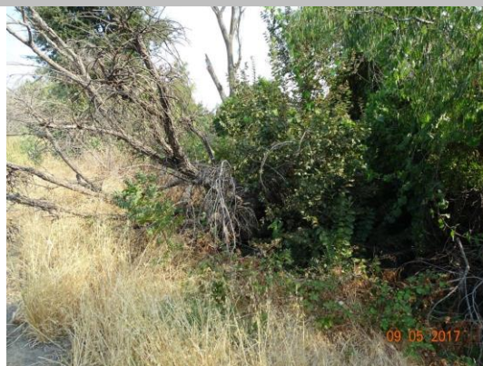
Looking north at the waterside slope.

LS : Land Side N/A : Not Applicable WS : Water Side CR : Crown