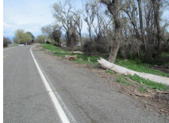
Looking northeast at tree limbs on waterward slope.