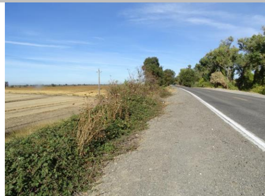
View of tall brush on levee slope. Fall 2018