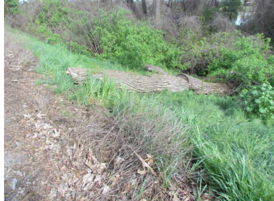
Looking northwest at large tree limb on waterward slope.