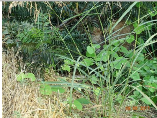
Looking northwest at tree limb in vegetation on waterside slope.

LS : Land Side N/A : Not Applicable WS : Water Side CR : Crown