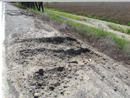
Looking south at levee damage caused by vehicle traffic. (Spring 2017)