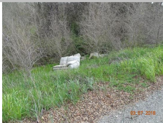
View of sofa debris dumped on slope. Spring 2018