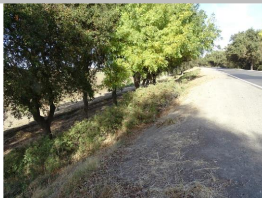
View of wild brush on levee slope. Fall 2018