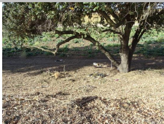
View of trash on levee. Fall 2018

Photo 1 of 1 : FA_2018_RD0765_211_57_20181101_00093.jpg