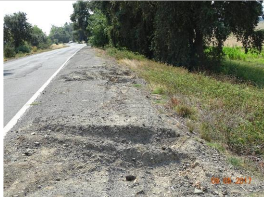
Looking south on landside slope.