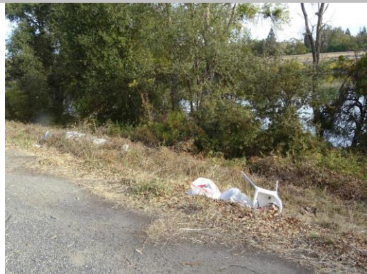
View of debris dumped on slope. Fall 2018