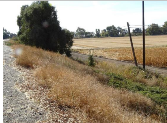
View of tall brush on levee slope. Fall 2018