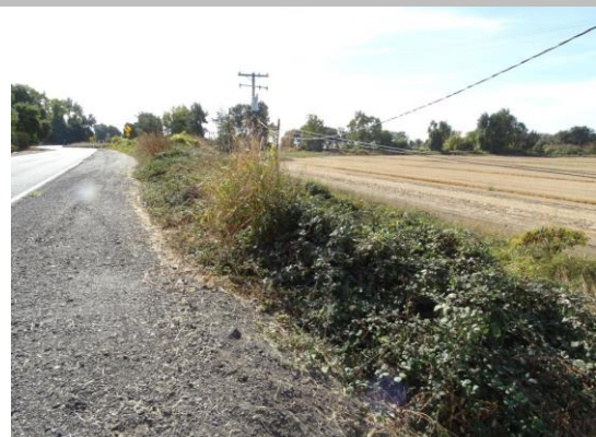
View of tall brush on levee slope. Fall 2018