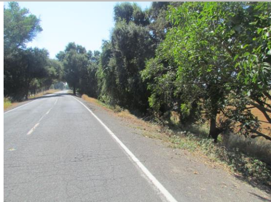
Looking southwest at untrimmed trees on landward slope.

* Location LS : Land Side N/A : Not Applicable WS : Water Side CR : Crown