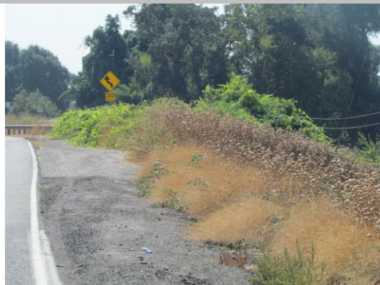
Looking southwest at dense berry vines and other vegetation on landward slope. (Fall 2016)