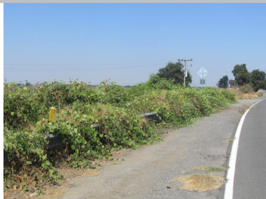
Looking northwest at berryvines on landward slope and toe. (Fall 2016)