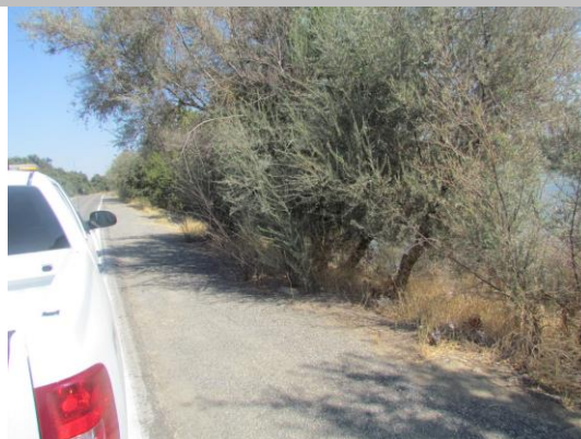
Looking northeast at untrimmed trees on waterward shoulder. (Fall 2016)