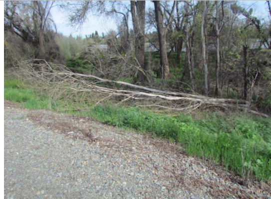
Looking at fallen tree on waterward slope and toe.