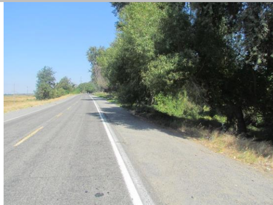
Looking northeast at untrimmed trees on waterward slope. (Spring 2016)