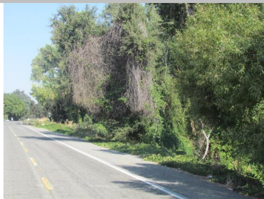
Looking northeast at untrimmed trees and other vegetation on waterward slope. (Fall 2016)