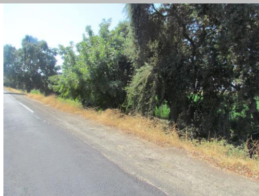
Looking northwest at untrimmed trees on landward slope.