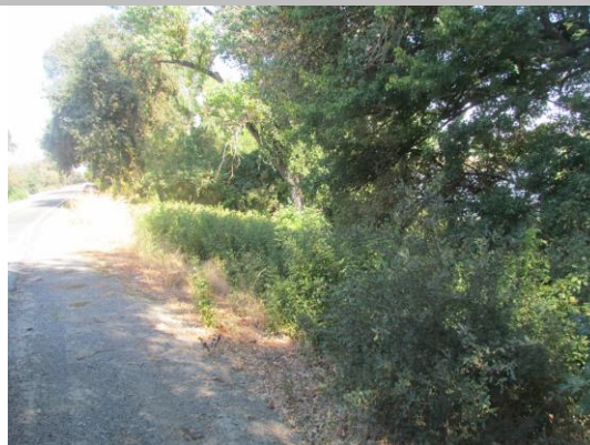
Looking north at wildroses and untrimmed trees on waterward shoulder and slope.