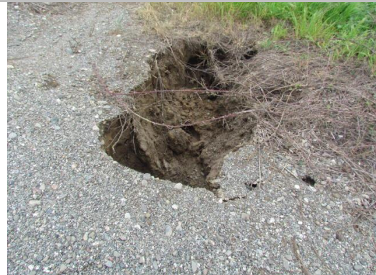
Looking southwest at large hole on landward shoulder and slope.