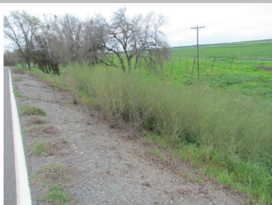
Looking northwest at dense vegetation on landward slope. (Spring 2016)