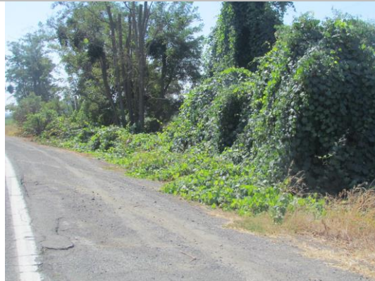
Looking west at dense vegetation (grapevines) on landward slope. (Fall 2016)