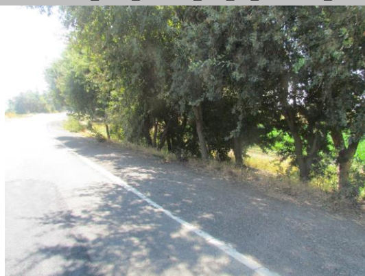
Looking northwest at untrimmed trees on landward slope.

LS : Land Side N/A : Not Applicable WS : Water Side CR : Crown