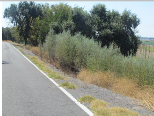
Looking northwest at dense vegetation on landward slope. (Fall 2016)