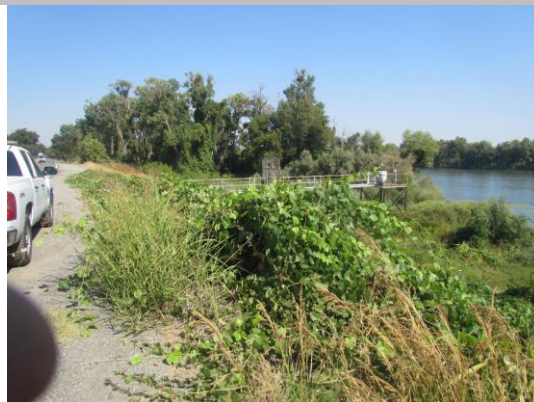
Looking northeast at vines on waterward slope.

LS : Land Side N/A : Not Applicable WS : Water Side CR : Crown