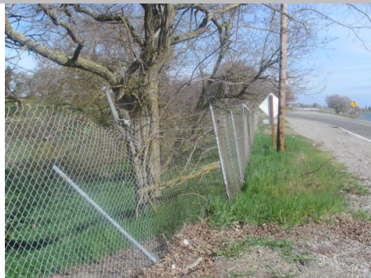
Looking north (upstream) at trees on landside slope. (Spring 2016)

LS : Land Side N/A : Not Applicable WS : Water Side CR : Crown