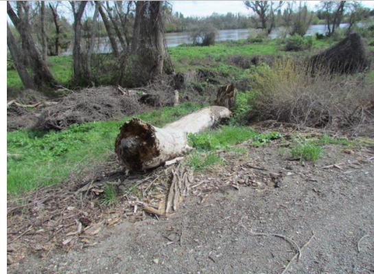
Looking southeast at branch on waterward slope.