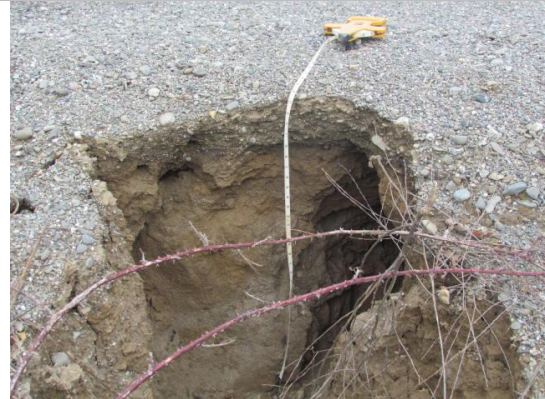
Looking east at large hole on landward shoulder and slope.