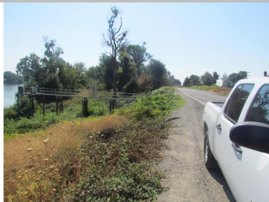
Looking southeast at vines on waterward slope.