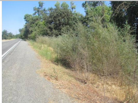
Looking northwest at willows on waterward slope.