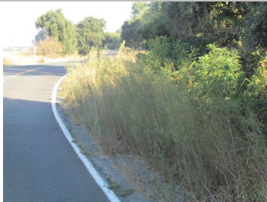
Looking northeast from LM 1.29 at typical view of vegetation on waterward slope.