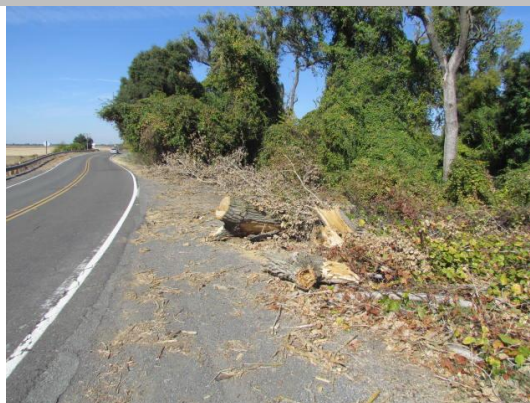
Looking northeast at tree limbs on waterward slope.