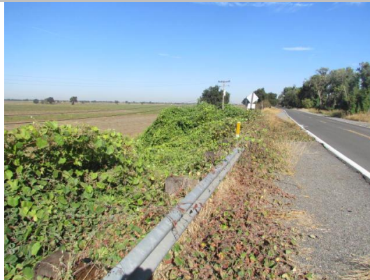
Looking north from LM. 1.65 at dense vegetation on landward slope.