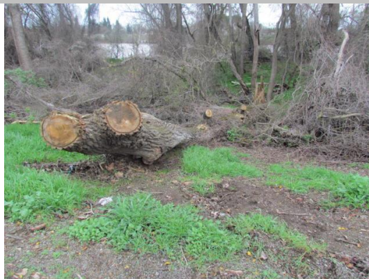
Looking east at large tree limb on waterward slope.