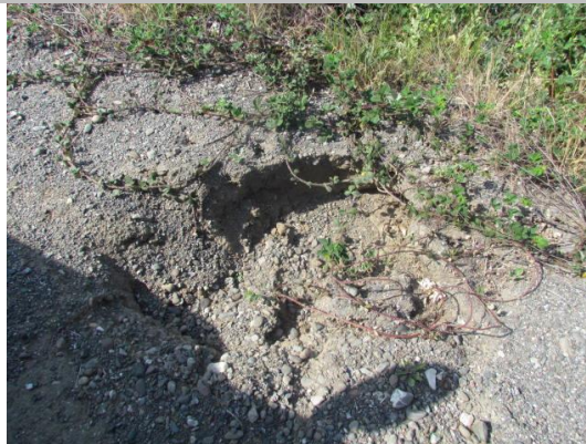
Looking east at caving on landward shoulder.