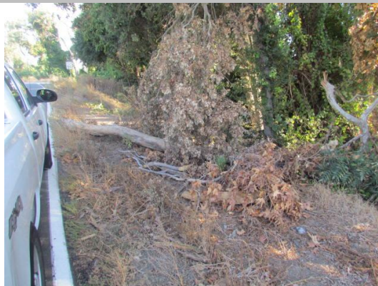
Looking northeast at broken and cracked tree branches on waterward slope.