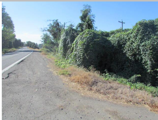
Looking south from LM 1.28 at typical view of vegetation on landward slope.