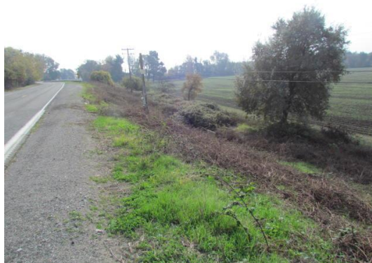
Looking southwest at vegetation on landside slope and toe. (Fall Inspection 2012)