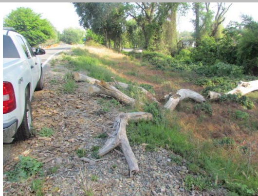
Looking north at down tree across waterward slope.