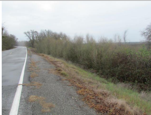
Looking southwest at dense vegetation on landside slope and toe.