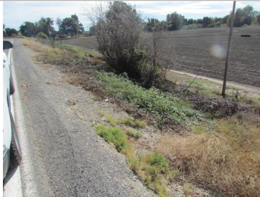
Looking south at moderate vegetation on landward slope and toe. (Fall 2014)