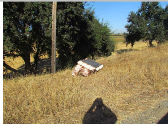
Looking westly at garbage on landward shoulder.