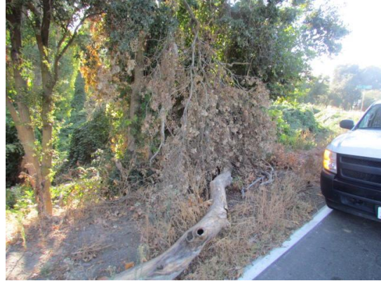
Looking south at broken and cracked tree branches on waterward slope.