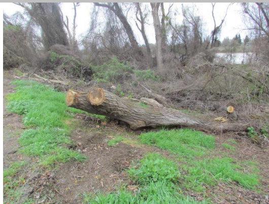
Looking north at large tree limb on waterward slope.