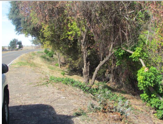
Looking north at trimmed trees on waterward slope. (Fall 2014)