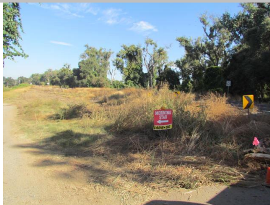
Looking northeast from LM 1.71 at typical view of vegetation on landward slope.