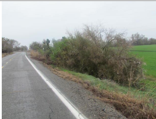
Looking south at dense vegetation on landside slope and toe spring 2012.