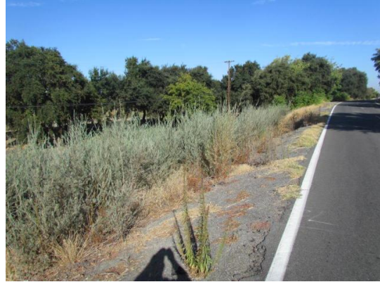
Looking south at typical view of vegetation on landward slope.