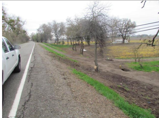
Looking southwest at trimmed trees and vegetation on landside slope and toe.