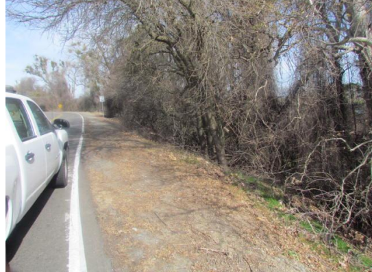
Looking north (upstream) at dense trees on landside slope.