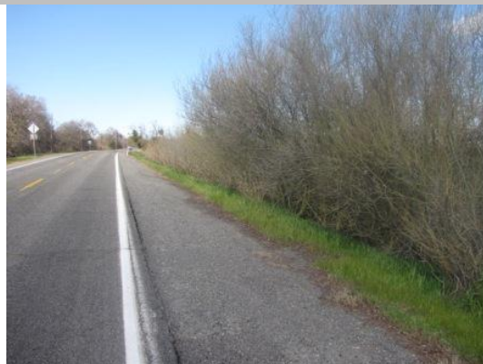
Looking upstream (north) at dense vegetation and trees from 2011 spring inspection.