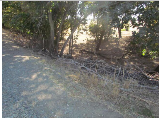
Looking southwest at trees on landward slope.