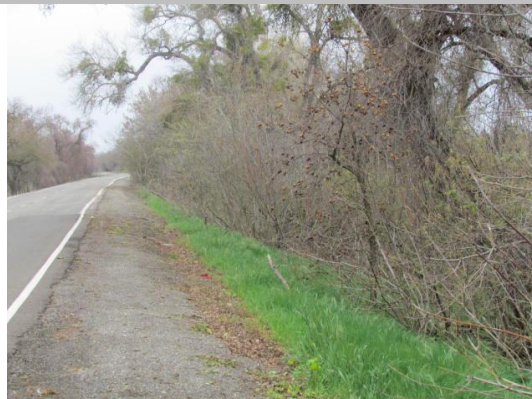
Looking north (upstream) at untrimmed trees on waterward slope.