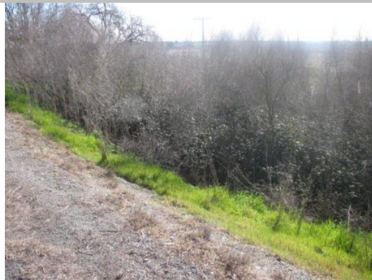
Looking downstream (southwest) at dense vegetation on landside slope.

LS : Land Side N/A : Not Applicable WS : Water Side CR : Crown