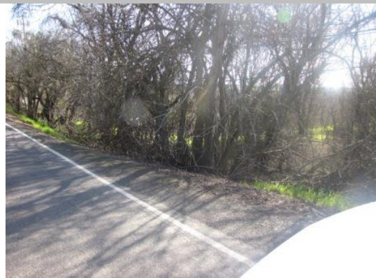
Looking downstream (southwest) at dense trees on landside slope and toe.