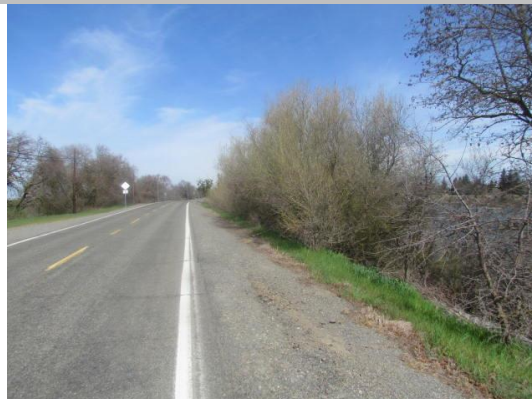
Looking north (upstream) at dense trees on landside slope and shoulder. (Spring 2013)