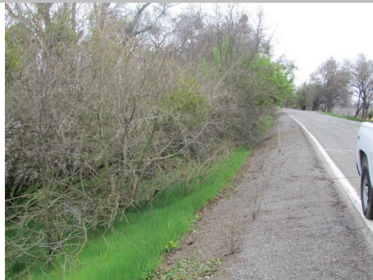
Looking south (downstream) at untrimmed trees on waterward slope.

LS : Land Side N/A : Not Applicable WS : Water Side CR : Crown