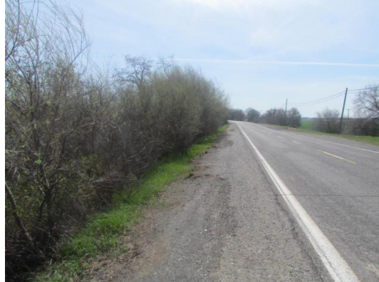
Looking south (downstream) at dense trees on landside slope and shoulder. (Spring 2013)