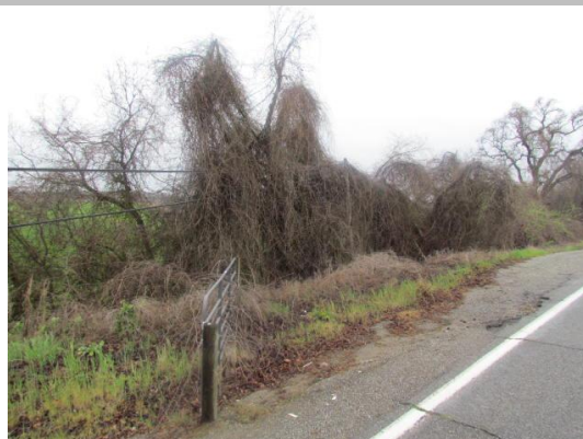
Looking northwest at vines on landside toe spring 2012.