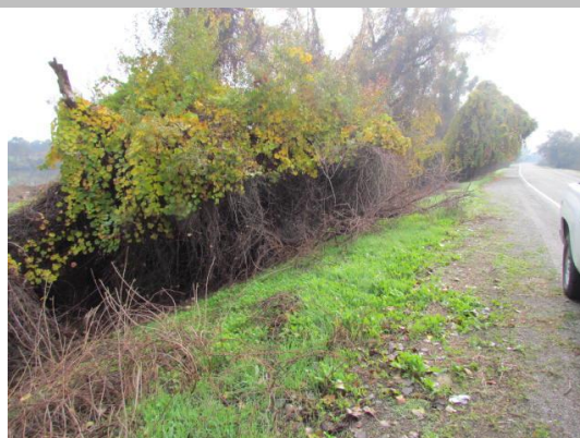
Looking southeast at dense vegetation on waterside slope. (Fall Inspection 2012)