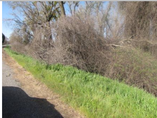
Looking upstream (north) at dense vegetation on waterside slope.