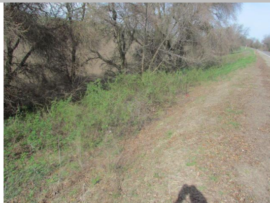
Looking northwest at vegetation on landside slope.