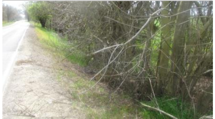
Looking downstream (south) at trees on landside slope & toe from 2010 fall inspection.