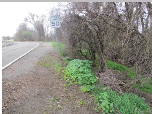
Looking north at vegetation on waterward slope.