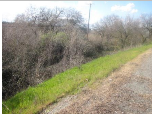
Looking upstream (northwest) at dense vegetation on landside slope.