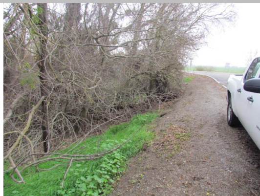
Looking southeast at vegetation on waterward slope.

LS : Land Side N/A : Not Applicable WS : Water Side CR : Crown