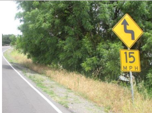
Looking northeast at overgrown trees on waterside slope.