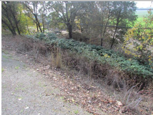
Looking southwest at dense vegetation on landside slope and toe.

LS : Land Side N/A : Not Applicable WS : Water Side CR : Crown