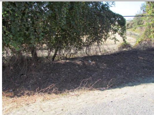
Looking west at trimmed trees on landward slope.