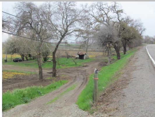
Looking northwest at trimmed trees and vegetation on landside slope and toe.