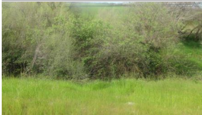
Looking northwest at trees on landside toe from 2010 fall inspection.