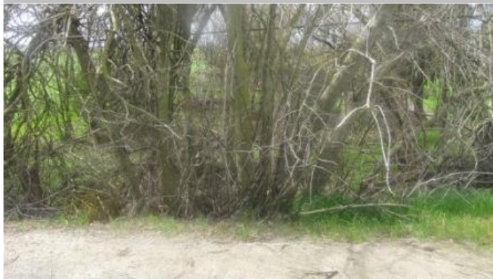
Looking west at trees on landside slope &amp; toe.