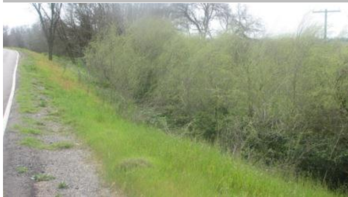
Looking downstream (south) at trees on landside slope &amp; toe.