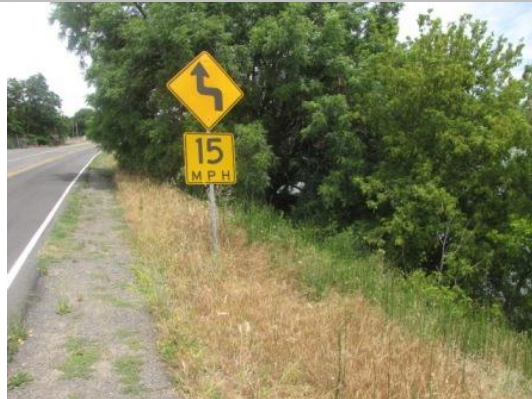
Looking north at dense trees on waterside slope from fall 2010 inspection.