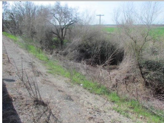
Looking southwest at dense vegetation on landside slope and toe.