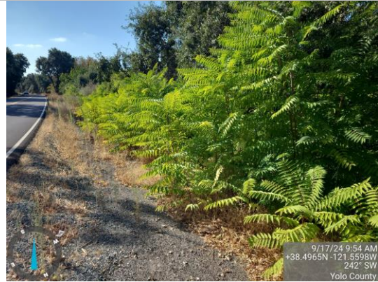
Trees on the LS slope. Fall 2024