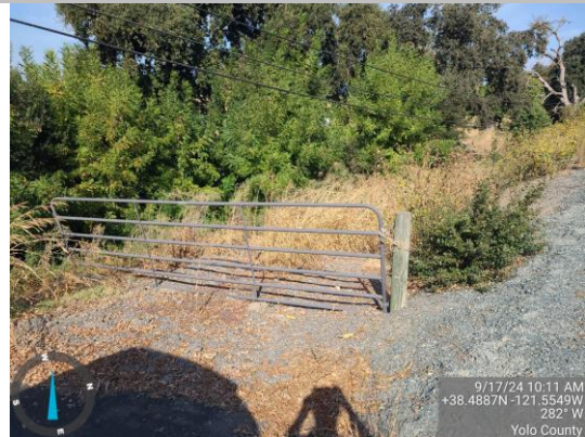
Ramp and gate on the LS slope. Fall 2024