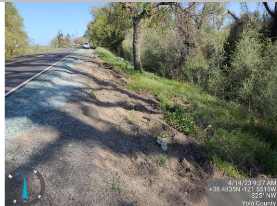
Rutting on the WS shoulder. Spring 2023