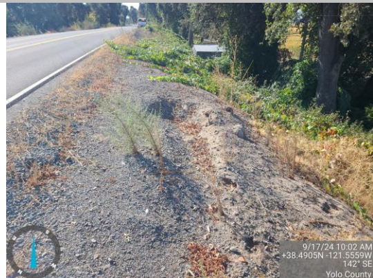
Rutting on the LS shoulder. Fall 2024