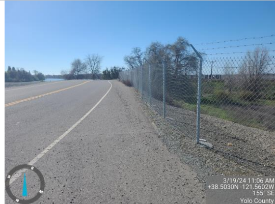
Fence on the LS shoulder. Spring 2024