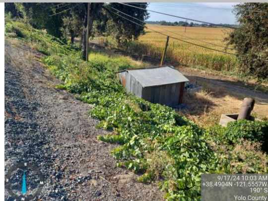
Building in the landside easement. Fall 2024