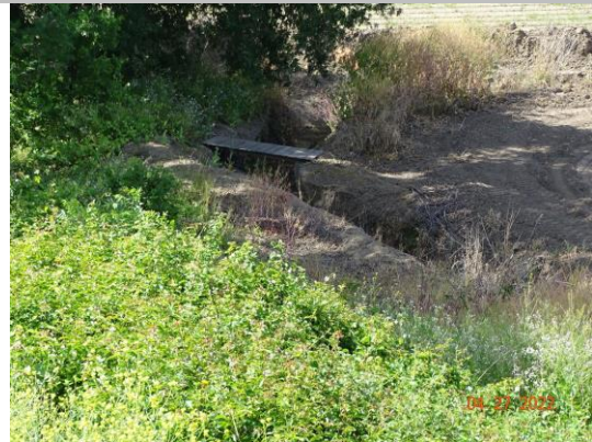
Ditch near the landside toe. Spring 2022