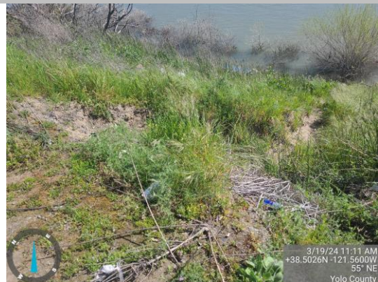
Footpath on the WS slope. Spring 2024