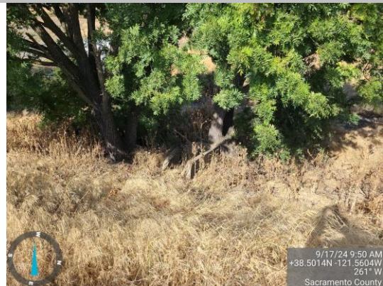
Concrete footing on the LS levee toe. Spring 2024