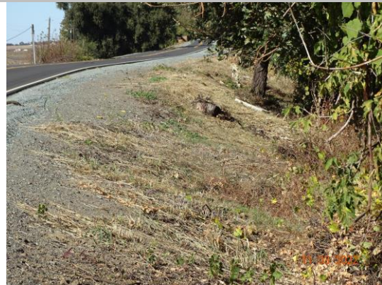
Tree stump on the WS slope. Fall 2022