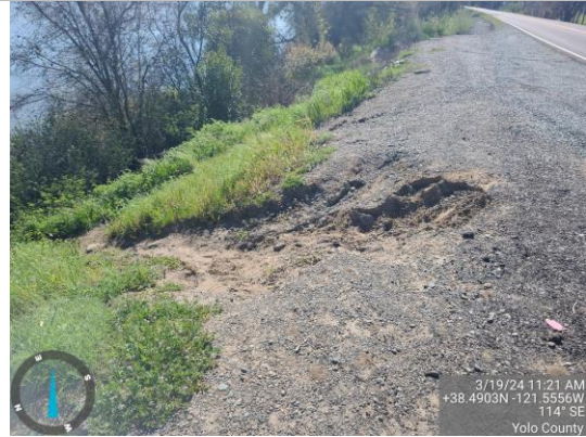
Erosion on the WS footpath. Spring 2024