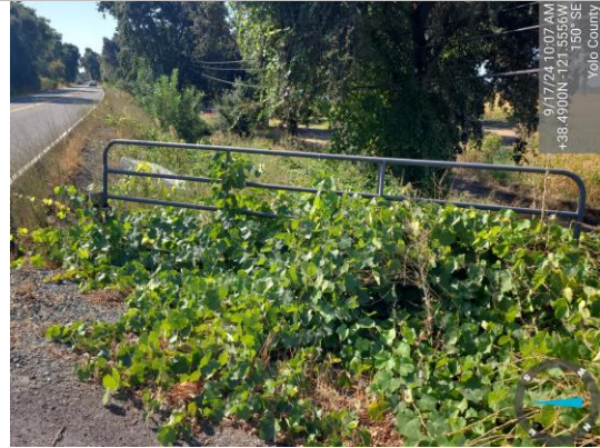
Ramp and gate on the LS slope. Fall 2024