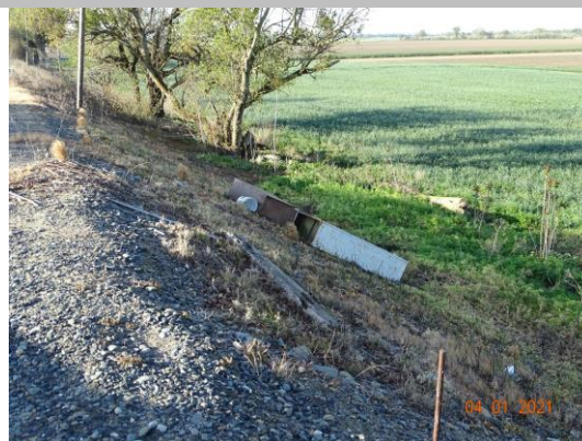
View of the filing cabinets on the LS levee slope. Spring 2021.