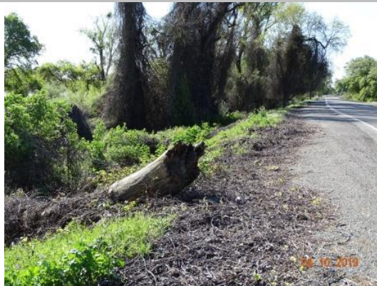
View looking downstream at tree log on levee slope. Spring 2019