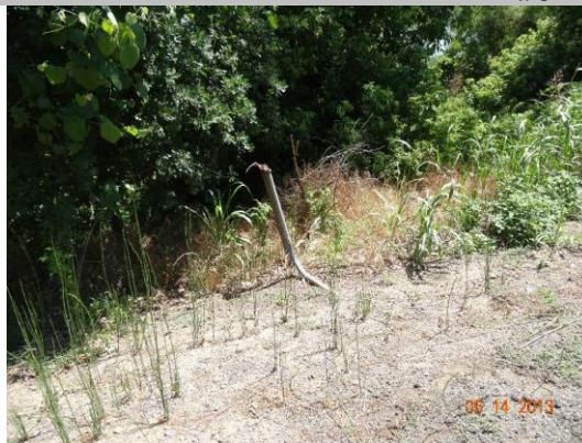
Conduits disconnected and damaged on waterward side.