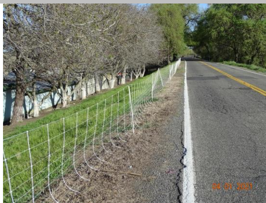
View of the fence on the LS levee shoulder. Spring 2021.