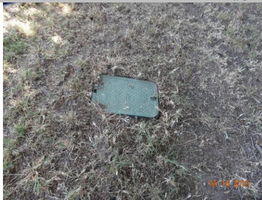
Utility box located on landward shoulder.