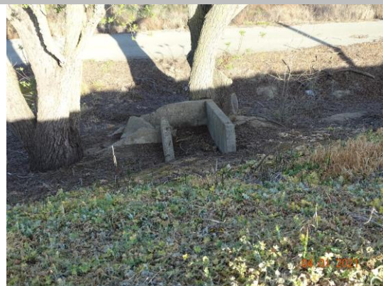
View of the concrete debris on the LS levee toe. Spring 2021.