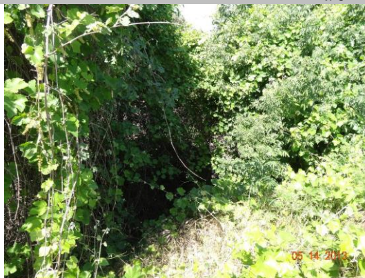
View of landward side--dense vegetation limits inspection.