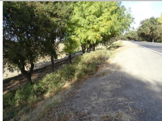
View of brush on levee slope. Fall 2018