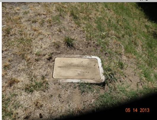
Utility box located on landward side.