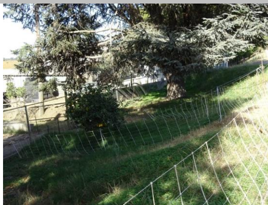
View of citrus tree within levee easement. Fall 2018