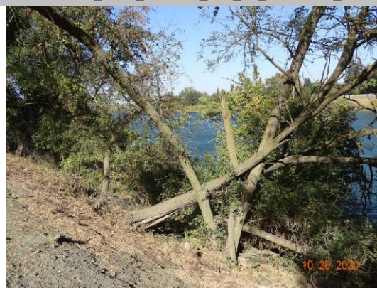
View of fallen tree with exposed rootball on the waterside slope. Fall 2020