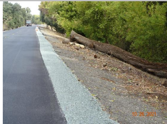
Fallen tree log within 20' of the WS crown. Fall 2021