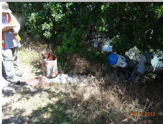
Siphon breaker encased in steel casing located on waterward side.