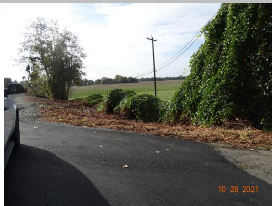
Ivy growth on the LS slope. Fall 2021