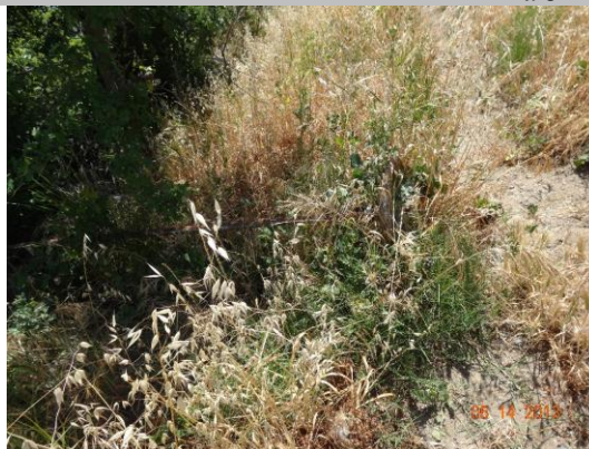
View of waterward side--dense vegetation limits inspection.