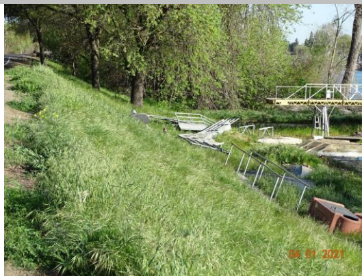
View of the equipment on the WS levee slope. Spring 2021.