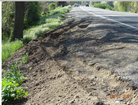
View of the WS levee slope damaged by vehicle traffic. Spring 2021.