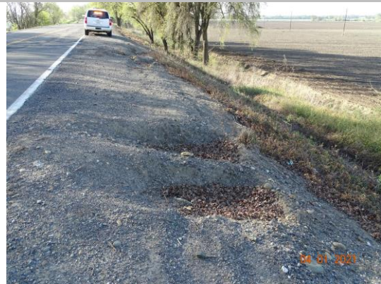
View of the LS levee shoulder damaged by vehicle traffic. Spring 2021.