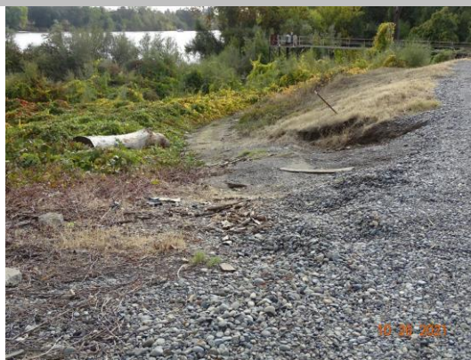
Erosion and rutting from vehicle traffic on the WS slope. Fall 2021