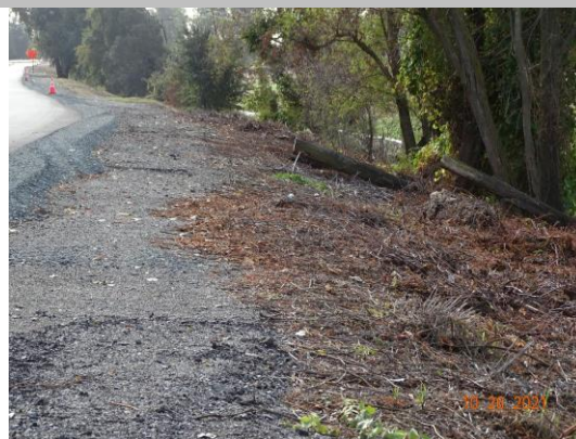
Tree logs on the LS slope. Fall 2021