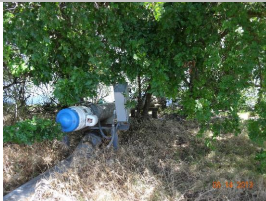
View of waterward side--pipe, pump, control panels, and electrical conduit.