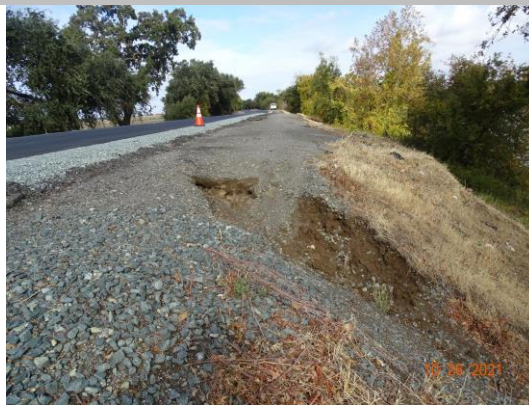
Erosion at the footpath on the WS slope. Fall 2021