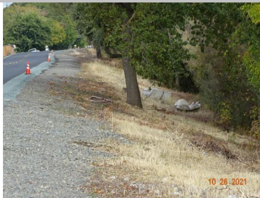
Sofas on the WS slope. Fall 2021