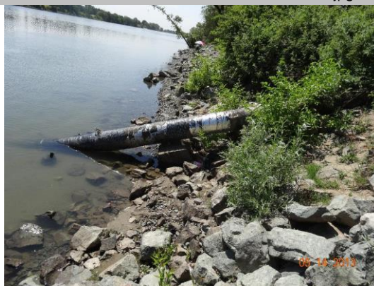
Pipe section visible at waterward toe.