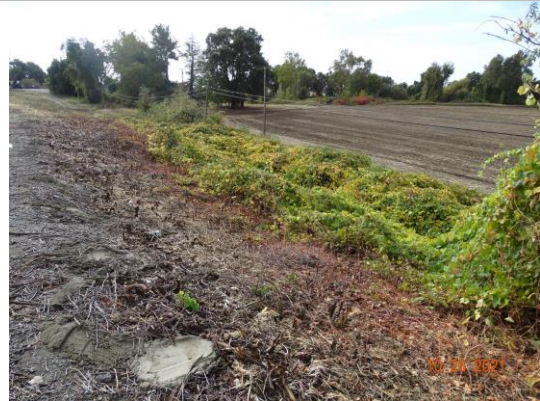
View of the overgrown ditch along the LS levee toe. Fall 2021