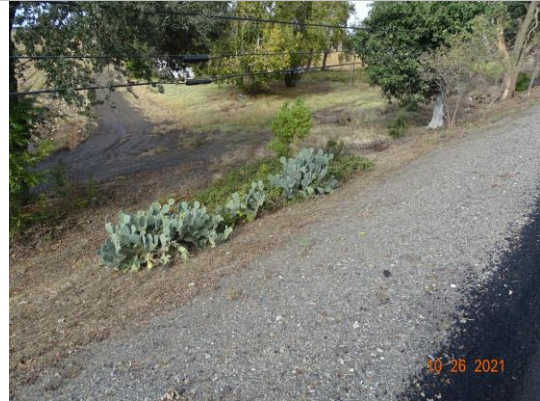
Cactus on the LS slope. Fall 2021