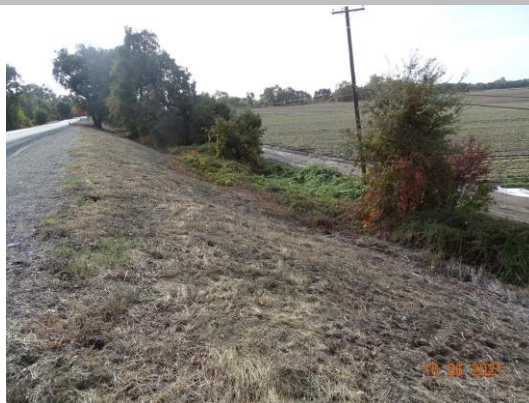
Berry growth on the LS toe. Fall 2021