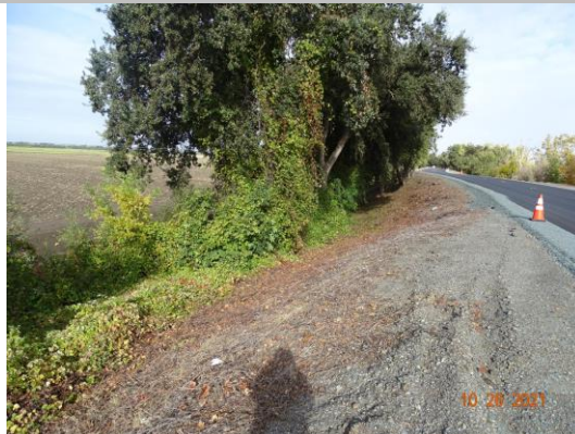
Berry/brush growth on the LS slope and in the easement. Fall 2021