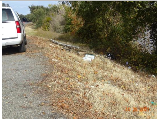
Debris pile on the WS slope. Fall 2021