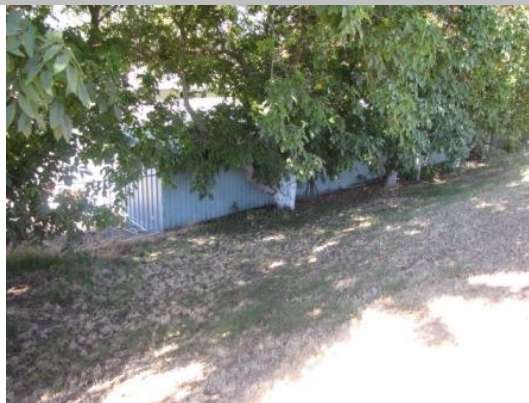
Looking northwest at buildings along landside toe.