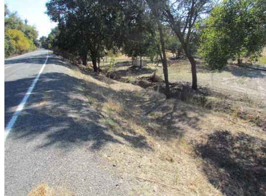
Looking southwest at irrigation ditch on landward toe.