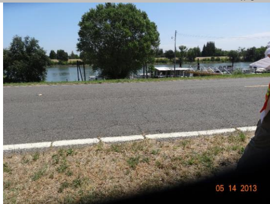
View of levee crown and waterward side.