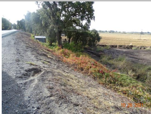
Berry and brush growth on the LS slope and in the easement. Fall 2021