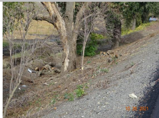
Wood/prunings pile in the WS easement. Fall 2021