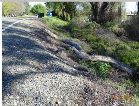
View looking upstream at fallen tree on levee slope. Spring 2019