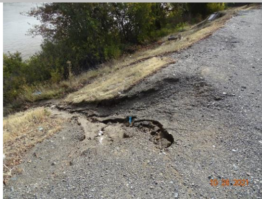
Erosion on the WS footpath. Fall 2021