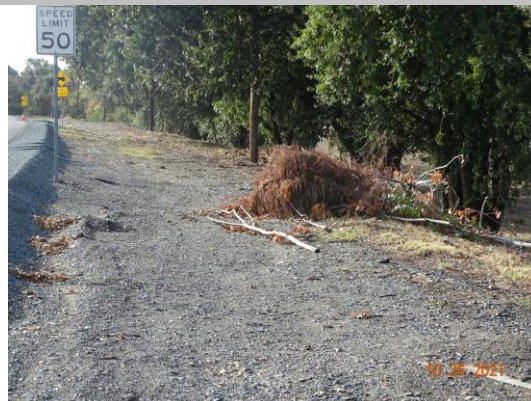
Prunings on the LS shoulder. Fall 2021