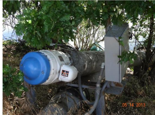
Close up of slant pump and control panel on waterward side.