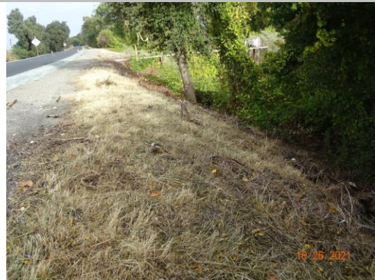
Decaying logs within 20' of the WS crown. Fall 2021