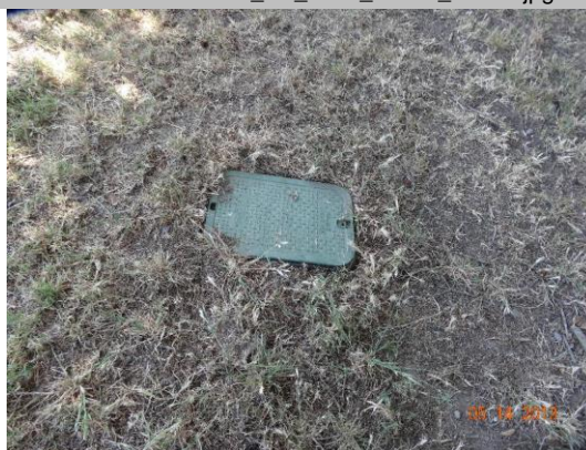
Utility box located on landward shoulder.