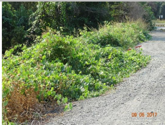
Looking southeast at the waterside slope.