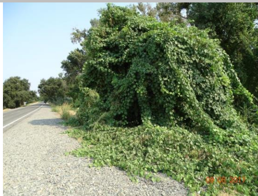
Looking northwest on waterside slope.