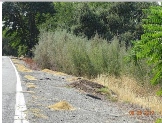
Looking south at the landside slope.