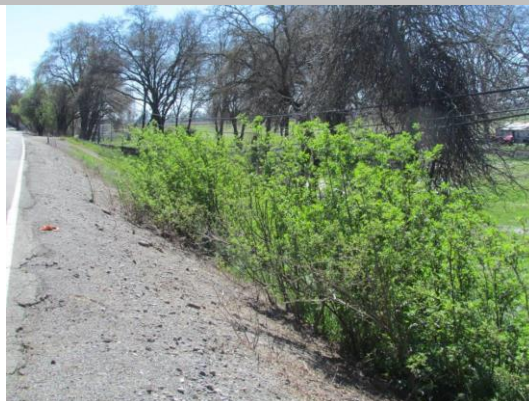
Looking south at new growth on landward slope. (Spring 2017)