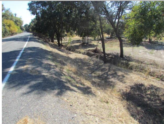
Looking southwest at irrigation ditch on landward toe.