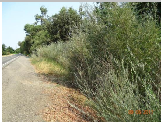
Looking northwest at the waterside slope.

LS : Land Side N/A : Not Applicable WS : Water Side CR : Crown