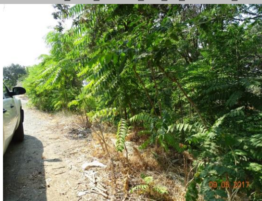
Looking south at the landside slope.