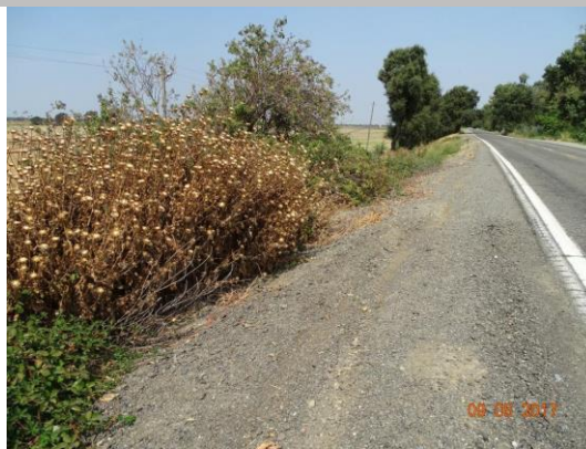
Looking northwest at the landside slope.