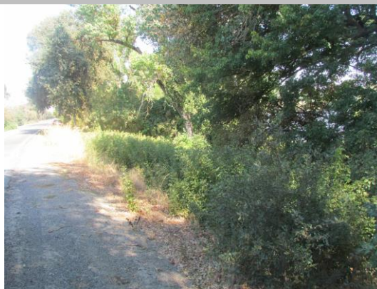
Looking north at wildroses and untrimmed trees on waterward shoulder and slope.

* Location LS : Land Side N/A : Not Applicable WS : Water Side CR : Crown