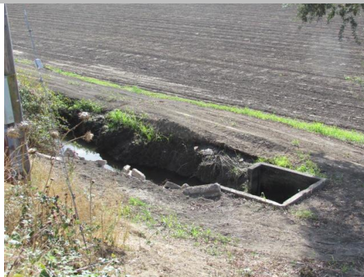
Looking southwest at irrigation ditch at landward toe. (Fall 2014)