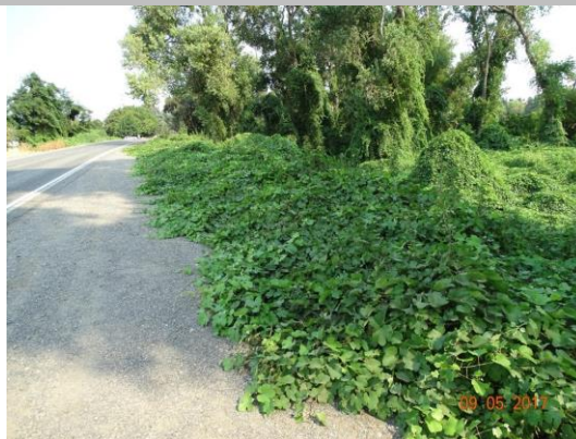
Looking northwest at waterside slope.