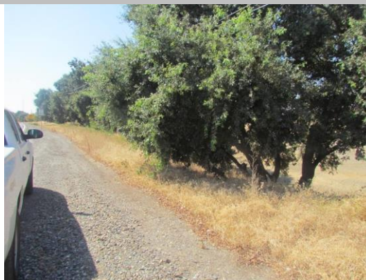
Looking southwest at untrimmed trees on landward slope. (Fall 2016)