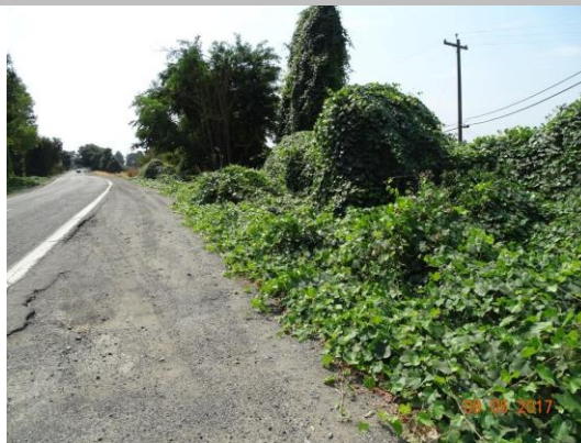
Looking south at the landside slope.