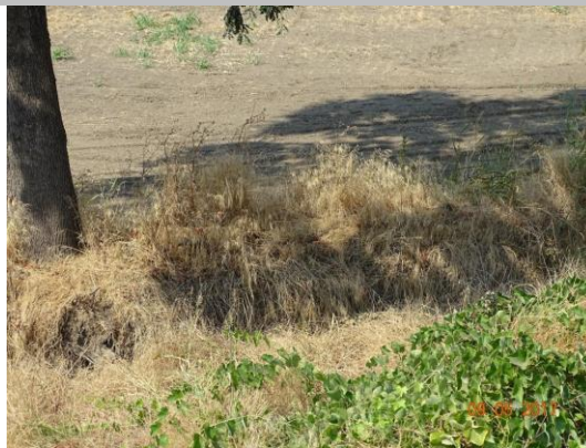
Looking northwest at the irrigation ditch on the landside toe.