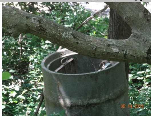
Concrete standpipe with 2 gates inside located on landward side.