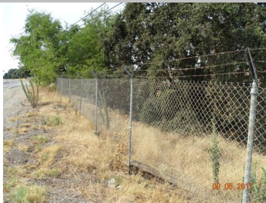
Looking southwest at the fence on the landside slope.