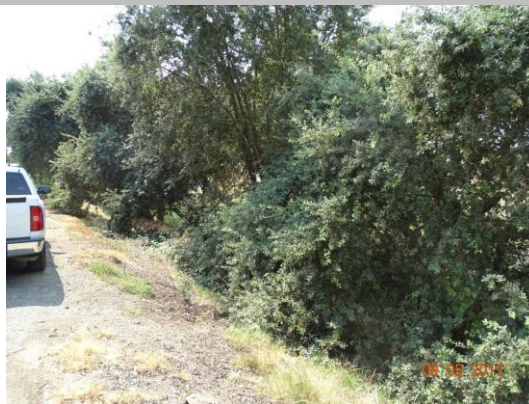
Looking south at landside slope.