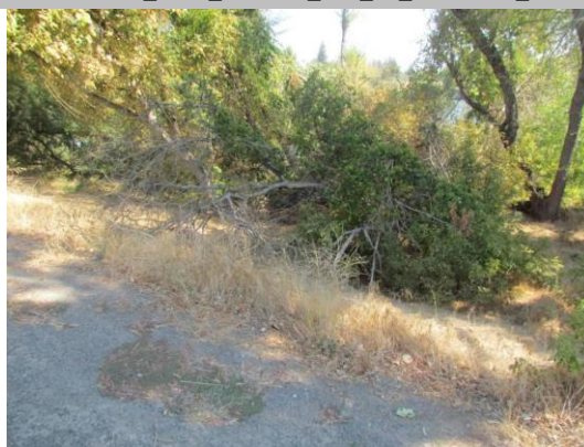
Looking northeast at fallen tree on waterward slope.