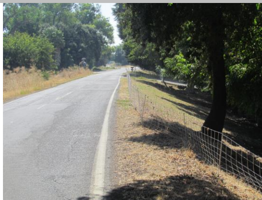
Looking south at fencing for goats on landward slope. (Fall 2016)