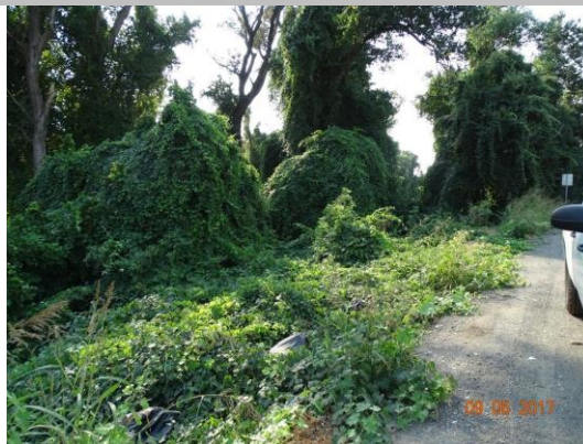
Looking southeast at waterside slope.