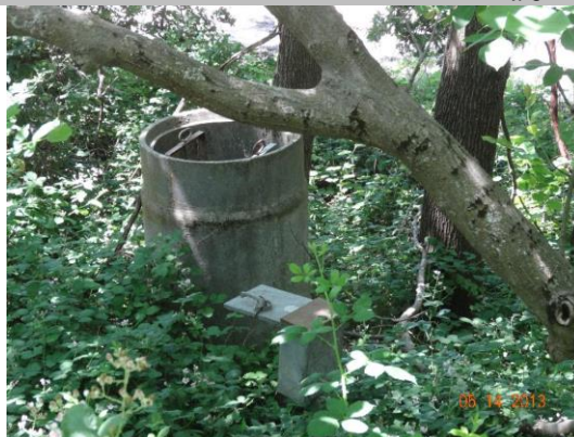
Overview of landward side--concrete standpipe and control panel located at toe.