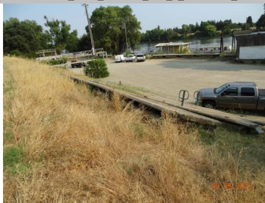
Looking north at the waterside slope.