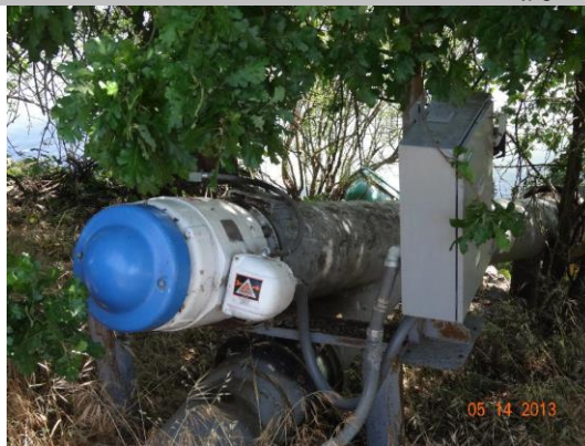
Close up of slant pump and control panel on waterward side.