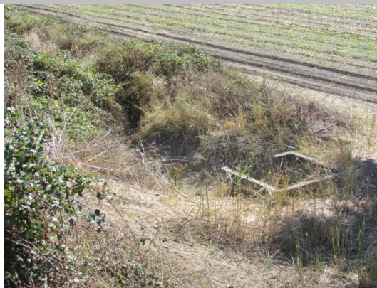
Looking southwest at irrigation ditch on landward toe.