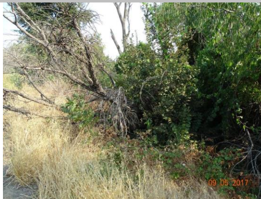
Looking north at the waterside slope.