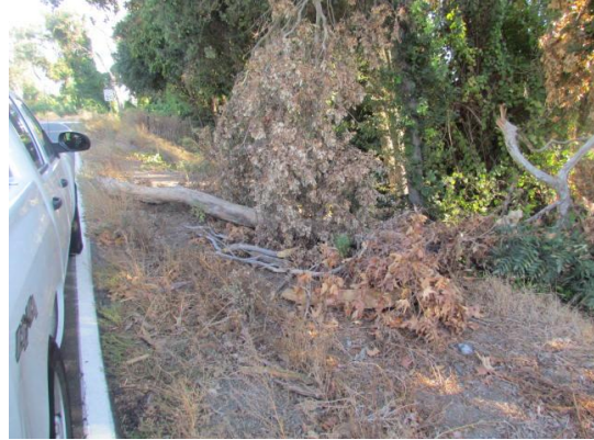
Looking northeast at broken and cracked tree branches on waterward slope.