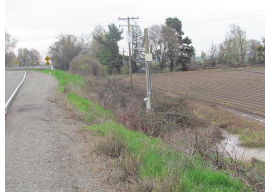
Looking southwest at berryvines on landside slope.