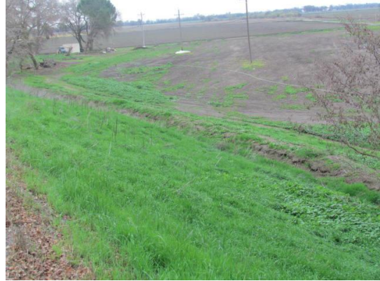
Looking southwest at irrigation ditch running along landward toe.