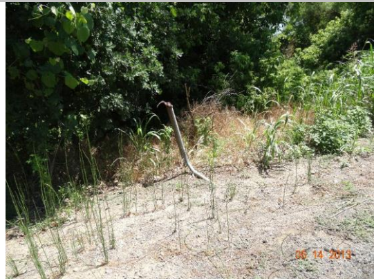
Conduits disconnected and damaged on waterward side.