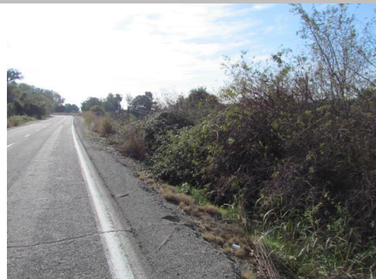
Looking south at dense vegetation on landside shoulder and slope. (November 2011)

Photo 1 of 6 : FA_2015_RD0765_211_29_20150914_00027.jpg