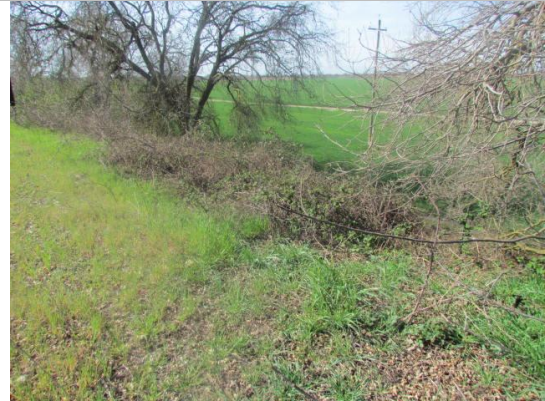
Looking at wild berryvines or wild roses on landside slope and toe.