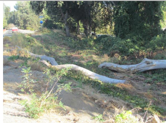
Looking at several tree branches on waterward slope and berm.