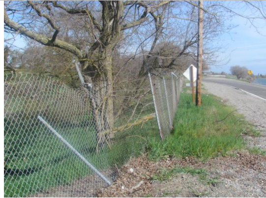
Looking north (upstream) at trees on landside slope.