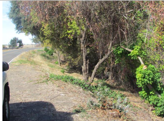
Looking north at trimmed trees on waterward slope. (Fall 2014)