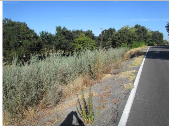
Looking south at typical view of vegetation on landward slope.