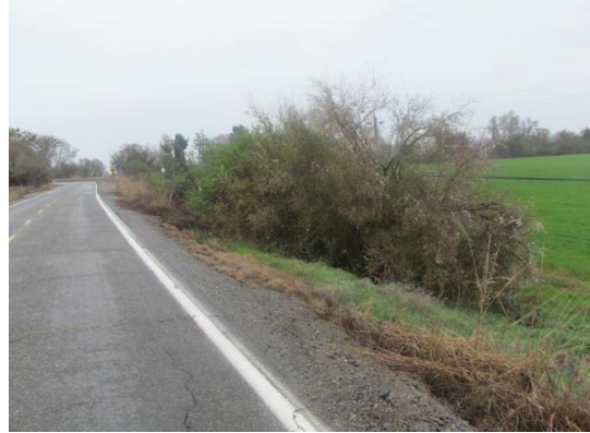
Looking south at dense vegetation on landside slope and toe spring 2012.