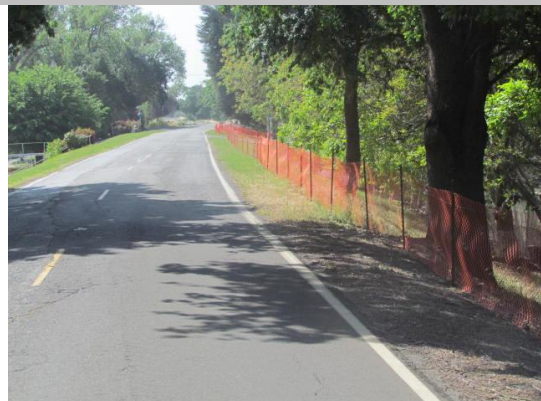
Looking south at temporary fence on landward shoulder.