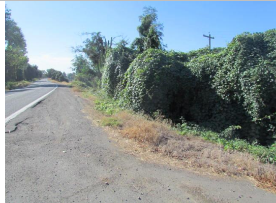
Looking south from LM 1.28 at typical view of vegetation on landward slope.