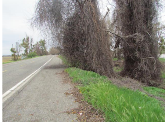
Looking north at untrimmed trees on waterward slope.