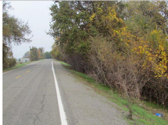
Looking north at dense vegetation on waterside slope. (Fall Inspection 2012)