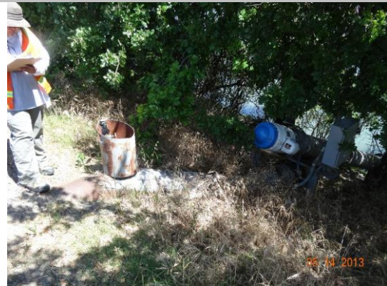
Siphon breaker encased in steel casing located on waterward side.