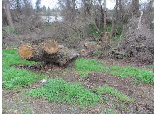
Looking east at large tree limb on waterward slope.