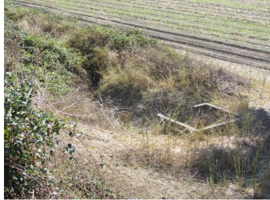
Looking southwest at irrigation ditch on landward toe.