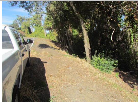
Looking north (upstream) at trimmed trees on landward slope. (Fall 2014)