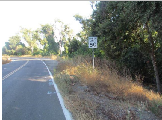
Looking north from LM 1.70 at typical view of vegetation on waterward slope.