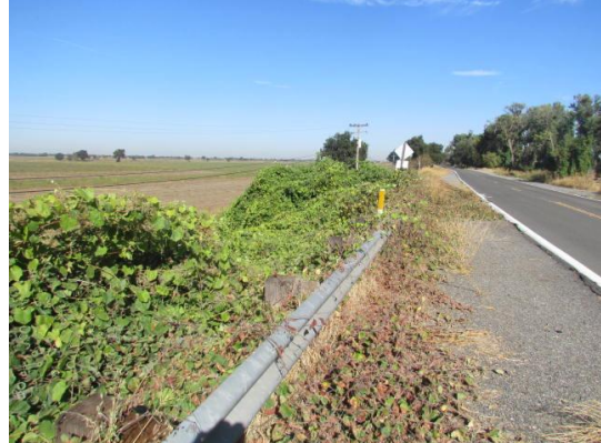
Looking north from LM. 1.65 at dense vegetation on landward slope.