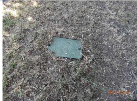
Utility box located on landward shoulder.