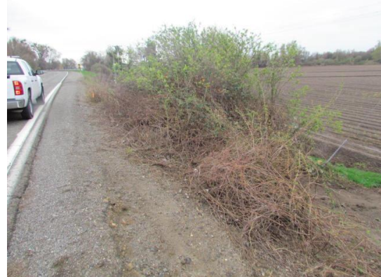
Looking southwest at vegetation on landside slope.