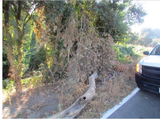
Looking south at broken and cracked tree branches on waterward slope.