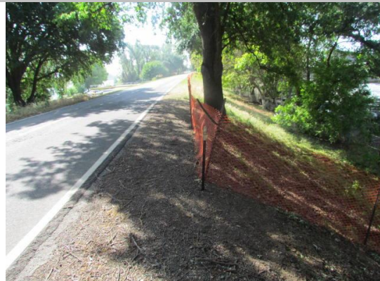
Looking south at temporary fence on landward slope.