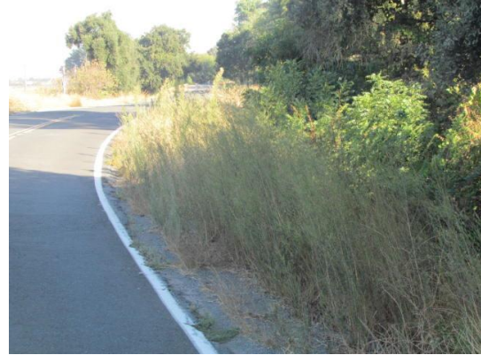
Looking northeast from LM 1.29 at typical view of vegetation on waterward slope.