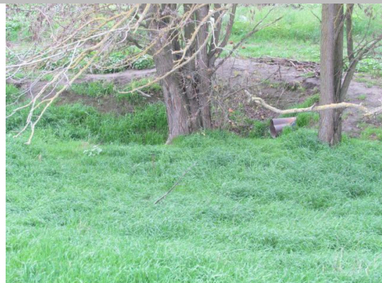
Looking west at irrigation ditch at landward toe.