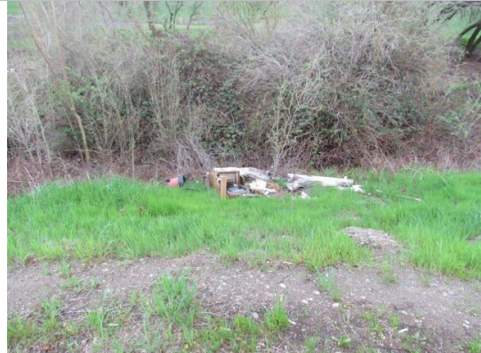
Looking west at garbage on landside slope.