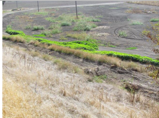
Looking southwest at irrigation ditch filled in.