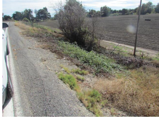
Looking south at moderate vegetation on landward slope and toe. (Fall 2014)