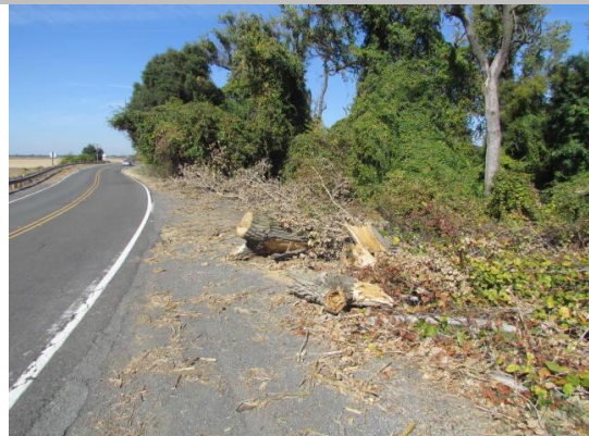
Looking northeast at tree limbs on waterward slope.