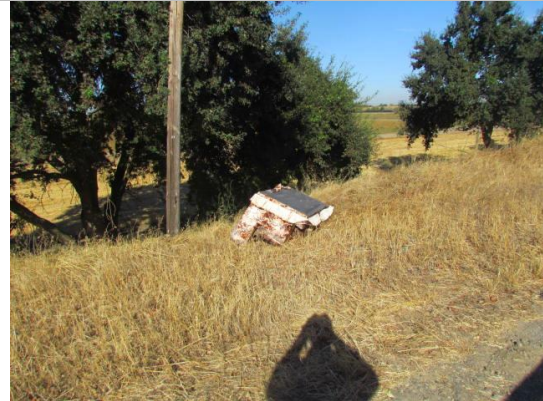
Looking westly at garbage on landward shoulder.