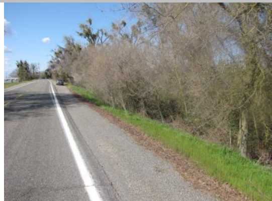
Looking upstream (north) at dense trees on waterside slope.