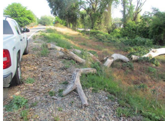
Looking north at down tree across waterward slope.