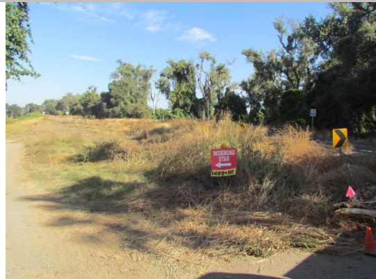
Looking northeast from LM 1.71 at typical view of vegetation on landward slope.