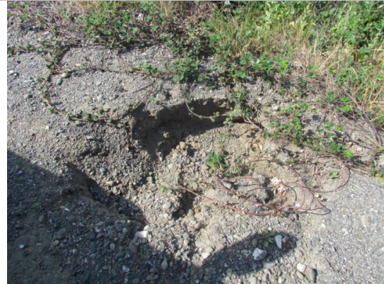
Looking east at caving on landward shoulder.