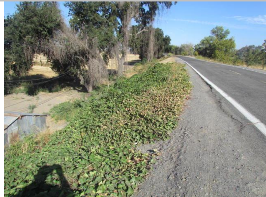
Looking north at typical view of vegetation on landward slope.