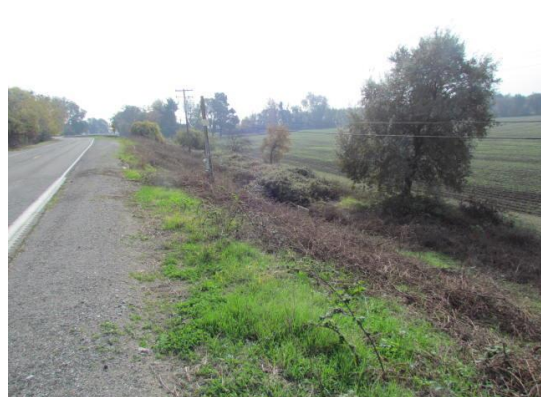
Looking southwest at vegetation on landside slope and toe. (Fall Inspection 2012)