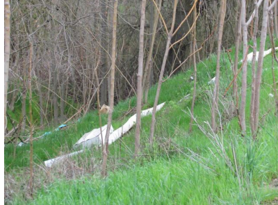
Looking northwest at garbage on landside slope.