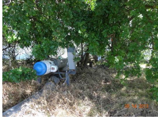
View of waterward side--pipe, pump, control panels, and electrical conduit.