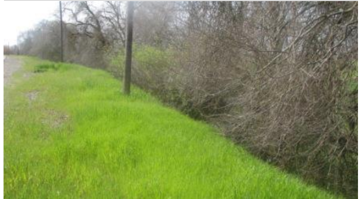
Looking downstream (south) at trees on landside slope &amp; toe.