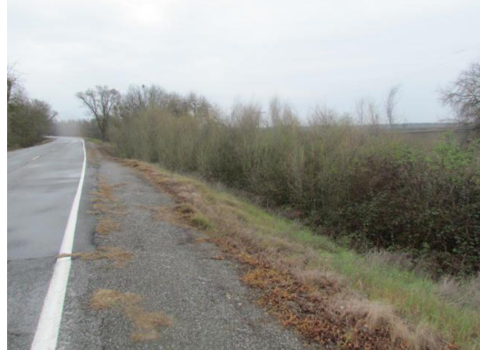
Looking southwest at dense vegetation on landside slope and toe.