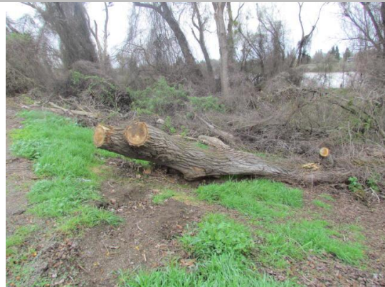
Looking north at large tree limb on waterward slope.