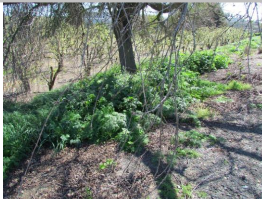
Tall weeds on the landside slope and shoulder.