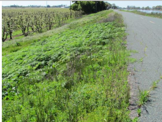
Tall weed present on shoulder and slope taller than 15".