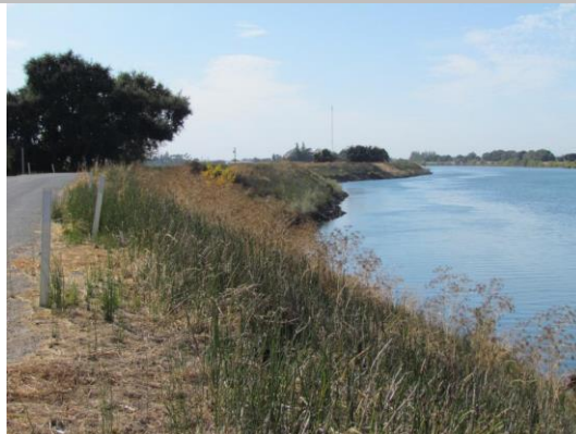
RD 755 Waterside levee mile 0.17-1.82 levee slope covered with tall weeds such as sweet anise, snap grass and other unsatisfactory weed growth.