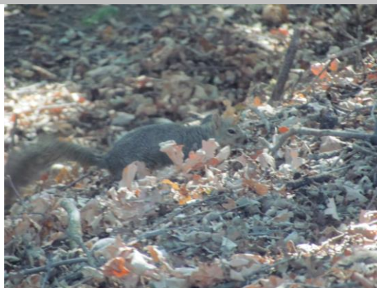
One of many active rodent observed during this inspection.