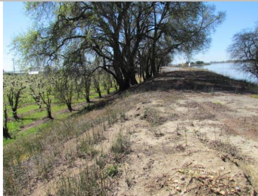
Looking downstream from levee mile 0.11 landside slope.