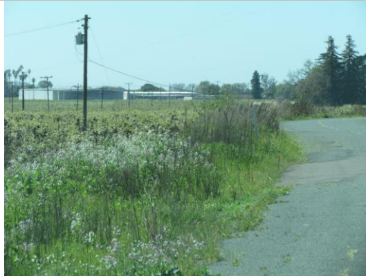
Looking at tall weeds along the landside levee shoulder and slope.