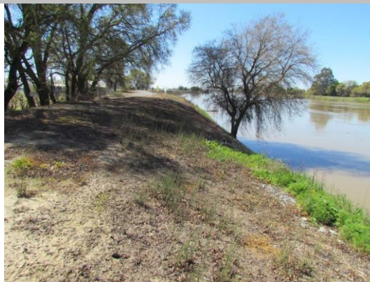
Looking downstream from levee mile 0.11 waterside slope to levee mile 0.17.