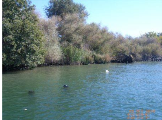
USACE 2013 Photo #1