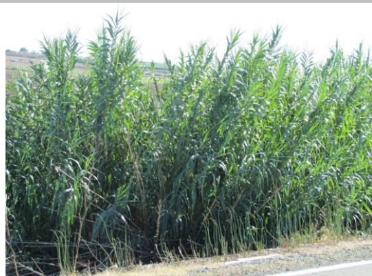
RD 556 Unit 2 looking downstream from the landside shoulder levee miles 4.21-4.22.