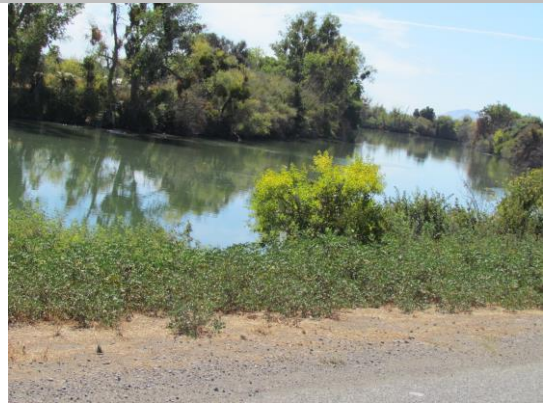
Looking downstream from levee mile 1.27- 1.55 wild roses on waterside slope and berm.