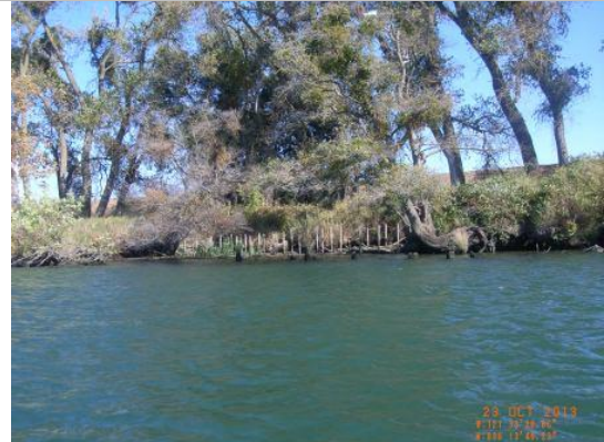
USACE 2013 Photo #1