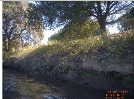
USACE 2013 Photo #1