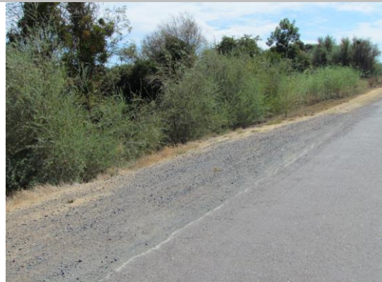
Looking downstream from levee mile 3.32-3.92 waterside unsatisfactory growth of willows blocks the view of the slope.