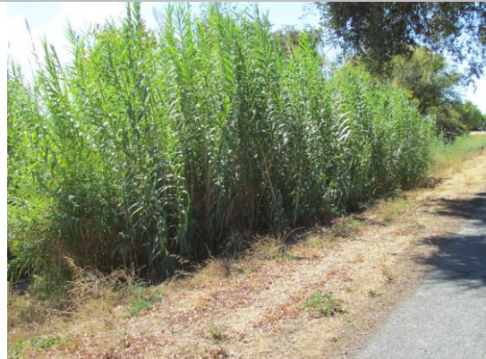
Looking downstream from waterside shoulder, arundo blocking view of levee section.