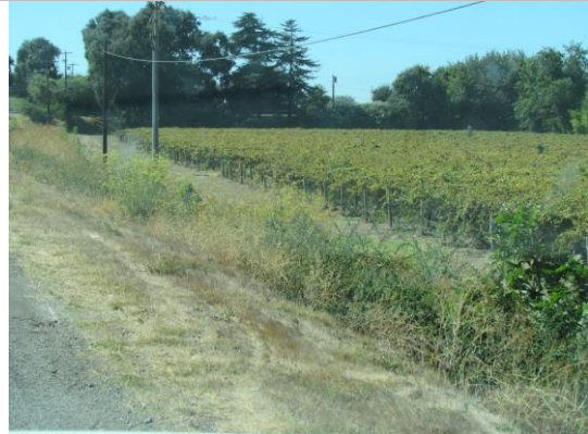
Looking downstream from landside levee mile 1.72-1.95 unsatisfactory tall weed growth on the slope and toe.