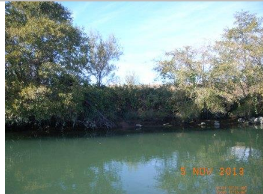
USACE 2013 Photo #1