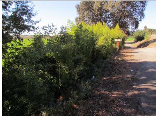
Unsatisfactory growth of bambo on the landside shoulder.