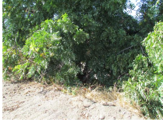
Looking downstream from the landside slope unsatisfactory woody tree growth blocking view of levee section.