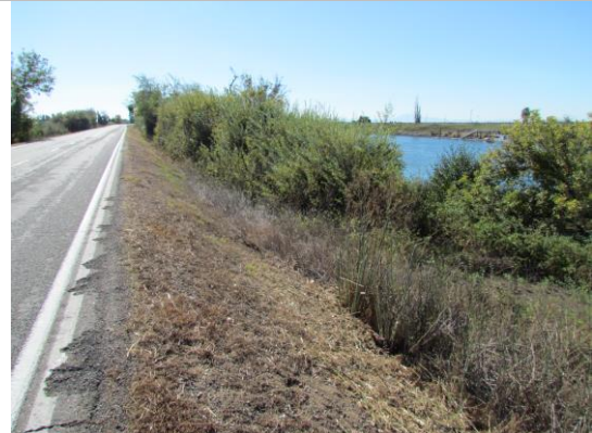
Looking downstream from the waterside levee slope at the bambo and other unsatisfactory weeds covering the levee slope from 3.16 to 5.58.