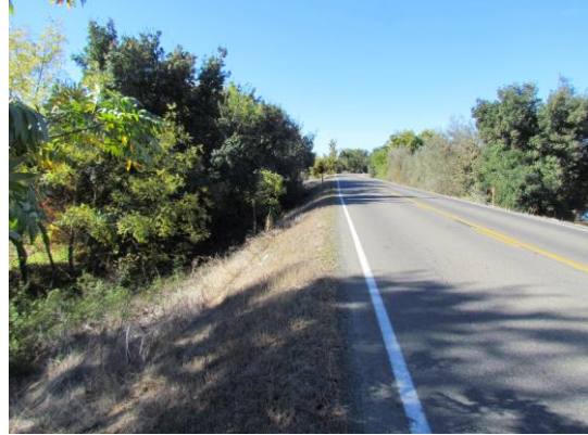
Looking downstream from the landside levee slope levee mile ,0.57.