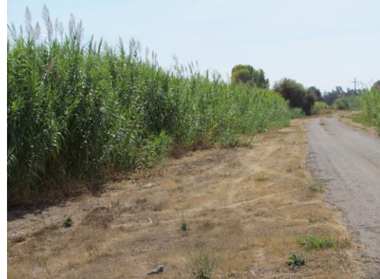
Looking downstream on waterside the arundo completely covering the levee section.