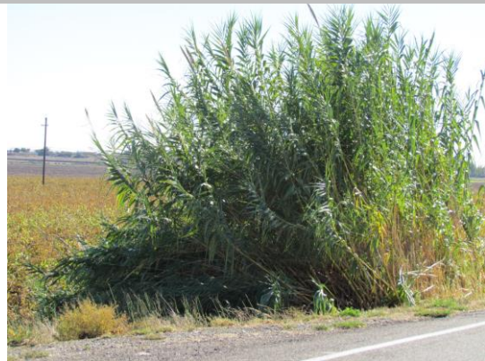
Landside levee shoulder levee mile 3.99 RD 556 Unit 2.