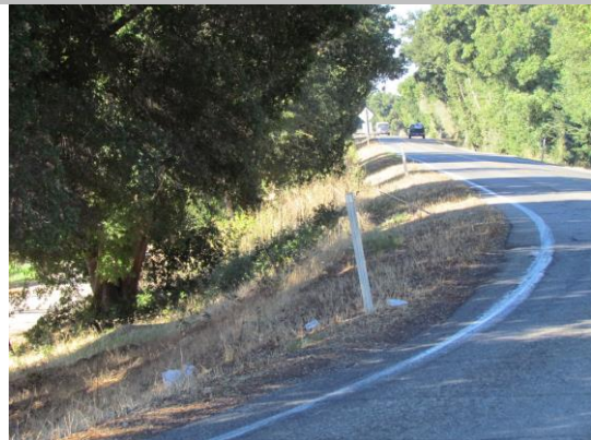
RD 556 Unit 2 looking downstream from the landside shoulder wild weeds present on the levee slope and toe.