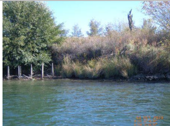
USACE 2013 Photo #1