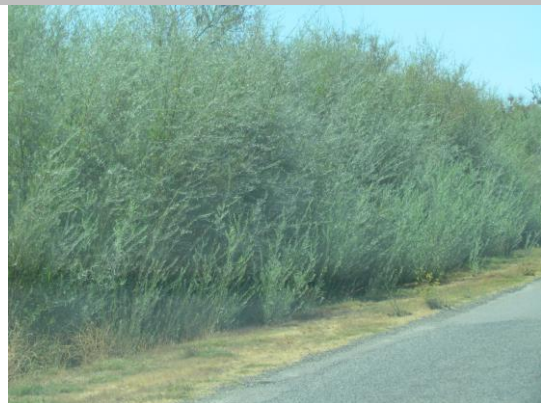
Levee mile 1.74-2.00 waterside wild growth of arundo present on levee shoulder and slope, unable to see the ground.