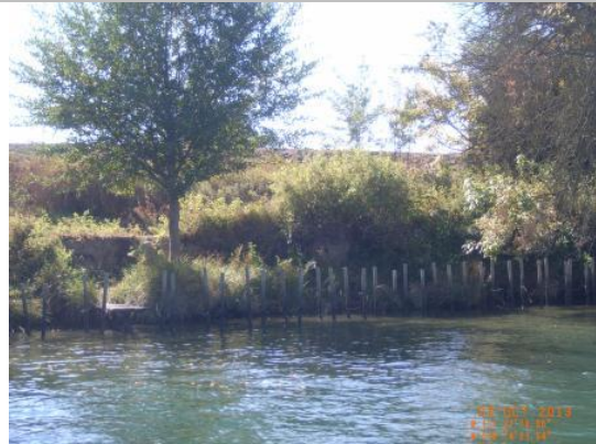
USACE 2013 Photo #1