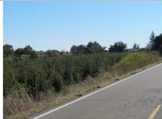
Looking downstream landside at wild roses bamboo and other growth covering the slope.