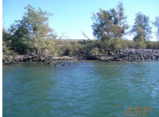
USACE 2013 Photo #1