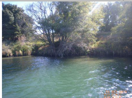
USACE 2013 Photo #1