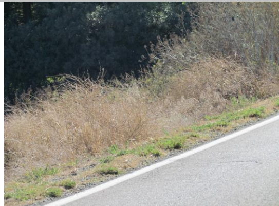
RD 556 Unit 2 looking downstream from levee miles 4.31 - 5.31 unsatisfactory tall weed growth on the landside levee slope.