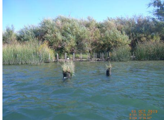
USACE 2013 Photo #1