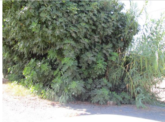
Unsatisfactory woody tree growth and arundo blocking view of landside levee shoulder and slope.