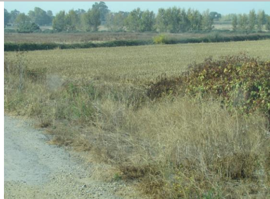
Unwanted tall weeds and berries growing on the landside slope and toe.