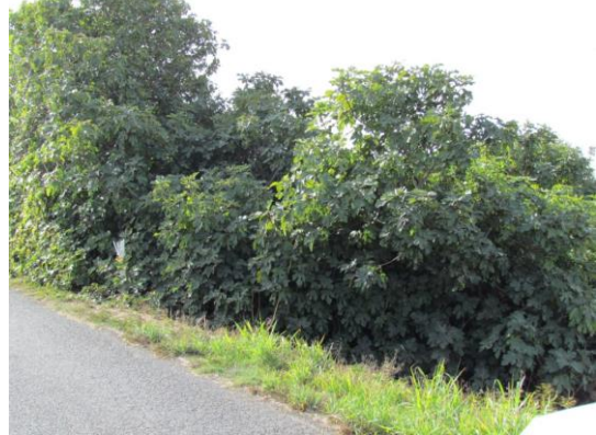
Unsatisfactory tree growth completely blocking visibility of the levee section at this location.