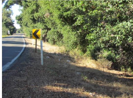
RD 556 Levee mile 0.00 waterside looking downstream.