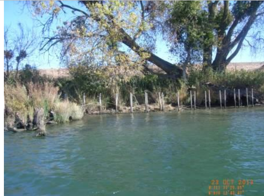
USACE 2013 Photo #1