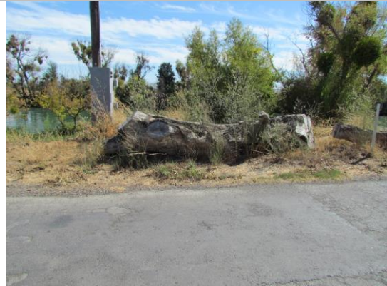
Unsatisfactory dumping of cut up tree sections on the waterside levee shoulder.