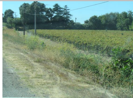
Looking downstream from landside levee mile 1.72-1.95 unsatisfactory tall weed growth on the slope and toe.