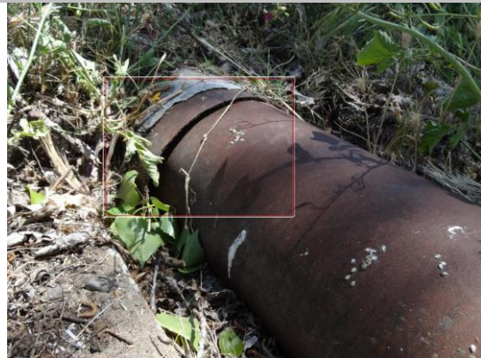
WS- 9-inch pipe sleeved through 10 inch steel pipe.