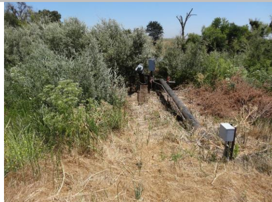
WS view: Slant pump, 12-inch and 1-inch pipe through levee.