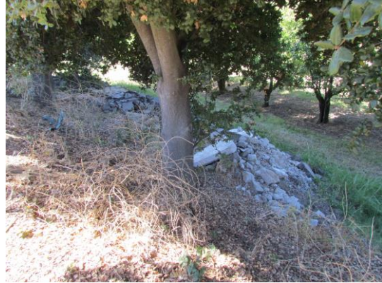
Unauthorized pile of asphalt and concrete dumped on the landside levee toe.