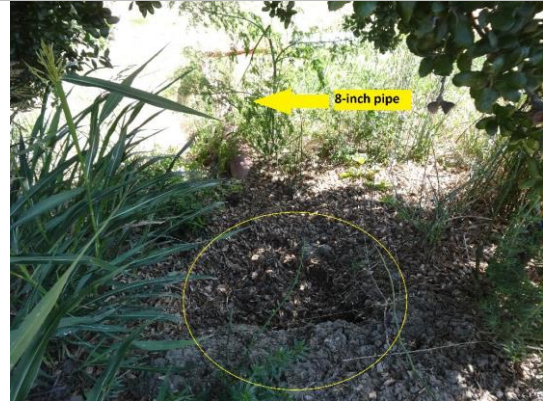
LS view: 8-inch pipe off LS slope with possible erosion above pipe (circled).