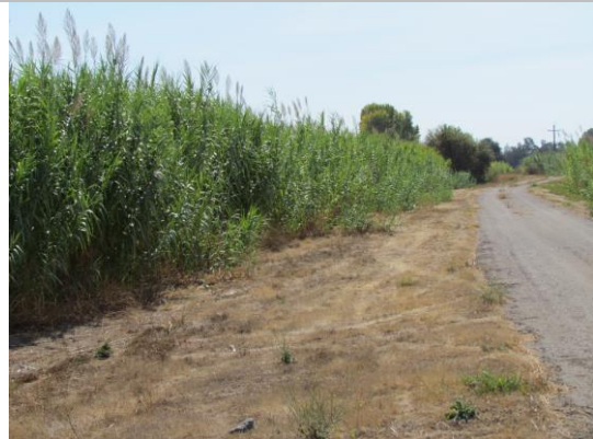
Looking downstream on waterside the arundo completely covering the levee section.