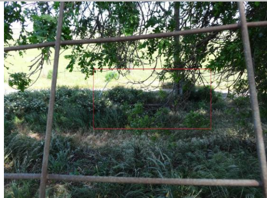
LS- concrete distribution box near levee toe.