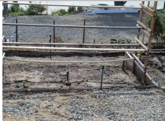
Landowner has dug into waterward slope and placed planterboxes.