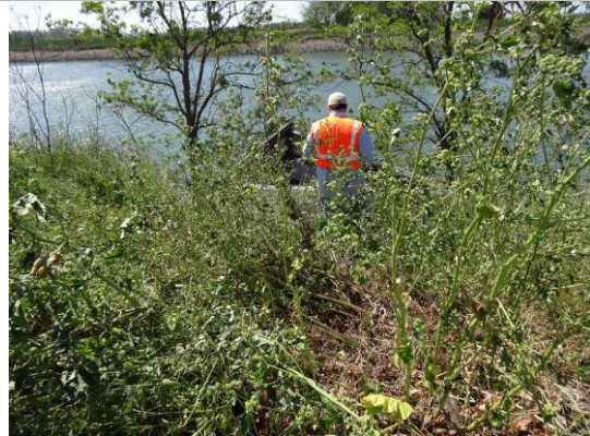
WS- pump house on levee slope.