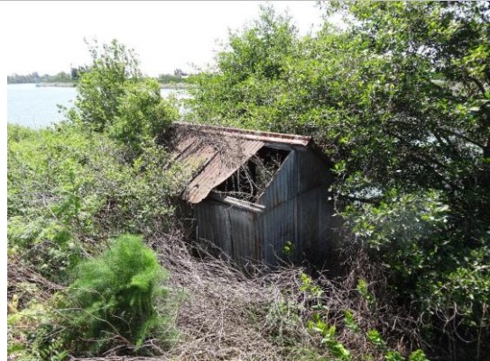
WS- abandoned pump house on levee slope. Dense vegetation on levee slope.