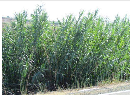
RD 556 Unit 2 looking downstream from the landside shoulder levee miles 4.21-4.22.