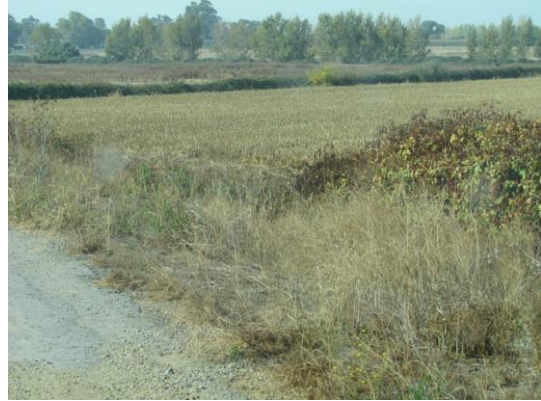
Unwanted tall weeds and berries growing on the landside slope and toe.