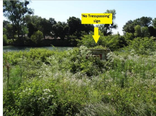
View of WS. Dense vegetation limited visibility of 'No Trespassing' sign.