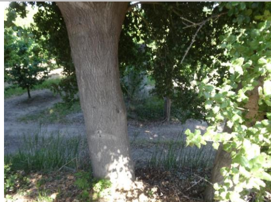
View of LS with standpipe visible behind tree.