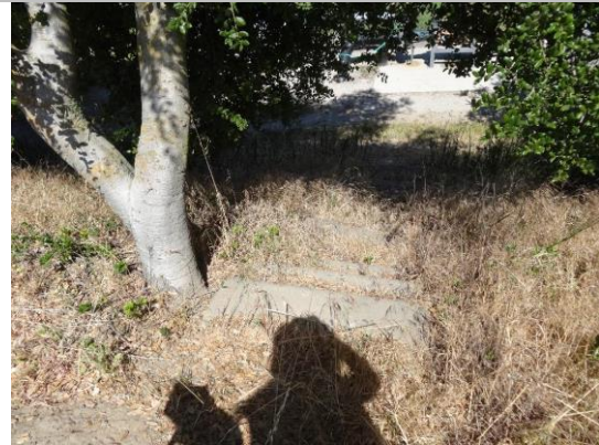
Concrete steps on LS slope.