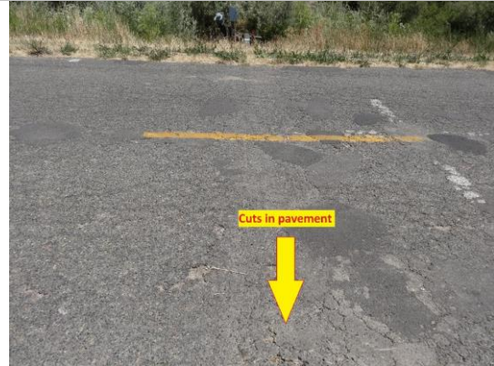
View toward WS with cuts in pavement in alignment with pipe on WS