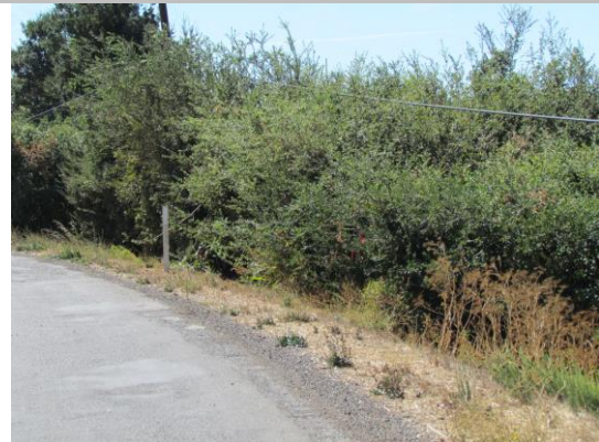
Unsatisfactory woody tree growth on the landside shoulder and slope.