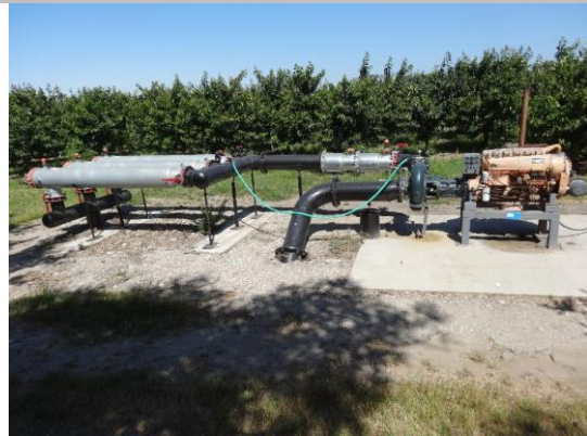
Pump and pipe into levee off LS toe.