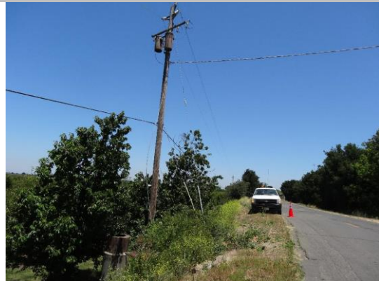
Service pole next to standpipe off LS toe.