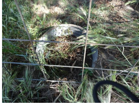
LS- obstructed siphon breaker in CMP riser on levee slope.