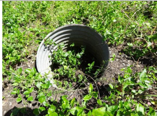
LS- siphon breaker in CMP riser on levee slope.