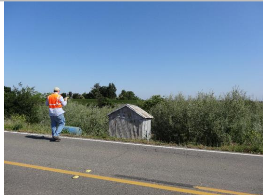
WS- pump house on levee berm