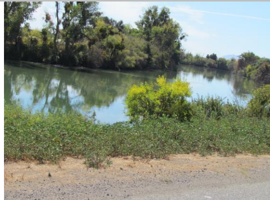
Looking downstream from levee mile 1.27- 1.55 wild roses on waterside slope and berm.