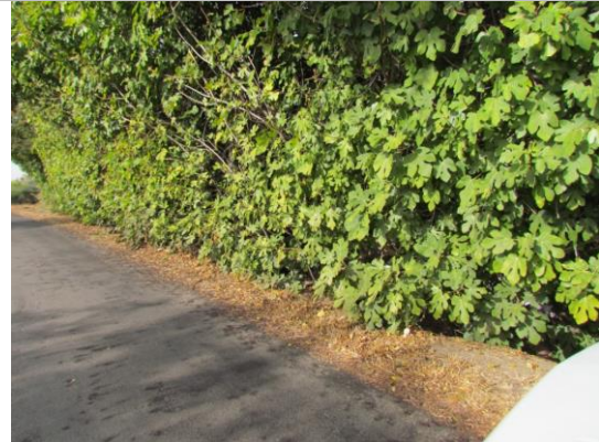
Remove unwanted fig trees present on the landside slope.