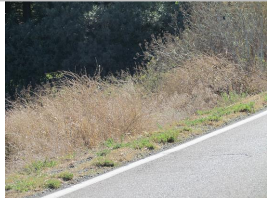
RD 556 Unit 2 looking downstream from levee miles 4.31 - 5.31 unsatisfactory tall weed growth on the landside levee slope.