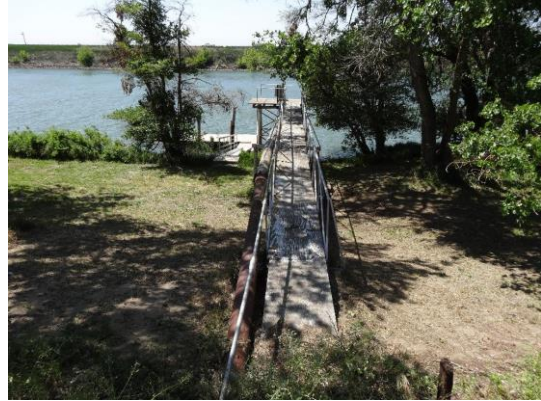
WS- walkway, pump, and pipe on steel pile structure in the river.