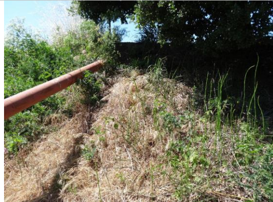
View up LS slope. 10" pipe (not visible) rests next to (visible) 8" pipe.