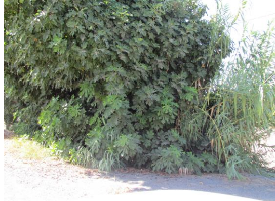
Unsatisfactory woody tree growth and arundo blocking view of landside levee shoulder and slope.