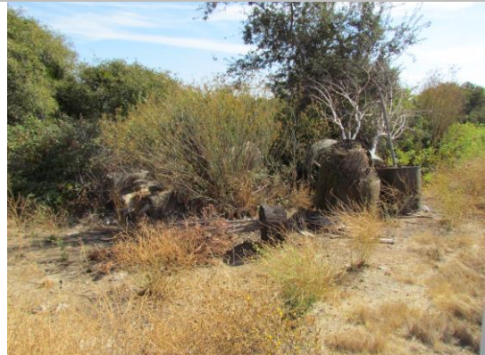
At this location the landowner has discarded concrete pipe and plant containers on the waterside levee shoulder.