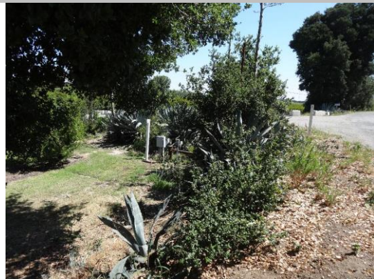
Pipe, standpipe, electrical box at LS toe. Pumphouse in bush behind electrical box.