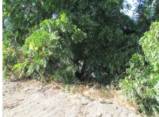
Looking downstream from the landside slope unsatisfactory woody tree growth blocking view of levee section.