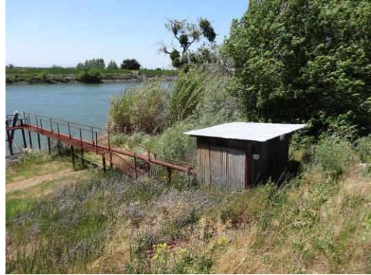
WS- pipe and pump on steel pile structure. Steel walkway from pump house to the pump on steel structure.