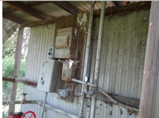
WS- power control panel and electric conduit in pump house.