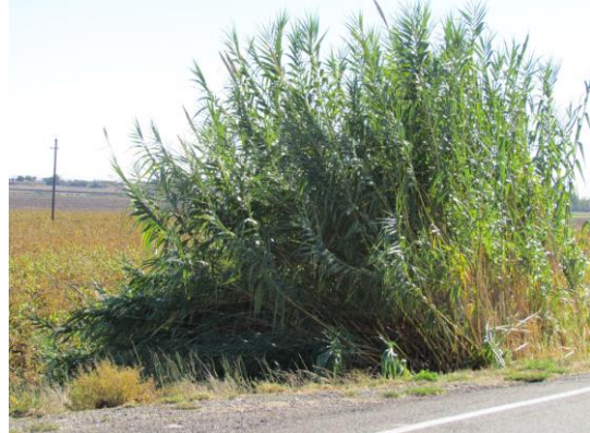
Landside levee shoulder levee mile 3.99 RD 556 Unit 2.