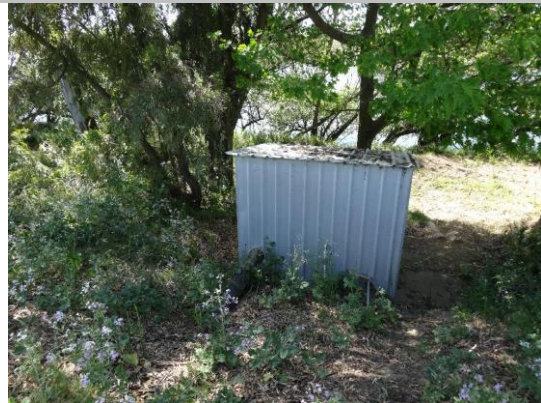
WS- pump house on levee slope