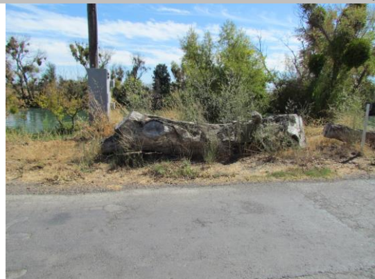
Unsatisfactory dumping of cut up tree sections on the waterside levee shoulder.