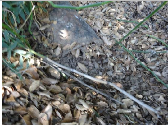
Closeup of abandoned pipe.