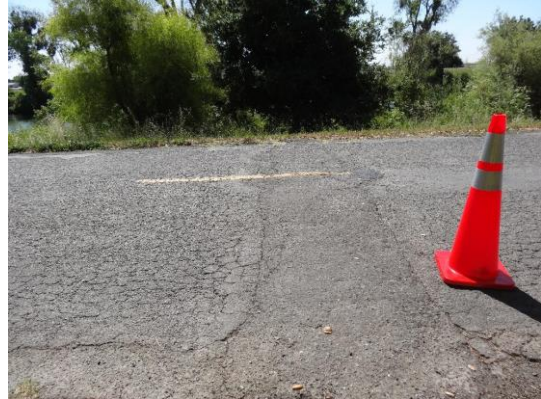
View of WS with cuts visible on pavement.