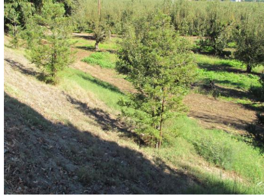
RD 556 Unit 2 Levee mile 2.28 unauthorized planting of redwood trees planted on the slope.