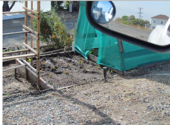
Continue placement of unauthorized planter boxes into levee slope waterside.