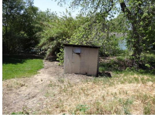
WS- pump house on levee berm.