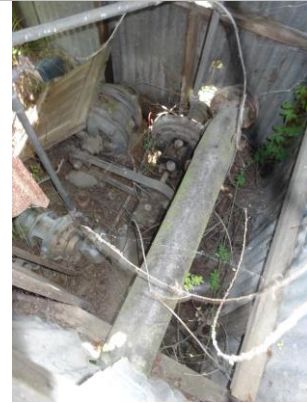
WS- abandoned gate valve, pump, and pipe in pump house