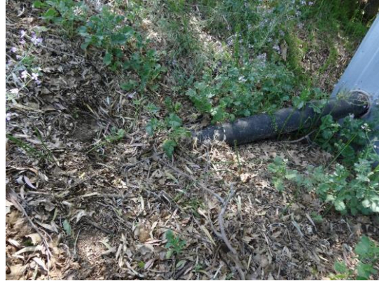
WS- pipe daylight from the levee.