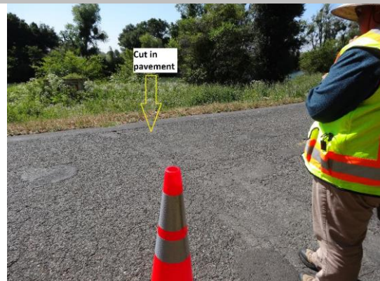
View of WS; cut in pavement in alignment with arrow and Olivia indicating location of crossing trench.