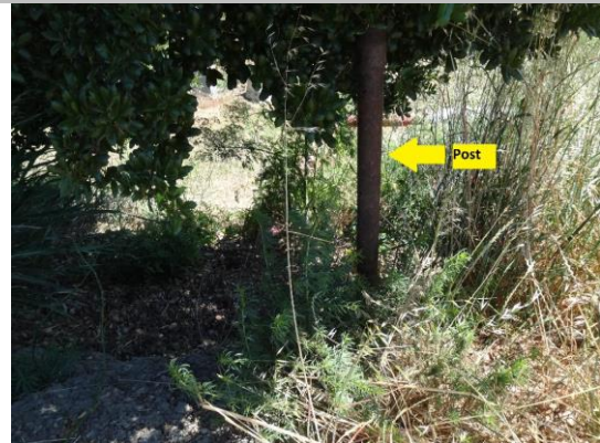
LS view: Post located above pipe on LS slope.