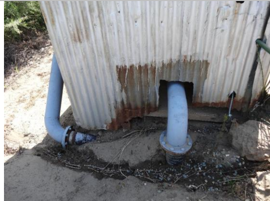
WS- pipe daylight from the pump house.