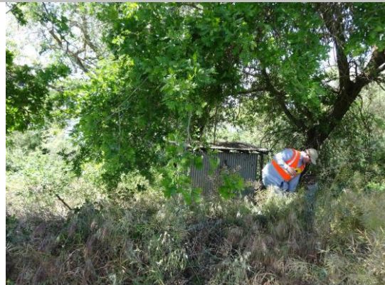
WS- pump house on levee berm