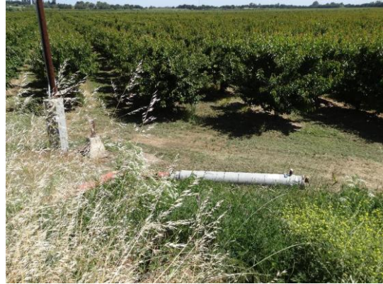
Electric pole next to pipe on LS.