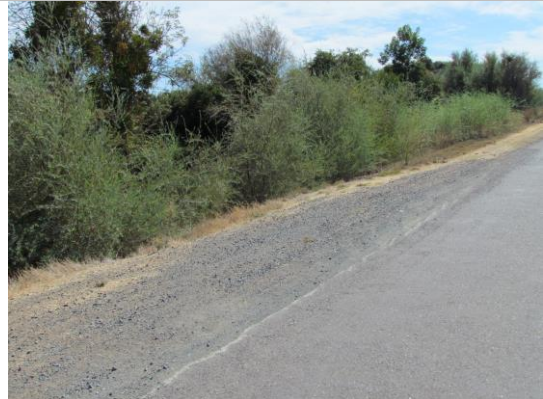
Looking downstream from levee mile 3.32-3.92 waterside unsatisfactory growth of willows blocks the view of the slope.