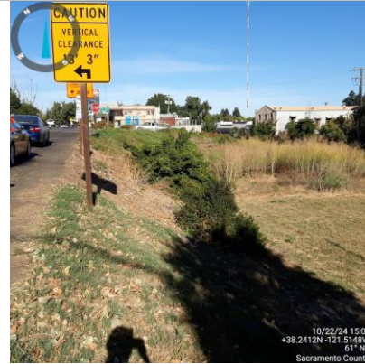
View of shrubs on the landside slope. (Fall 2024)