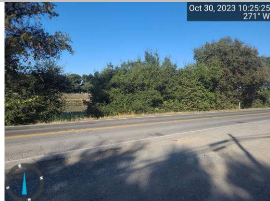
View of low hanging trees on the waterside slope (Fall 2023).