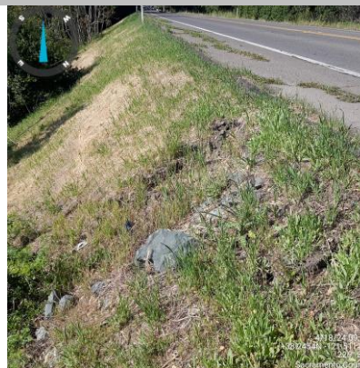
View looking down eroded gully in the LS slope. (Spring 2024)