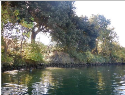
USACE 2018 Erosion Photo #1