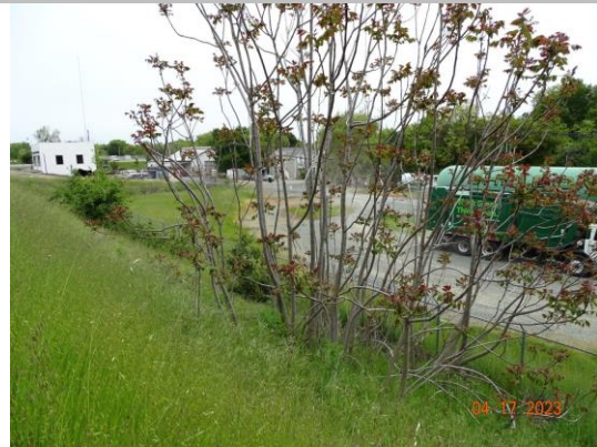
View of the tree on the LS slope (Spring 2023).