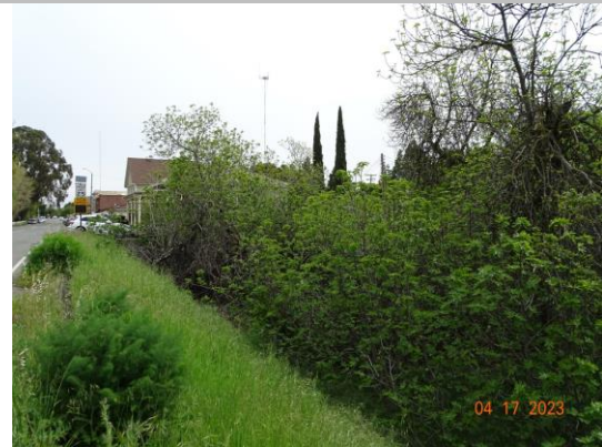
View of the trees on the LS slope (Spring 2023).