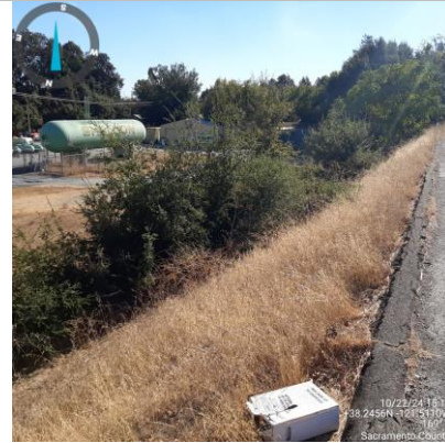
View looking downstream at vegetation on the landside slope. (Fall 2024)