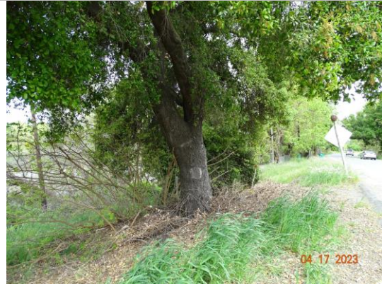
View of the trees on the WS slope (Spring 2023).