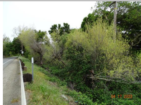
View of the trees on the LS slope (Spring 2023).