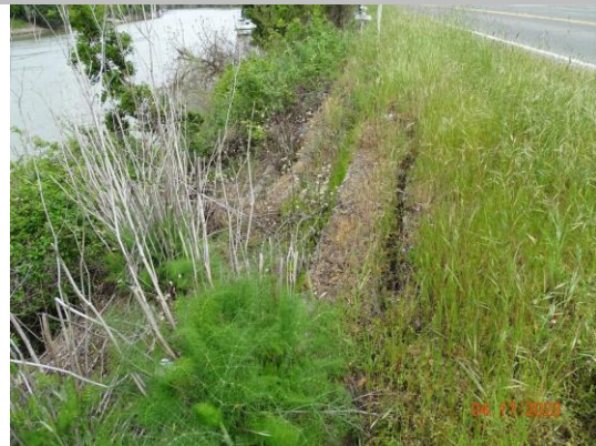
View of the erosion on the WS slope (Spring 2023).