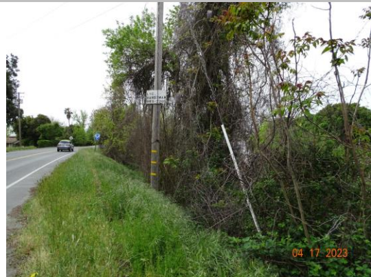
View of the trees on the WS slope (Spring 2023).