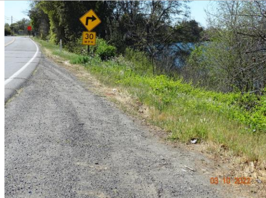
View looking downstream at vegetation on the top of the waterside slope (Spring 2022).