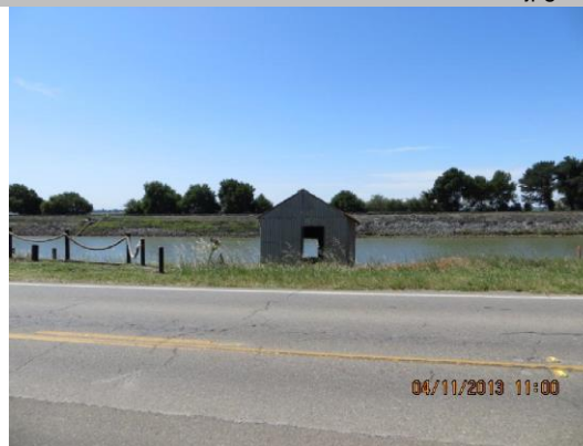
Relocated pumphouse on WS shoulder.