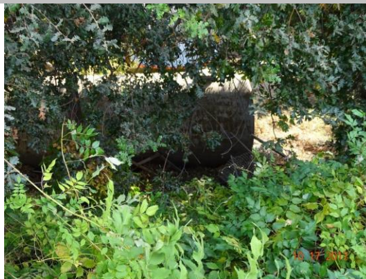
Tank at landside toe should be removed to allow inspection and access.