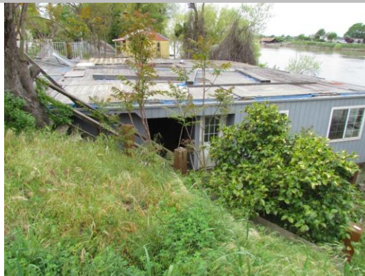
Photo taken 4-06-2017 no change. No work done, no permit issued.