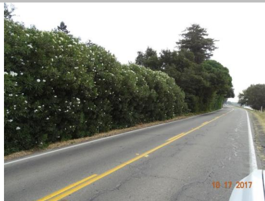
View of landscaping on landside slope and toe.