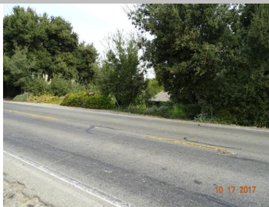
View of landscaping on landside slope and toe.