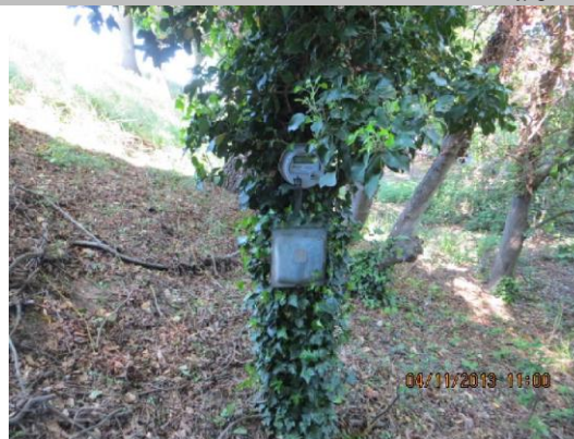
Meter on pole at LS toe.