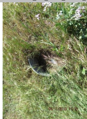
Siphon breaker in 24-inch CMP riser on LS slope.