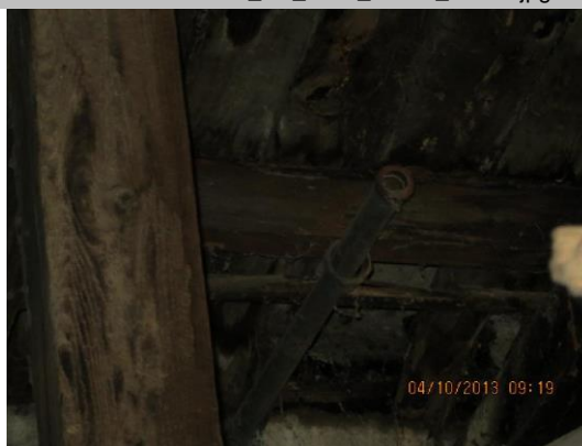
Various disconnected pipes visible at foundation/retaining wall under buildings on LS.