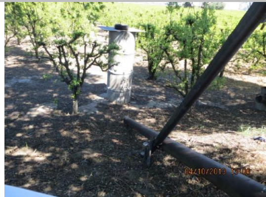
48-inch concrete riser on LS toe.