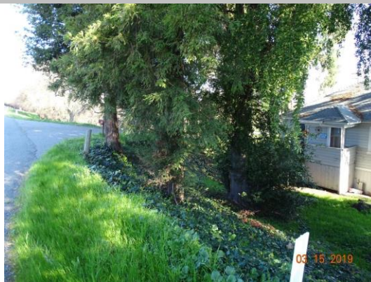
View looking upstream at landscaping on the landside slope (Spring 2019).