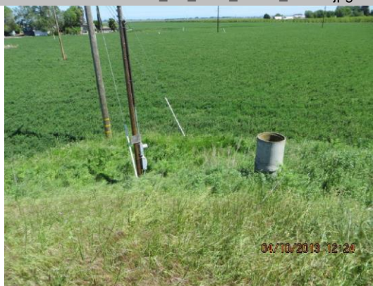
JP and concrete standpipe on LS toe.