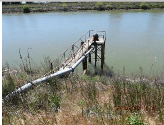
10-inch steel irrigation pipe and steel pump structure on WS toe.