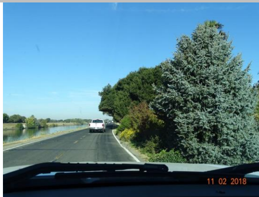
View looking upstream at landscaping on the landside slope (November 2018).