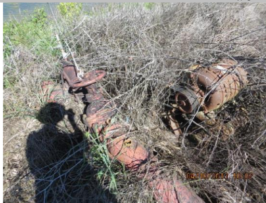
Pump, slide gate, and missing vent pipe on WS slope.