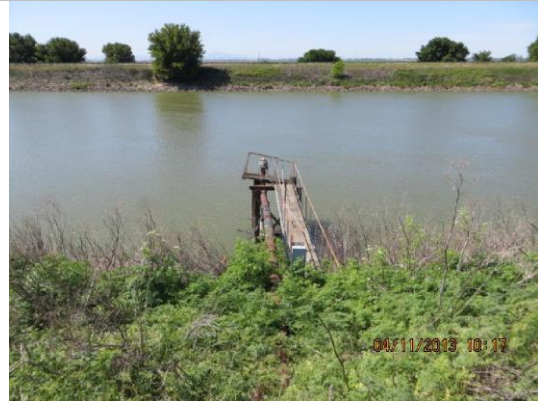
Pump on pier showing structural failure on WS toe.