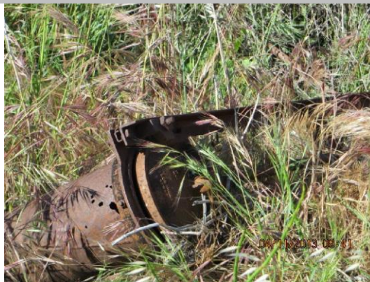
Abandoned slide gate on WS slope.