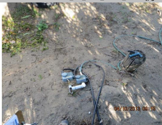
Irrigation pipes on WS slope.