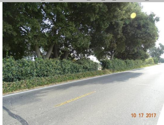
View of landscaping on landside slope and toe.