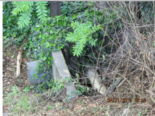
Pipe in distribution box at LS toe.