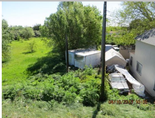
JP and pipe covered with vegetation on LS toe.

* Location LS : Land Side N/A : Not Applicable WS : Water Side CR : Crown