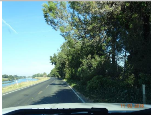
View looking upstream at landscaping on the landside slope (November 2018).