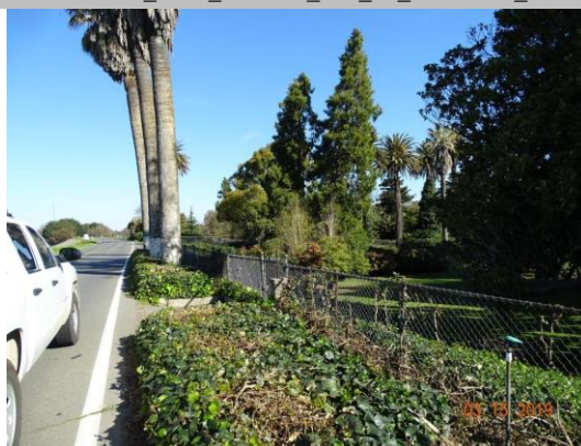
View looking upstream at chainlink fence on the landside slope (Spring 2019).