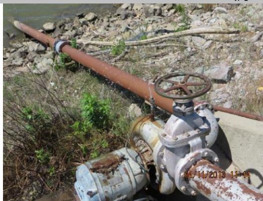
Pump and slide gate at Concrete pad on WS slope.