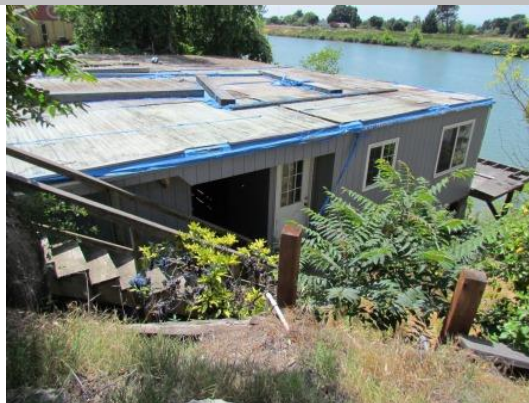
Building and steps waterward. Photo taken 01-04-2014.