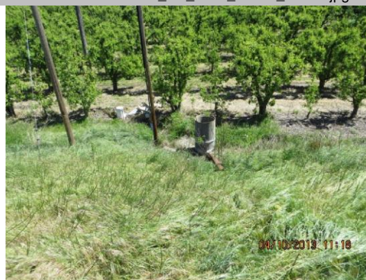
36-inch concrete standpipe at LS toe.