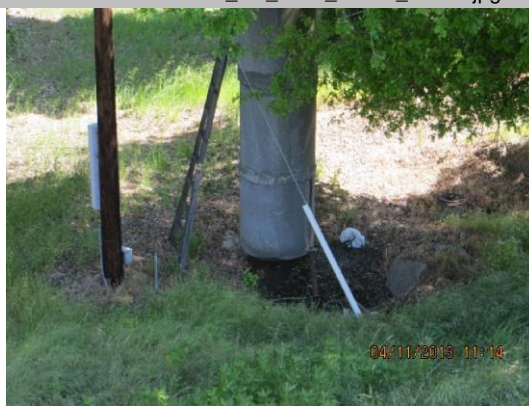
Concrete standpipe, JP and meter, and 4-inch steel pipe visible at LS toe.