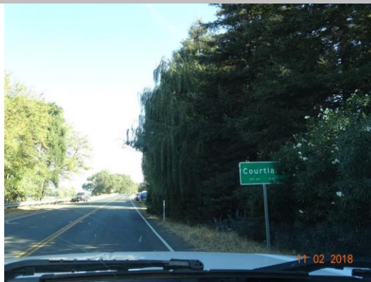
View looking upstream at landscaping on the landside slope (November 2018).