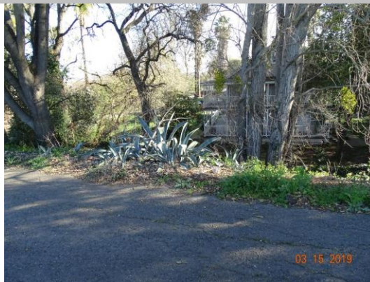
View of cactus on the landside shoulder (Spring 2019).