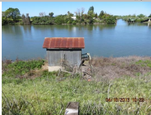
Pump house and pipes visible on WS slope.