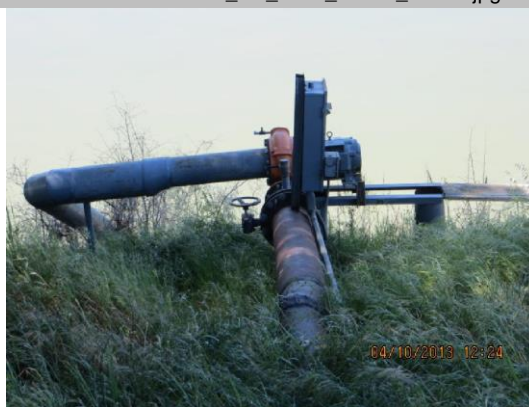
Pump, pipe, and butterfly valve on WS slope.