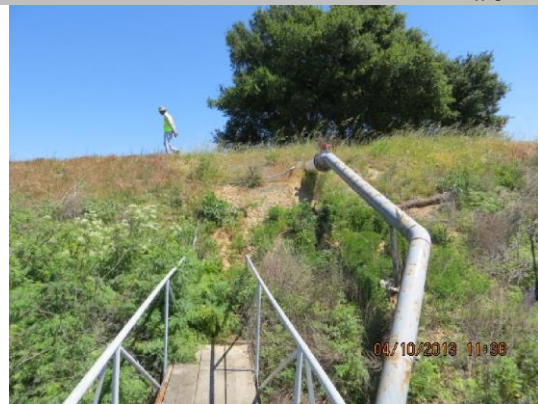
Pipe, butterfly valve, and electrical conduit 3-feet below the crown on the WS shoulder.