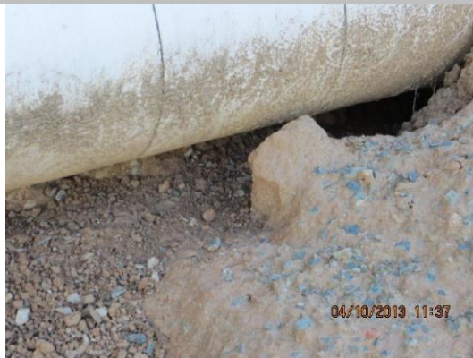
Rodent activity undermining pipe on LS slope.