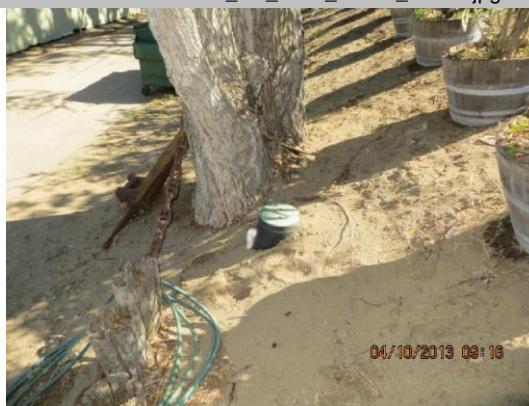
Irrigation pipes on WS slope.