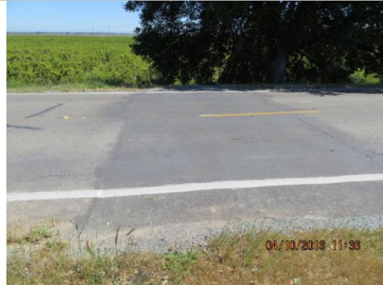
Fresh cut through pavement at crown.