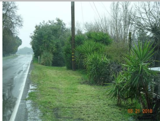
View looking downstream at landscaping on the waterside shoulder (Spring 2018).