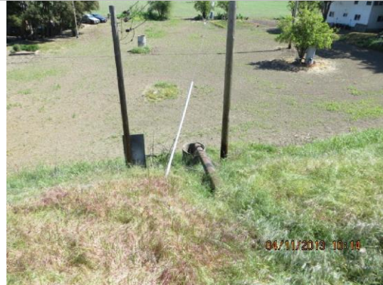
Pipe and stand pipe on LS toe with subsidence along pipe on LS slope.