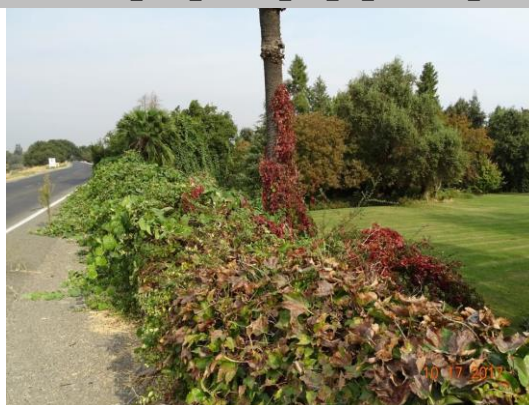
View of landscaping on landside slope and toe.

* Location LS : Land Side N/A : Not Applicable WS : Water Side CR : Crown