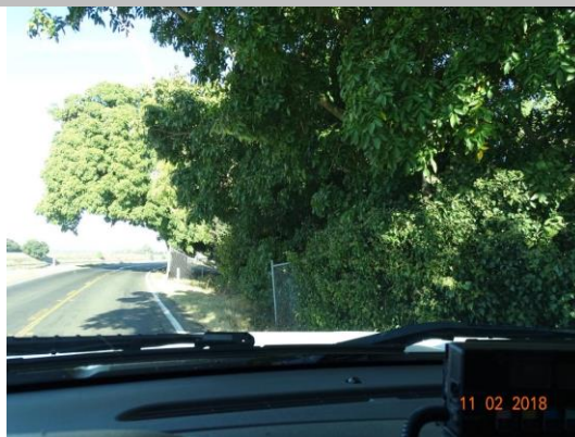
View looking upstream at landscaping on the landside slope (November 2018).