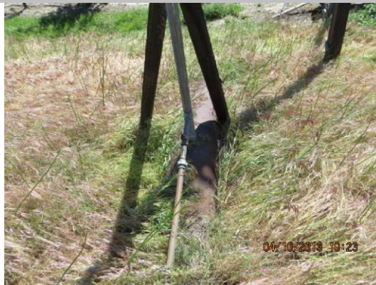
galvanized iron filler pipe and 16-inch pipe visible at LS toe.