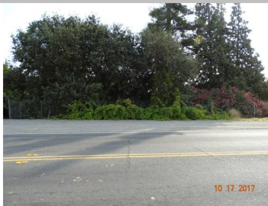
View of landscaping on landside slope and toe.