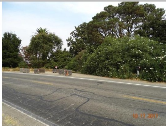
View of landscaping on landside slope and toe.