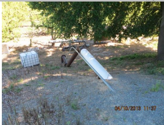
Pipe, electrical conduit, and booster pump on LS toe.