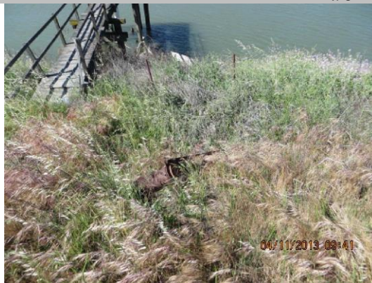
Abandoned slide gate on WS slope.