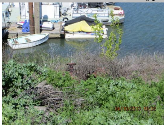
Abandoned pump covered in vegetation on WS slope.