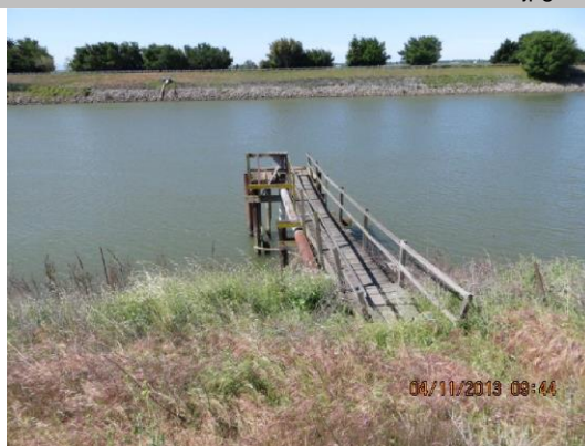
Pump on pier with wooden walkway on WS toe.