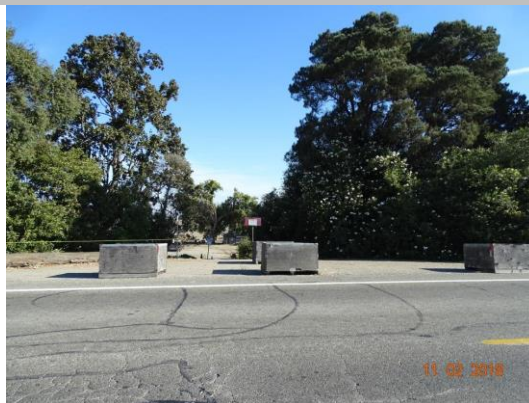
View of boxes on the land side shoulder that landowner placed to block traffic from using driveway (November 2018).