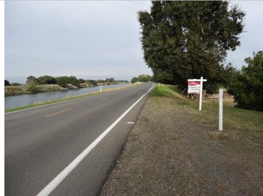
View of levee crown and LS slope, photo taken downstream of crossing looking upstream.