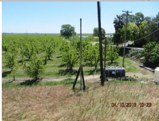
Pipe and JP visible on LS toe.