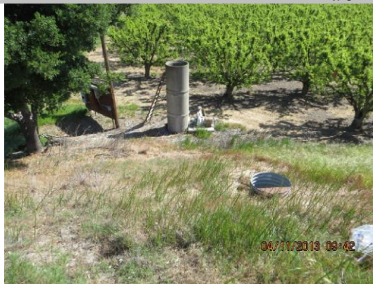
24-inch CMP riser and 48-inch concrete riser on LS slope.