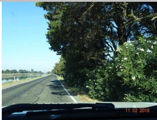
View looking upstream at land scaping on the landside slope (November 2018).

* Location LS : Land Side N/A : Not Applicable WS : Water Side CR : Crown