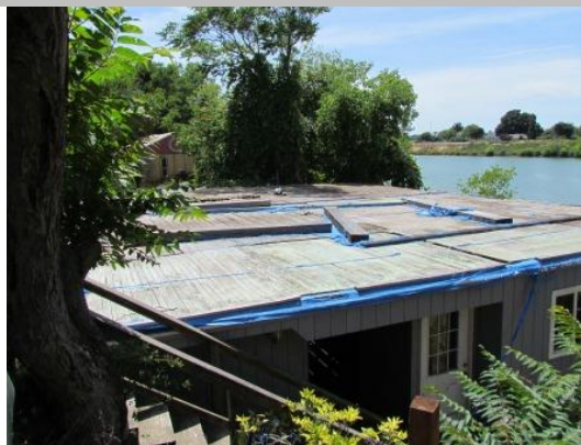
Building remodeling project on waterside levee section. Photo taken 01-04-2014.