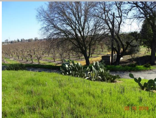
View of cactus at the bottom of the landside slope (Spring 2019).