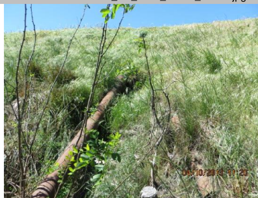
Pipe failing on LS slope due to corrosion holes causing erosion.