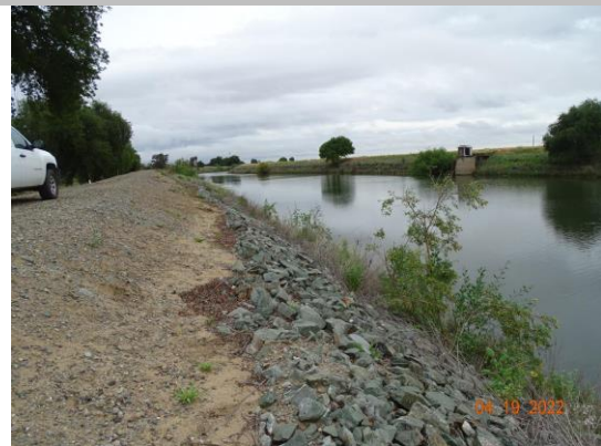
View of revetment at the erosion site on waterside slope. Spring 2022