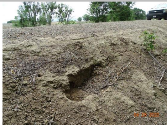
View of animal burrow on landside slope. Spring 2020

* Location LS : Land Side N/A : Not Applicable WS : Water Side CR : Crown