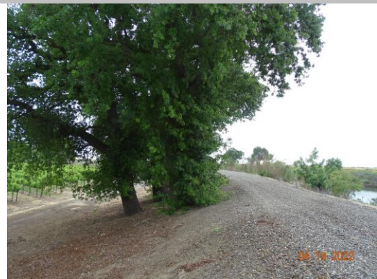
View of untrimmed trees along the landside slope. Spring 2022