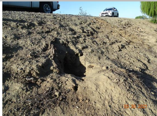
View of large animal burrow along the landside slope. Spring 2021