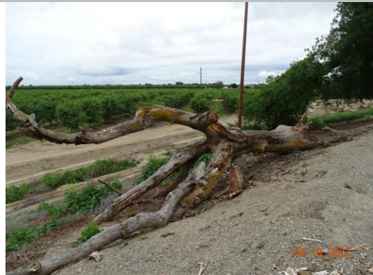
View of fallen tree branch along the landside slope. Spring 2022

Photo 1 of 1 : SP_2022_RD0544_109_67_20220422_00057.jpg