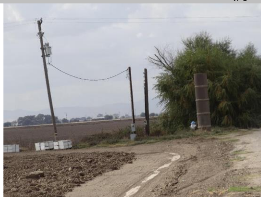
LS view: service pole, pump, and a concrete standpipe on bank of drainage ditch about 500 ft from the levee.