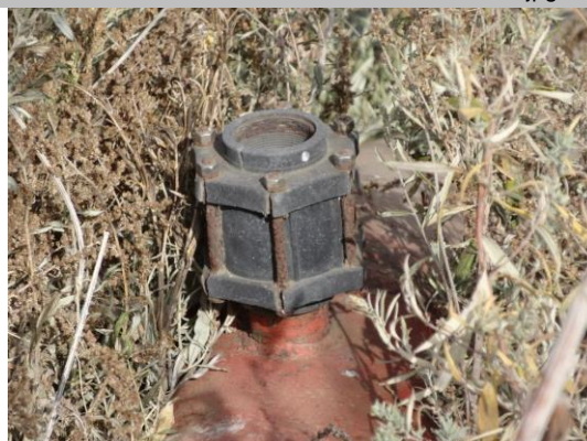
WS view: exposed steel pipe and air vent on the pipe.