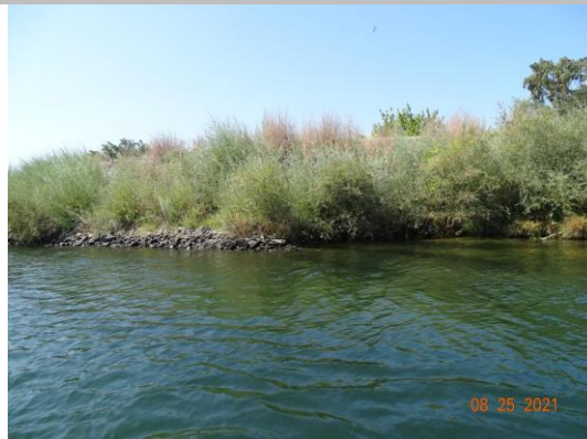
08/25/2021: Close-up view of the erosion.