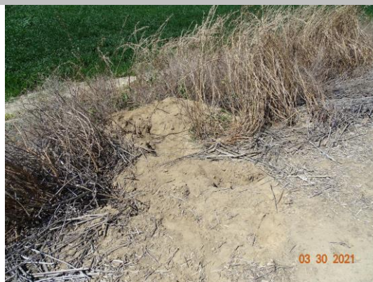
View of large animal burrow along the landside slope. Spring 2021