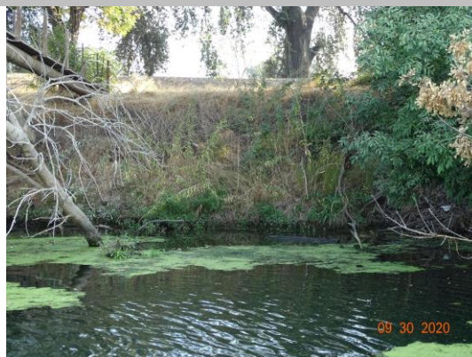
9/30/2020: Close-up view of the slope instability.

Photo 1 of 1 : SP_2022_RD0544_109_1_20220406_00001.jpg