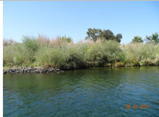
08/25/2021: View of the erosion looking upstream.