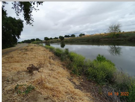
View of waterside slope. Spring 2022