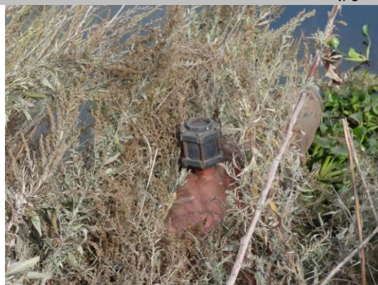
WS view: exposed steel pipe on bank of the channel.