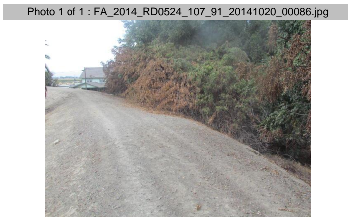
Looking southwest at dense vegetation on landside slope.