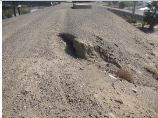
Updated picture of the erosion site on the landside shoulder.