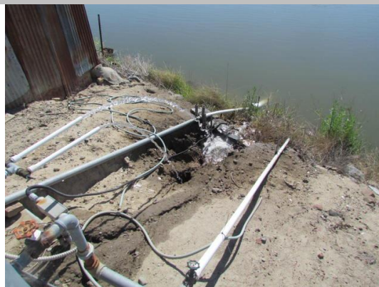
Looking east at irrigation system damaging waterside toe.