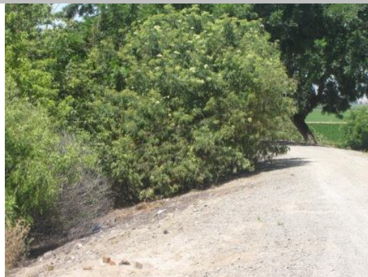
Looking south at elderberry on waterside slope.

* Location LS : Land Side N/A : Not Applicable WS : Water Side CR : Crown