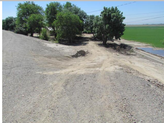
Looking southwest at damaged slope and ramp on landside slope.