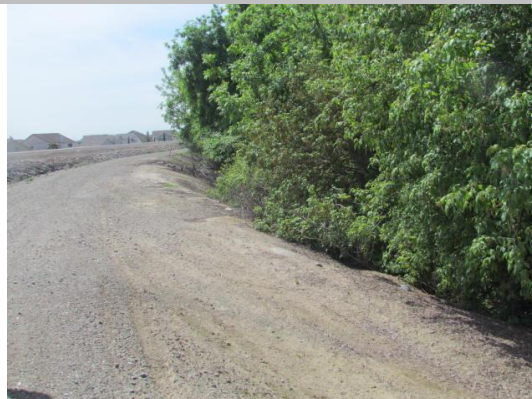
Looking south at dense trees on landward slope.