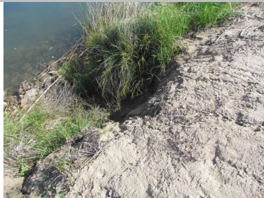
Looking southeast at erosion on waterward toe.