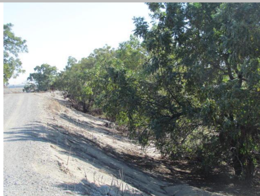
Looking south at low hanging tree branches at landside toe.