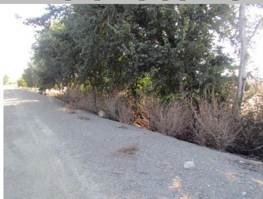
Looking southwest at dense vegetation and low hanging tree branches on landside slope and toe.