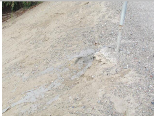
Looking north at typical view of grouted rodent holes on landward shoulder and slope.