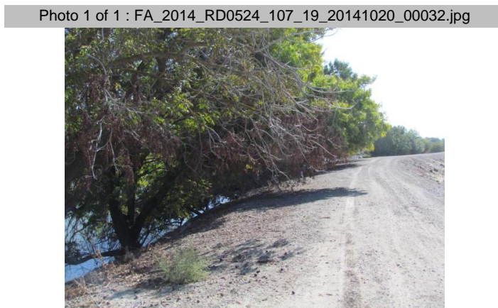
Looking northwest at low hanging tree branches at waterside toe.

* Location LS : Land Side N/A : Not Applicable WS : Water Side CR : Crown