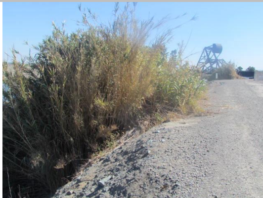
Looking south at bamboo on waterside slope. (Fall Inspection 2012)

* Location LS : Land Side N/A : Not Applicable WS : Water Side CR : Crown