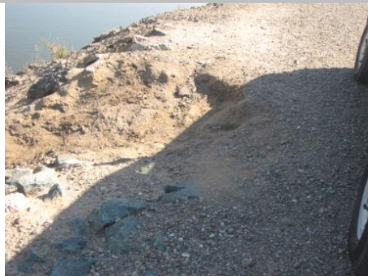
Update of erosion site at LM 0.65 to 0.66