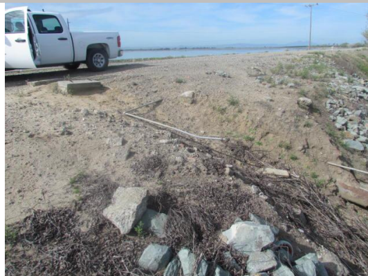
Looking northwest at inch and half metal pipe on waterward slope.