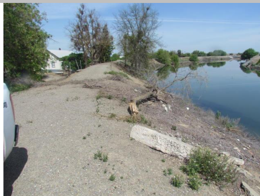
Looking northeast at tree limb on waterward slope.