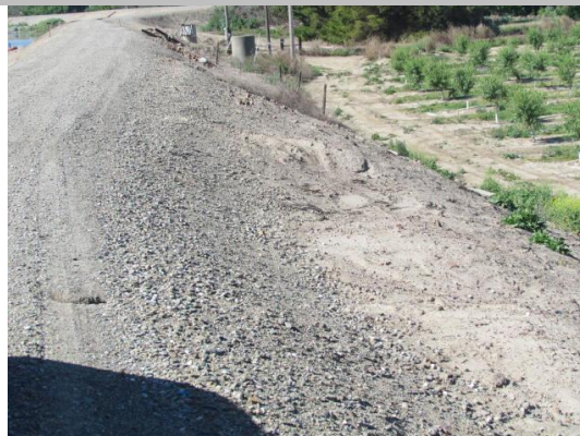
Looking southwest at caving slope on landside of levee.

* Location LS : Land Side N/A : Not Applicable WS : Water Side CR : Crown