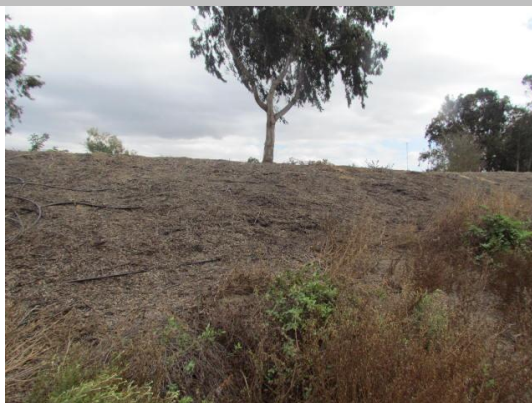
Looking east from landward berm at corrected site.

* Location LS : Land Side N/A : Not Applicable WS : Water Side CR : Crown