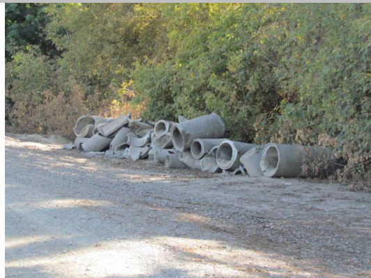
Looking southwest at concrete pipes on landside toe.