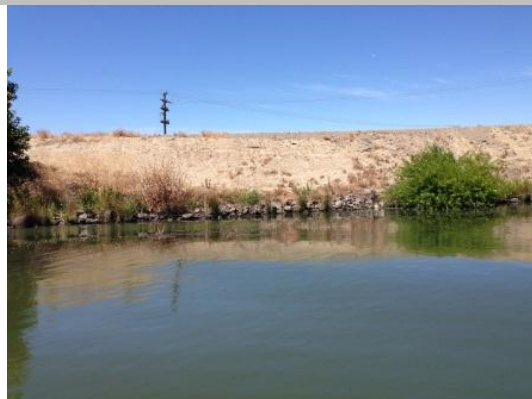
Close view of the site. Dense vegetation covers the erosion.