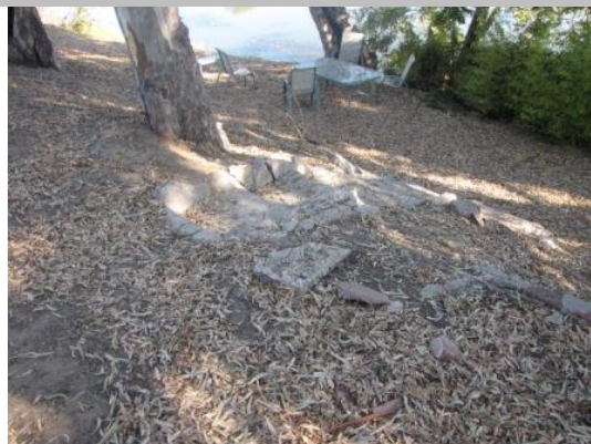
Looking northeast at non-permitted concrete stairs on waterside slope.