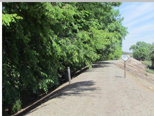
Looking north at dense trees overhanging levee crown.