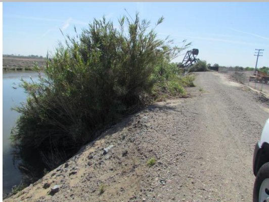
Looking southeast at bamboo on waterside slope. (Spring 2012)