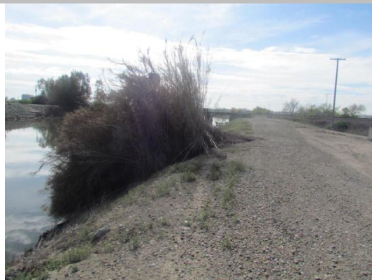
Looking south at dying bamboo on waterward slope. (Spring 2013)

* Location LS : Land Side N/A : Not Applicable WS : Water Side CR : Crown