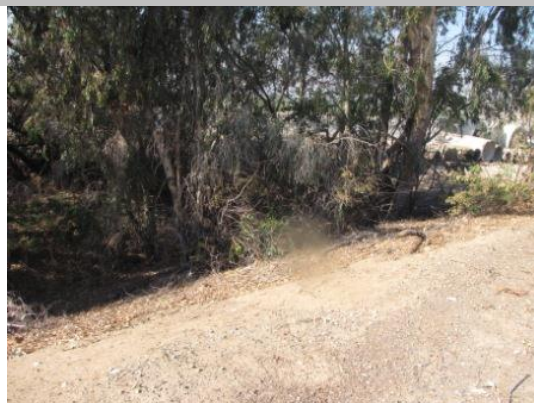
Dense vegetation on landside toe.