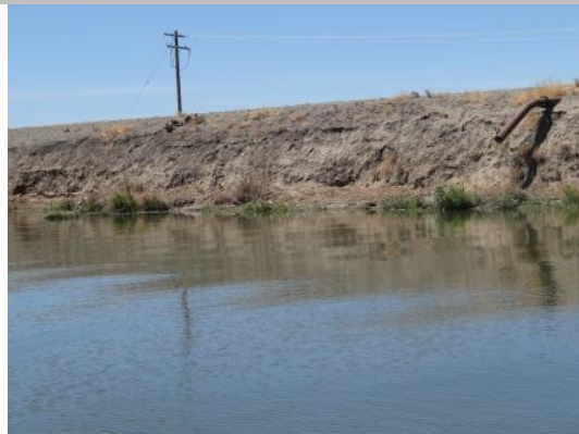
Front view of the erosion. Note the drainage pipe on the site.