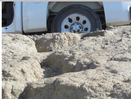
Looking east at erosion on landward slope.