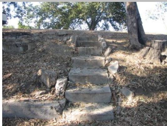
Looking west at concrete stairs on waterside slope.

LS : Land Side N/A : Not Applicable WS : Water Side CR : Crown