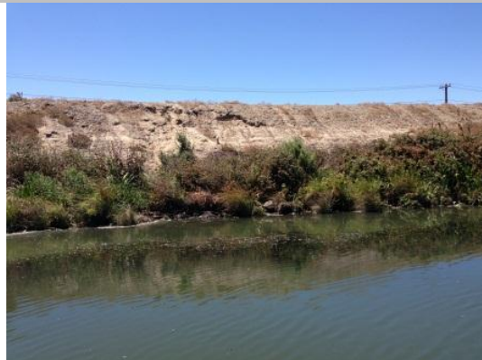
Front view of the erosion site. Note the vegetation at the levee toe and lower slope.