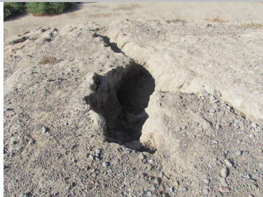
Looking west at hole on landward shoulder.