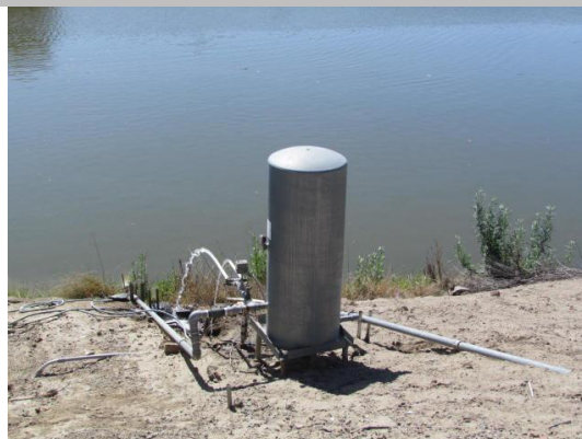
Looking east at irrigation system on waterside slope.