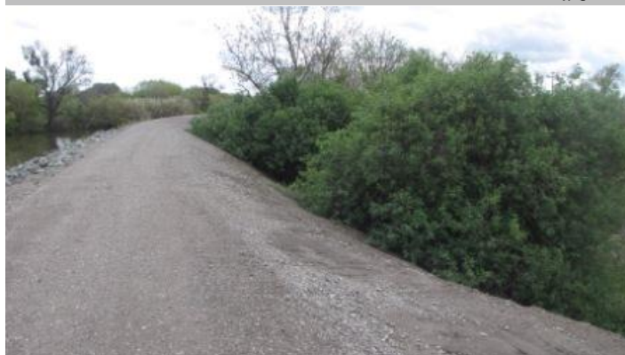
Looking south at dense veg on landside slope and toe.