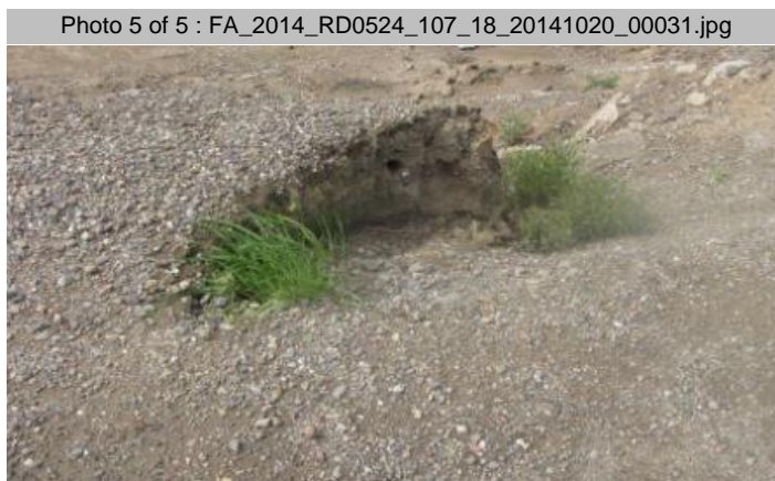
Updated view from above the slope stability.