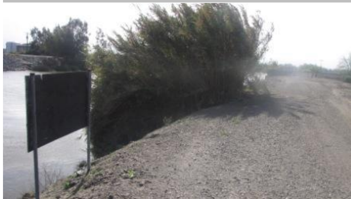
Looking southeast at bamboo on waterside shoulder as of 4/2010.