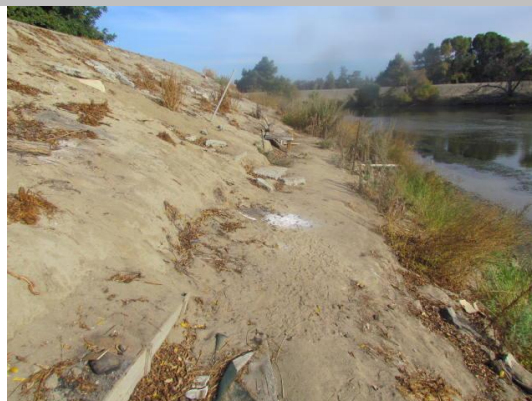
Looking northeast at damage to the slope possibly caused by human activity.

* Location LS : Land Side N/A : Not Applicable WS : Water Side CR : Crown