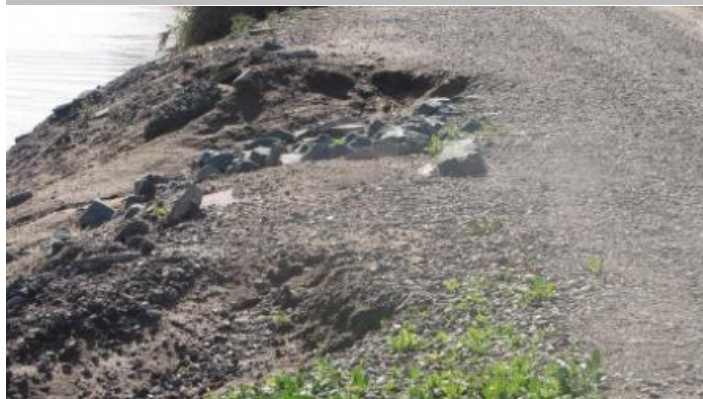
Looking south at erosion on waterside shoulder.

* Location LS : Land Side N/A : Not Applicable WS : Water Side CR : Crown