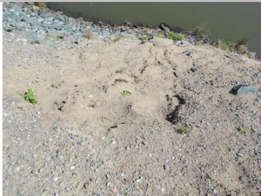
Looking east at waterside erosion appears to be caused by runoff.