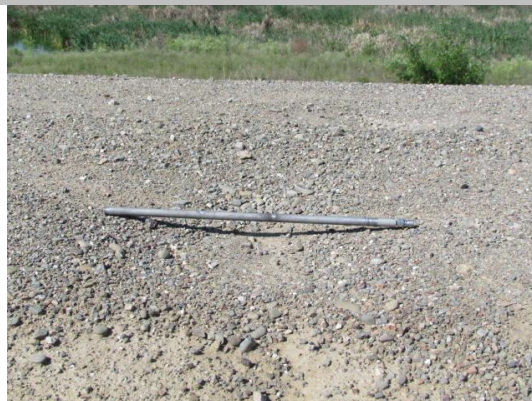
Looking west at 3" depression on levee crown. (Spring 2012)