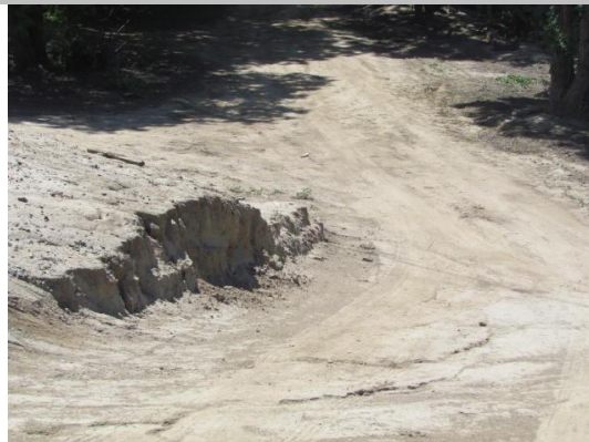
Looking west at unauthorized ramp and landside slope damage.