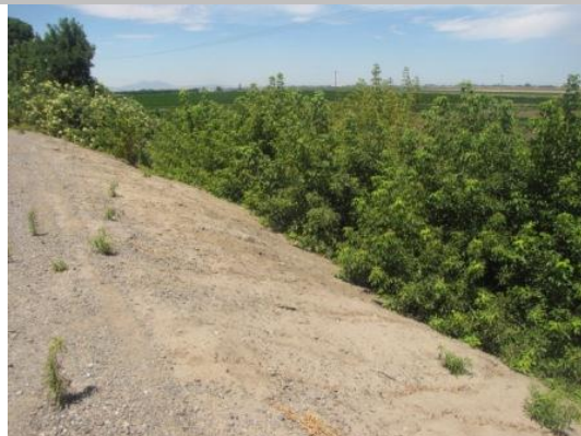
Looking southwest at trees along levee landside toe.