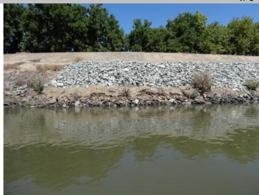
View of the repaired site.