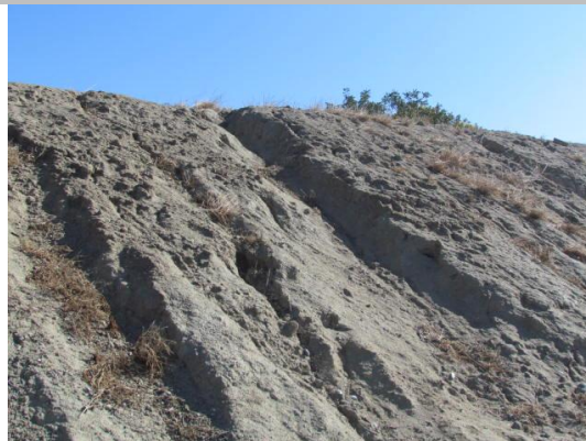
Looking southeast at finger erosion on landward slope.