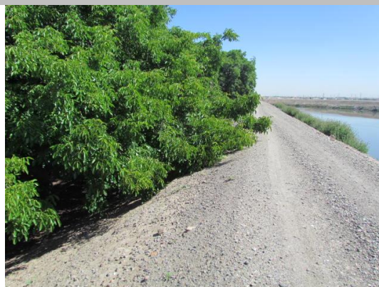
Looking north at dense trees on landside slope.