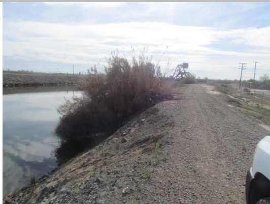
Looking south at dying bamboo on waterward slope. (Spring 2013)