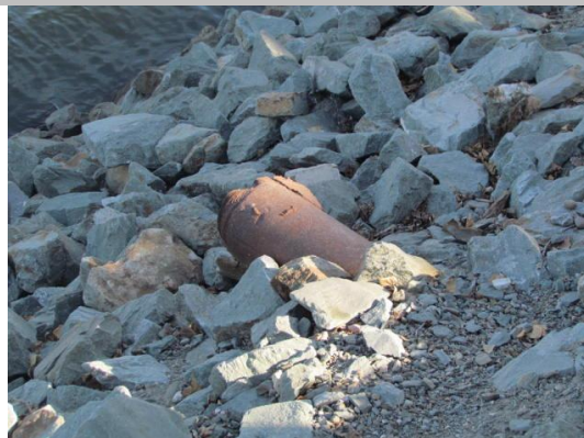
Looking southeast at abandoned pipe on waterside slope.