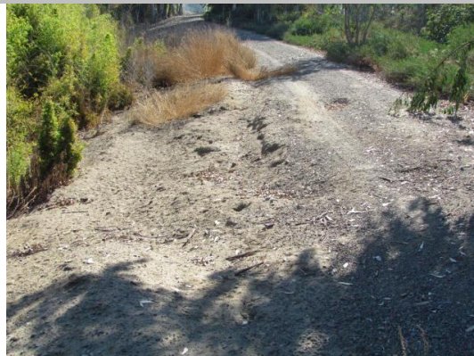
Looking south at depression on levee crown near waterward shoulder.