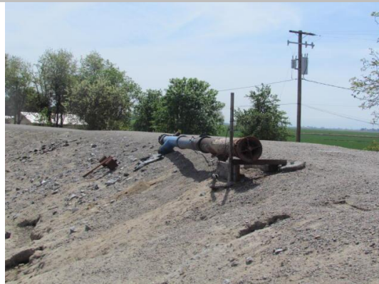
Looking southeast at old pump shaft on waterward shoulder.

* Location LS : Land Side N/A : Not Applicable WS : Water Side CR : Crown