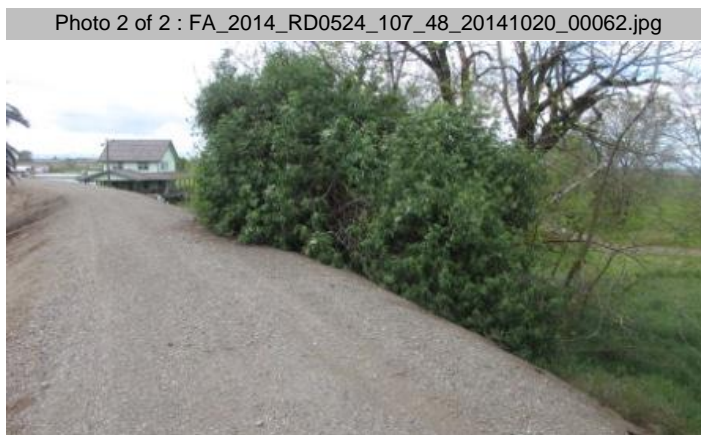
Looking south at elderberry on landside slope.(Spring 2011)