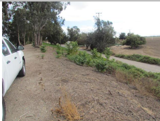
Looking south at vegetation blocking view of landward toe.