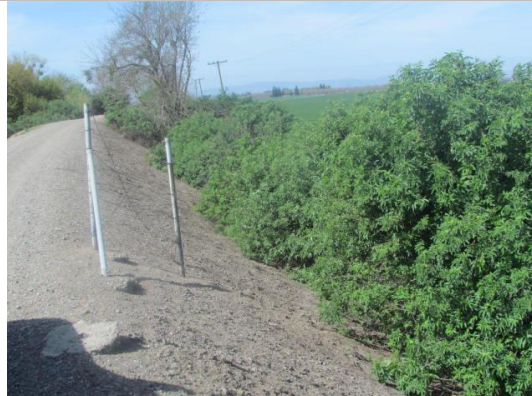
Looking southwest at dense vegetation on landward toe.

* Location LS : Land Side N/A : Not Applicable WS : Water Side CR : Crown