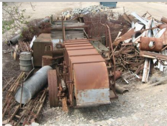
Garbage at landward toe next to ramp at LM 4.64

* Location LS : Land Side N/A : Not Applicable WS : Water Side CR : Crown