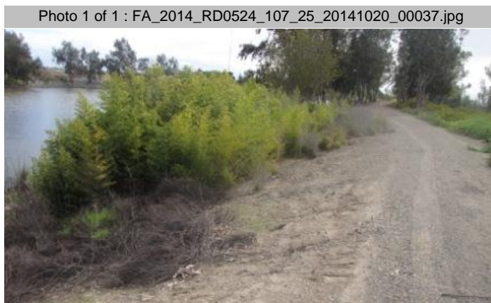
Looking southeast at dense vegetation on the waterside slope.