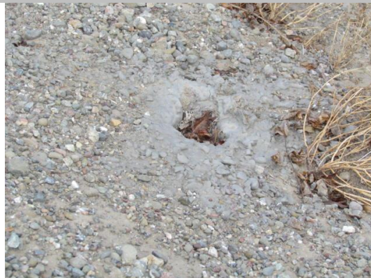
Looking north at typical view of grouted rodent holes on waterward slope.

* Location LS : Land Side N/A : Not Applicable WS : Water Side CR : Crown