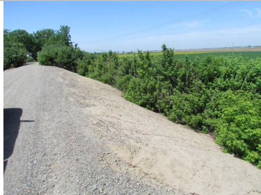
Looking southwest at dense vegetation on landside toe.

* Location LS : Land Side N/A : Not Applicable WS : Water Side CR : Crown