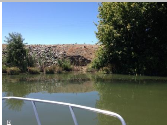
Front view of the erosion. Note the riprap protection near the site.

* Location LS : Land Side N/A : Not Applicable WS : Water Side CR : Crown