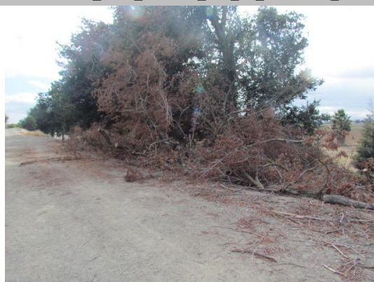
Looking south at tree limbs on landward slope.