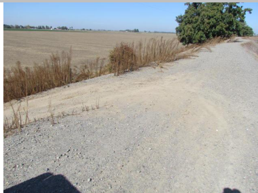
Looking northwest at slope damage on landward slope.