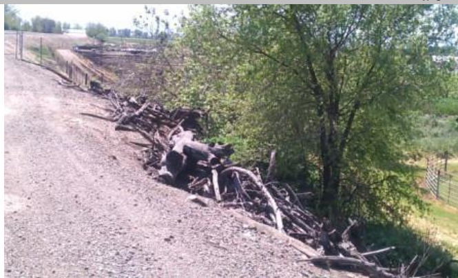
Looking southwest at prunings on landside slope.