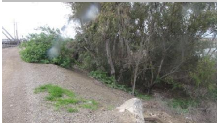
Looking south at dense veg. on landside slope and toe.

LS : Land Side N/A : Not Applicable WS : Water Side CR : Crown