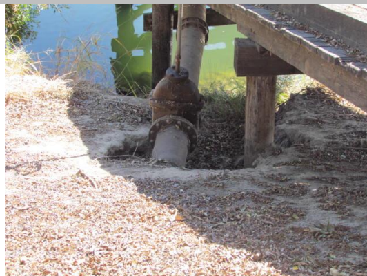
Looking east at erosion around irrigation pipe on waterward slope.