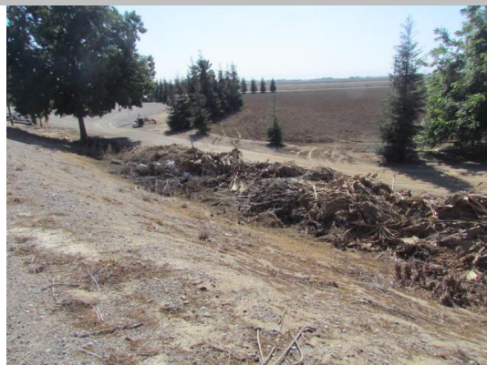
Looking southwest at prunings on landside toe.

LS : Land Side N/A : Not Applicable WS : Water Side CR : Crown