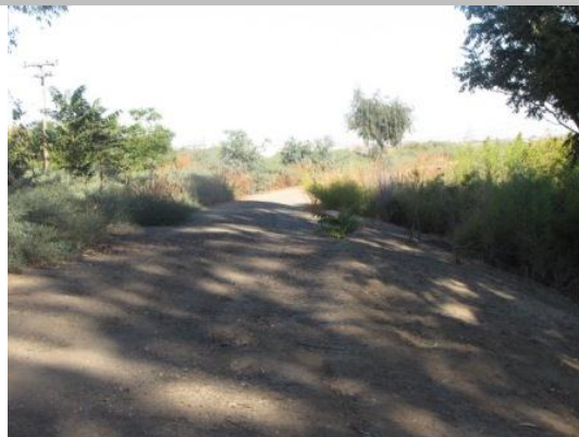
Looking north at dense vegetation on the landside and waterside slopes.

* Location LS : Land Side N/A : Not Applicable WS : Water Side CR : Crown