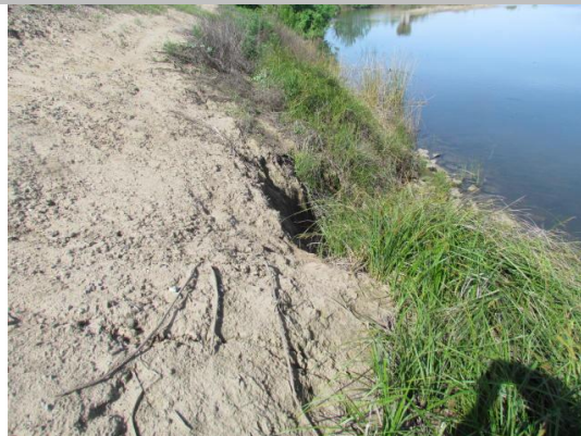
Looking northeast at erosion on waterward toe.