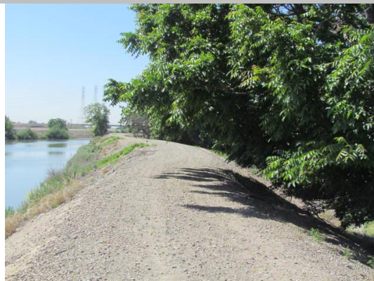
Looking south at overhanging trees.