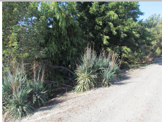
Looking northwest at dense vegetation on landside slope.

* Location LS : Land Side N/A : Not Applicable WS : Water Side CR : Crown