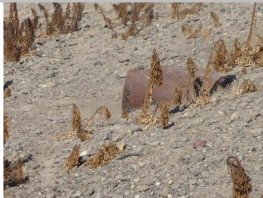
Looking west at pipe on landside slope.