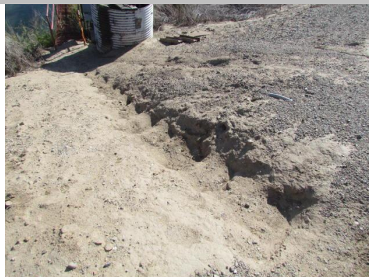
Looking southeast steps cut into waterside slope.

* Location LS : Land Side N/A : Not Applicable WS : Water Side CR : Crown