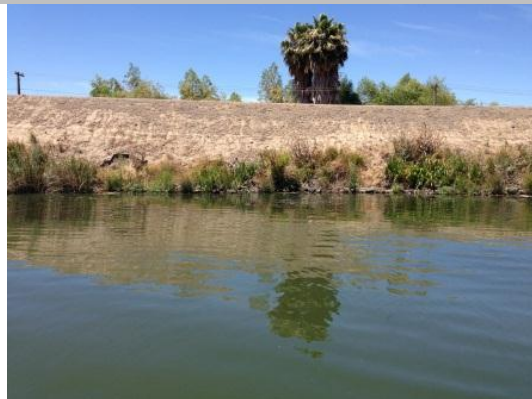
Close view of the erosion.