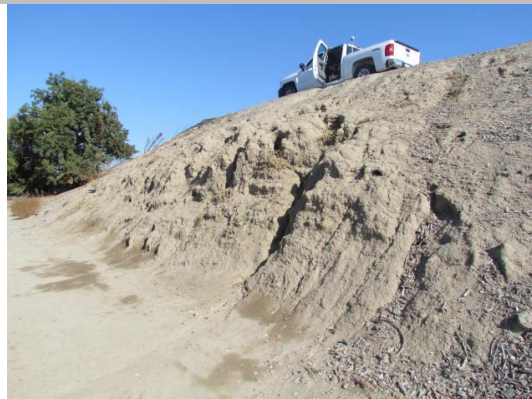
Looking northeast at several finger erosion on landward slope.