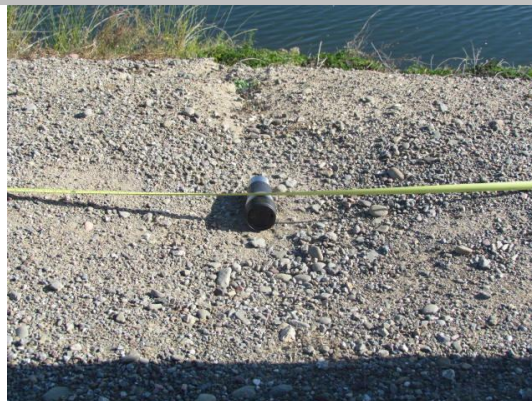
Looking west at depression on levee crown near waterward shoulder.

* Location LS : Land Side N/A : Not Applicable WS : Water Side CR : Crown