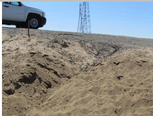
Looking southeast at damaged slope.