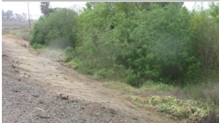
Looking southwest at dense veg. on landside toe.

* Location LS : Land Side N/A : Not Applicable WS : Water Side CR : Crown