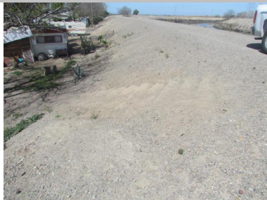
Looking north at steps cut into landward slope.

* Location LS : Land Side N/A : Not Applicable WS : Water Side CR : Crown