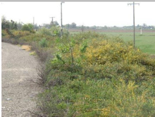
Overgrown landscaping on landward slope from LM 1.56 to 1.74