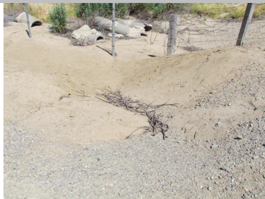
Looking west at slope damage on landside slope.