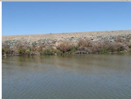
Front view of the erosion.

* Location LS : Land Side N/A : Not Applicable WS : Water Side CR : Crown