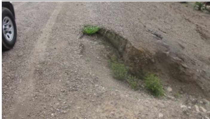
Looking at updated slope stability as of 4/2010.

* Location LS : Land Side N/A : Not Applicable WS : Water Side CR : Crown