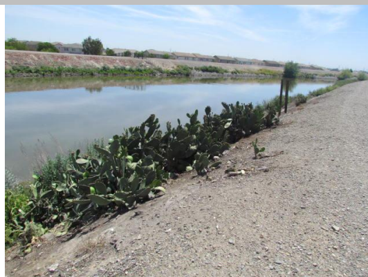
Looking southeast at cactus on waterside slope.