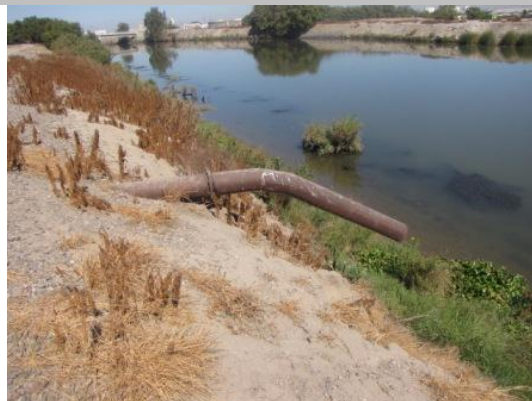
Looking north at broken pipe.

* Location LS : Land Side N/A : Not Applicable WS : Water Side CR : Crown