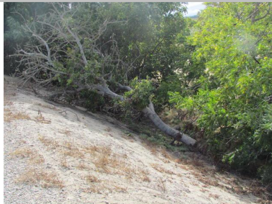
Looking south at downed tree on landward slope.