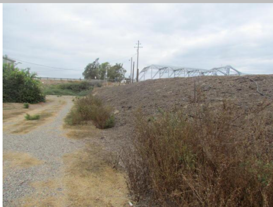
Looking north from landward berm at corrected site.