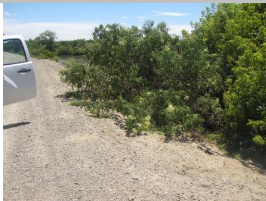
Looking north at elderberry on waterside slope.