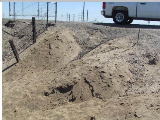
Looking east at slope caving on landside slope.

LS : Land Side N/A : Not Applicable WS : Water Side CR : Crown