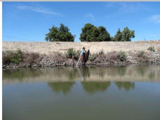
Front view of the site.