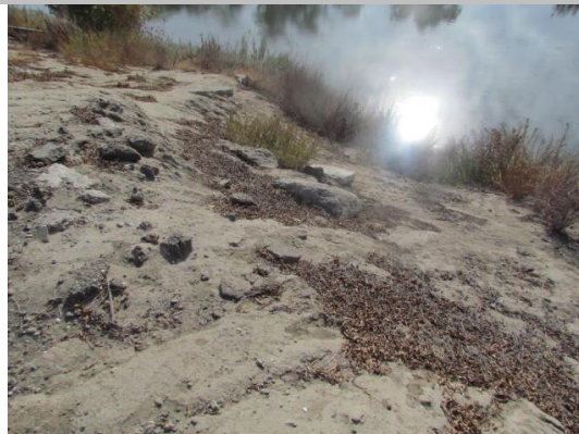
Looking east at erosion on waterside slope.