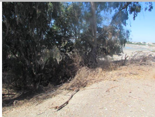
Looking south at trees on landside slope. (Fall 2012)