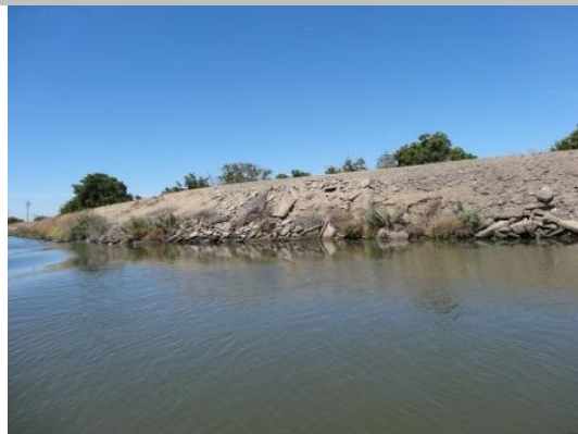
Downstream view of the erosion site.