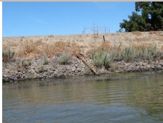
Close view of the erosion and the pipe.

* Location LS : Land Side N/A : Not Applicable WS : Water Side CR : Crown