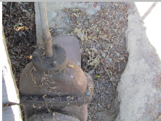
Looking at erosion around irrigation pipe on waterward slope.

LS : Land Side N/A : Not Applicable WS : Water Side CR : Crown