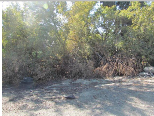
Looking northwest at low hanging tree branches on landside slope and toe.