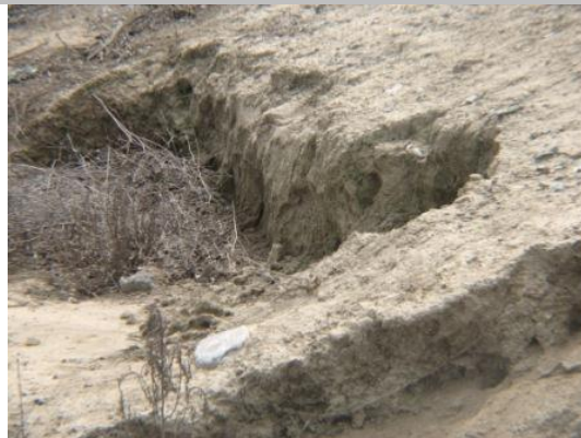
Erosion at waterward toe and around irrigation pipe at LM 5.92