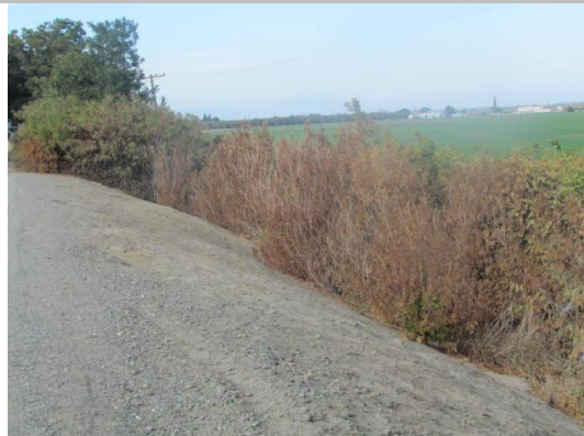
Looking southwest at dense vegetation and trees on landside slope. (Fall 2012)