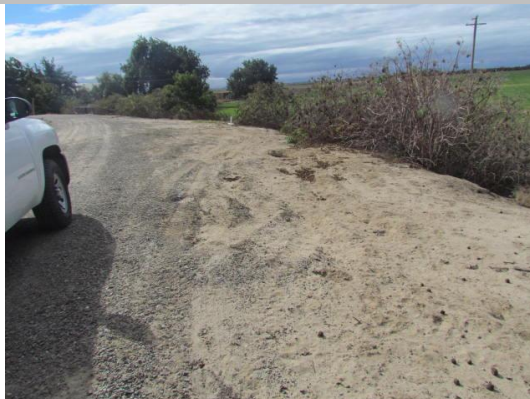
Looking southwest at damaged landward slope.