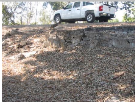
Looking southwest at retaining wall connected to concrete stairs.