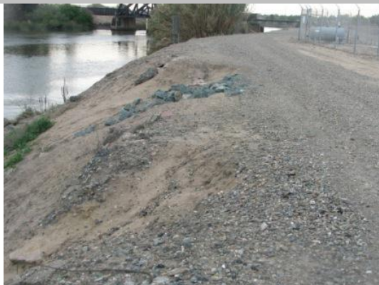
Erosion from LM 0.65 to 0.66