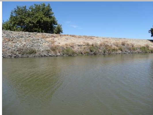
View from upstream of the erosion.