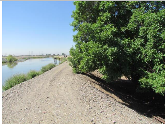
Looking south at dense trees on landside slope.