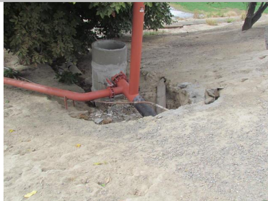
Looking west at erosion around intake pipe on landward slope.