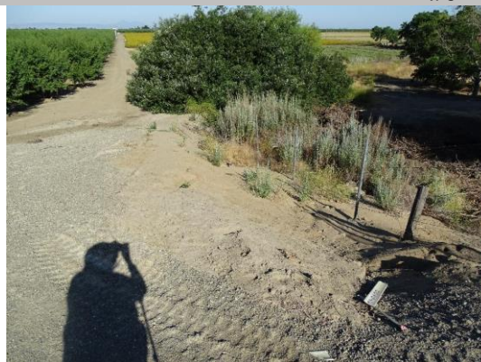
Land-Side: view of LS slope with no sign of inlet pipe due to overgrown vegetation limiting inspection.