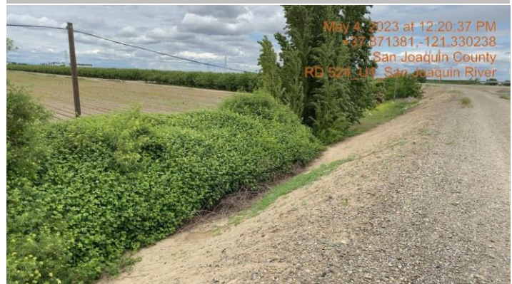
View of berry bushes and ivy along the landside slope and easement. Spring 2023