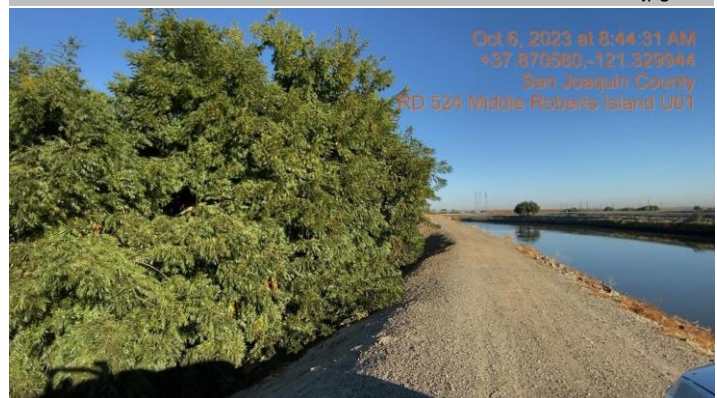
View of untrimmed trees along the landside slope. Fall 2023