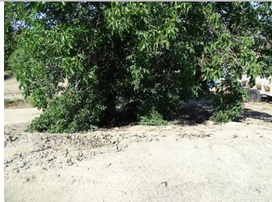
Land-Side: view of LS slope with no sign of crossing.