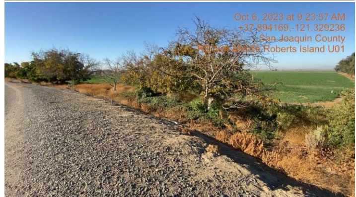
View of wild vegetation growth along the landside slope and easement. Fall 2023