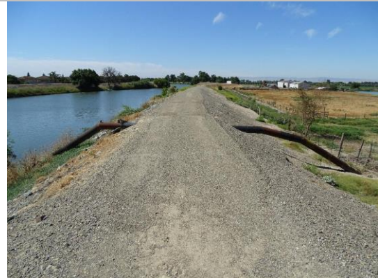
Overview of Levee: view of crown with pipe through crown.