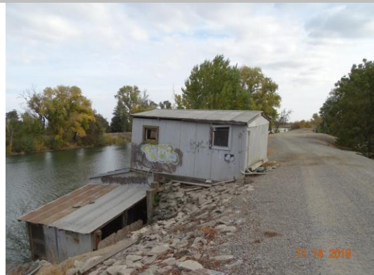
View of pump house on waterside shoulder. Fall 2019