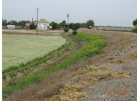
View of an irrigation ditch along the landside easement. Spring 2022