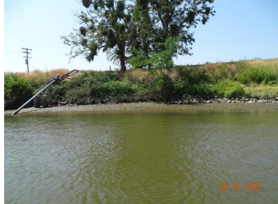
8/31/2023: View of the erosion immediately downstream of an irrigation pipe.