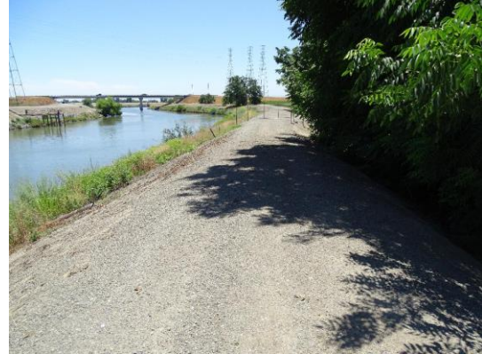
Top of Levee: view of crown.