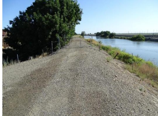
Top of Levee: view of crown.