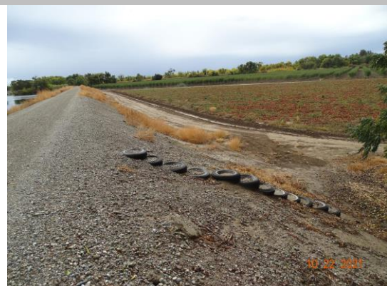
View of rubber tires being used as stairs on landside slope. Fall 2021