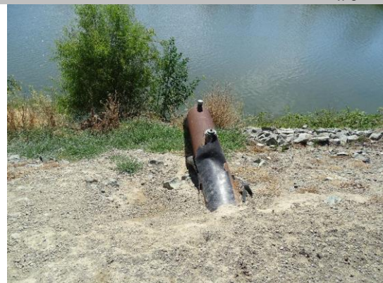
Water-Side: view of WS slope with pipe out of slope.