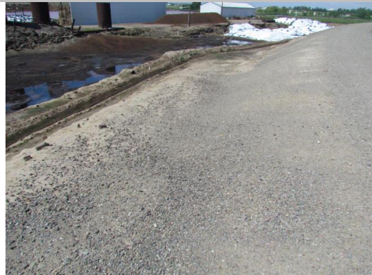
Looking northwest at unauthorized ramp on landward slope.