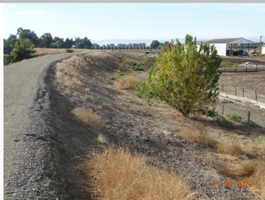
View of landside slope with multiple animal burrows. Fall 2022