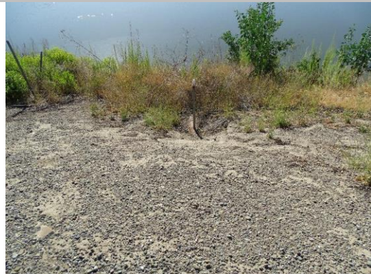
Water-Side: view of WS slope and pipe.