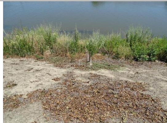
Water-Side: view of WS slope and pipe.