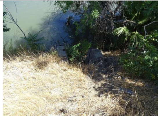
Water-Side: view of WS slope.