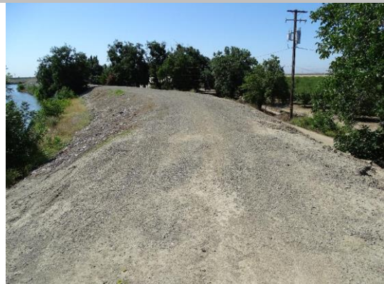
Top of Levee: view of crown.