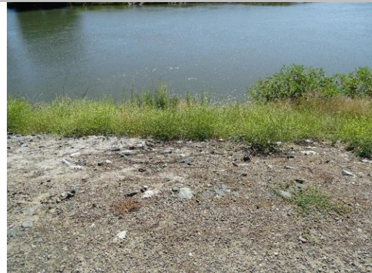
Water-Side: view of WS slope with no sign of pipe or concrete structure.