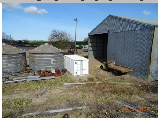
View of container with Districts Flood Fight Materials. Spring 2021