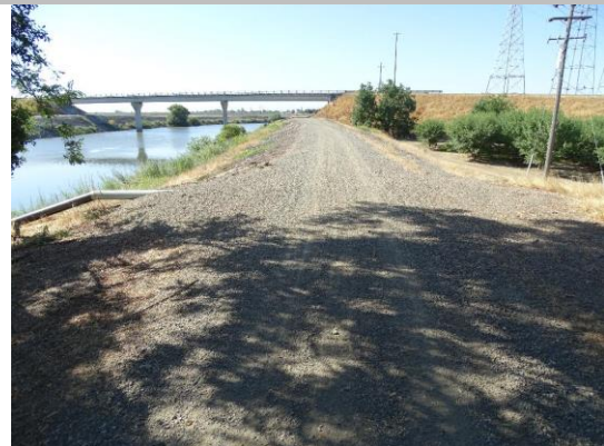
View of levee crown.