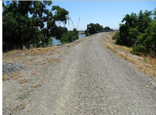
Top of Levee: view of crown.