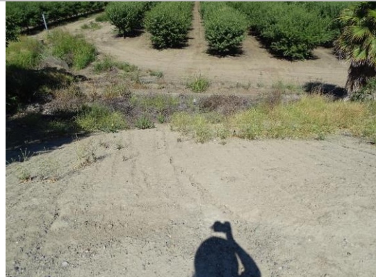
Land-Side: view of LS slope with no sign of pipe.