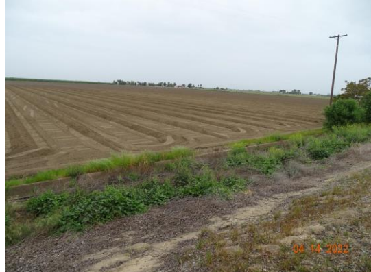
View of concrete lined irrigation ditch along the landside easement. Spring 2022