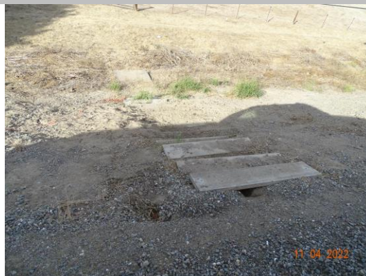
View of stairs cut into levee landside slope. Fall 2022