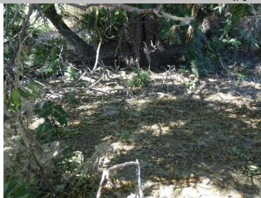
Land-Side: view of LS with no sign of pipe.