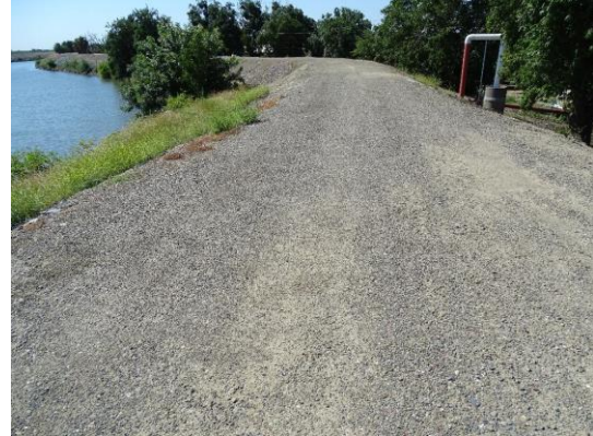
Top of Levee: view of crown.