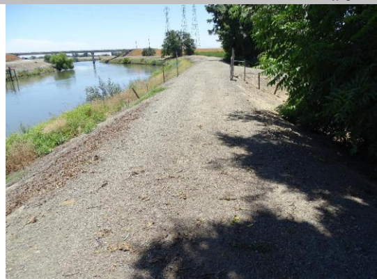
Top of Levee: view of crown.