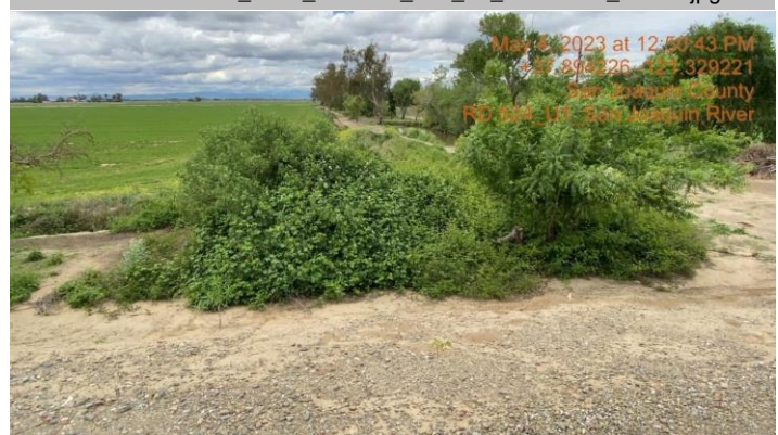
View of fallen tree along the landside slope and easement. Spring 2023