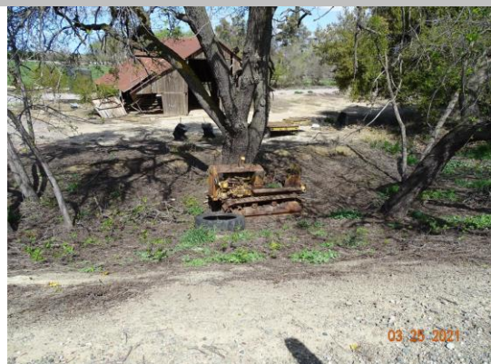
View of an abandoned piece of farm equipment within the landside easement. Spring 2021

Photo 1 of 1 : FA_2023_RD0524_107_301_20230905_00038.jpg