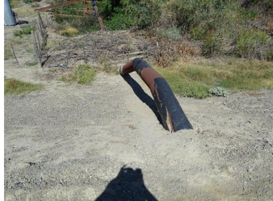
Land-Side: view of LS slope and pipe out of slope.