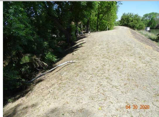
View of 4 inch pipe going through levee from landside to waterside. Spring 2020