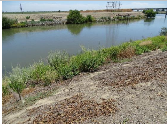
Water-Side: view of WS slope.