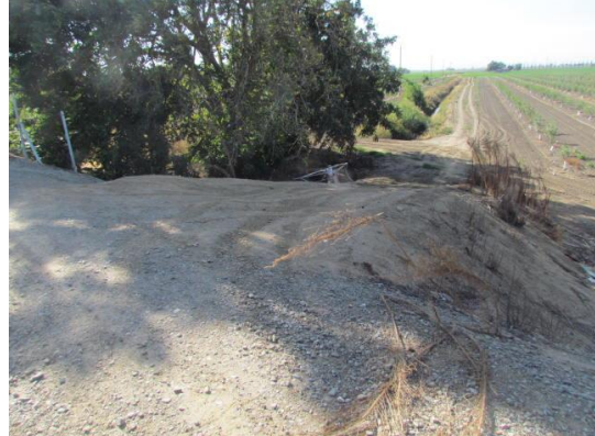
Looking west at unauthorized ramp on landside slope.