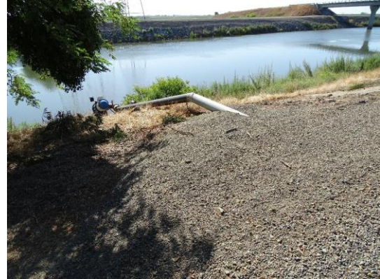
View of WS slope.