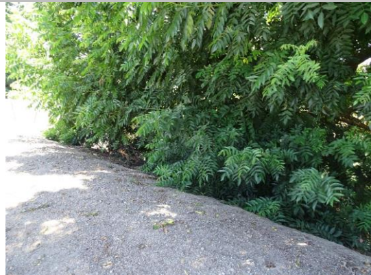
Land-Side: view of LS slope.