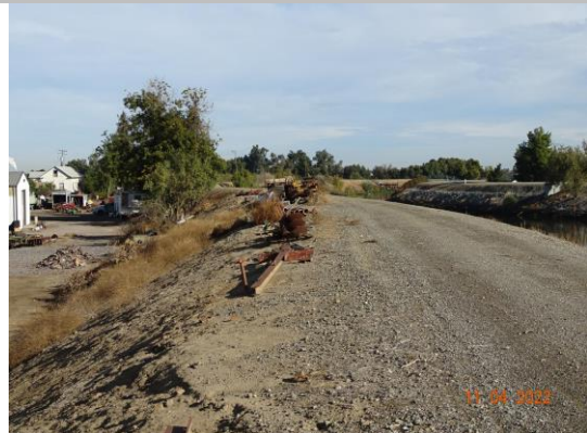
View of farm equipment being stored along the landside shoulder. Fall 2022