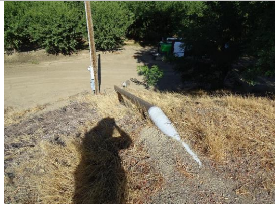
View of LS slope.