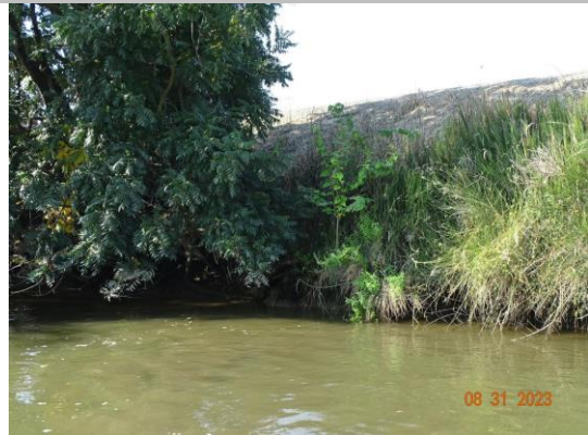
8/31/2023: Close-up view of the erosion.