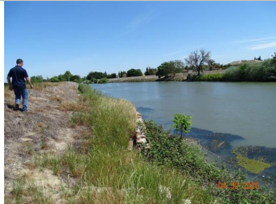
View of damaged retaining wall on waterside slope. Approximately 30 ft. long, 8 ft. high and 20 ft. from waterside hinge. Spring 2020