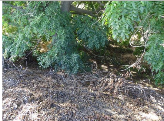
LS view - could not find pipe outlet.