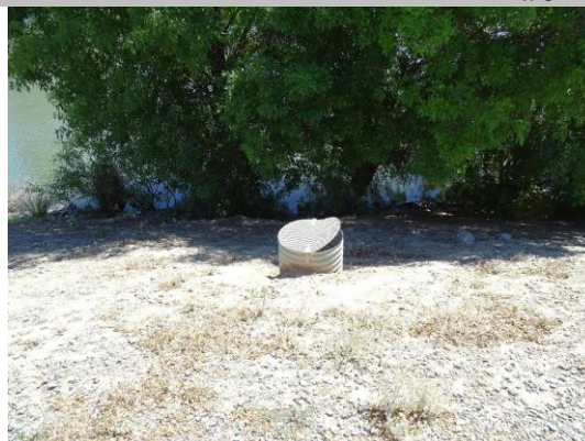
Water-Side: view of WS slope and standpipe.