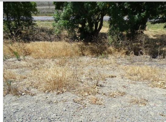
Land-Side: view of LS slope.