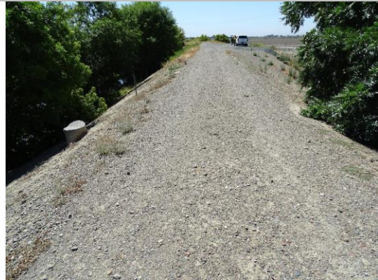
Top of Levee: view of crown.