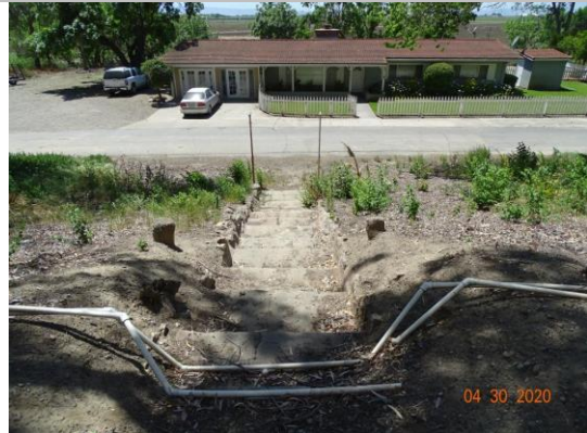
View of concrete stairs on landside slope. Spring 2020