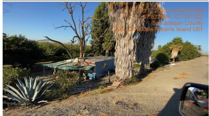
View of dwellings and animal pens along the landside easement. Fall 2023