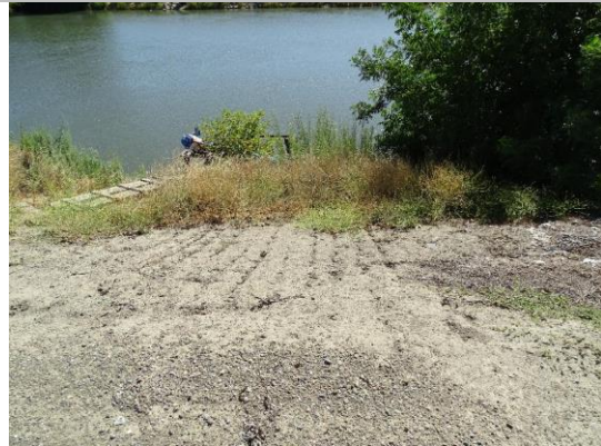
Water-Side: view of WS slope with no sign of crossing.