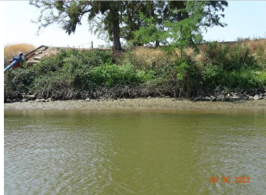
8/31/2023: Close-up view of the erosion.