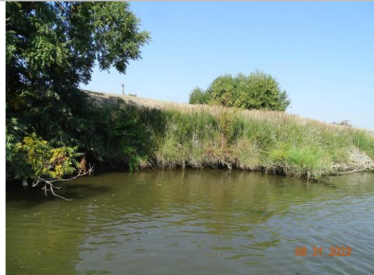
8/31/2023: View of the erosion from the opposite bank.