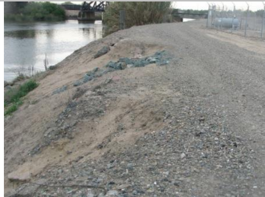
View of the erosion.