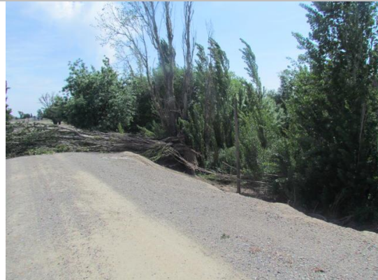
Looking southwest at large tree across levee crown.