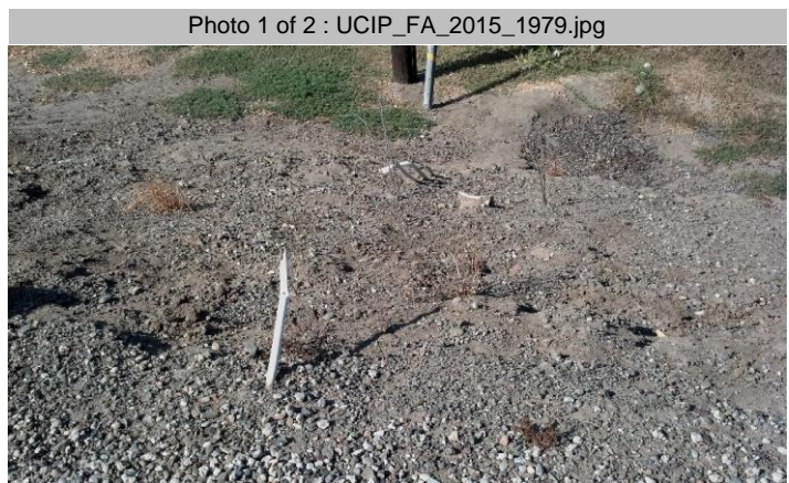
Pipes visible on LS slope.