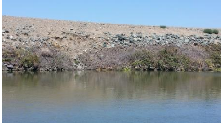
Close view of the erosion.