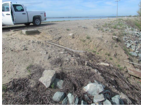
Looking northwest at inch and half metal pipe on waterward slope.