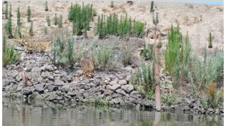
Close view of the erosion and the pipe.