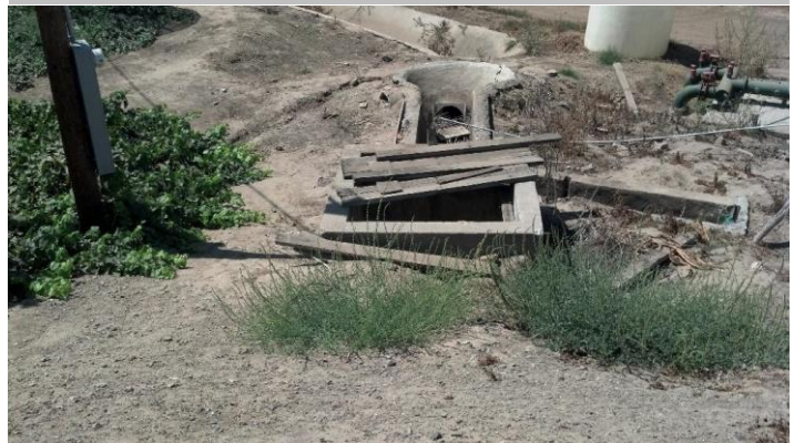
6'X6' concrete distribution box and power pole on LS toe.