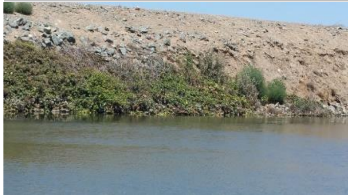
Close view of the erosion. Note the vegetation at the site.