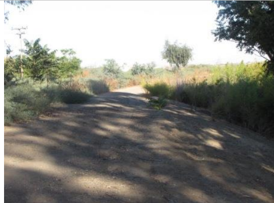
Looking north at dense vegetation on the landside and waterside slopes.