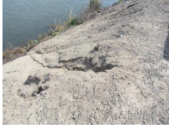
Looking west at waterward slope erosion.