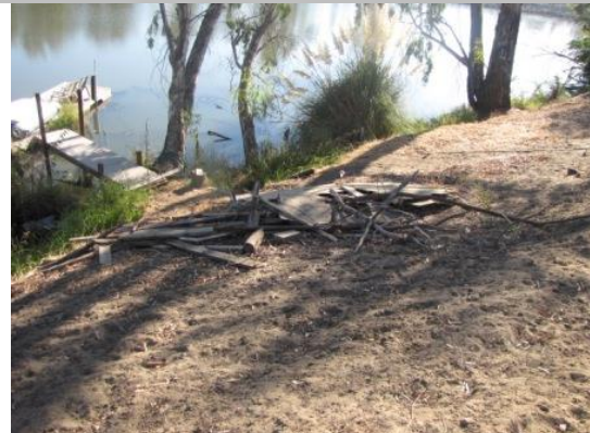
Looking at garbage on waterside slope.