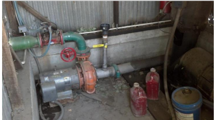
Pump and butterfly valve inside pumphouse on WS berm.