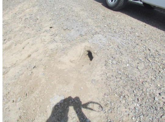
Looking southwest at typical view of rodent hole at landward shoulder.