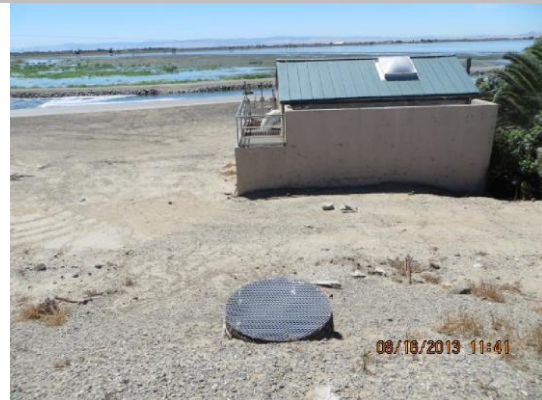
CMP riser for access/inspection on LS slope with distribution/pumphouse on LS toe.