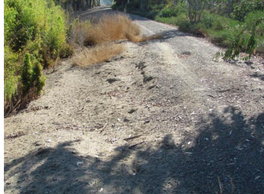
Looking south at depression on levee crown near waterward shoulder.