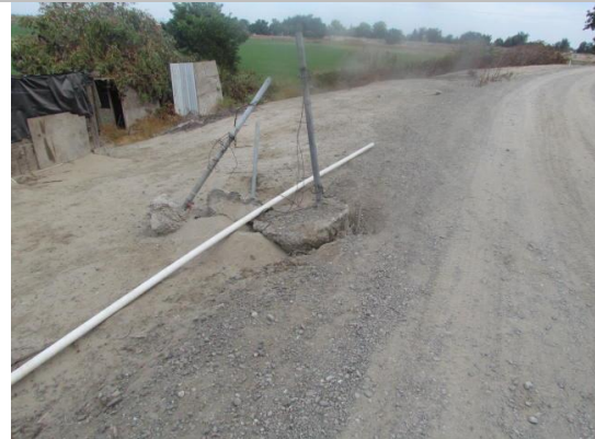
Looking northwest at fence poles on landside shoulder.