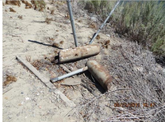
10-inch pipe debris on the WS slope.