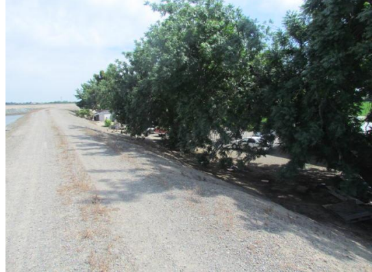
Looking south at untrimmed trees on landward slope and toe.