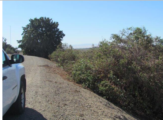
Looking southwest at dense elderberry bush on landward slope and toe fall 2015.