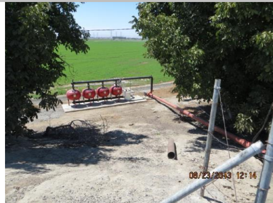
Filter pump on LS toe.