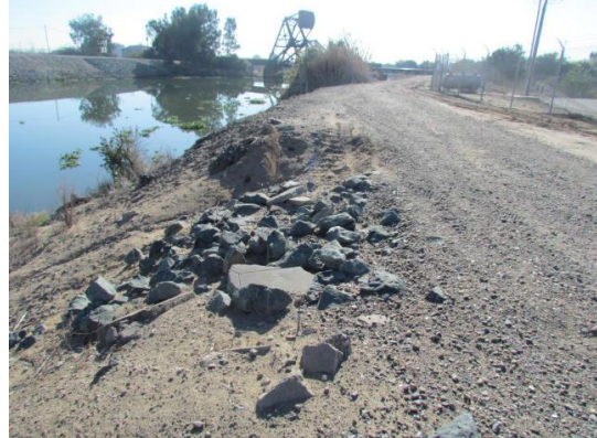
Looking southeast at depression on waterward shoulder fall 2015