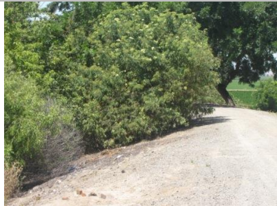
Looking south at elderberry on waterside slope.