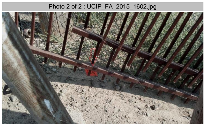
USAA markers along alignment at gate.