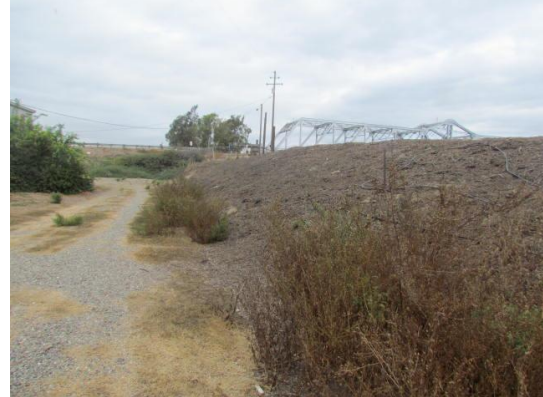
Looking north from landward berm at corrected site.