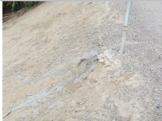
Looking north at typical view of grouted rodent holes on landward shoulder and slope.