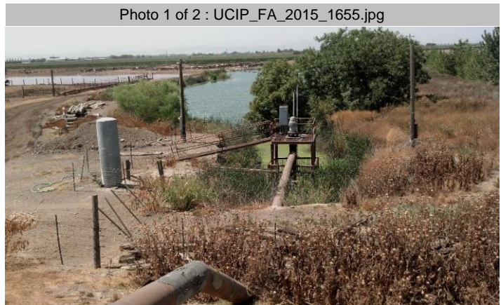
Pipe, pump, power pole, and meter visible off LS toe.