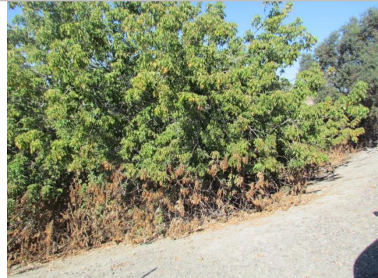
Looking south at dense trees on landward slope fall 2015