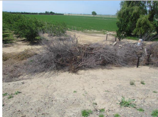
Looking east at pruning pile at landward toe.