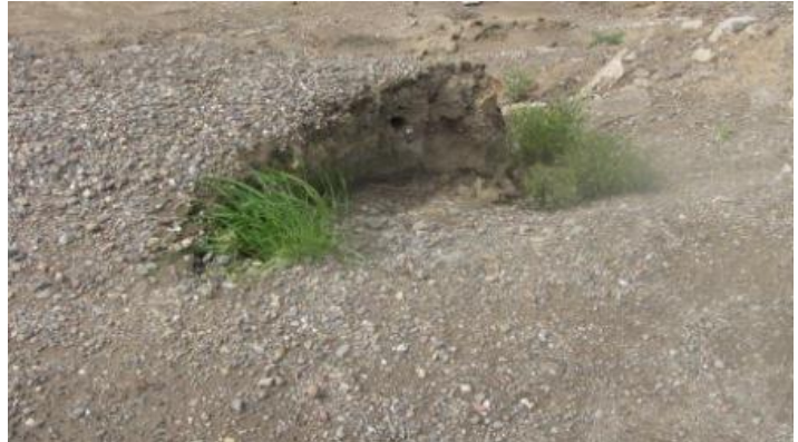
Updated view from above the slope stability.