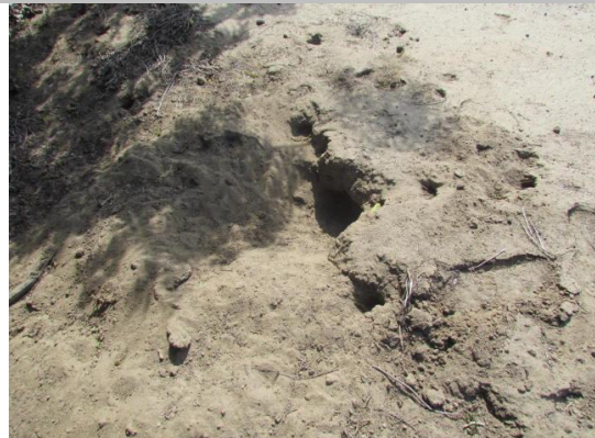
Looking west at several rodent holes on waterward shoulder. (Spring 2015)