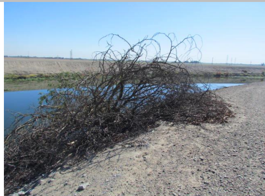
Looking southeast at dead tree on waterside slope fall 2015