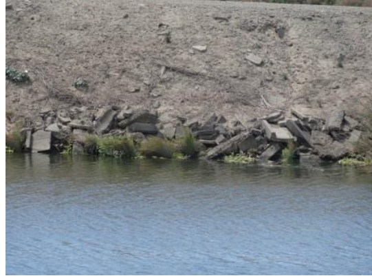
Close view of the erosion.