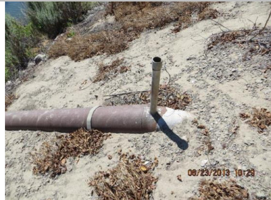
Vent on pipe on WS slope. Possible slurry standpipe that has not yet been used.