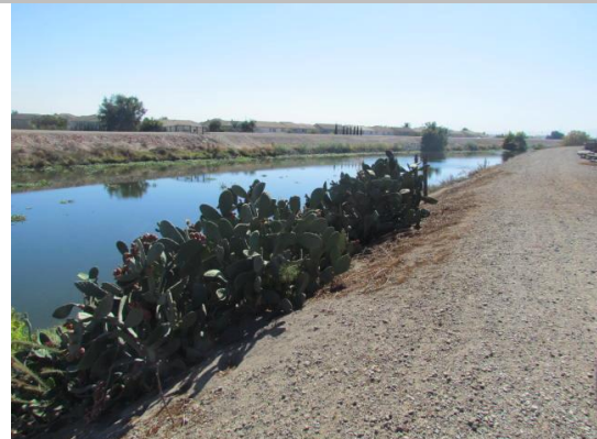
Looking southeast at cactus on waterward slope fall 2015