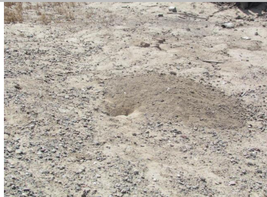
Looking north at typical view of rodent holes on landward slope.