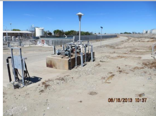
Vacuum pumps off LS toe.