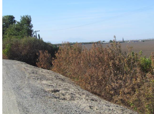
Looking southwest at dense vegetation on landside toe.