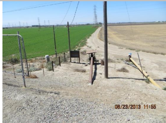
Pipe, pump, power pole, and meter off LS toe.