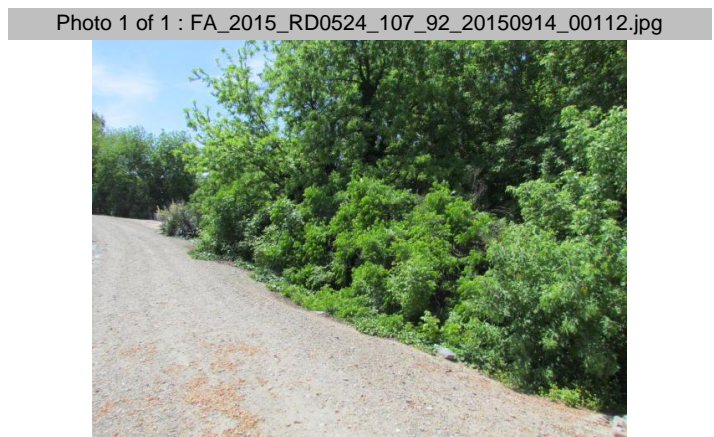
Looking southwest at dense landscaping on landside slope.