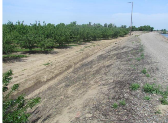
Looking east at south end of irrigation ditch at landward toe.