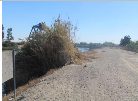
Looking south at bamboo on waterside slope. (Fall 2012)