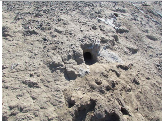
Looking at typical view of rodent hole with this section fall 2015.