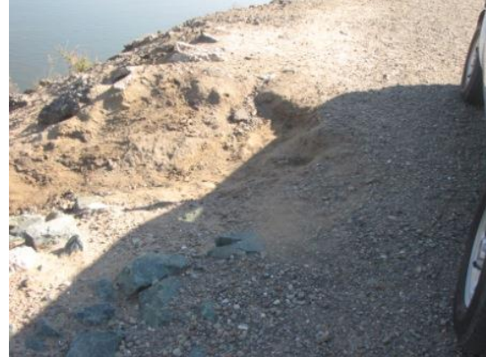
Update view of the erosion site.