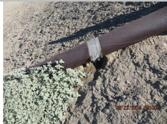
Small leak in pipe on LS slope.