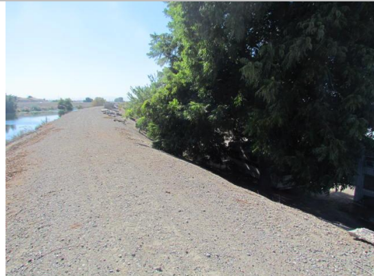
Looking south at untrimmed trees on landward slope and toe.