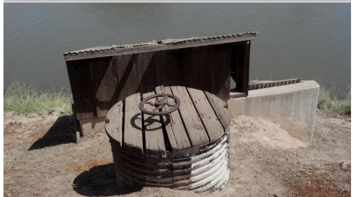
Pumphouse and gate valve in CMP riser on WS slope.