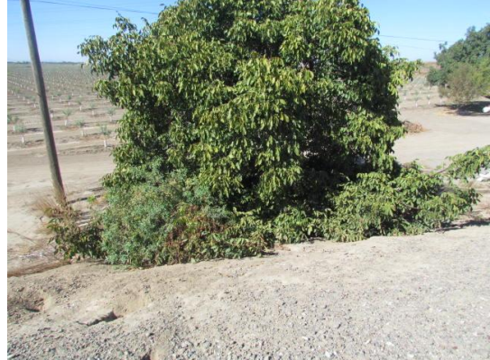
Looking west at untrimmed tree at landward toe fall 2015.