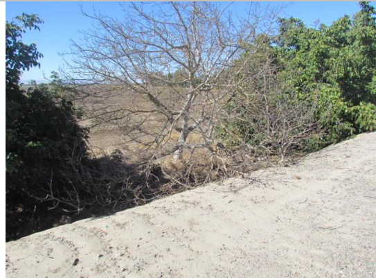
Looking west at dead tree on landward slope and toe fall 2015.