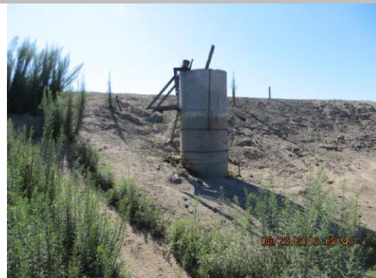
Concrete standpipe on LS slope.