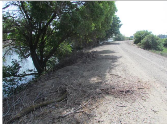
Looking south at prunings on waterward shoulders.