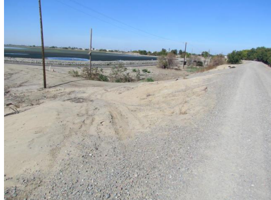
Looking northwest at unauthorized ramp on landside slope.