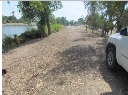
Looking south at landward slope depression.