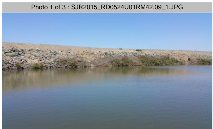
Front view of the erosion site.