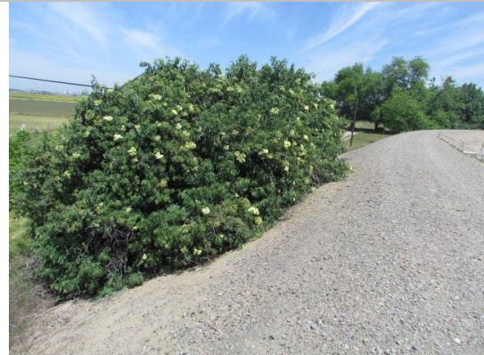
Looking northwest at elderberry on landside slope.