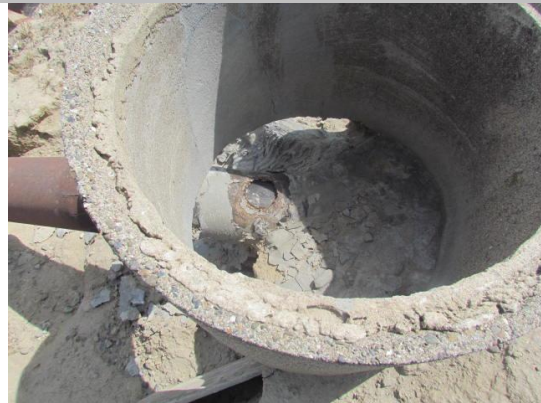
Looking at erosion around pipe inside concrete collar.