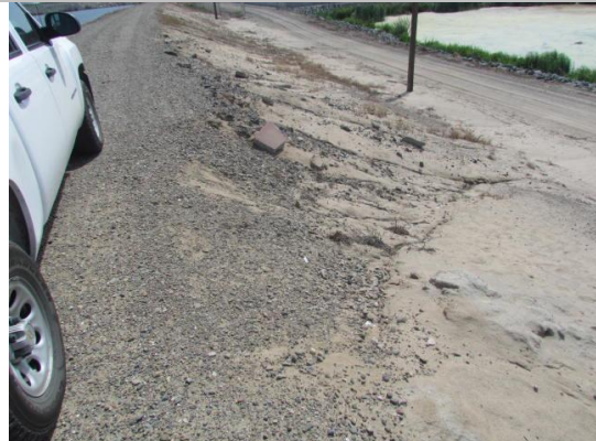
Looking south at slope damage on waterward shoulder.