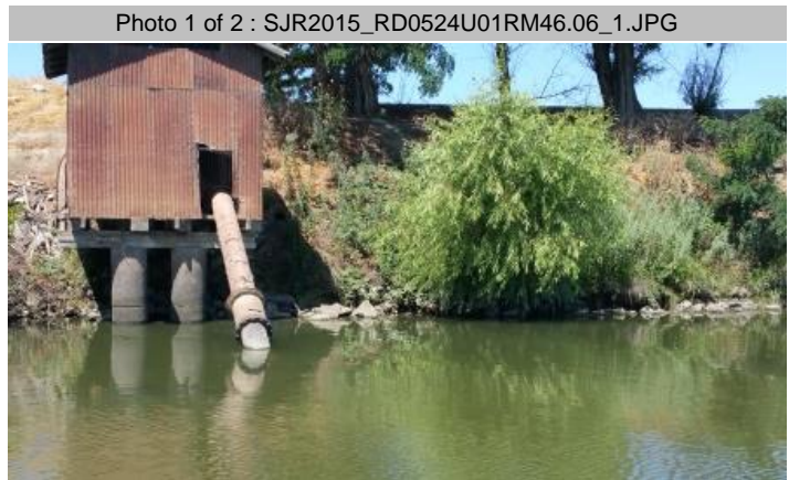
Front view of the erosion.