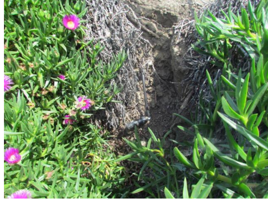
Looking east at erosion within landscaping on landward slope and shoulder.