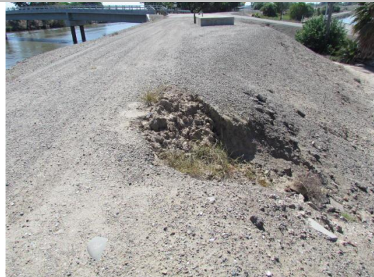
Looking south at caving on landside shoulder. (Spring 2013)