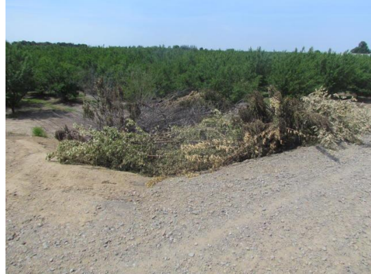
Looking east at pruning pile at landward toe.