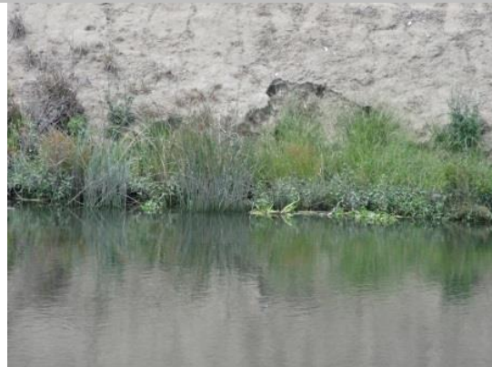
Close view of the erosion.