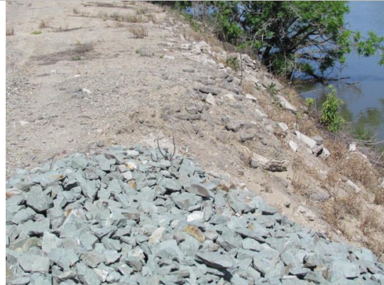
Looking north at erosion site next to repaired site. (Spring 2012)