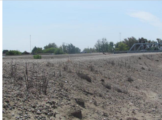
Looking east at depression on levee crown.