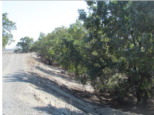
Looking south at low hanging tree branches at landside toe.