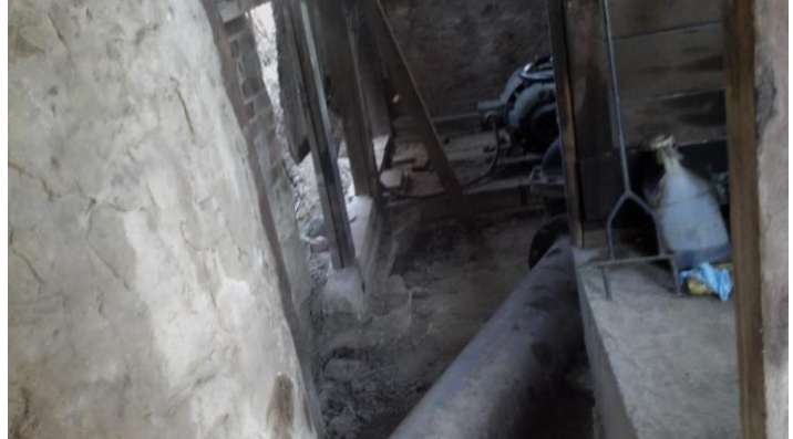
Pipes at connection to concrete surge box on WS inside pumphouse.