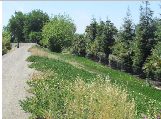
Looking southwest at landscaping on landside slope. (Spring 2012)