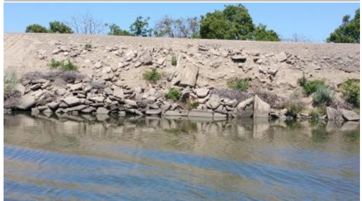
Close view of the site.