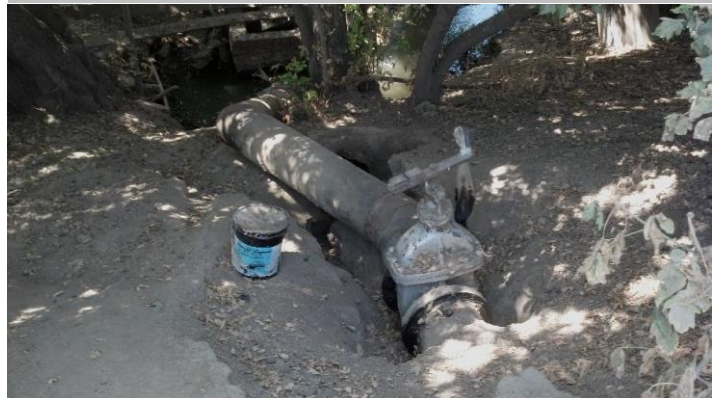
Pipe, gatevalve, and erosion on LS slope.