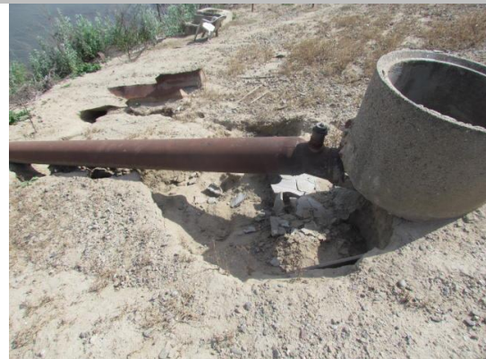
Looking south at erosion around irrigation pipe on waterward slope.