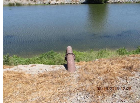
Pipe visible and open on WS slope.