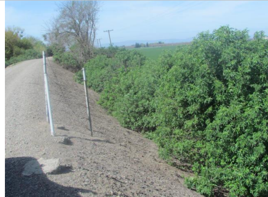
Looking southwest at dense vegetation on landward toe.