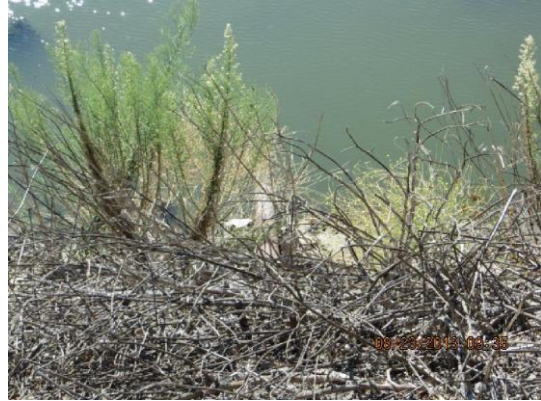
Pipe visible on WS toe.