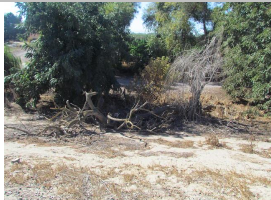
Looking at dead tree limb at landward toe fall 2015.