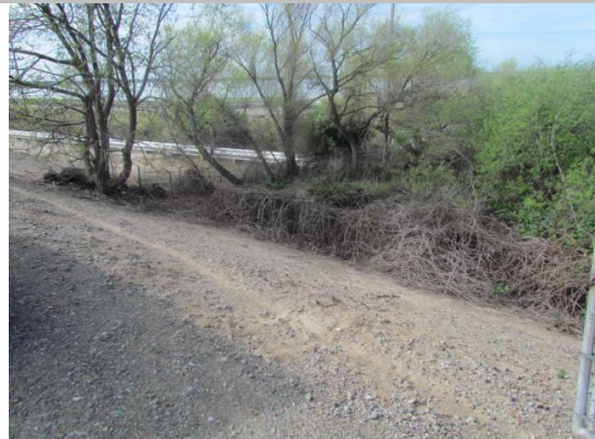
Looking southwest at vegetation on landward slope and toe. (Spring 2013)