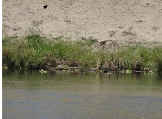
Front view of the erosion site. Vegetation is visible.