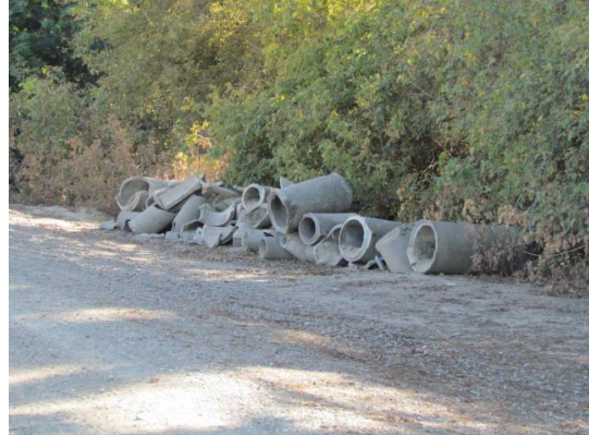
Looking southwest at concrete pipes on landside toe.