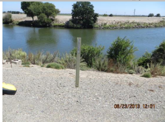
Gasline marker on WS shoulder.