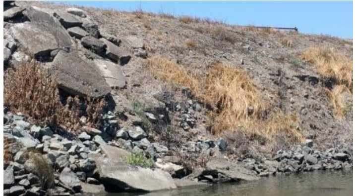
Close view of the erosion.