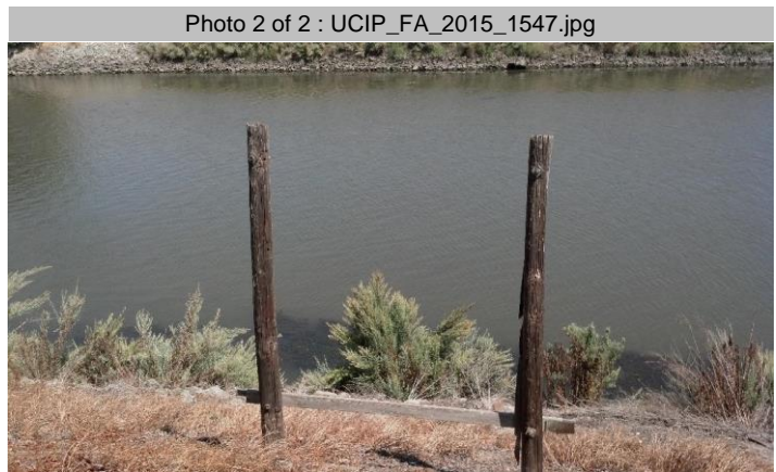
Sign posts with sign removed on WS slope.