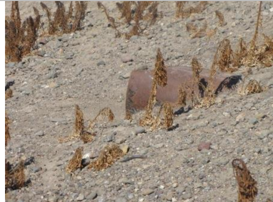
Looking west at pipe on landside slope.