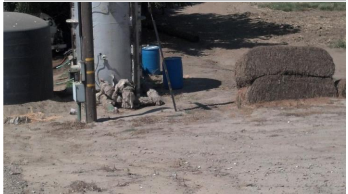
Steel irrigation line visible in front of tank to right of powerpole off LS toe.