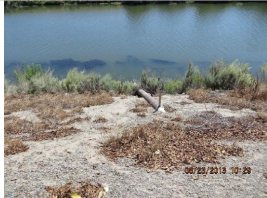
Pipe visible on WS slope.