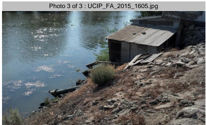
Pipes and pumphouse on WS slope.