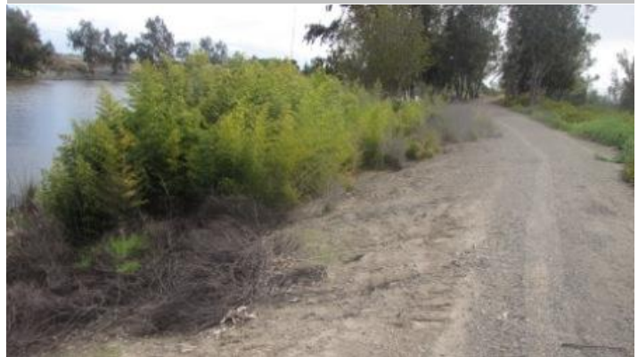
Looking southeast at dense vegetation on the waterside slope.