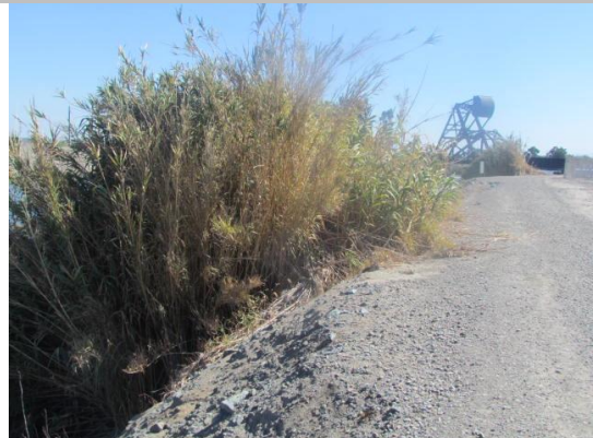
Looking south at bamboo on waterside slope. (Fall Inspection 2012)