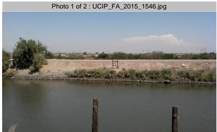
Sign posts visible on opposite river bank in same condition.