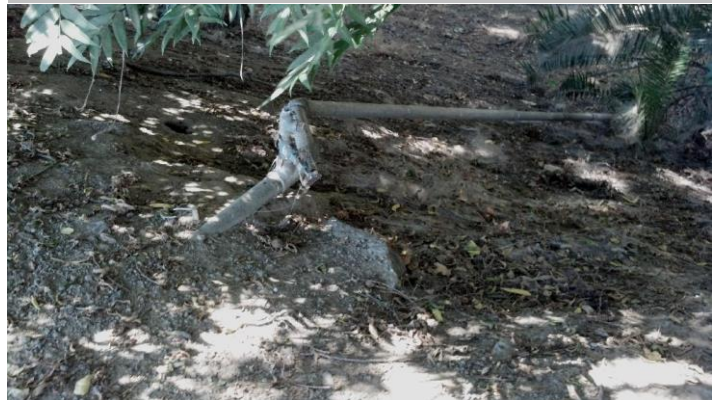
Pipe and vent visible on LS slope.