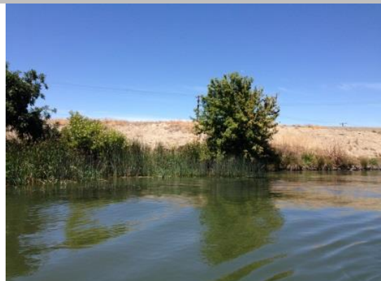
Front view of the erosion. The tree and vegetation block the view of the site.