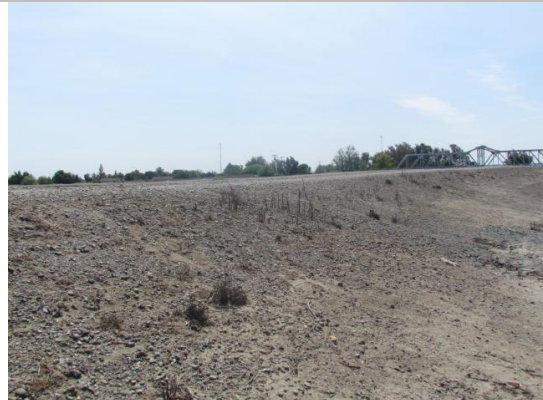
Looking southeast at depression on levee crown.