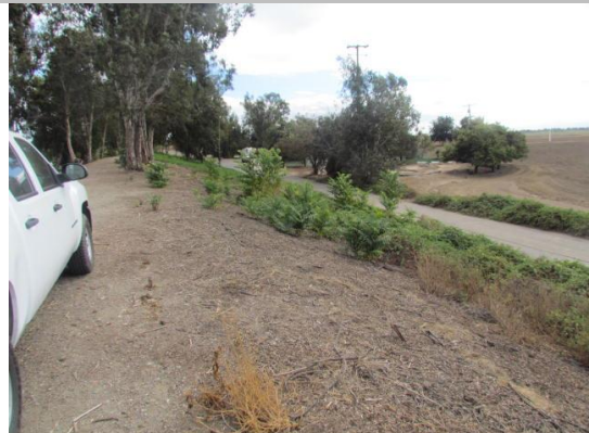
Looking south at vegetation blocking view of landward toe.