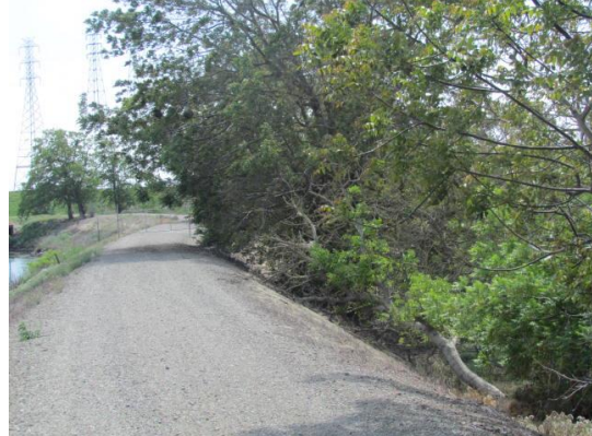
Looking south at untrimmed trees on landward slope and toe.