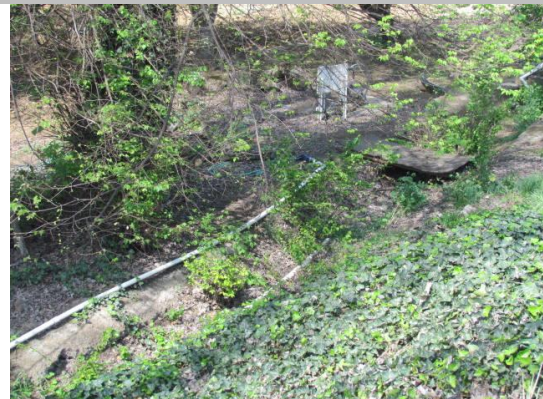
Looking northwest at an old irrigation ditch at landward toe.