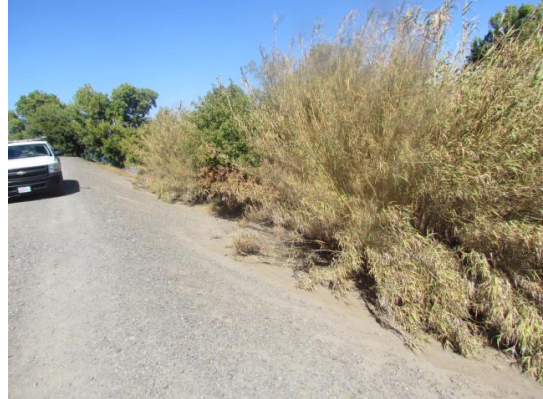
Looking northeast at sprayed bamboo on waterside slope. (Fall 2012)