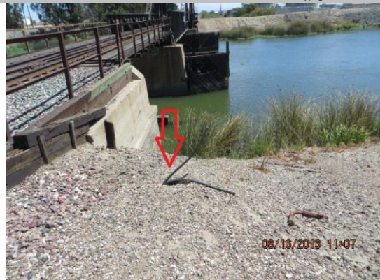
Conduit visible on WS shoulder next to bridge abutment. Cable appears to be abandoned.