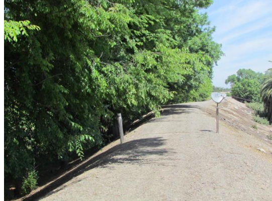
Looking north at dense trees overhanging levee crown.