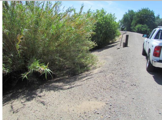
Looking southeast at bamboo on waterside slope.