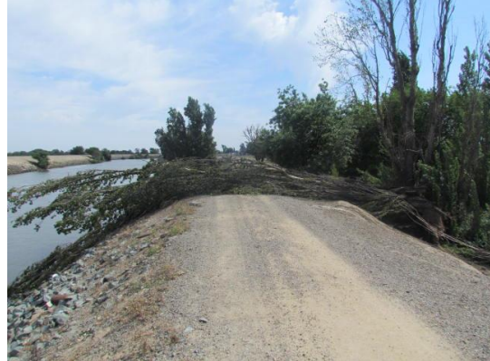
Looking south at large tree across levee crown.