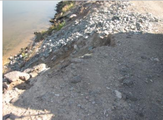
Looking upstream (south) at erosion site.