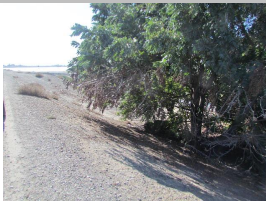
Looking southwest at low hanging tree branches at landside toe.