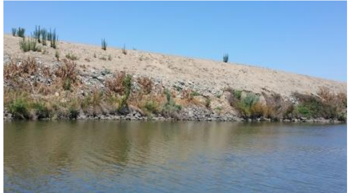
Front view of the erosion.