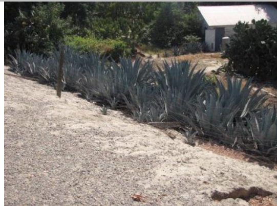
Looking southeast at fence and cactus on landside slope and toe.