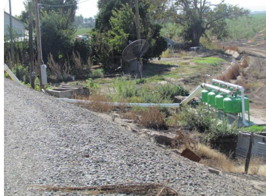
Looking west at water filtration system on landside toe.