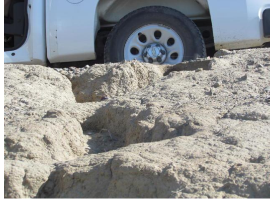
Looking east at erosion on landward slope.