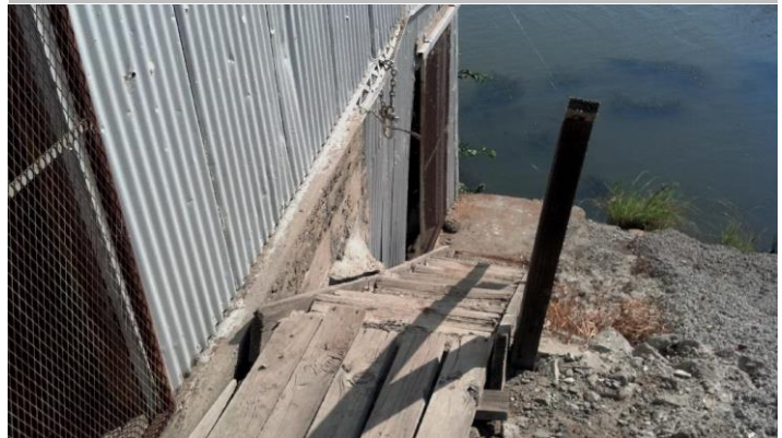
Steps to pump on WS slope.