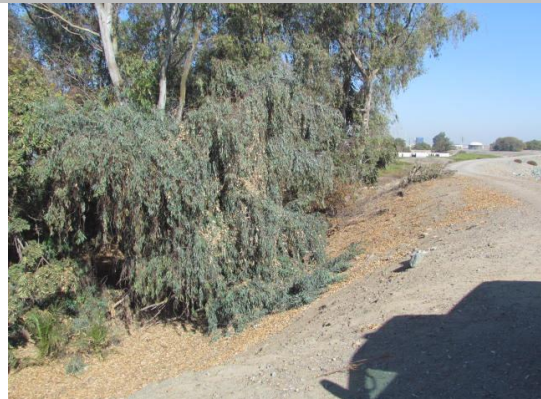
Looking southwest at dense trees on landward slope and toe fall 2015