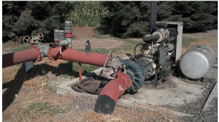
Pumping plant with siphon breaker, vents, and butterfly valves.