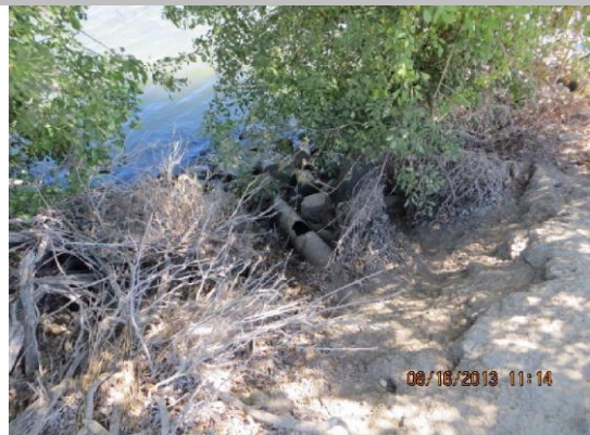
Large hole in pipe at WS toe.