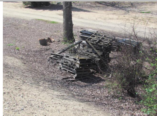
Looking west at wooden pallets at landward toe.