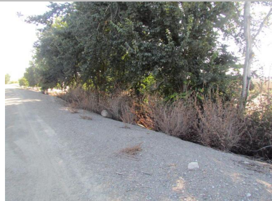
Looking southwest at dense vegetation and low hanging tree branches on landside slope and toe.