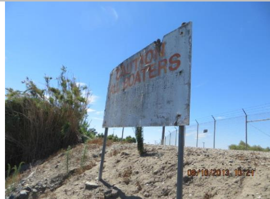
Signage for effluent pipe on WS shoulder.