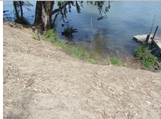
Looking east at waterward erosion and depression.