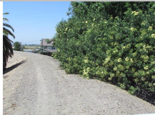
Looking south at dense elderberry on landside slope.(Spring 2012)