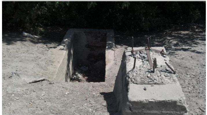
Foundation for pump with distribution box on WS shoulder.