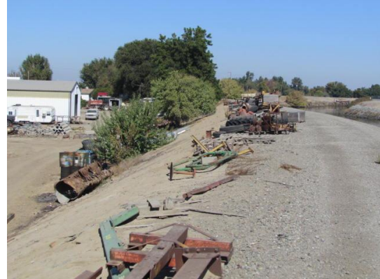
Looking north at farm equipment stored on landward shoulder.