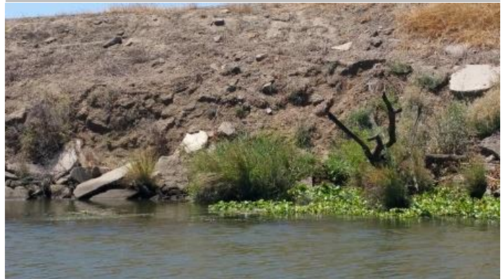
Close view of the pocket erosion.