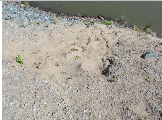
Looking east at waterside erosion appears to be caused by runoff.