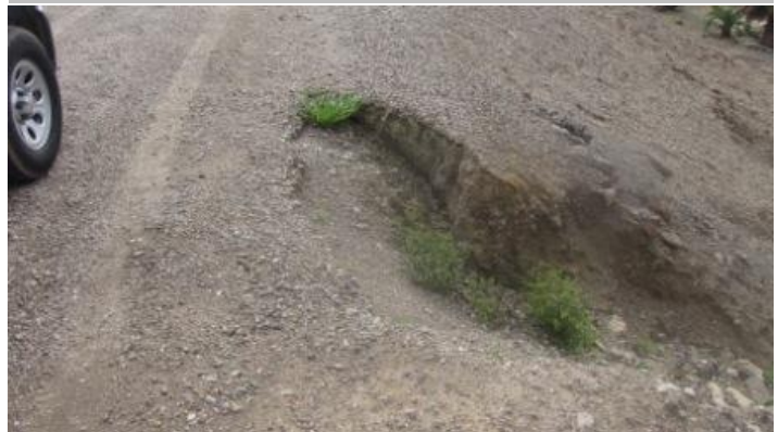
Looking at updated slope stability as of Fall 2013.