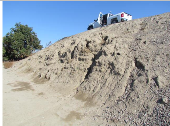
Looking northeast at several finger erosion on landward slope.