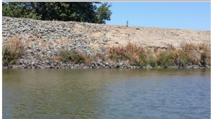
Front view of the erosion.