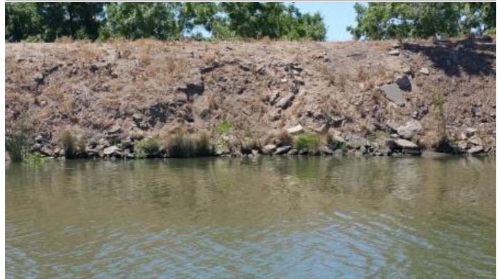
Close view of the erosion.