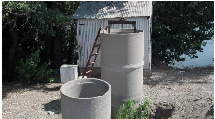
Slide gate in concrete riser with secondary concrete riser in foreground. Pumphouse in background.