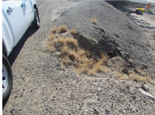
Looking south at caving on landward shoulder. (Fall 2015)