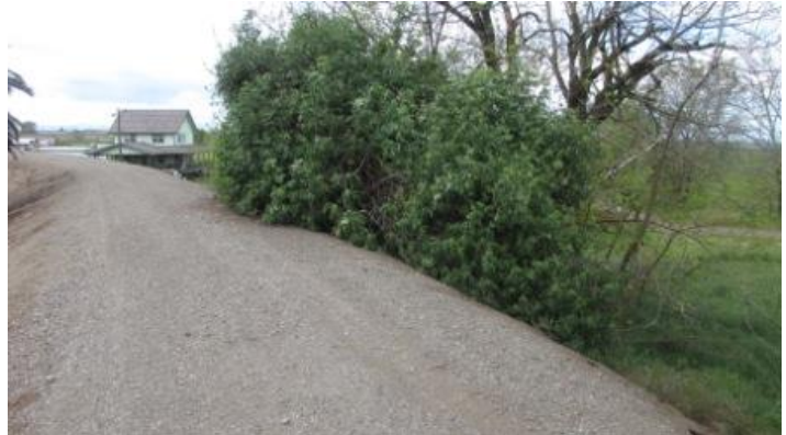
Looking south at elderberry on landside slope.(Spring 2011)