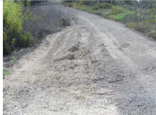
Looking south slope damage on waterward shoulder and slope.