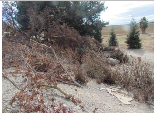
Looking southwest at tree limbs on landward slope.