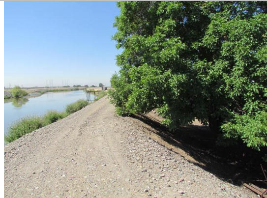
Looking south at dense trees on landside slope.