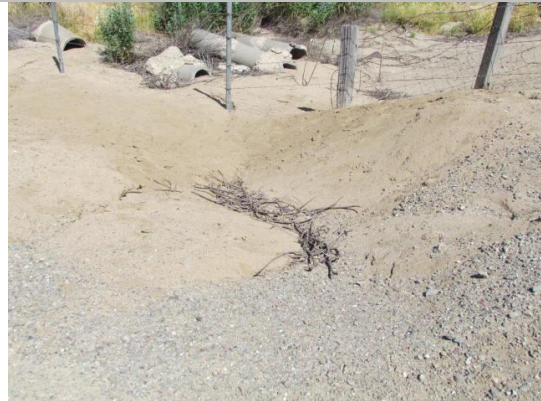
Looking west at slope damage on landside slope.