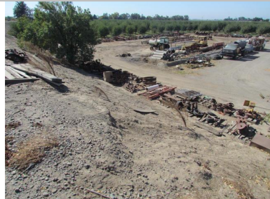
Looking west at farm equipment stored at landward toe.