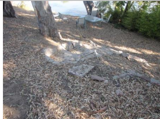
Looking northeast at non-permitted concrete stairs on waterside slope.