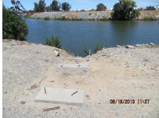
Concrete pad for pump mount on WS shoulder.