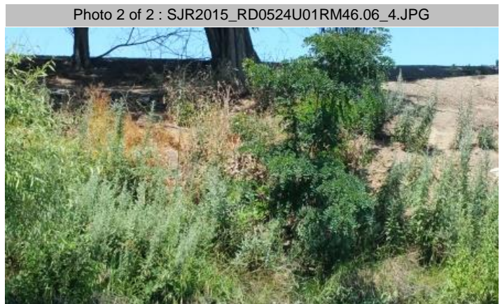
Close view of the site. Note large trees at the levee shoulder.