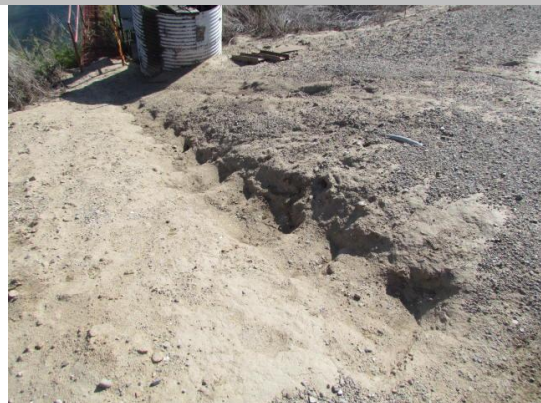
Looking southeast steps cut into waterside slope.