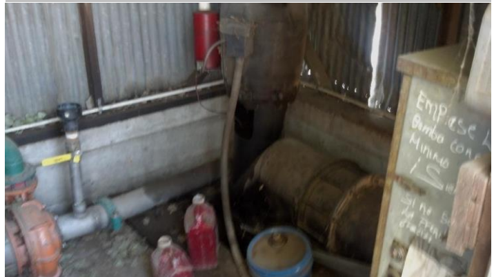
Pump and pipe inside pumphouse.