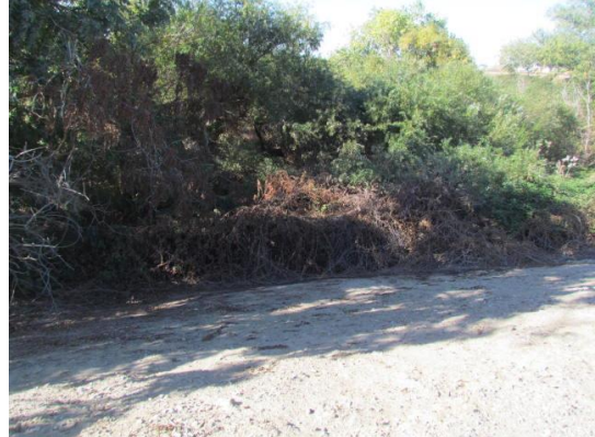
Looking west at dense vegetation on landside toe. Spring 2014