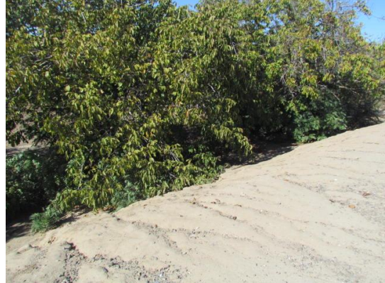
Looking northeast at untrimmed tree on landward slope and toe fall 2015.