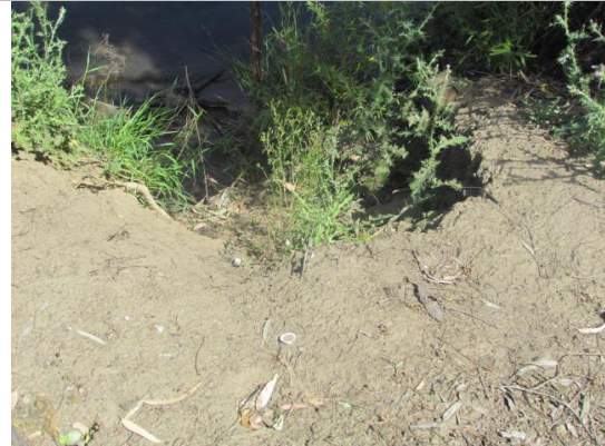
Looking east at waterward erosion.