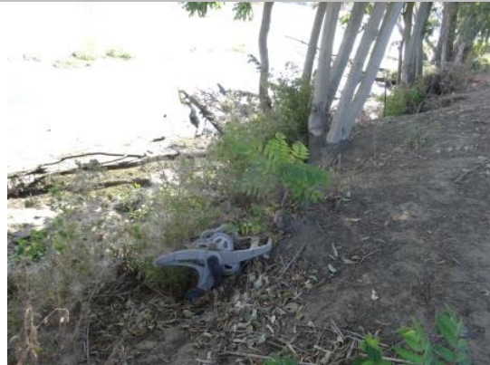
Front view of the site where undermining has occurred.