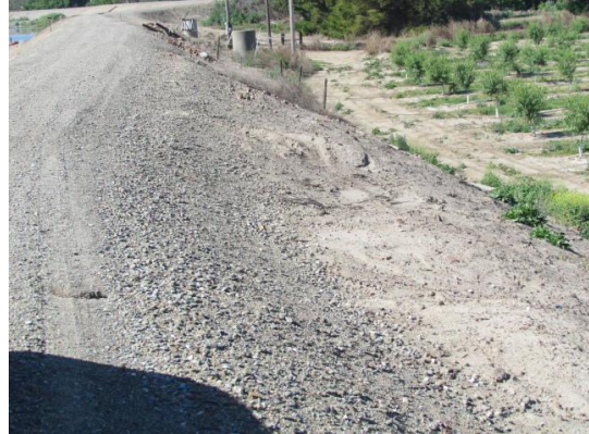
Looking southwest at caving slope on landside of levee.