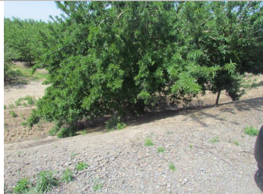
Looking east at untrimmed tree on landward slope.