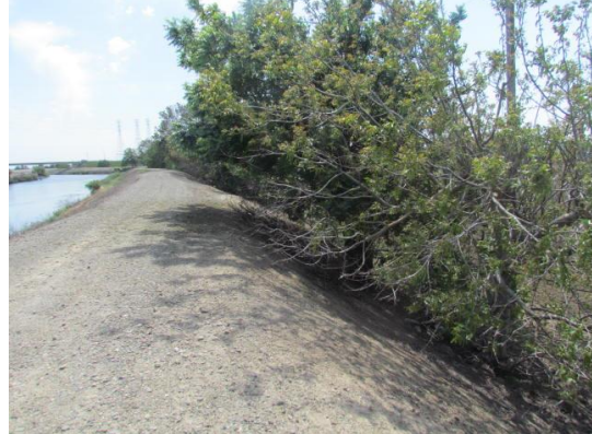
Looking south at untrimmed trees on landward slope.