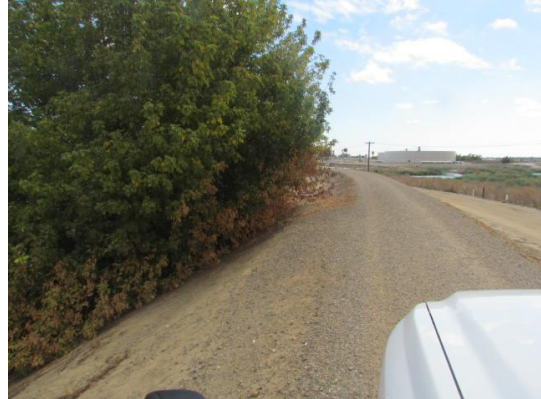
Looking south at untrimmed tree on waterward slope. (Fall 2014)