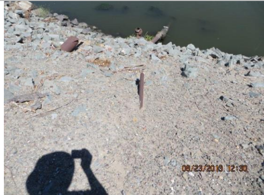
Pipe visible on WS slope.