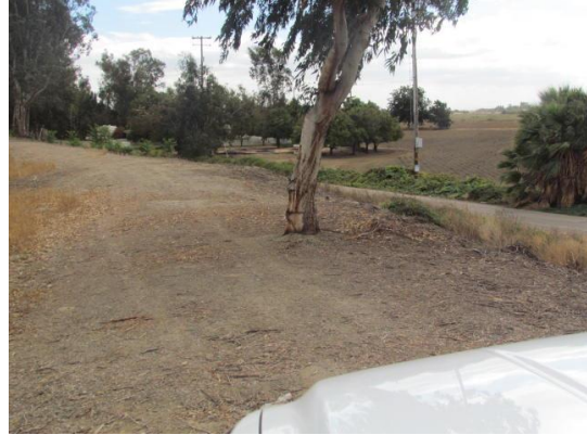
Looking south from levee crown at upstream end of corrected site.