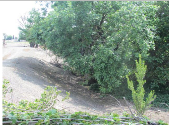
Looking southeast at untrimmed trees at landward toe.