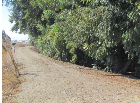
Looking southwest at dense untrimmed trees on landward slope and toe fall 2015.