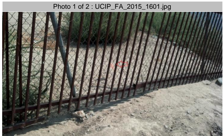
USAA markers along alignment at gate.