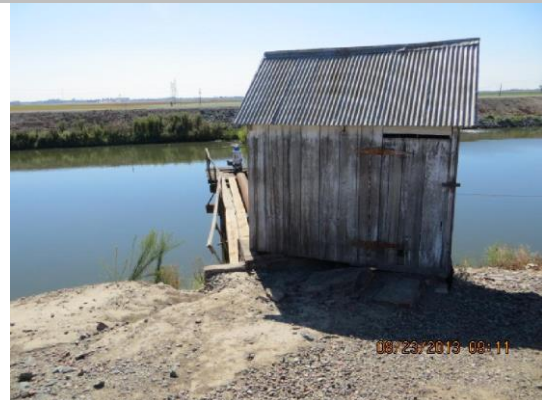
Pump on pier and slide gate house on WS shoulder.