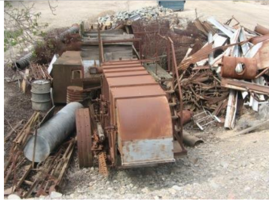
Garbage at landward toe next to ramp at LM 4.64