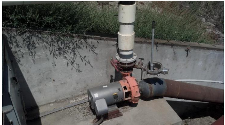
Pump and butterfly valve on concrete pad on WS shoulder.