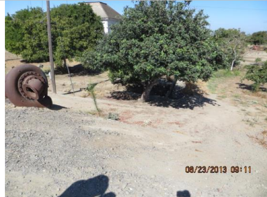
Brick and mortar channel on LS toe.