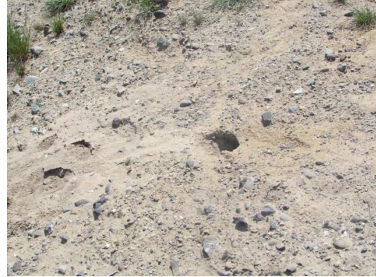
Looking at typical rodent holes on landward slope along this reach.