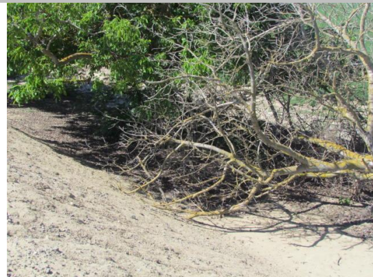
Looking west at dead tree at landside toe.