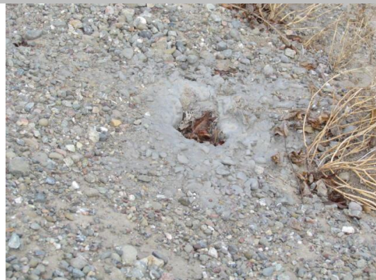
Looking north at typical view of grouted rodent holes on waterward slope.