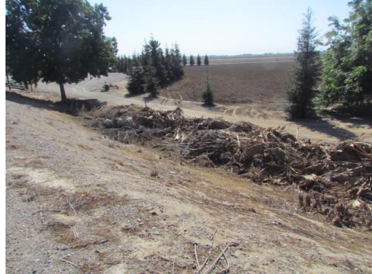
Looking southwest at prunings on landside toe.