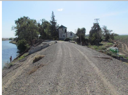
Looking south at unauthorized irrigation pipe across levee and water filtration system at landside toe.