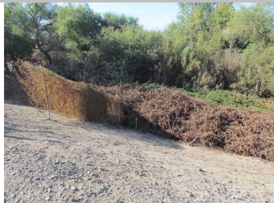
Looking west at dense vegetation at landward slope and toe fall 2015.