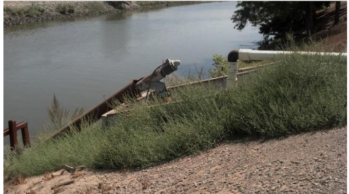
Slant pump visible at concrete foundation on WS slope. Pumphouse removed.