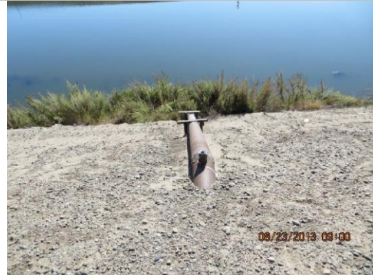
Pipe and siphon breaker on WS slope.