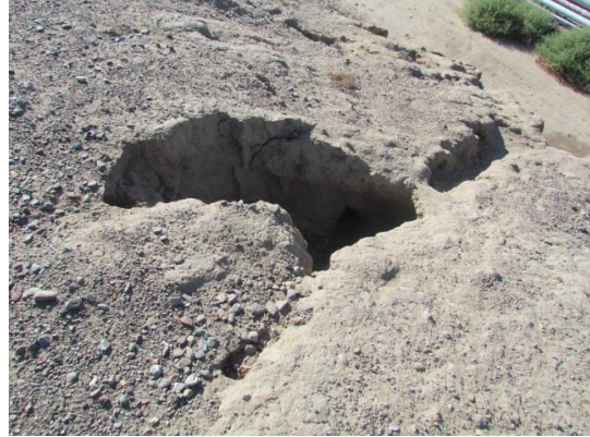
Looking southwest at hole on landward shoulder.