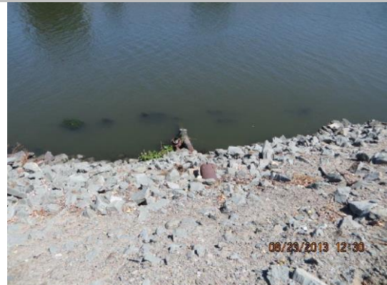
Pump and open pipe visible on WS slope.