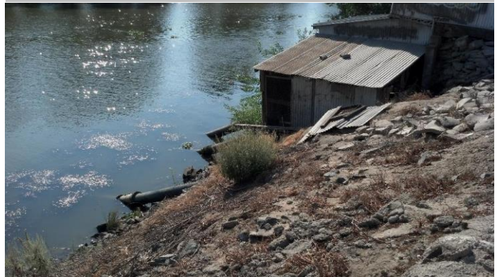
Pipe visible at lower left.