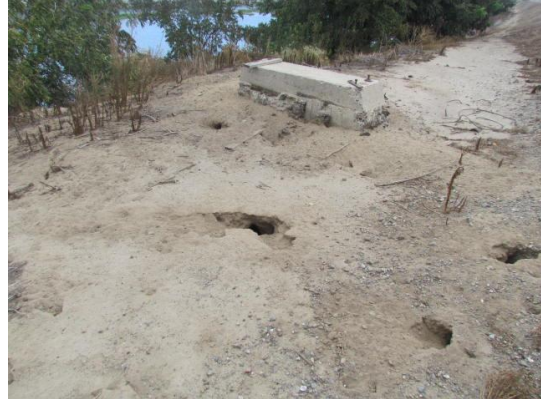
Looking southeast at several rodent holes on waterward slope.