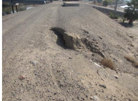
Updated picture of the erosion site on the landside shoulder. Fall 2014