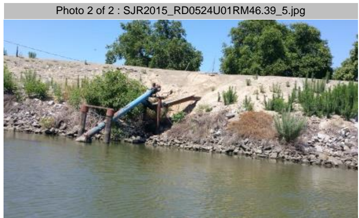
Front view of the site.