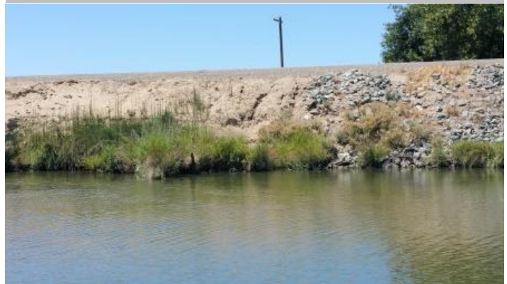
Direct view of the site.