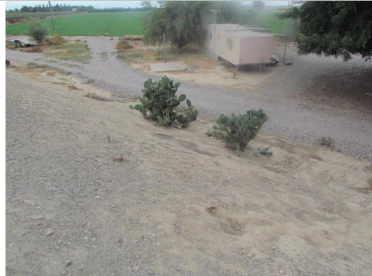
Looking west at cactus on landside toe.