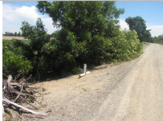
Looking north at elderberry and trees on landside slope.