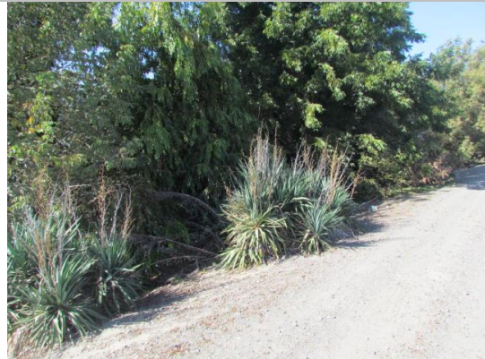
Looking northwest at dense vegetation on landside slope.