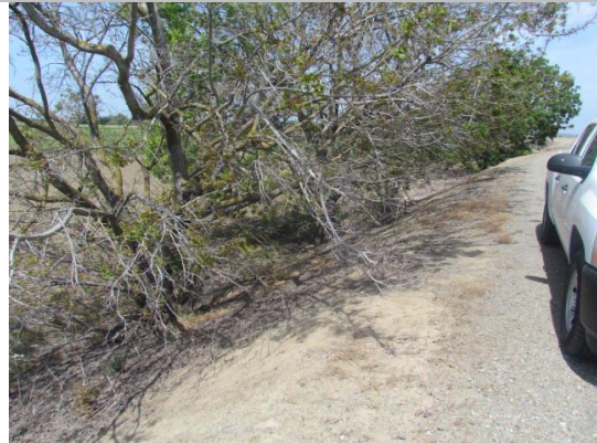
Looking northeast at untrimmed trees on landward slope.