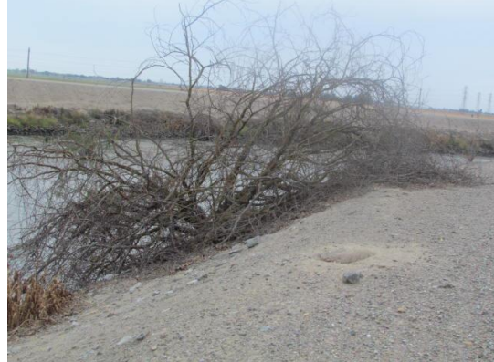
Looking southeast at dead tree on waterside slope.