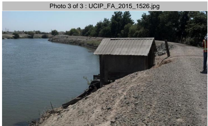
Pipe and pumphouse on WS slope.