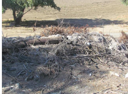
Looking west at pruning pile at landward toe fall 2015.