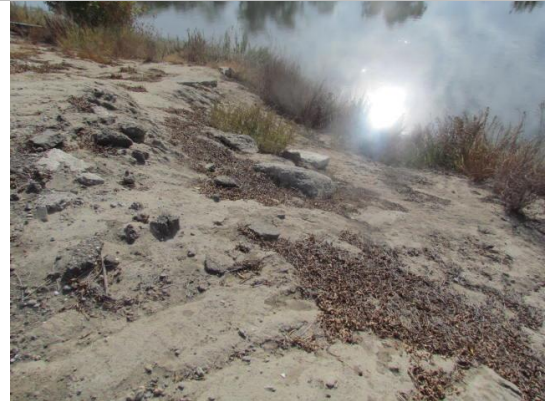
Looking east at erosion on waterside slope.