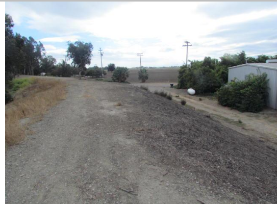
Looking south from levee crown at corrected site.