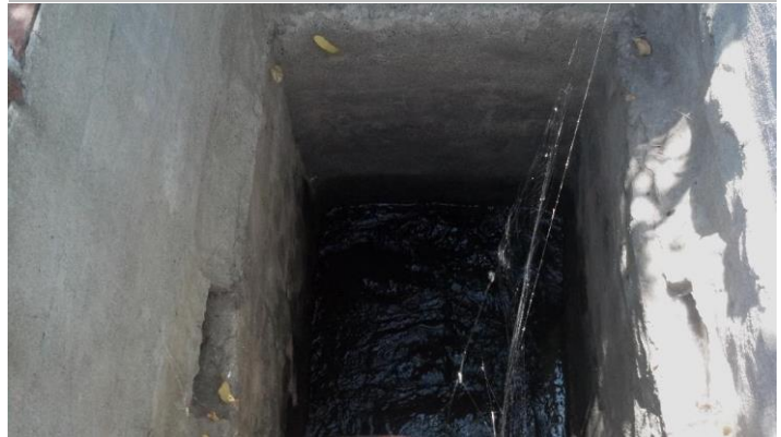
Distribution box on LS toe.