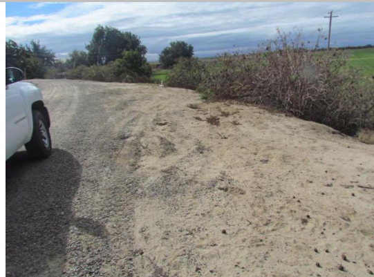
Looking southwest at damaged landward slope.