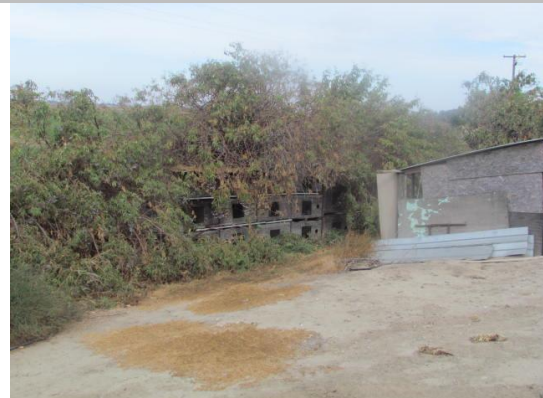
Looking west at animal pens on landside toe. (Fall 2012)

Photo 1 of 2 : FA_2015_RD0524_107_42_20150914_00064.jpg