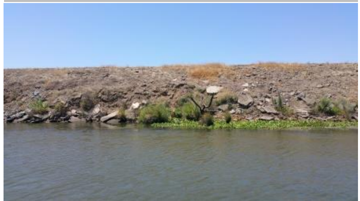
Front view of the erosion.