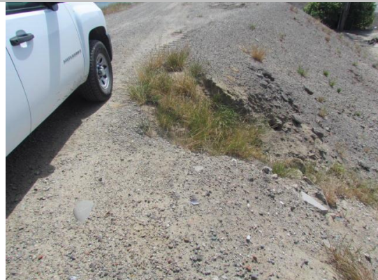
Looking south at caving on landward shoulder. (Spring 2015)