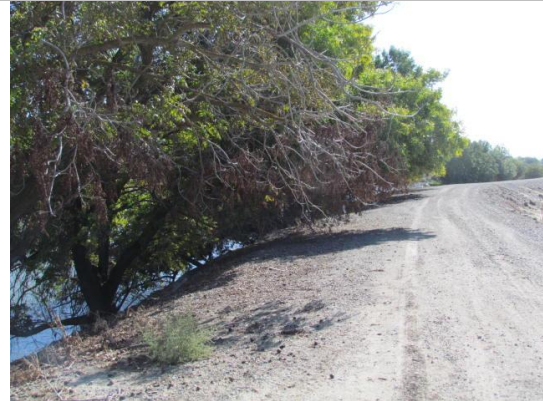
Looking northwest at low hanging tree branches at waterside toe.