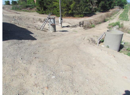
Looking southwest at an unauthorized ramp on landside slope.