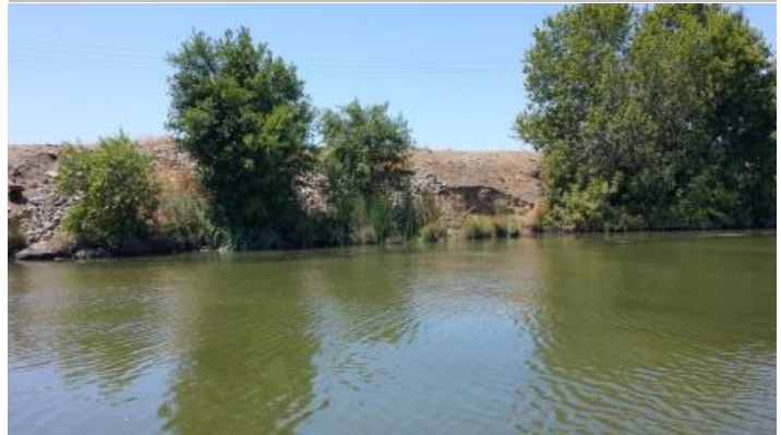
Front view of the erosion. Note the riprap protection near the site.