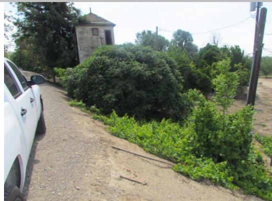
Looking south at untrimmed trees on landward slope.