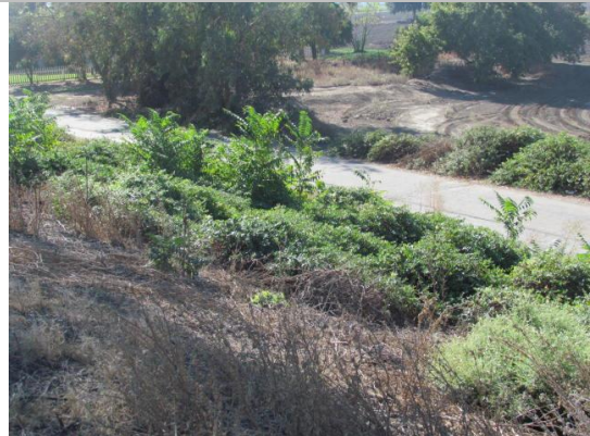
Looking southwest at dense vegetation on landward slope fall 2015