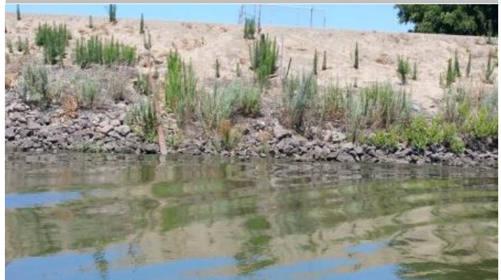
Front view of the site.