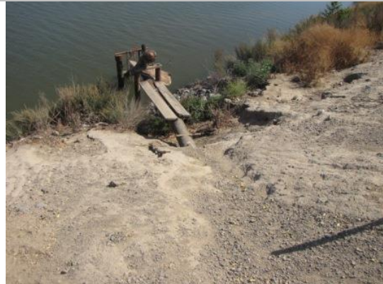
Looking southeast at erosion around pipe.