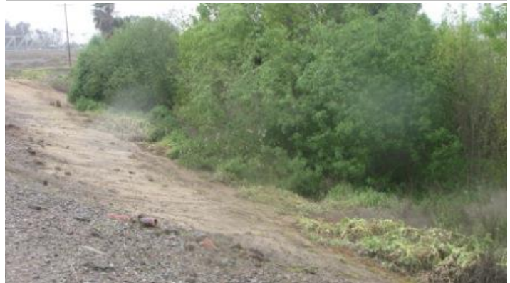
Looking southwest at dense veg. on landside toe.