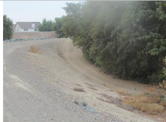
Looking southeast at unauthorized ramp on landside slope and toe.