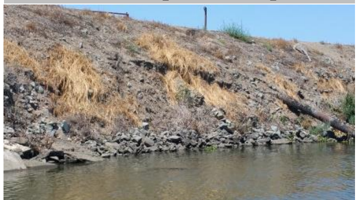
Close view of the erosion. Note the irrigation pipe.