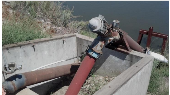
Slant pump and pipe on WS slope.