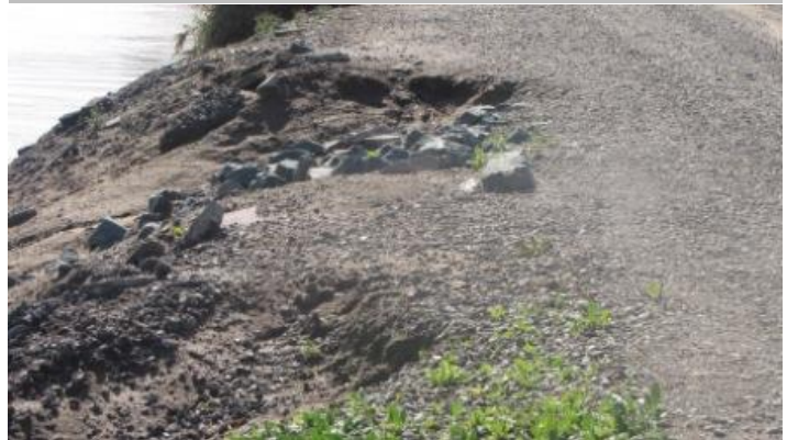
Looking south at erosion on waterside shoulder.