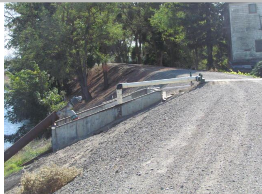
Looking south unauthorized PVC irrigation pipe across the levee crown.