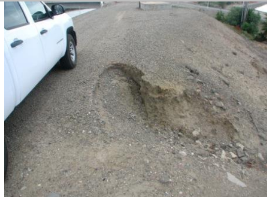
Landward slope damage. Spring 2014