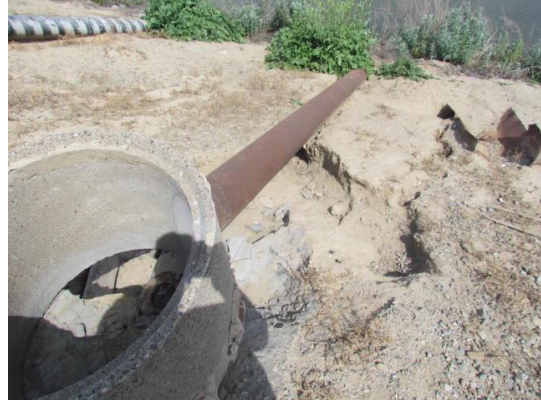
Looking east at erosion around irrigation pipe.