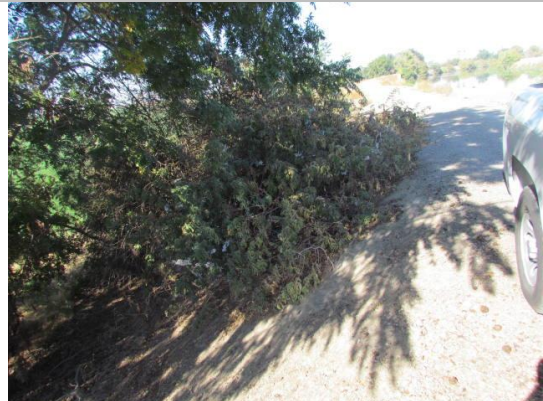
Looking northwest at dense veg on landward slope and toe fall 2015.