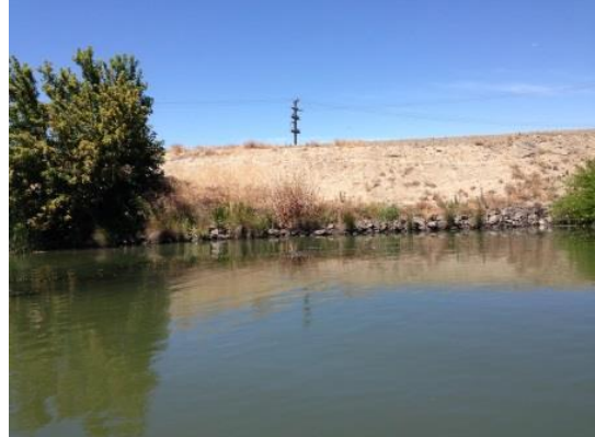
The erosion is invisible because of the dense vegetation.