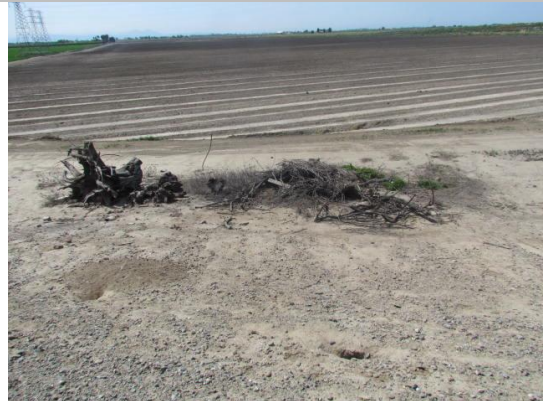
Looking east at pruning piles at landward toe and berm.