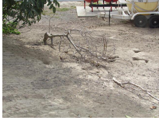
Looking typical view of several rodent holes on landward slope and toe.