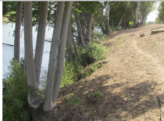
Looking south at waterward erosion.