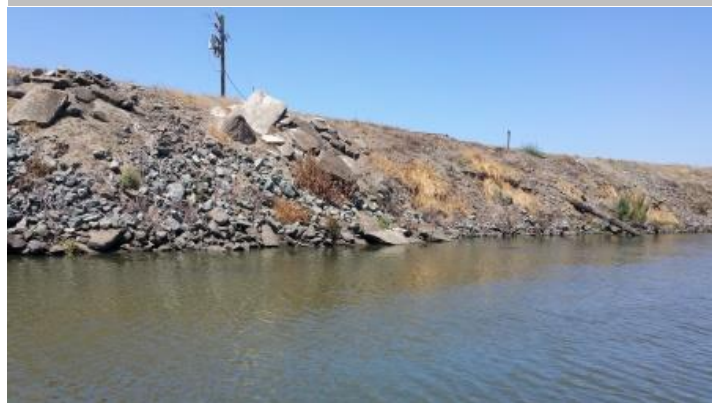
View from upstream.