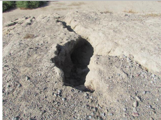
Looking west at hole on landward shoulder.