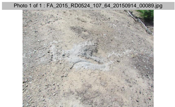
Looking at typical view of grouted rodent holes on landward slope.