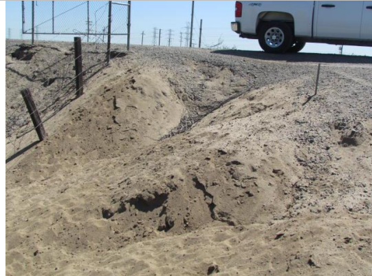
Looking east at slope caving on landside slope.