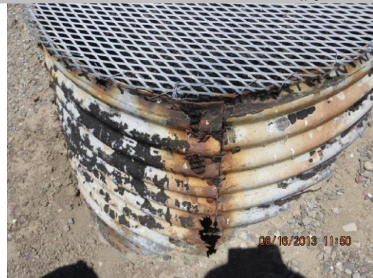
36-inch CMP riser on LS slope severely corroded with various holes along seams.