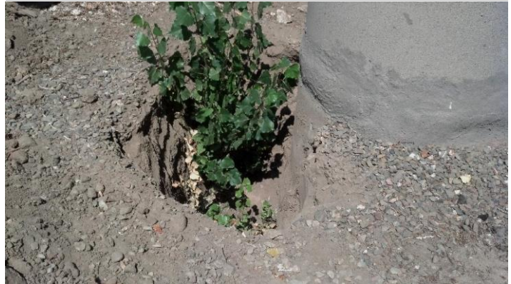
Hole over pipe next to 4-foot diameter concrete standpipe on WS slope.