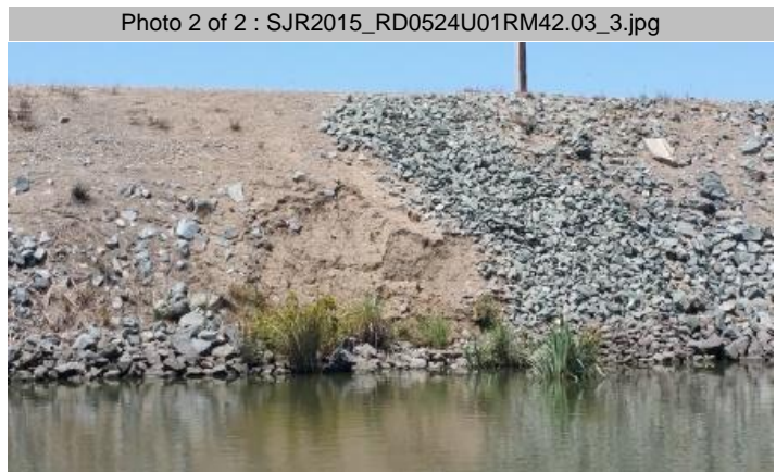
Close view of the erosion.