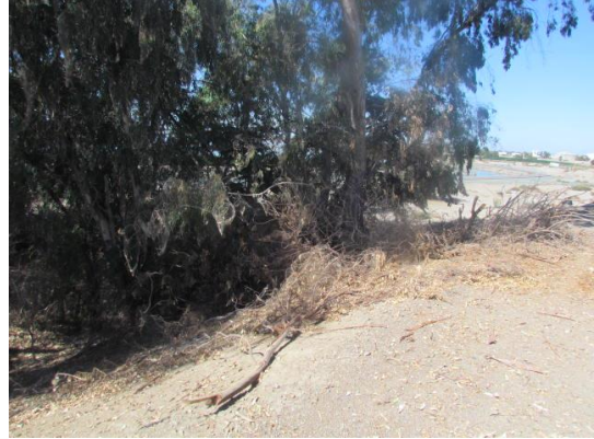
Looking south at trees on landside slope. (Fall 2012)