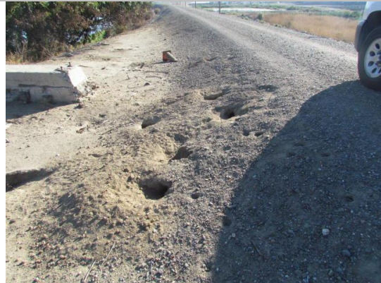
Looking southeast at several rodent holes on waterward slope Fall 2015.