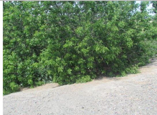
Looking south at dense trees on landward slope spring 2015