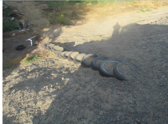
Looking west at rubber tires being used as stairs on landside slope.