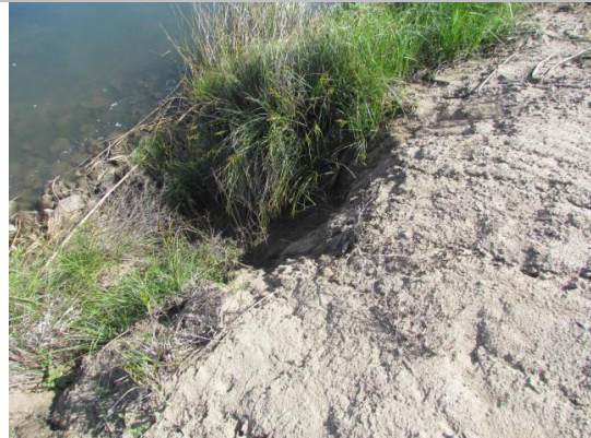
Looking southeast at erosion on waterward toe.