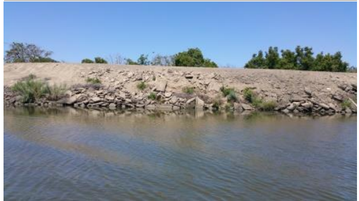
Front view of the erosion site.