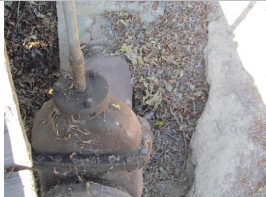
Looking at erosion around irrigation pipe on waterward slope.