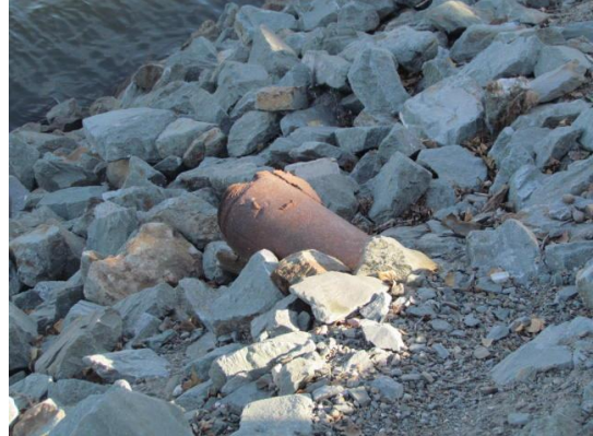
Looking southeast at abandoned pipe on waterside slope.