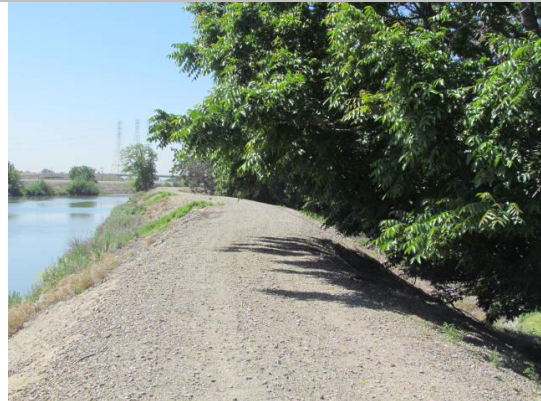
Looking south at overhanging trees.