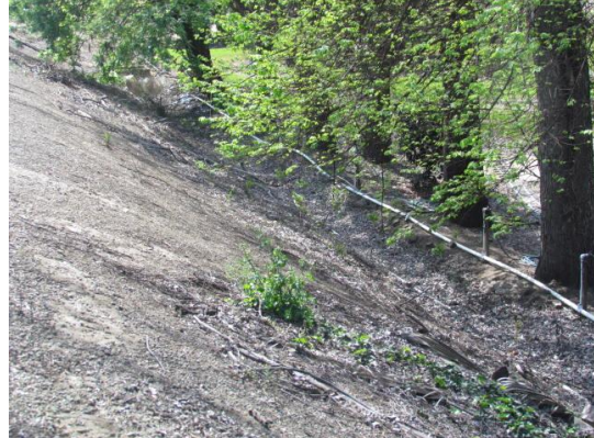
Looking southwest at an old irrigation ditch at landward toe.