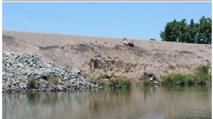
Front view of the erosion.