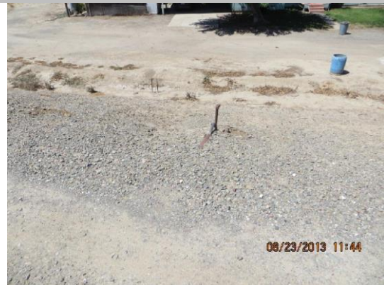
Steel waterline visible on LS shoulder.