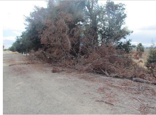
Looking south at tree limbs on landward slope.