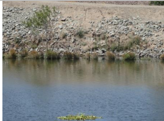
Front view of the erosion.