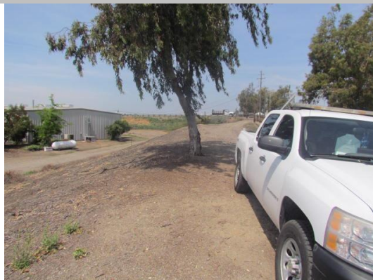
Looking northwest at tree on within levee crown.