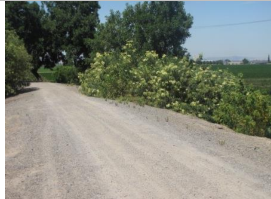
Looking south at elderberry on landside slope.