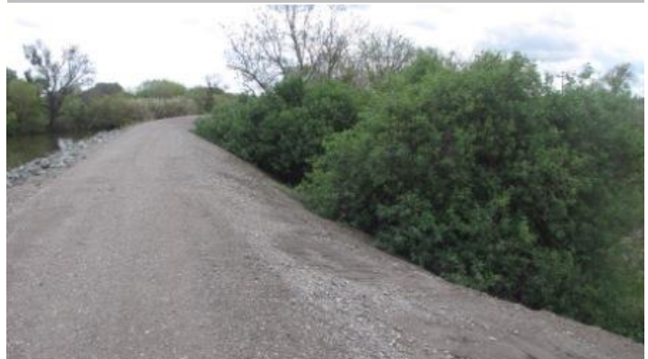
Looking south at dense veg on landside slope and toe.