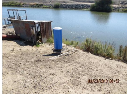
Pipe, pump, and tank visible on WS slope.