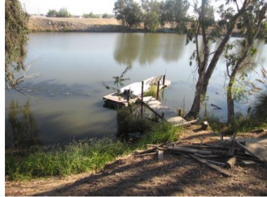
Looking east at non-permitted boat dock.