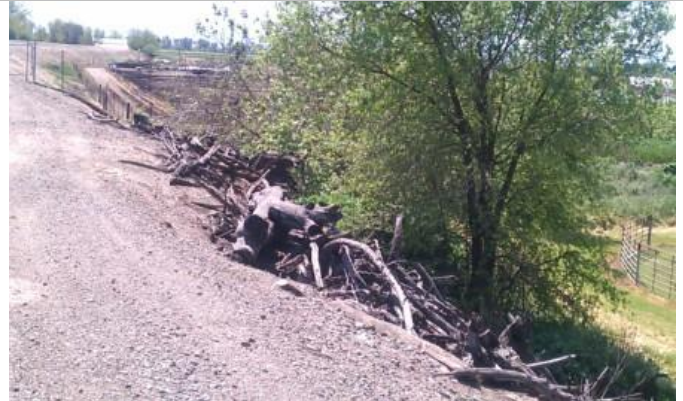
Looking southwest at prunings on landside slope.