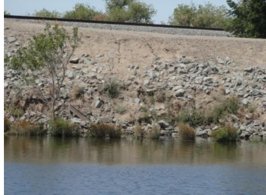
Close view of the erosion.