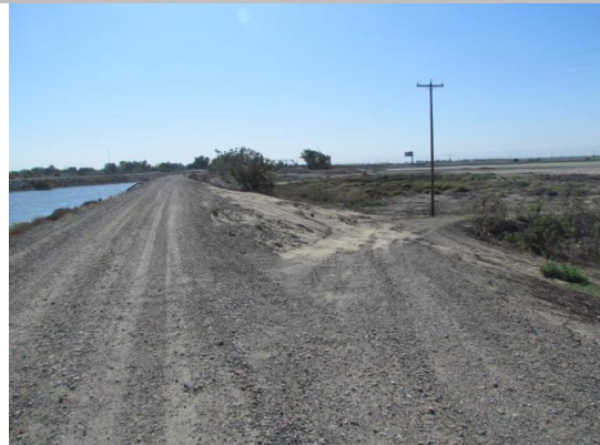
Looking south at unauthorized ramp on landside slope.