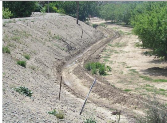
Looking south at irrigation ditch at landward toe.