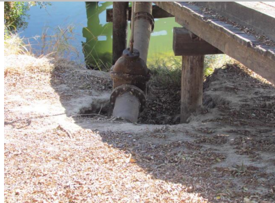
Looking east at erosion around irrigation pipe on waterward slope.