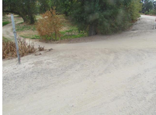
Looking southeast at unauthorized ramp on waterside slope.