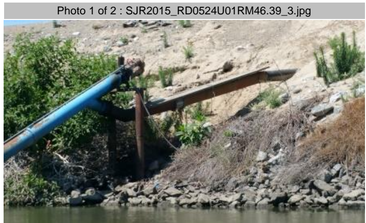
Close view of the erosion and the pipe.