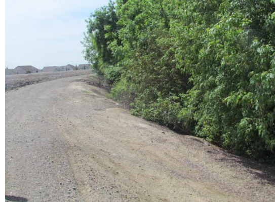
Looking south at dense trees on landward slope.