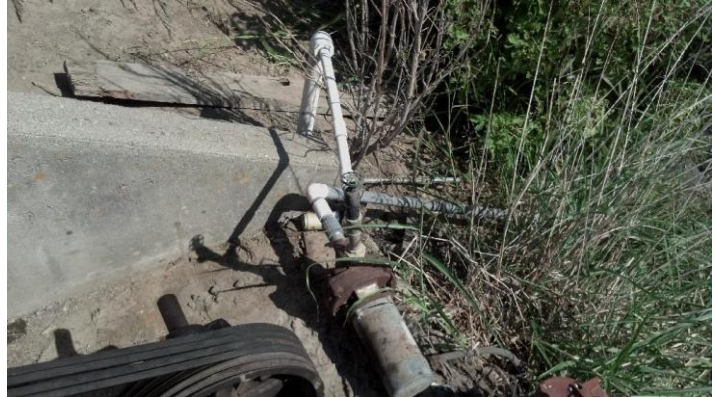
Pump on concrete pad at WS slope.