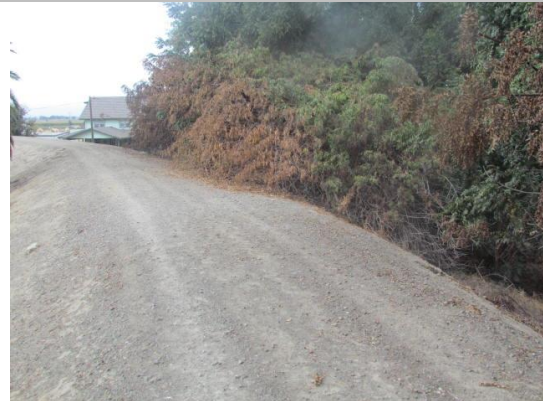
Looking southwest at dense vegetation on landside slope.