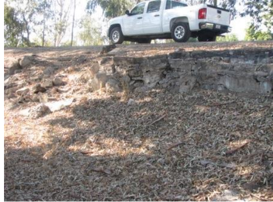
Looking southwest at retaining wall connected to concrete stairs.