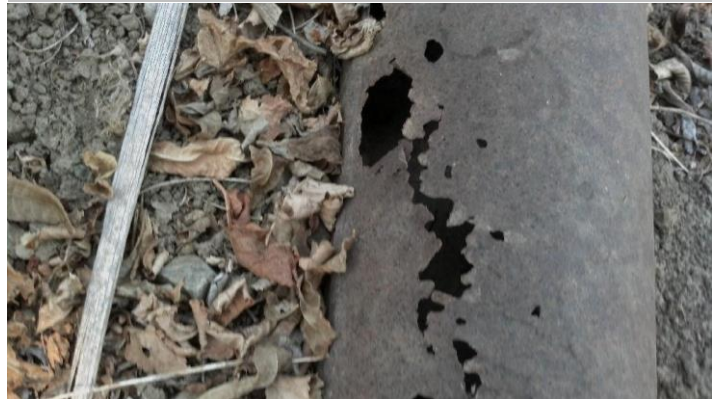
Holes in pipe along exposed side of pipe at WS slope.