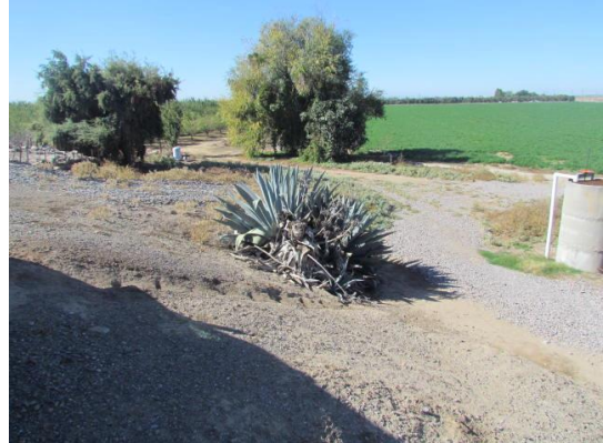
Looking southwest at century plant at landward toe fall 2015.