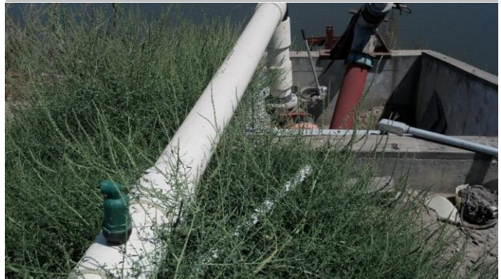
Vent on PVC pipe at WS shoulder.