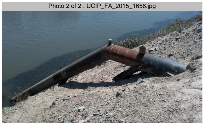
PVC wrapped pipe and siphon breaker visible on WS slope.