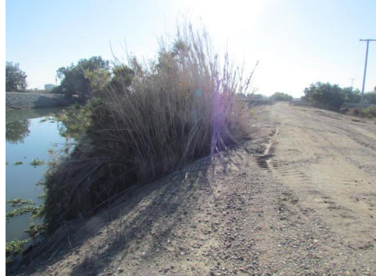
Looking south at dying bamboo on waterward slope. Fall 2015