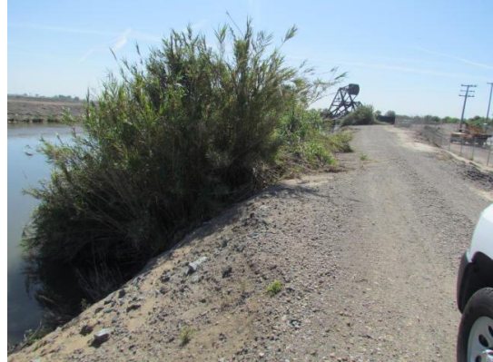
Looking southeast at bamboo on waterside slope. (Spring 2012)