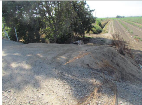
Looking west at unauthorized ramp on landside slope.