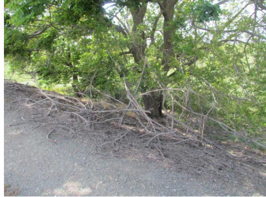
Looking east at untrimmed trees on landward slope.