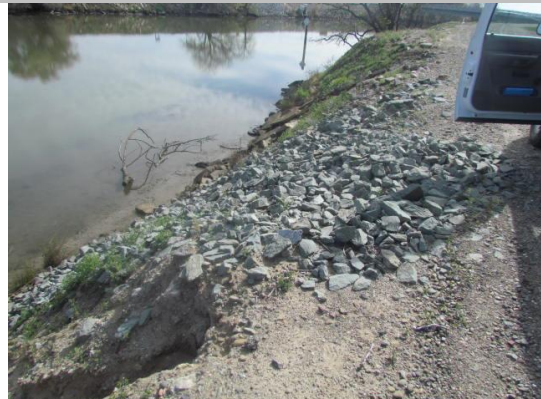
Looking southeast at erosion next to repaired site on waterward slope (Spring 2013)