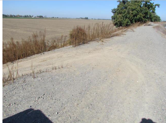
Looking northwest at slope damage on landward slope.