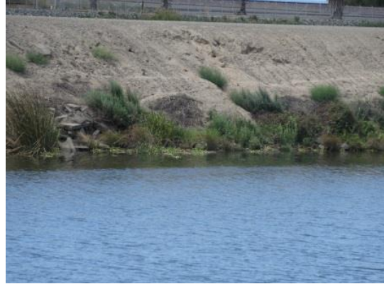
Front view of the erosion site. Note the vegetation at the levee toe and on the lower slope.