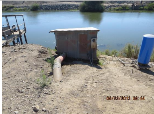
Pumphouse and pipe on WS slope.