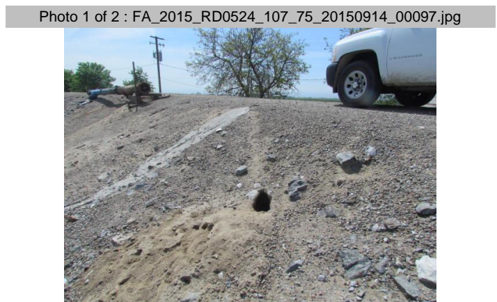
Looking southwest at typical rodent holes on waterward slope.