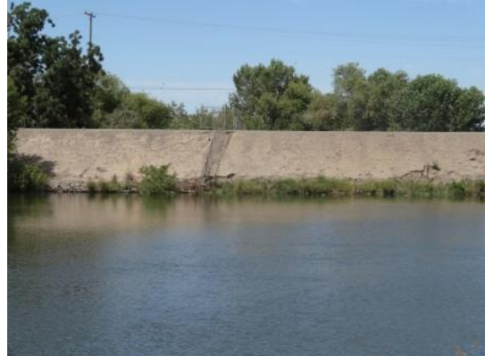
Front view of the erosion site.