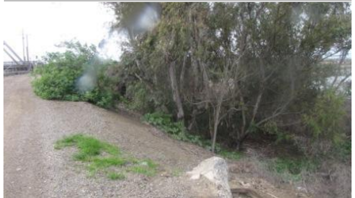
Looking south at dense veg. on landside slope and toe.