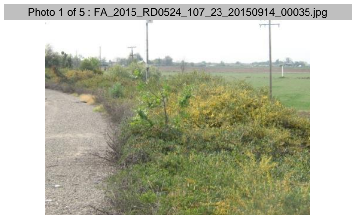
Overgrown landscaping on landward slope from LM 1.56 to 1.74