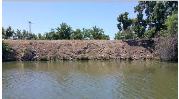
Front view of the erosion.