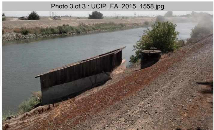
Pumphouse and gate valve in CMP riser on WS slope.