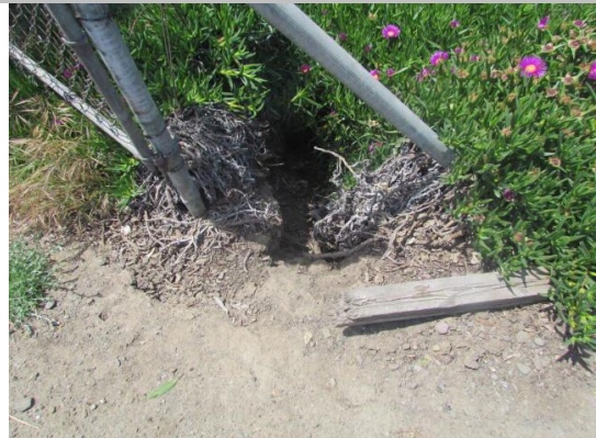
Looking west at erosion within landscaping on landward shoulder and slope.