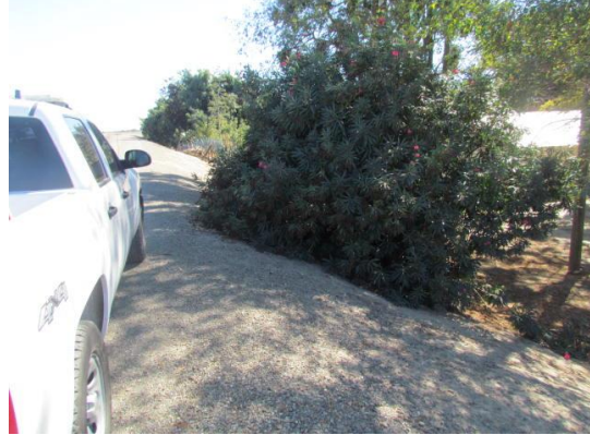
Looking south at oleander on landward slope fall 2015.