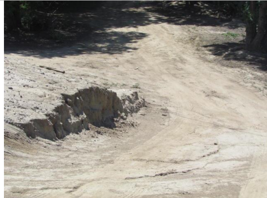
Looking west at unauthorized ramp and landside slope damage.