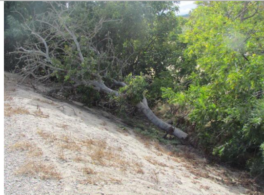
Looking south at downed tree on landward slope.