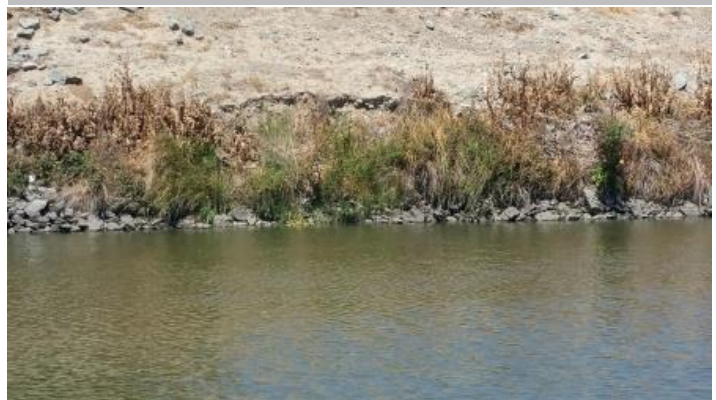
Close view of the erosion.