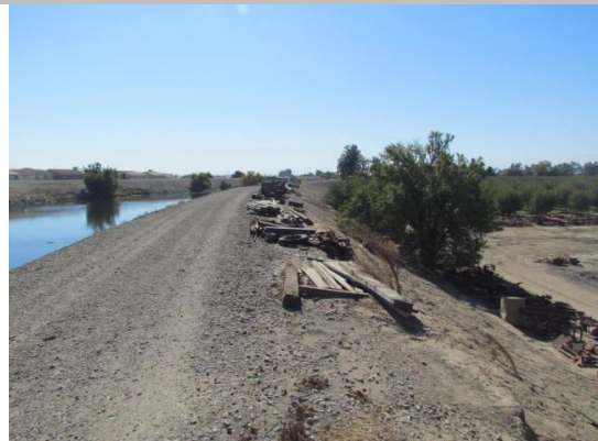
Looking south at farm equipment stored on landward shoulder and toe.