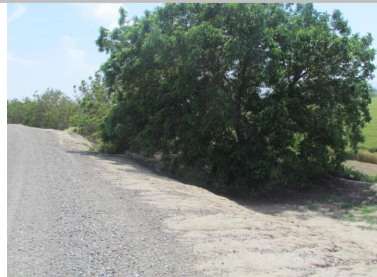
Looking southeast at untrimmed tree at landward toe.