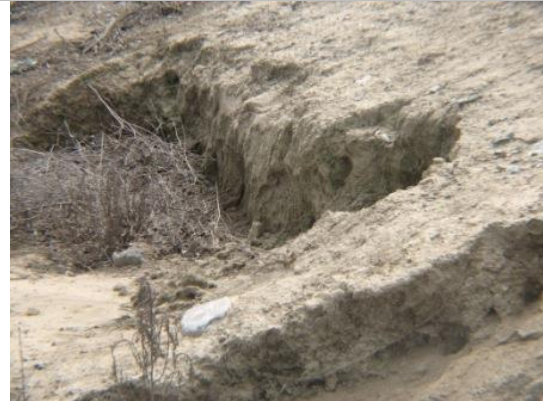
Erosion at waterward toe and around irrigation pipe at LM 5.92