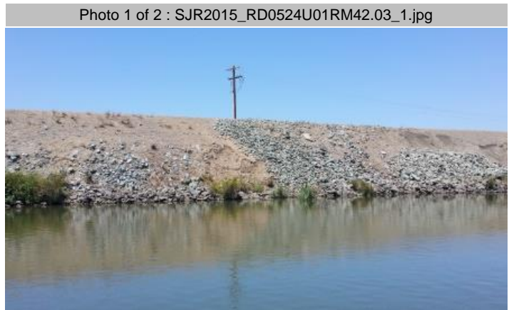
Front view of the erosion.