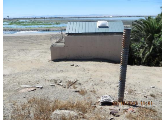
8-inch CMP standpipe on LS slope with pumphouse in background.