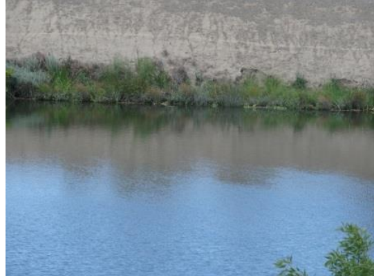
Front view of the erosion.