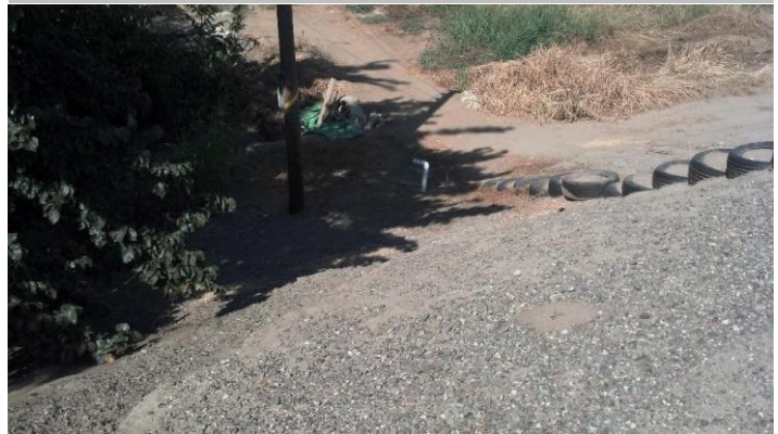
PVC pipe visible on LS toe.