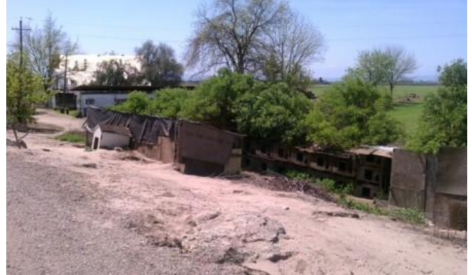
Looking at animal pens on landside slope and toe.