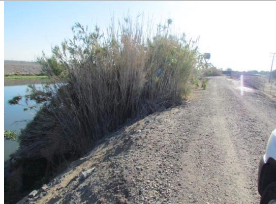
Looking south at bamboo on waterside slope. (Fall 2015)