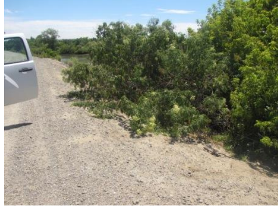
Looking north at elderberry on waterside slope.