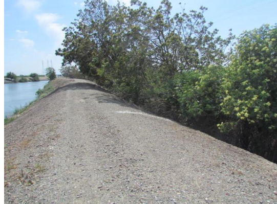
Looking south at untrimmed trees on landward slope.