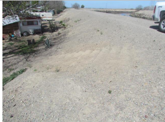
Looking north at steps cut into landward slope.