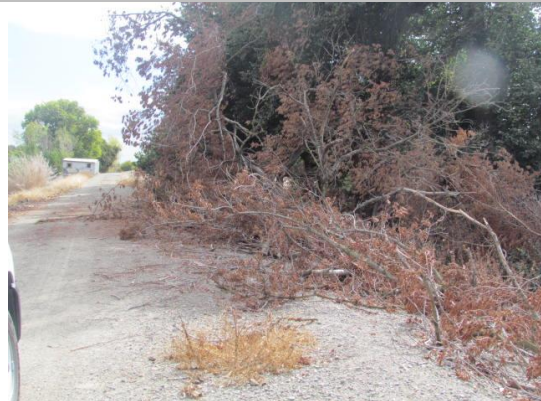
Looking south at tree limbs on landward slope.