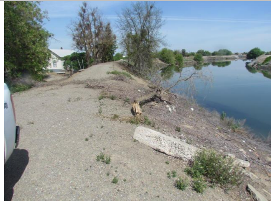
Looking northeast at tree limb on waterward slope.