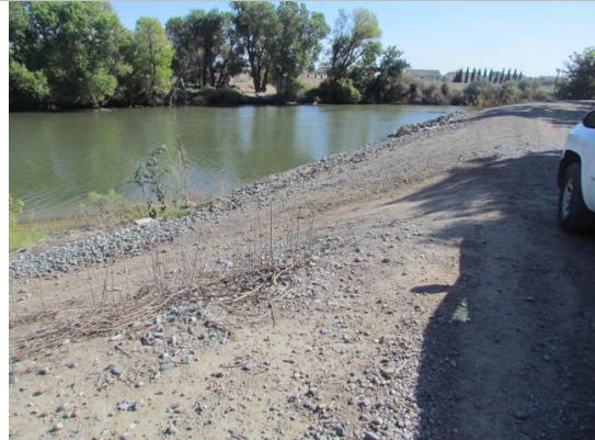
Looking southeast at unauthorized ramp on waterside slope.