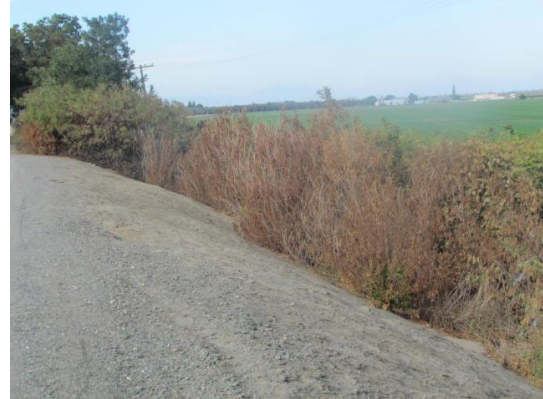
Looking southwest at dense vegetation and trees on landside slope. (Fall 2012)