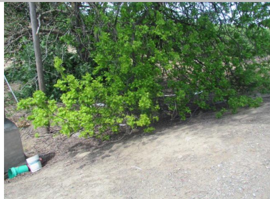
Looking east at untrimmed tree at landward toe.