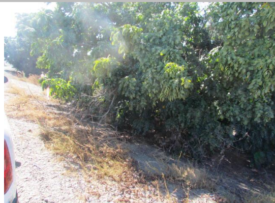
Looking southwest at untrimmed trees on landward slope and toe.