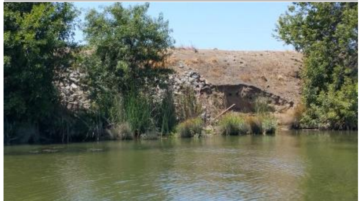
A close view of the erosion.