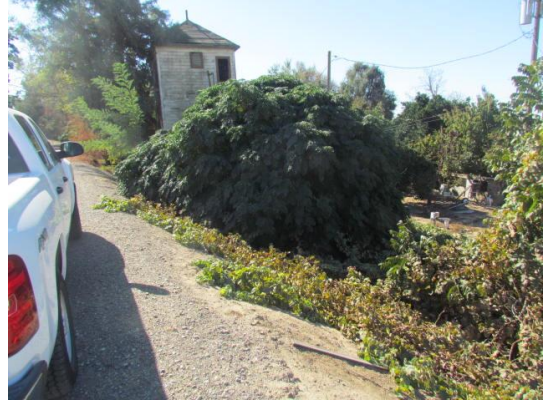
Looking south at dense vegetation on landward slope and toe.