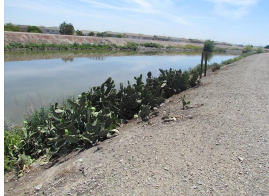
Looking southeast at cactus on waterside slope. Fall 2013