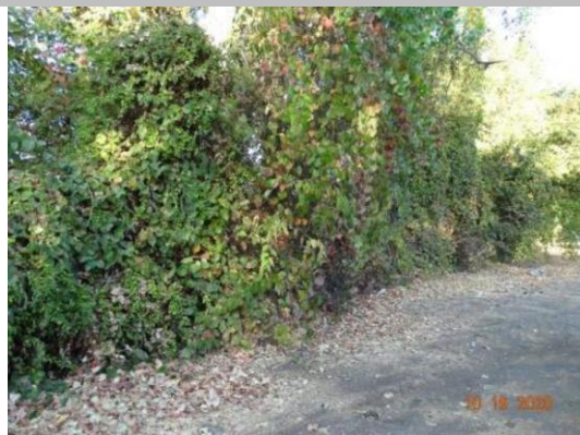
View of thick vegetation on the waterside shoulder and slope (Fall 2020).