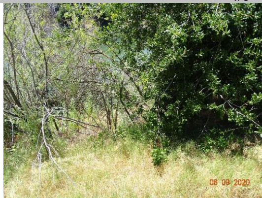
Water-Side: View of levee slope looking from crown. No pipe found on waterside