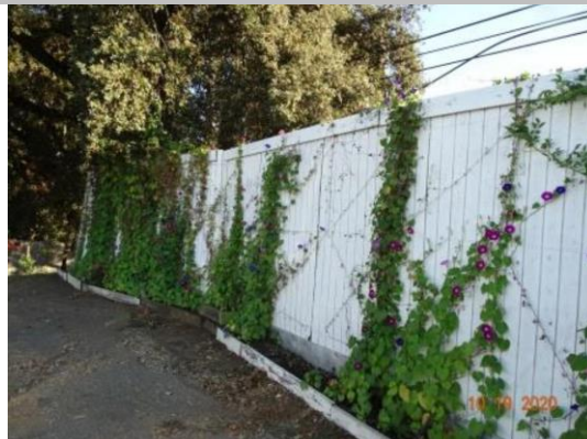
View of white fence on the landside shoulder (Fall 2020).