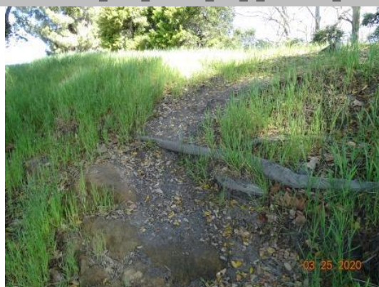
View of footpath down the waterside slope (Spring 2020).