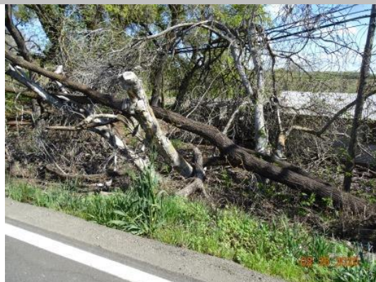
View of down tree on the landside slope (Spring 2020).

* Location LS : Land Side N/A : Not Applicable WS : Water Side CR : Crown