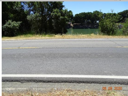
Top of Levee: View of levee crown looking towards waterside