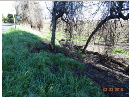
Remove fallen tree and branches from landside toe.

* Location LS : Land Side N/A : Not Applicable WS : Water Side CR : Crown