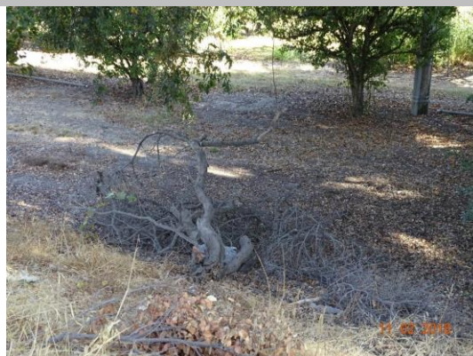
View of tree limb on the landside slope (November 2018).

LS : Land Side N/A : Not Applicable WS : Water Side CR : Crown