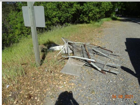
View of discarded metal furniture on the waterside hinge (Spring 2021).