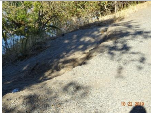
View looking slightly upstream erosion due to foot traffic on the waterside slope (Fall 2019).