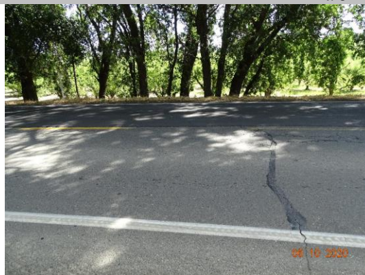
Top of Levee: View of levee crown looking towards landside