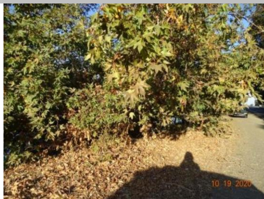
View of thick tree branches on the waterside slope (Fall 2020).

* Location LS : Land Side N/A : Not Applicable WS : Water Side CR : Crown