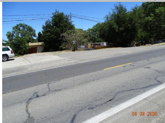
Top of Levee: View of levee crown looking towards landside