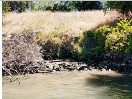
View from the channel at animal hole burrowed into the waterside toe (Summer 2020).