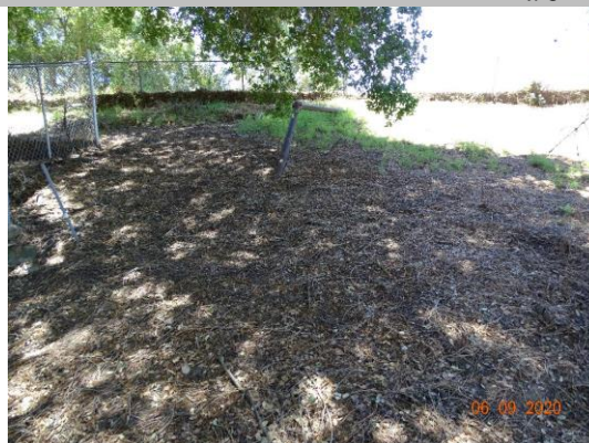
Land-Side: View of levee slope looking from toe