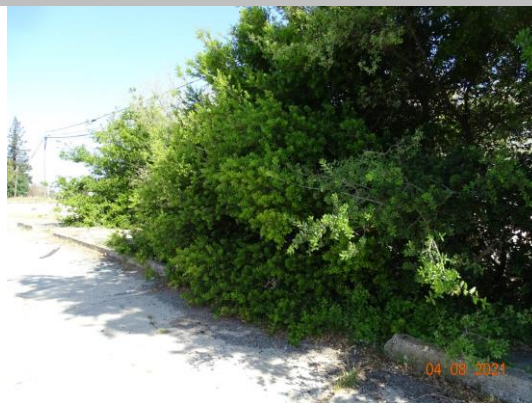
View of thick tree on the landside slope (Spring 2021).