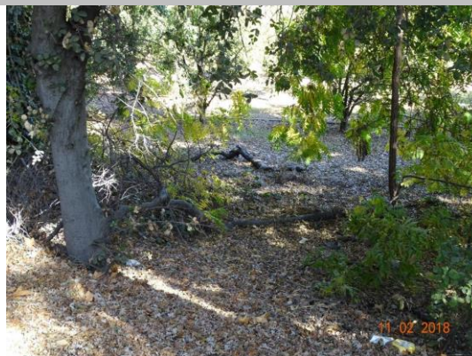
View of tree limb on the landside slope (November 2018).