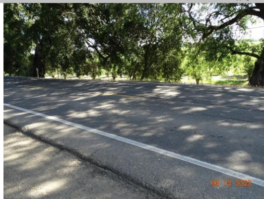
Top of Levee: View of levee crown looking towards landside