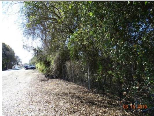
View looking downstream at chainlink fence on the waterside slope (Spring 2019).