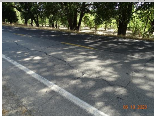
Enter photo 1 description or comment here.

LS : Land Side N/A : Not Applicable WS : Water Side CR : Crown