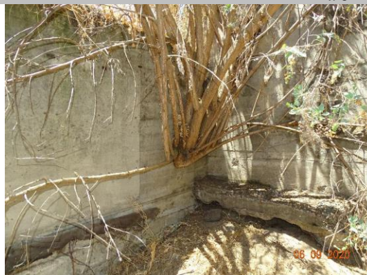
Land-Side: View of retaining wall on landside. Tree branches are plugging this hole completely