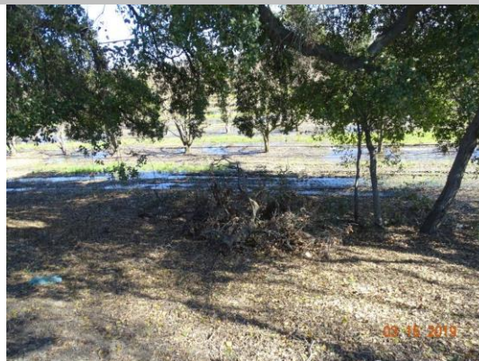
View of fallen limbs on the landside slope (Spring 2019).