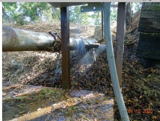
Water-Side: Pipe leak on levee slope above pump