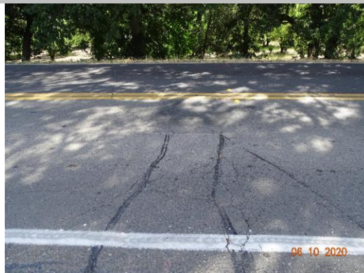
Top of Levee: View of levee crown looking towards landside

LS : Land Side N/A : Not Applicable WS : Water Side CR : Crown