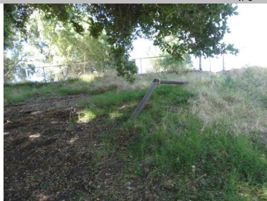
LS slope: view of pipe.