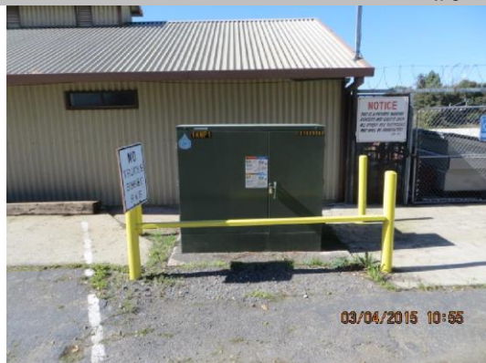
Waterside view. Unclear if there is a sewer cleanout or other evidence of pipe location on WS shoulder.