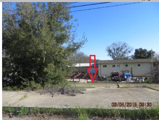
Pipe visible on retaining wall at LS toe.