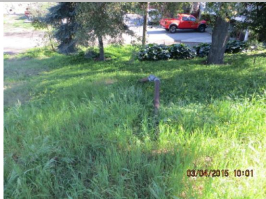
Pipe visible on LS slope.