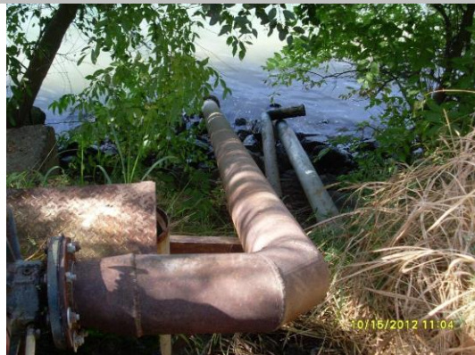
Waterside view: overview of active pipe and two abandoned pipes.