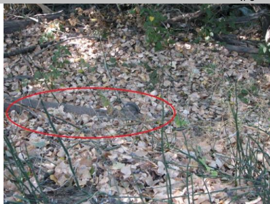
Pipe on WS slope running parallel to levee crown.