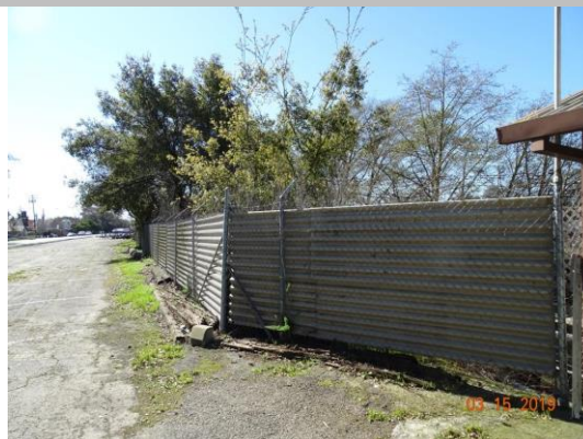
View of fence on the waterside shoulder (Spring 2019).