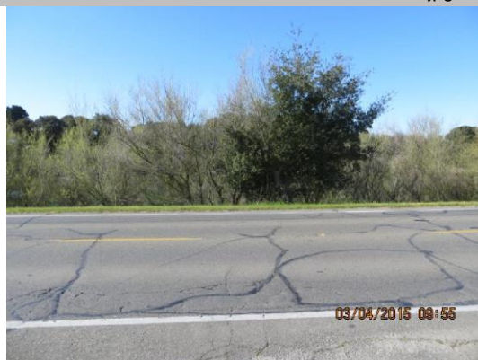
View of WS. No pipe found.