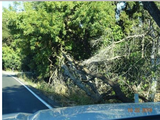
View looking upstream at landscaping trees on the landside slope (Fall 2019).