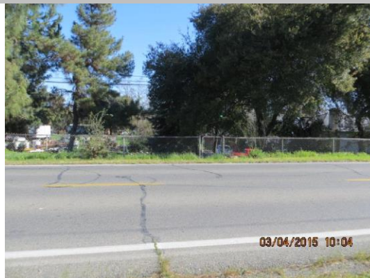
Pipe visible at gate on LS shoulder.