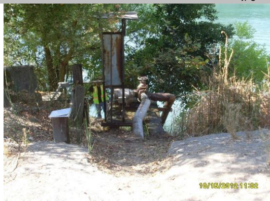
Waterside view: overview of pipe & pump and abandoned concrete structure (left). Shutoff Valve.