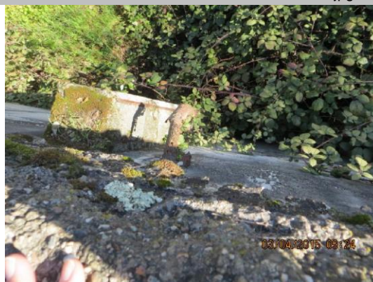
Pipe visible on retaining wall at LS toe.