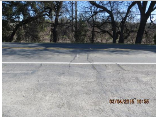
View at crossing through crown on LS shoulder from WS shoulder. Evidence of trench visible at cut in pavement.