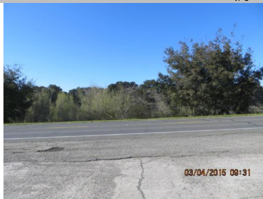
View of WS. Pipe not found on WS.