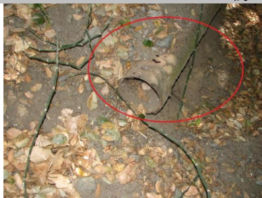
Pipe visible on WS slope running parallel to crown.