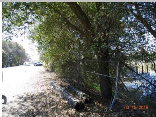
View looking downstream at the chainlink on the waterside shoulder and slope (Spring 2019).