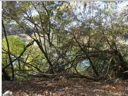
View of relatively thick tree branches on the waterside slope (November 2018).