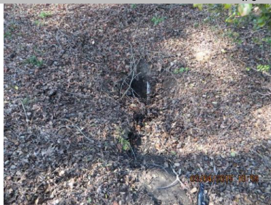
Septic line leaking at LS toe. Erosion of soil at toe visible.