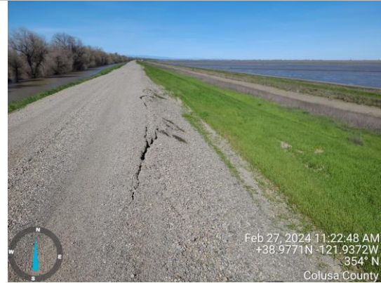
View of sloughing on the landside shoulder. Spring 2024.