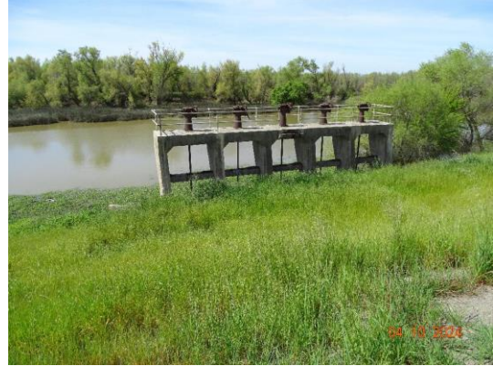
Water-Side: View of levee slope looking from crown. Slide gates at riverbank