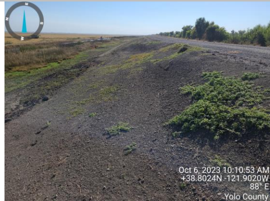
View of sloughing on the landside slope. Fall 2023.