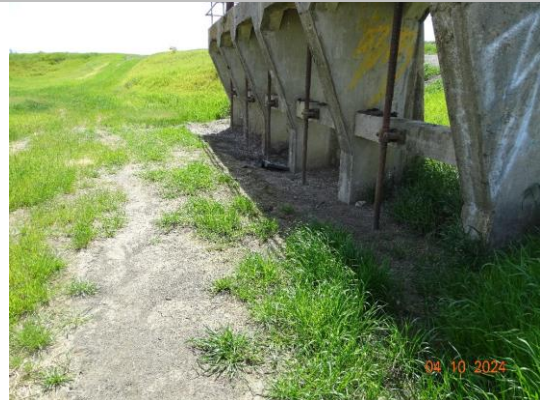
Land-Side: View of slide gates buried in soil at levee toe