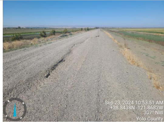
View of cracking on the crown and landside shoulder. Fall 2024.