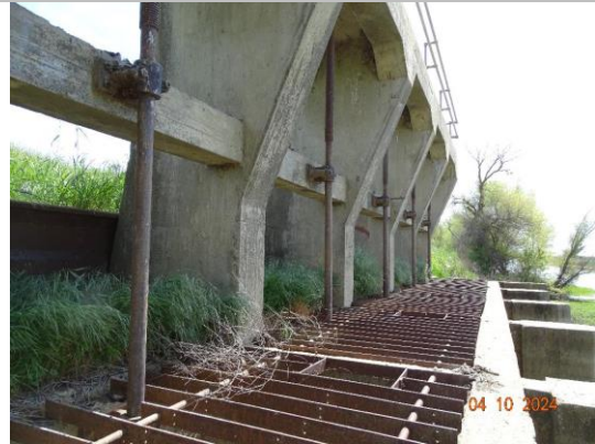
Water-Side: Slide gate structure at riverbank