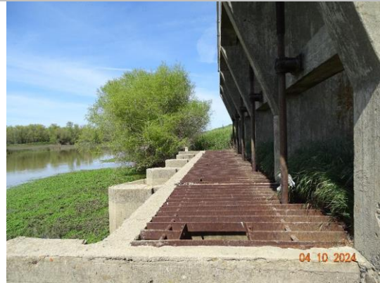
Water-Side: Slide gate structure at riverbank