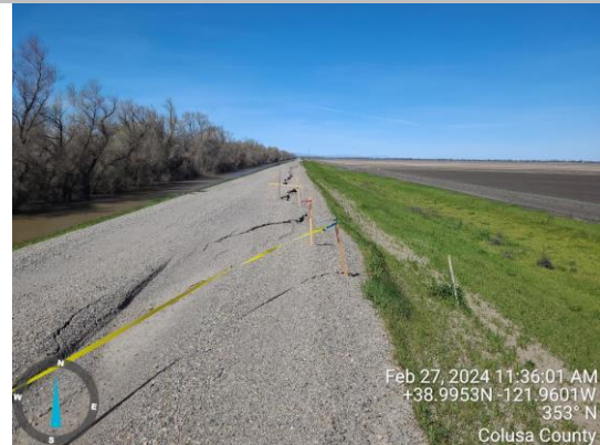
View of sloughing on the landside shoulder and crown. Spring 2024.