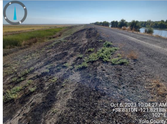
View of sloughing on the landside slope. Fall 2023.