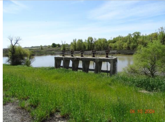
Water-Side: View of levee slope looking from crown. Slide gates at riverbank