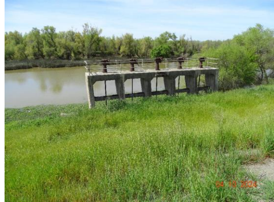
Water-Side: View of levee slope looking from crown. Slide gates at riverbank