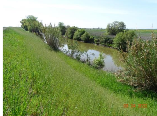
View of erosion at the waterside toe. Spring 2022.

Photo 1 of 1 : FA_2024_RD0108_203_13_20240909_00003.jpg