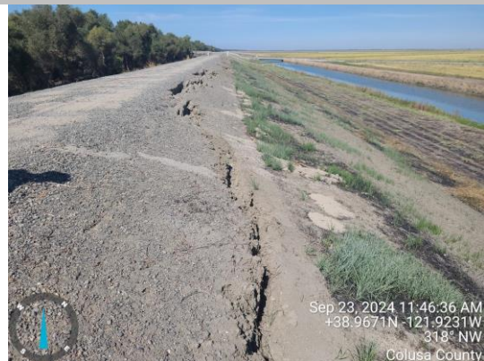
View of sloughing on the landside shoulder. Fall 2024.