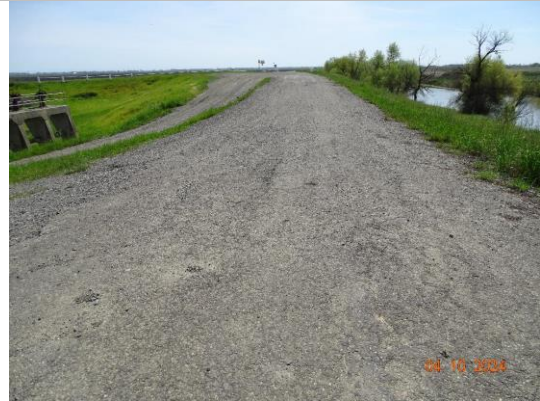
Top of Levee: View of levee crown looking downstream