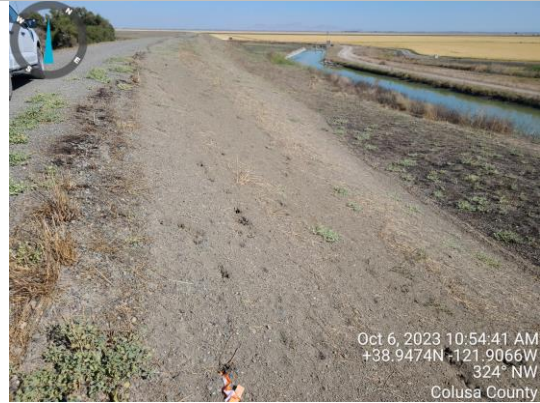
View of sloughing on the landside slope. Fall 2023.