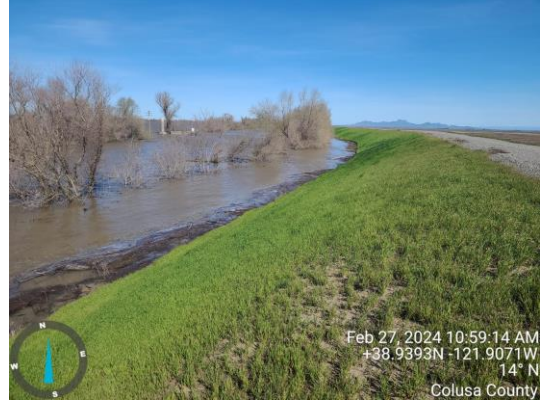
View of wavewash on the waterside toe. Spring 2024.