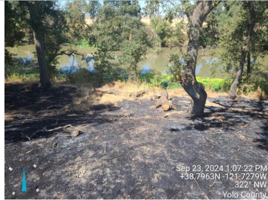
View of tree limbs on the waterside slope. Fall 2024.