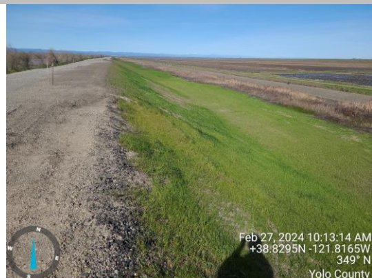
View of temporary sloughing repair on the landside slope. Spring 2024.