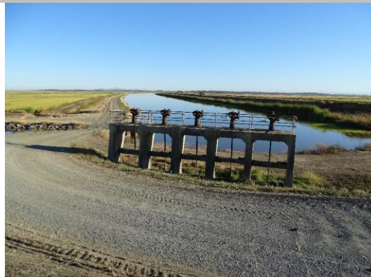
View of LS looking from levee crown