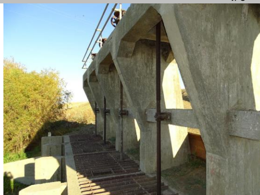
Slide gate operating structure on WS shoulder