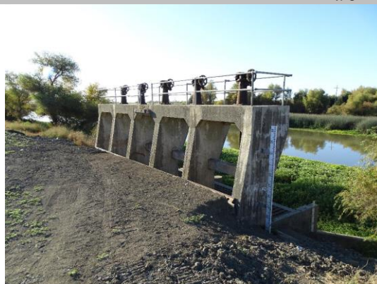
Concrete structure located on waterward side