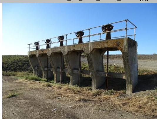
View of concrete structure located on landward side