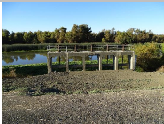
View of WS looking from levee crown