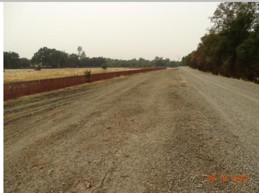
View of maintained landside slope. Fall 2020.