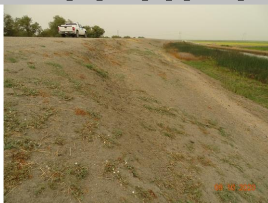
View of sloughing on landside slope. Fall 2020.