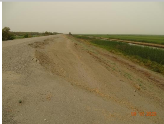
View of sloughing on the landside slope. Fall 2020.

LS : Land Side N/A : Not Applicable WS : Water Side CR : Crown