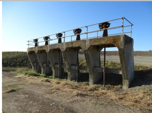
View of concrete structure located on landward side