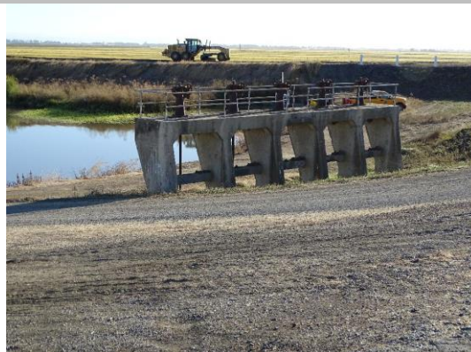
Concrete structure located onlandward side