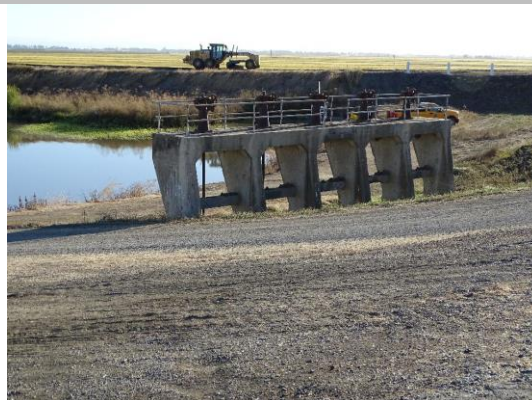
Concrete structure located on waterward side