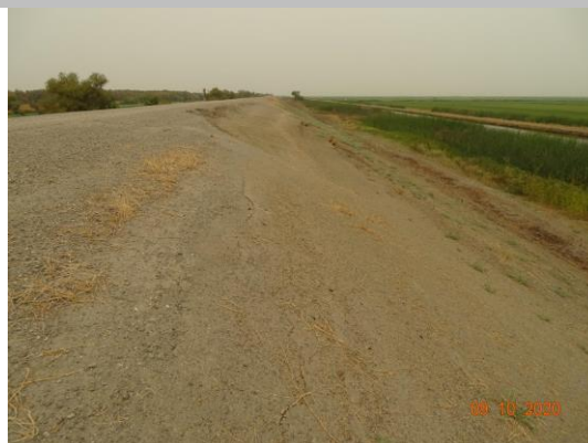
View of new cracks adjacent to sloughing. Fall 2020.