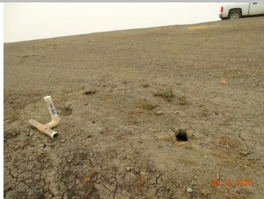
View of rodent holes on the landside slope. Fall 2020.