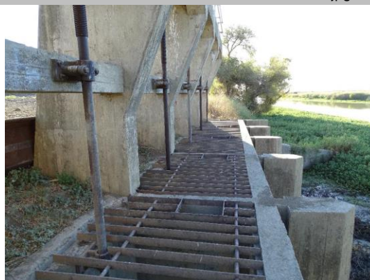
Slide gates on waterward side