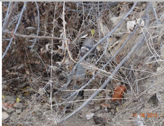
Buried flap gate on waterward side.