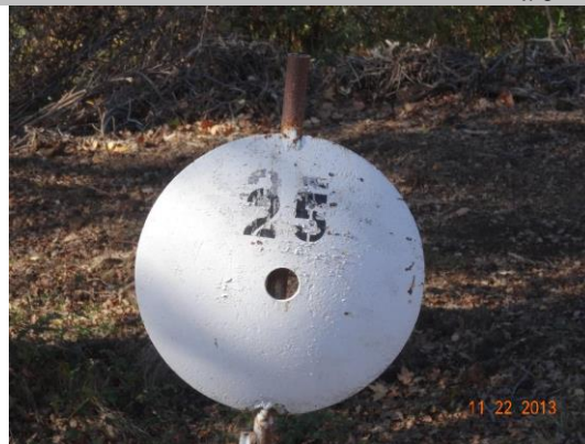
Marker visible on waterward side, crossing is referenced as No. 25.