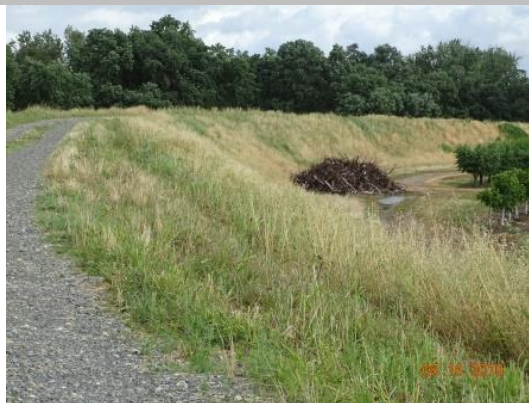
View looking upstream landside at prunings on levee toe, Spring 2019.