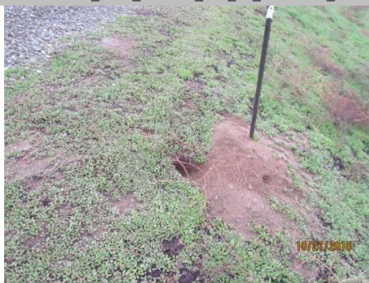
View of squirrel hole on the waterside looking downstream.