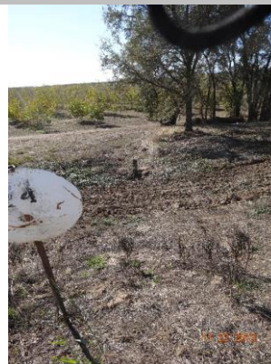
View of waterward side.