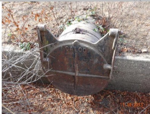
Flap gate appears to be in good condition.