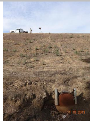
View of slope located on waterward side.