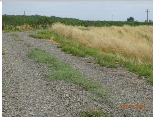
View looking upstream landside at the annual vegetation that needs maintenance, Spring 2019.