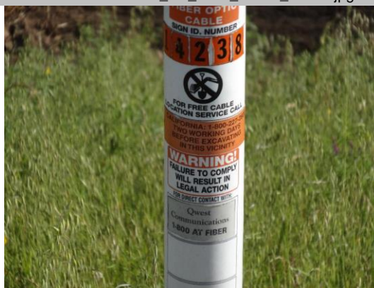
Contact information for communication line.