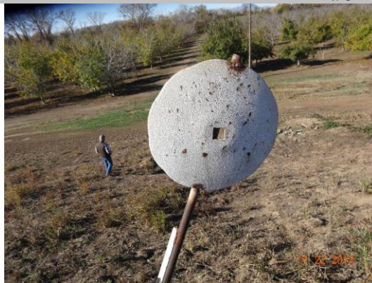
Marker visible on waterward side.