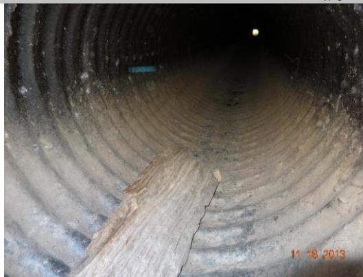
Internal view of pipe wall using camera with flash.