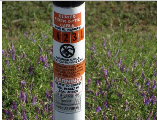
Contact information for fiber optic cable and ID number.