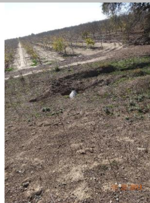
Overview of waterward side.