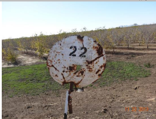
Marker visible on waterward shoulder, crossing referenced as No. 22.