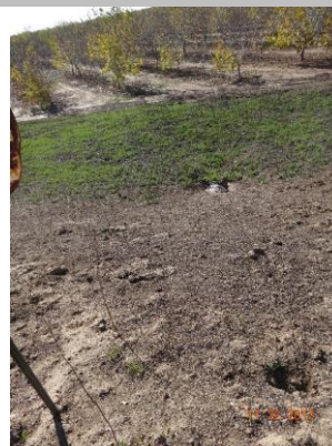
View of waterward side.