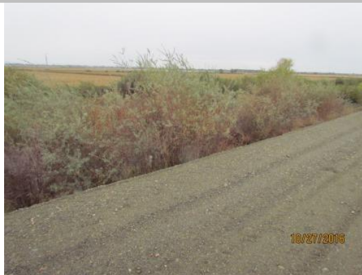
View of small starter willow trees on the landside looking upstream.