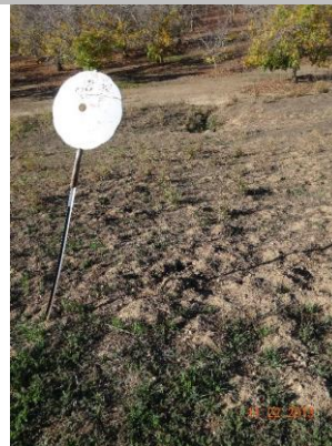
View of waterward side--burrow activity present on slope.