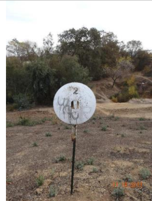
View of WS--Marker indicates crossing is labelled as 2.