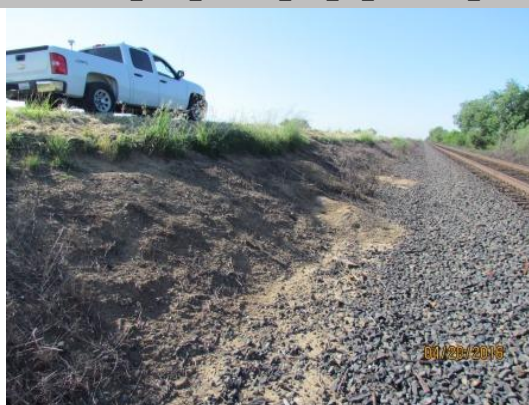
View of multiple ground squirrel holes on landside slope looking downstream. There is no evidences of active squirrels.