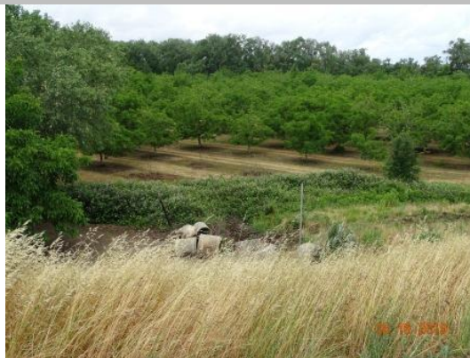
View looking at the waterside levee toe where debris has been stacked, Spring 2019.