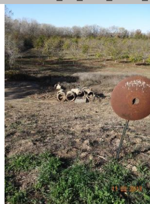
Overview of waterward slope--barrier placed at toe to discourage damage to crossing.