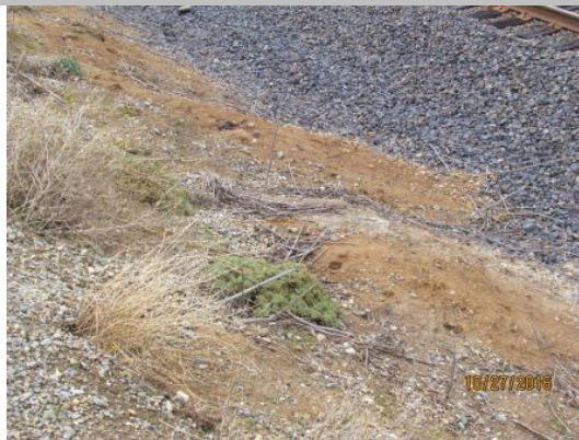
View of squirrel holes on the landside slope and toe, no rodent activity was observed.