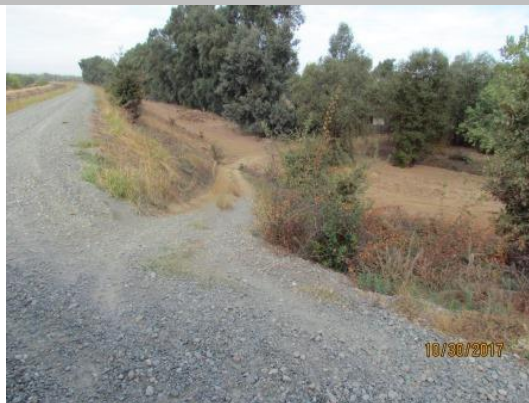
View of the slope stability caused by foot traffic on the landward side of the levee looking downstream.