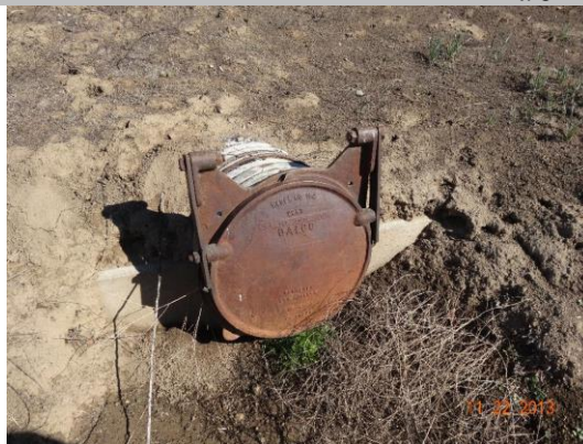
View of flap gate located on waterward toe.