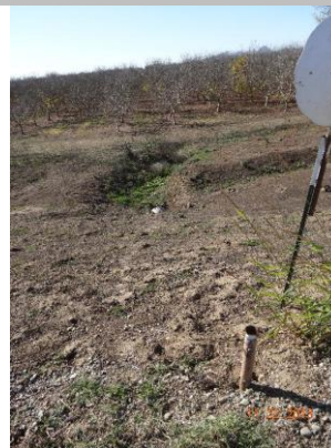
View of waterward side.