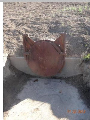
View of flap gate on waterward side.