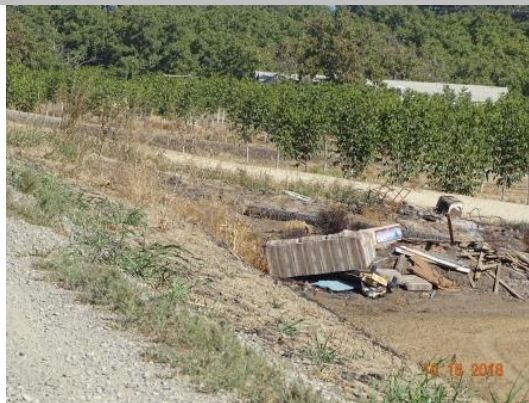
View looking at the landside levee toe where debris has been dumped.