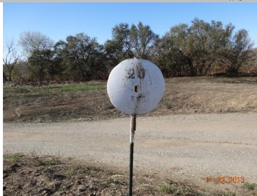
Marker visible on waterward side shoulder, crossing is referenced as No. 20.