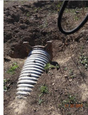
Pipe through waterward side.