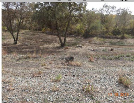
View of waterward side-slopes cleared.