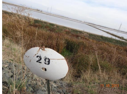
Marker for pipe crossing visible on WS shoulder.