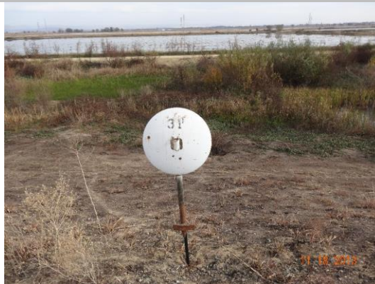
View of waterward side--marker for pipe visible on waterward shoulder.