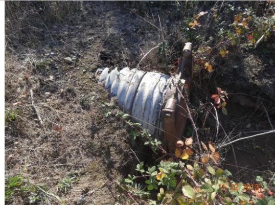
View of flap gate located on waterward side.