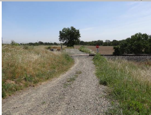
View of levee crown looking downstream.