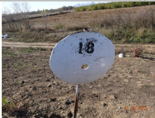
Marker visible on waterward shoulder, crossing is referenced as No. 18.