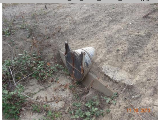
View of pipe, flap gate, and headwall located on waterward toe.