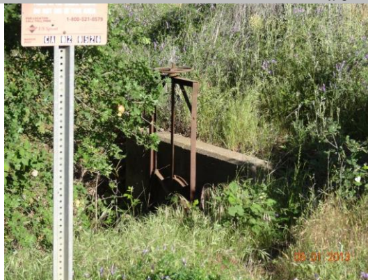
View of slide gate and concrete headwall located on landward side.