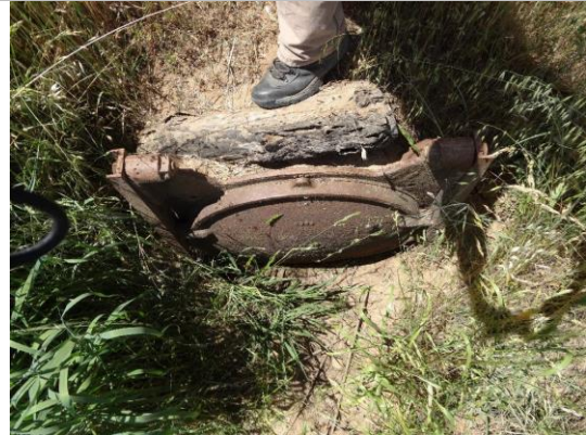
Pipe and flap gate confirmed on waterward side.