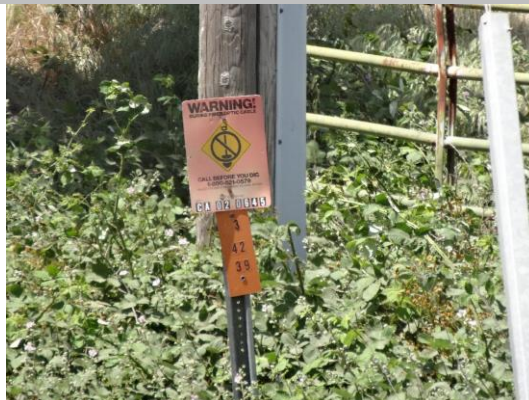
Buried fiber optic cable marker located on LS.