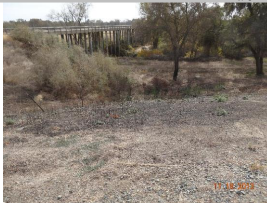
View of waterward side.