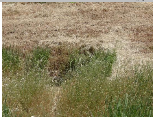
View of waterward toe where pipe daylights.