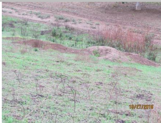
View of rodent hole that has more than 2 cubic feet of material on the waterside.