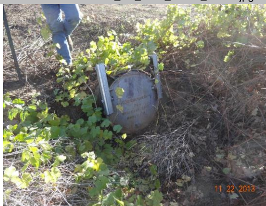
View of flap gate located on waterward side.