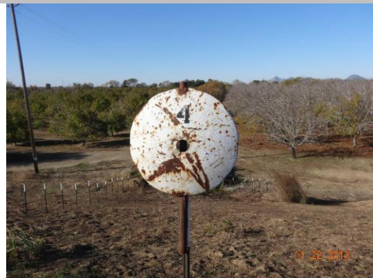
Marker visible on waterward side--No. 4.