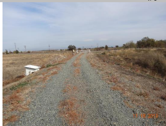
View of levee crown looking downstream.