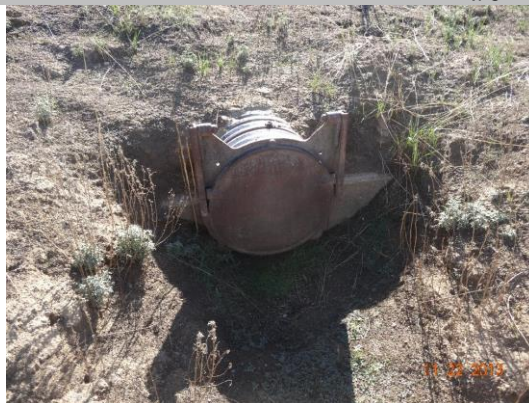
View of flap gate visible on waterward side.