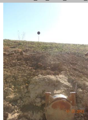
View of waterward slope.