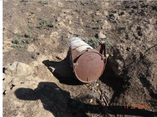
View of flap gate located on waterward side.