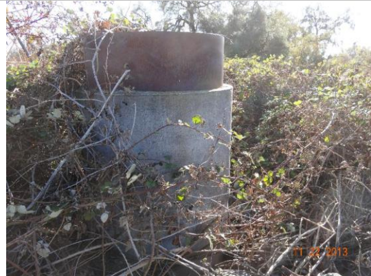
View of standpipe located on waterward side.