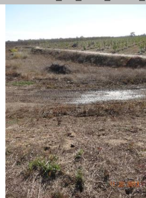
View of landward side.