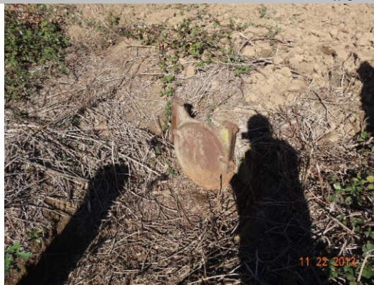
View of flap gate located on waterward side.