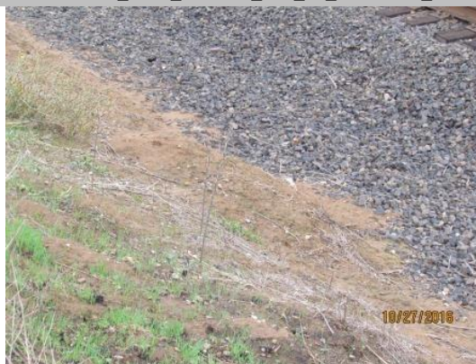
View of squirrel holes on the landside slope and toe, no rodent activity was observed.