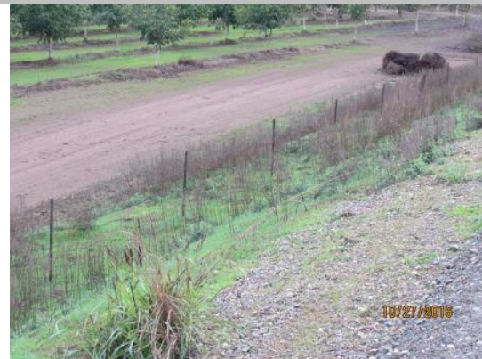
View of fence at landside levee toe looking downstream.