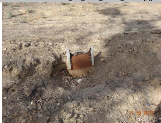
View of flap gate located on waterward side.