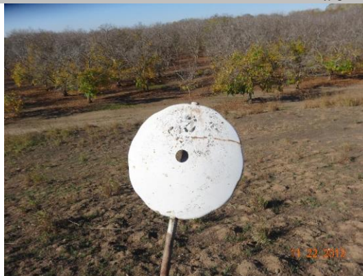
Marker visible on waterward side.