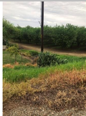
View looking downstream landside of a landscape bush at the levee toe.

* Location LS : Land Side N/A : Not Applicable WS : Water Side CR : Crown