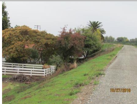
View of homeowners landscaping and fence that encroaches on the landside levee slope, looking downstream.