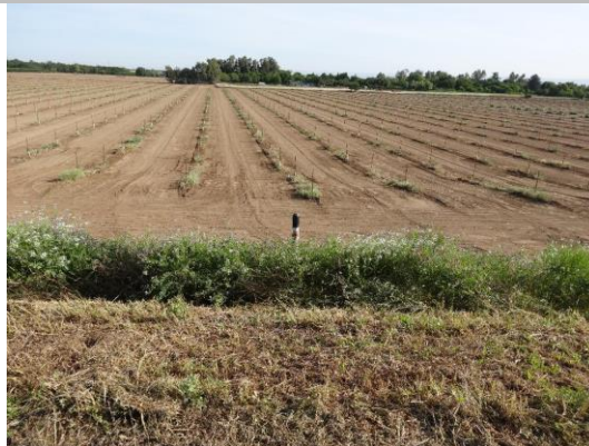
Marker visible on landward side.

* Location LS : Land Side N/A : Not Applicable WS : Water Side CR : Crown