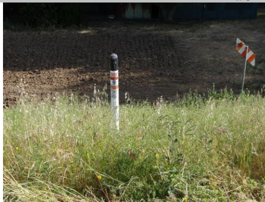
View of landward side--communication line marker.