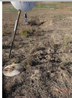
View of waterward slope--burrow activity present.