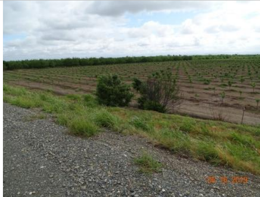
View looking upstream landside of trees at levee toe that need to be removed, Spring 2019.