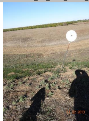
View of waterward side.