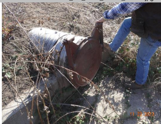
Flap gate visible on waterward side.