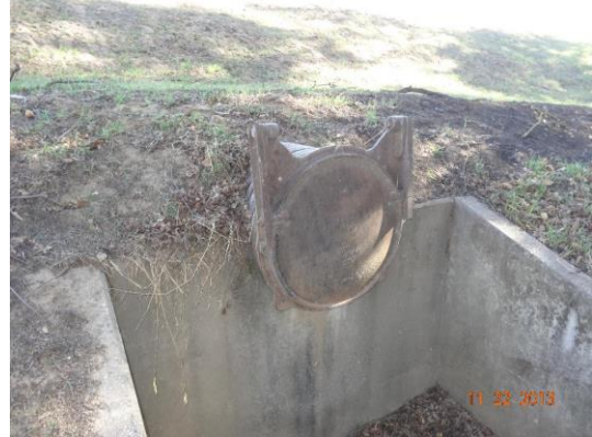
View of flapgate on concrete head wall on waterward side.