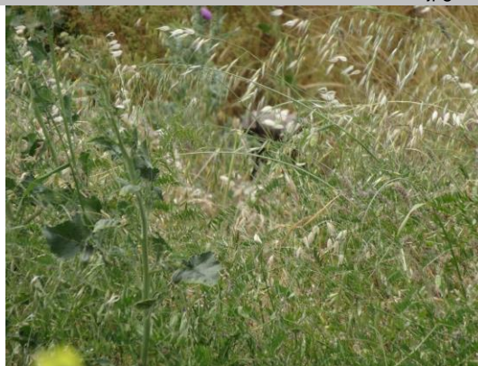
Dense vegetation on landward side.