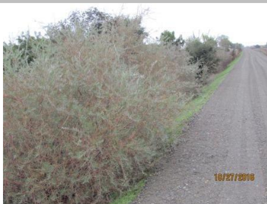
View of willow trees on the landside slope looking upstream.

* Location LS : Land Side N/A : Not Applicable WS : Water Side CR : Crown