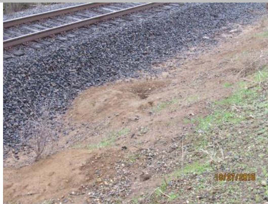
View of squirrel holes on landside toe, no sign of activity.