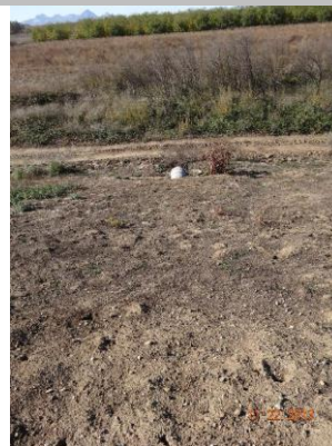
View of waterward side.