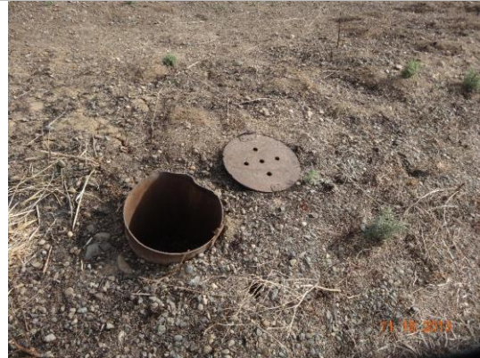
View of riser with damage lid located on WS shoulder.