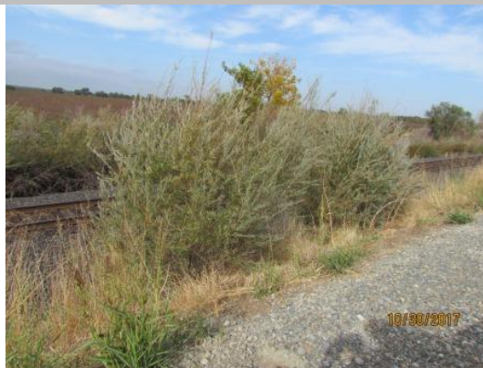
View of small willow trees on the landside slope looking upstream.