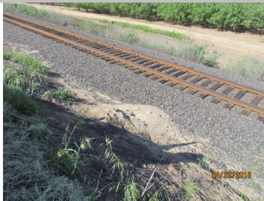
View of large burrow on landside.