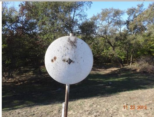
View of marker located on waterward shoulder, no reference number is visible.