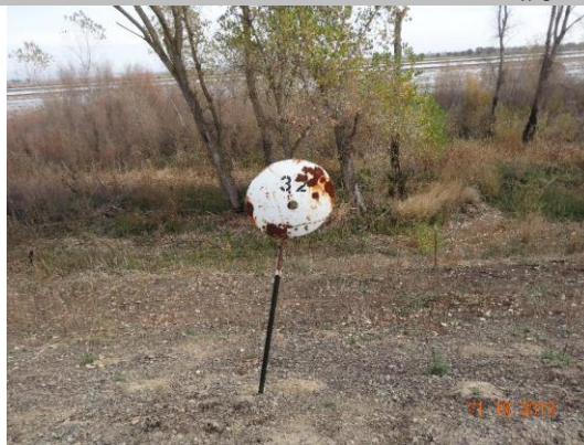
View of marker visible on waterward shoulder.