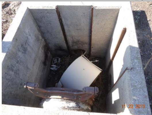
View of concrete distribution box located on waterward side.