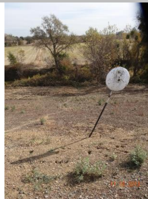
View of waterward side--slope and marker for pipe crossing.