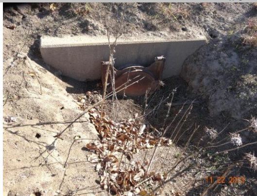
Flap gate located on waterward side--debris blocking gate.