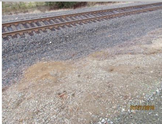
View of squirrel holes on the landside, no rodent activity was observed.