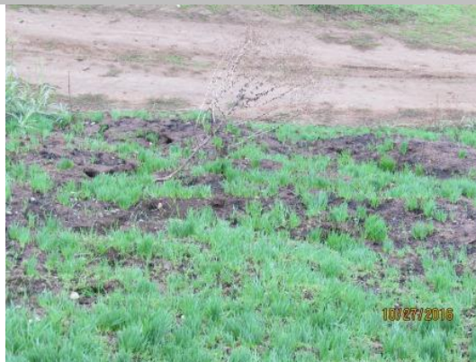
View of rodent holes on waterside slope, no evidence of rodent activity.