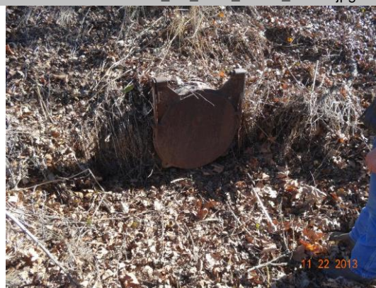
View of flap gate located on waterward side.