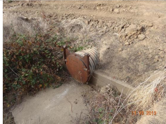
View of headwall, pipe, and flap gate located on WS.