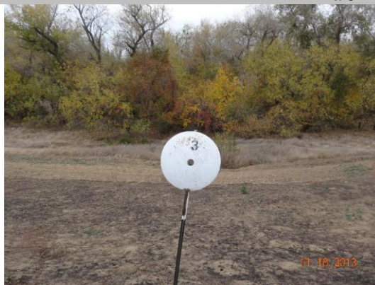
View of waterward side.