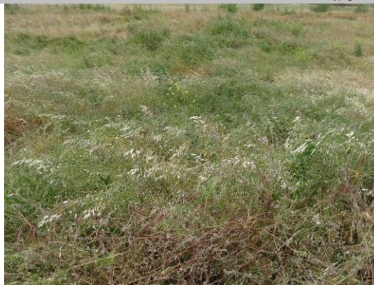
View of waterward slope.