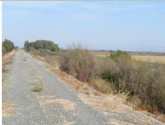
View looking upstream waterside at Willow Trees that need to be removed.