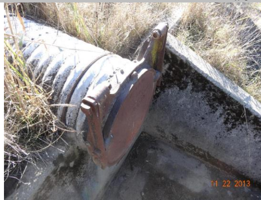
View of flap gate located on waterward side.