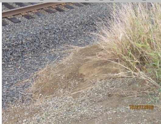
View of squirrel holes on the landside, no rodent activity was observed.