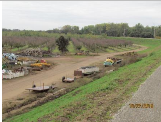
View of the equipment at the toe of the levee on the landward side of the levee looking downstream.