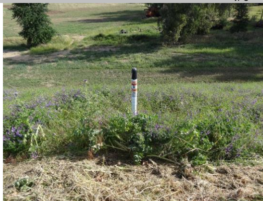
View of marker located on landward side.