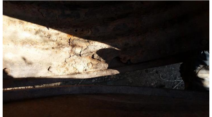
Deteriorated pipe wall at the outlet (WS).