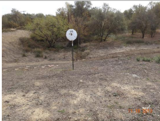
View of WS--marker present on WS shoulder.