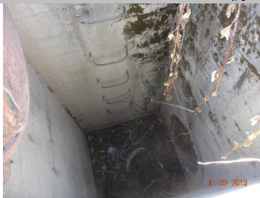
Inside view of concrete distribution box.