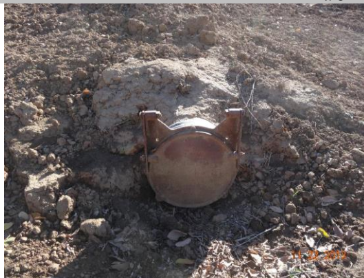
View of flap gate located on waterward side.