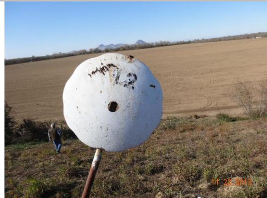
View of marker located on waterward shoulder--crossing referenced as No. 12.