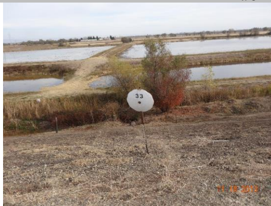
View of waterward side--marker indicating crossing visible on waterward shoulder.