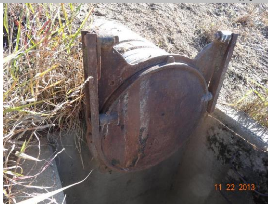
View of flap gate located on waterward side.