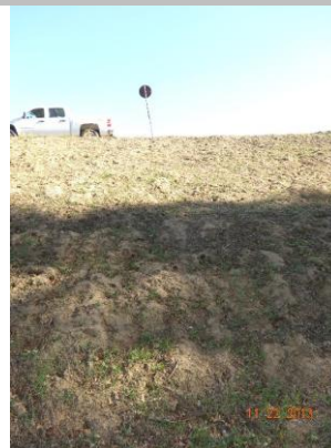
View of waterward slope.