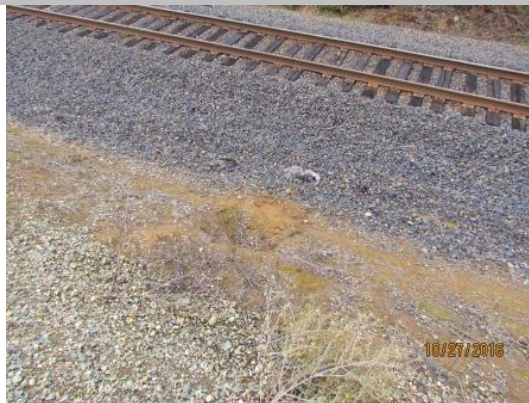
View of squirrel holes on the landside, no rodent activity was observed.