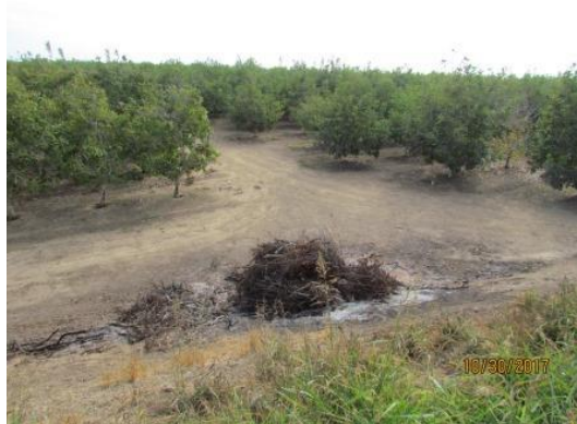
View of prunings at landside levee toe.