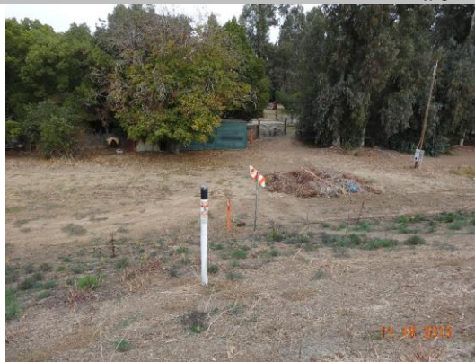
View of landward side--gas marker and conduit line marker.