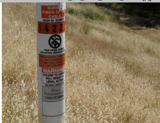
Contact information and ID number for buried fiber optic cable.