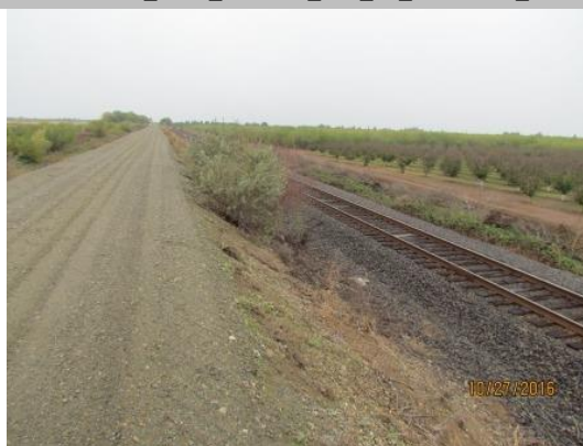
View of a small willow tree that should be removed on the landside looking down stream.