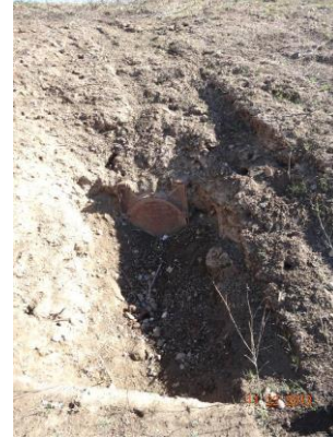
View of flap gate and concrete distribution box on WS.