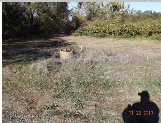
View of waterward side.