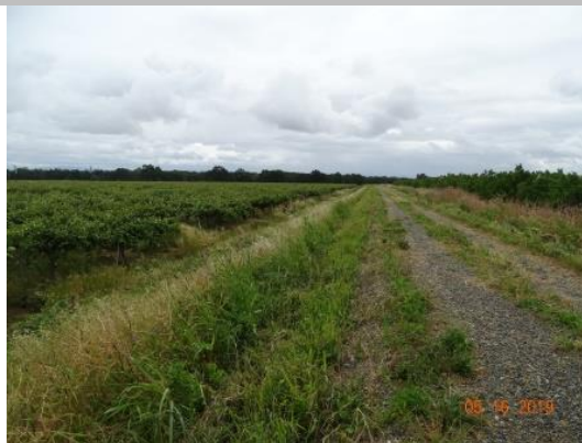
View looking downstream at the landside of the annual vegetation that needs maintenance, Spring 2019.