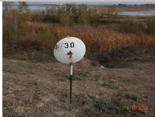
View of waterwar side--marker indicating crossing located on waterward shoulder.