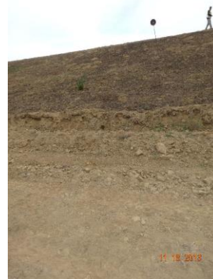
View of waterward slope.