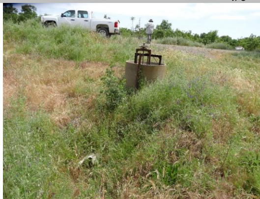
View of concrete standpipe and plastic pipe extension visible on waterward side.