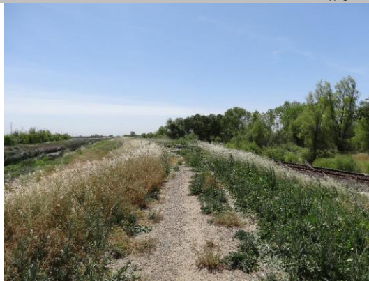
View of levee crown.