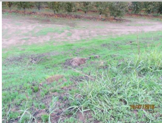
View of rodent hole on landside slope.