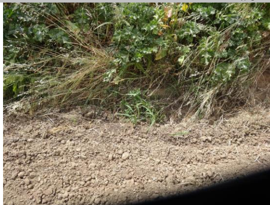
View of concrete headwall visible through dense vegetation.