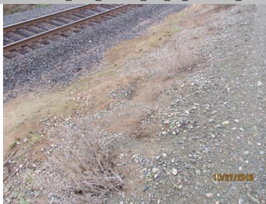
View of squirrel holes on the landside slope and toe, no rodent activity was observed.