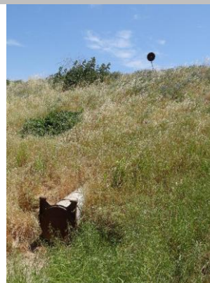
View of waterward side--dense vegetation on slope.