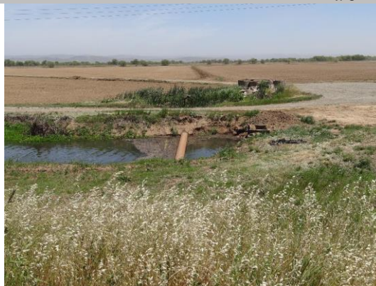
View of waterward side--pipe goes through Simmerly Slough.