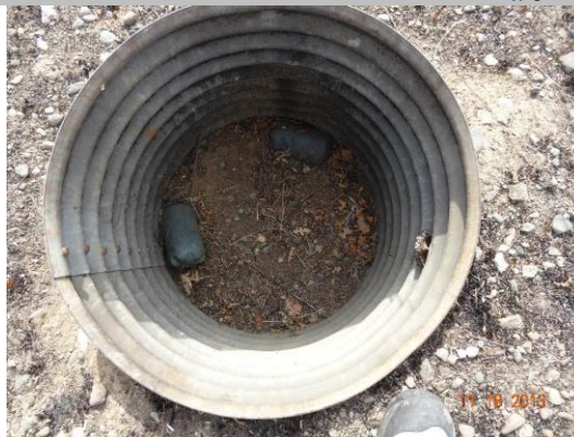
Siphon breaker has been buried inside CMP riser.