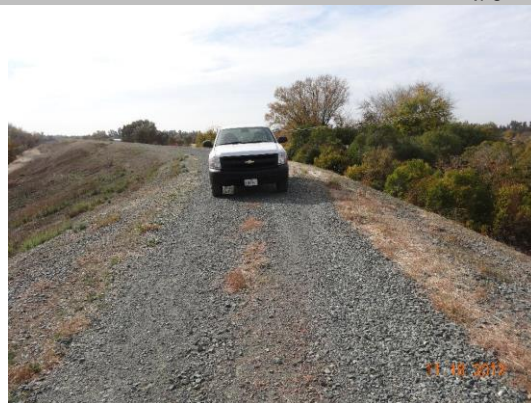
View of levee crown looking upstream.