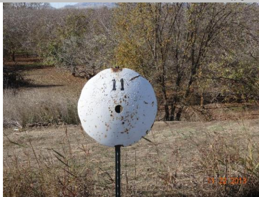
Marker visible on waterward shoulder, Reference ID No. 11 for crossing.