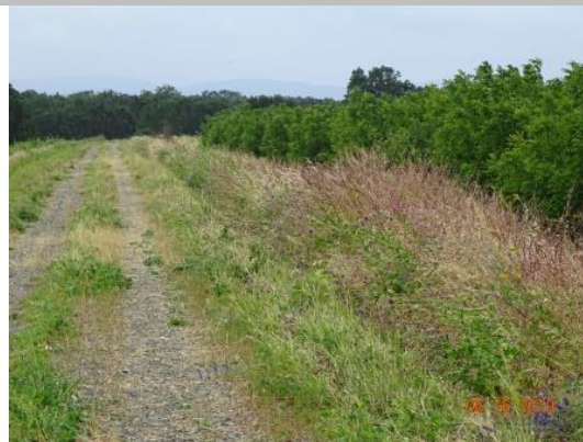
View looking downstream at the waterside of the annual vegetation that needs maintenance, Spring 2019.