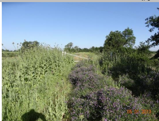
View of levee crown--dense vegetation.