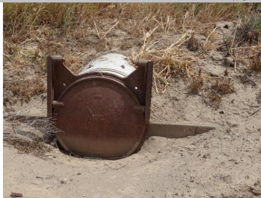
Flap gate and concrete headwall visible on waterward side.