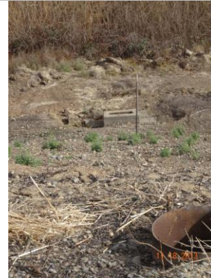
View of WS--concrete box located located at WS toe.