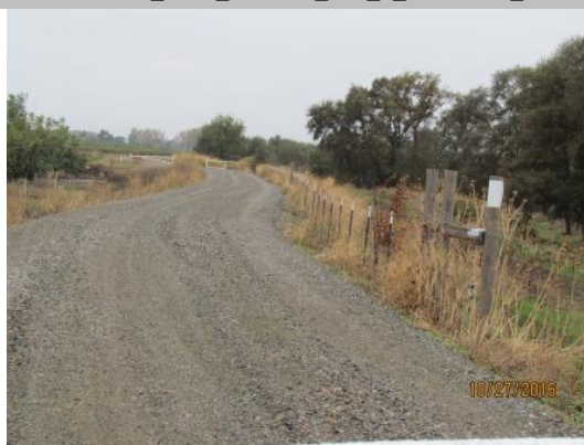
View of an unpermitted fence on waterside levee hinge point.