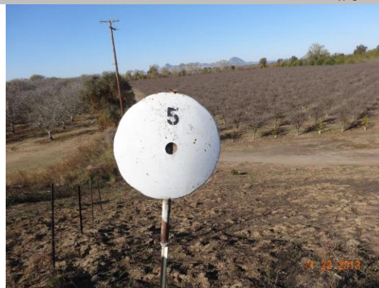
Marker visible on waterward side--No. 5.