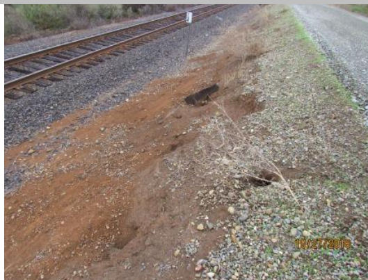
View of squirrel holes on the landside slope and toe, no rodent activity was observed.

* Location LS : Land Side N/A : Not Applicable WS : Water Side CR : Crown