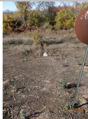
View of waterward slope.