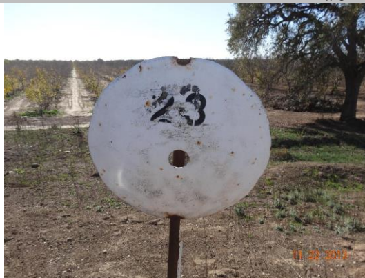
Marker visible on waterward shoulder, crossing is referenced as No. 23.