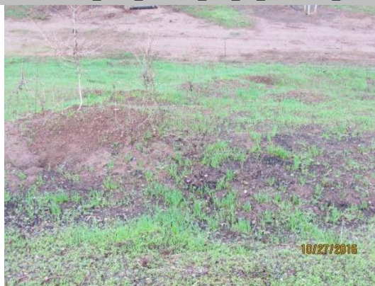
View of rodent holes on waterside levee slope.