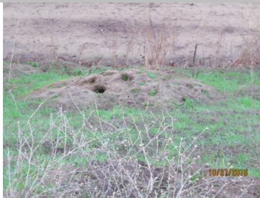
View of waterside slope, no squirrel activity seen, but rodent holes need to be back filled properly.