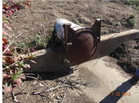
View of flap gate visible on waterward side.