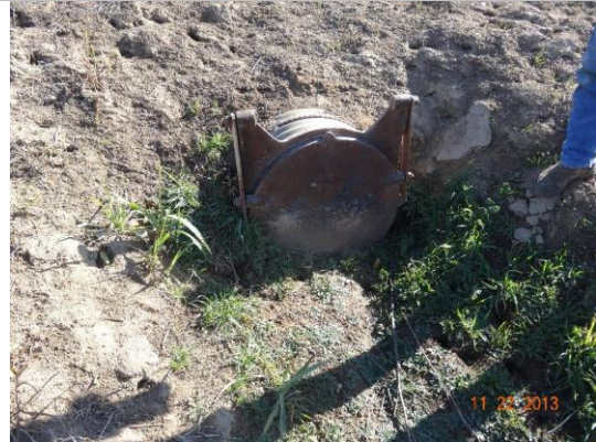
View of gate on waterward side.