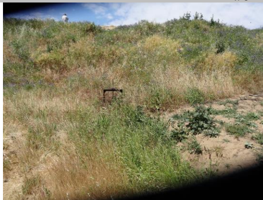
View of landward side--dense vegetation.