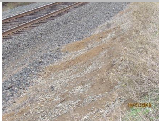
View of squirrel holes on the landside slope and toe, no rodent activity was observed.