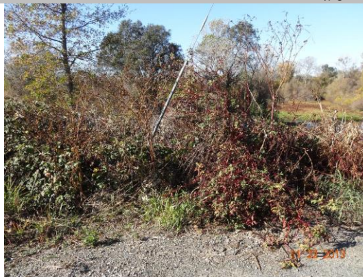
View of waterward shoulder behind vegetation is standpipe.