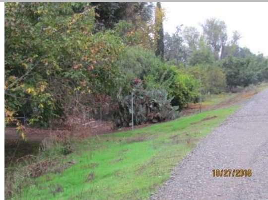
View of the cactus on the landward side of the levee looking downstream.