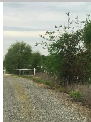
View looking downstream waterside of a tree that needs to be trimmed for access and visibility.