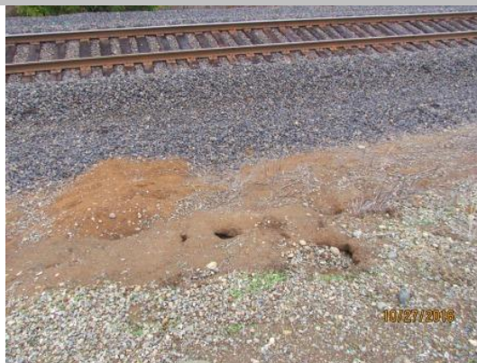
View of squirrel holes on the landside slope and toe, no rodent activity was observed.

* Location LS : Land Side N/A : Not Applicable WS : Water Side CR : Crown