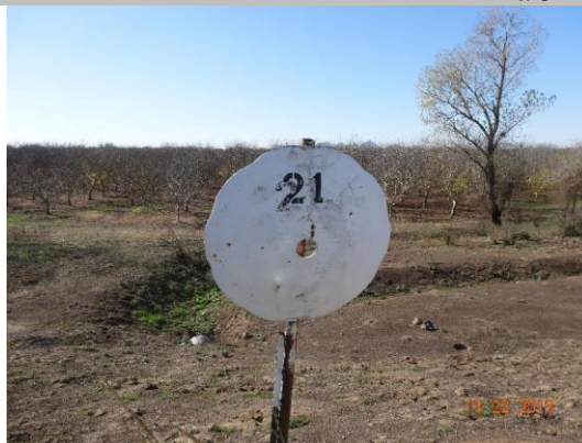
Marker visible on waterward shoulder, crossing referenced as No. 21.