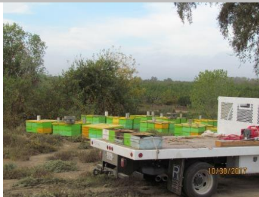
View of the beehives still on the crown of the levee.