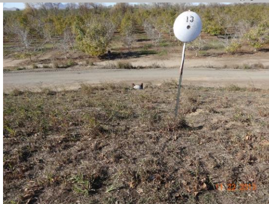
View of marker located on waterward shoulder, pipe is reference as No. 13.