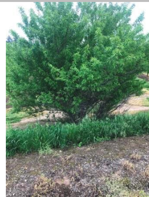
View of small peach tree on the landside toe looking downstream that should be removed.