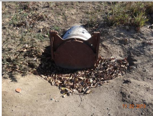
View of flap gate located on waterward side.