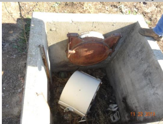
View of flap gate located inside concrete distribution box. Debris scattered inside box.