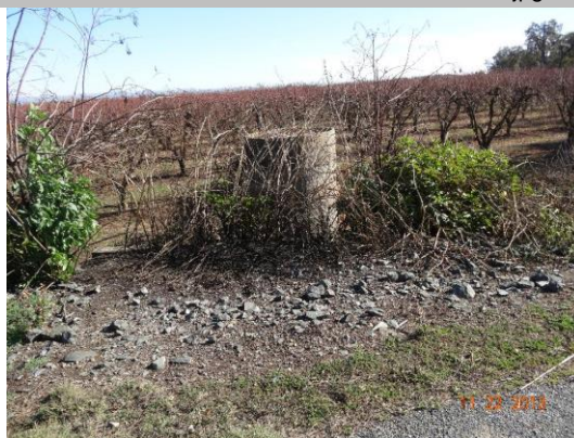
View of standpipe located on landward side.