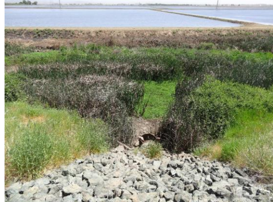
View of WS during April.