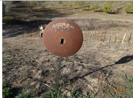
Marker visible on waterward side.