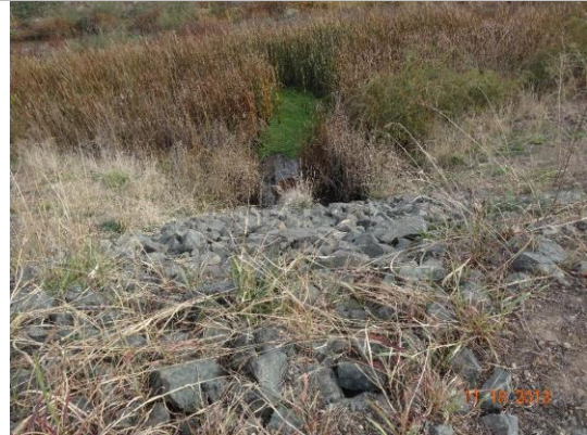
View of WS slope covered with rip rap along pipe alignment.