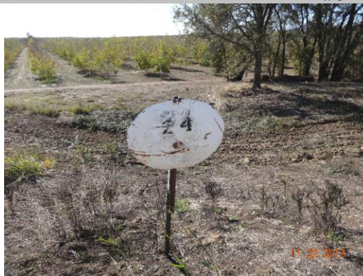
Marker visible on waterward shoulder, this crossing is reference as No. 24.