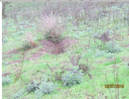
View of rodent hole on waterside.