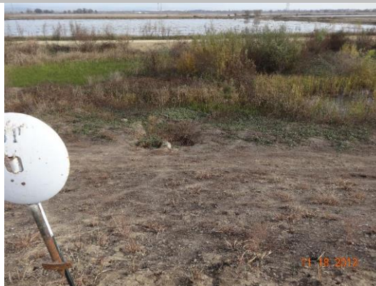
View of pipe on waterward toe.