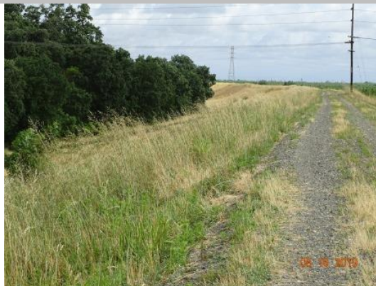
View looking upstream waterside at the annual vegetation that needs maintenance, Spring 2019.