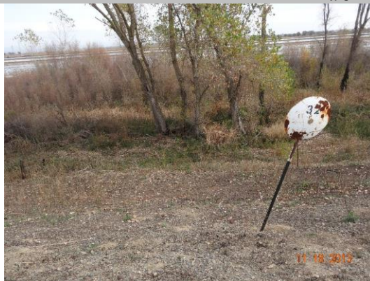
View of waterward slope.