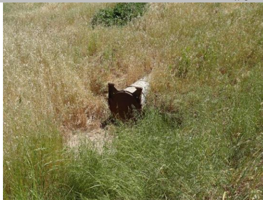
View of flap gate on waterward side.