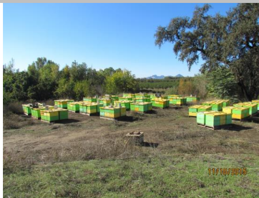
View of the beehives on the crown of the levee.