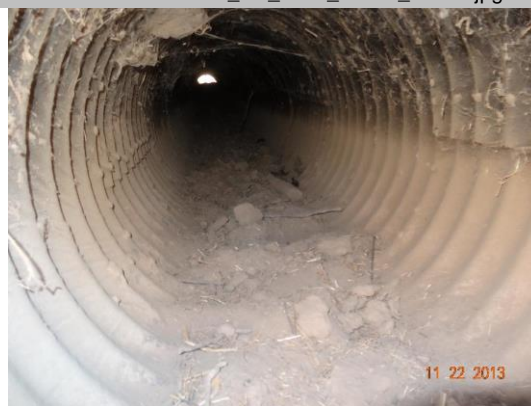
Internal view of pipe wall from waterward side.