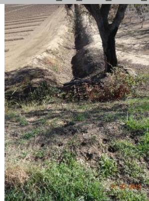
View of landward side--barrier used to discourage damage to crossing near toe.