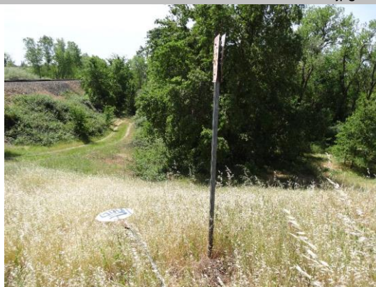
Pipe marker visible on ground--sign has been bent.