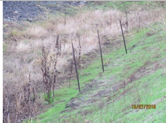
View of fence post that run along the landside levee toe, looking upstream.