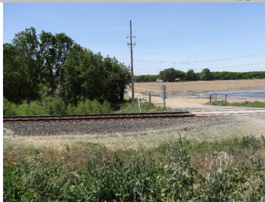
LS view overview.