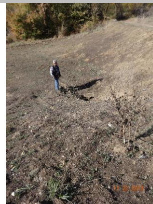
View of WS slope.