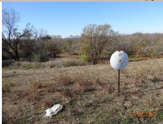
View of waterward side.