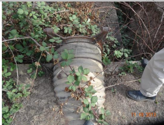
View of pipe, headwall, and concrete apron on waterward toe.