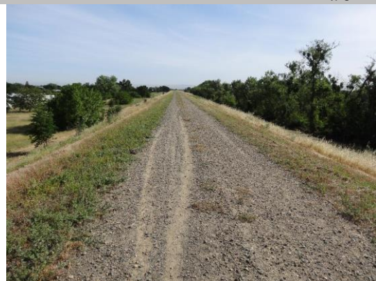
View of levee crown looking downstream.