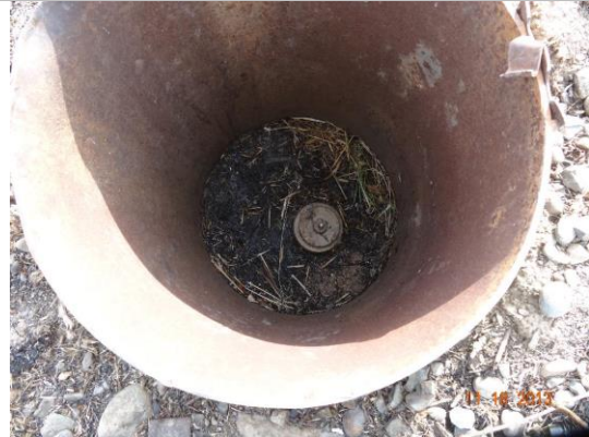
View of siphon breaker located inside steel riser.