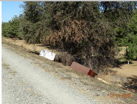
View looking at the landside levee slope where debris has been dumped.

* Location LS : Land Side N/A : Not Applicable WS : Water Side CR : Crown