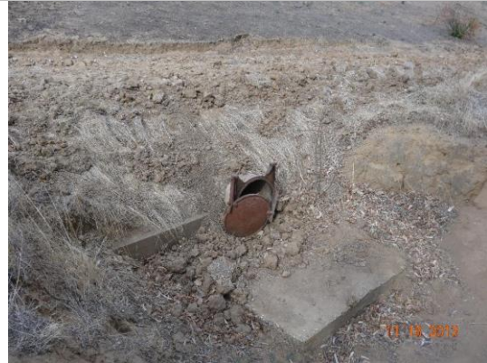
Damage flap gate located on WS.