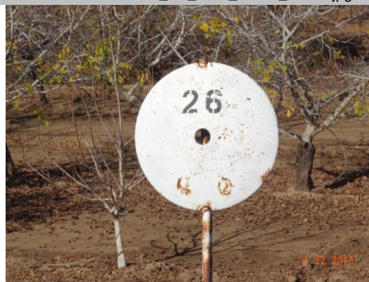
Marker visible on waterward side--No. 26.