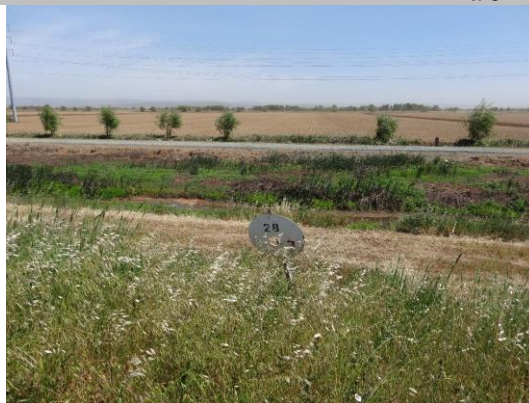
Marker visible on waterward shoulder.