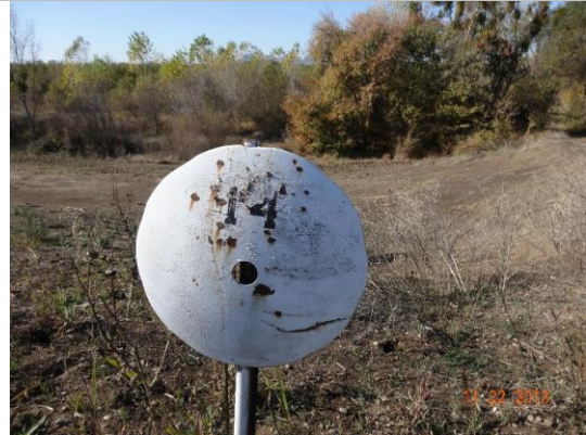
Marker visible on WS shoulder, crossing referenced as No. 14.