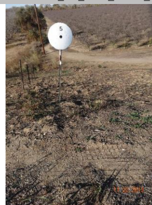
Overview of waterward slope--dense burrow activity on slope.