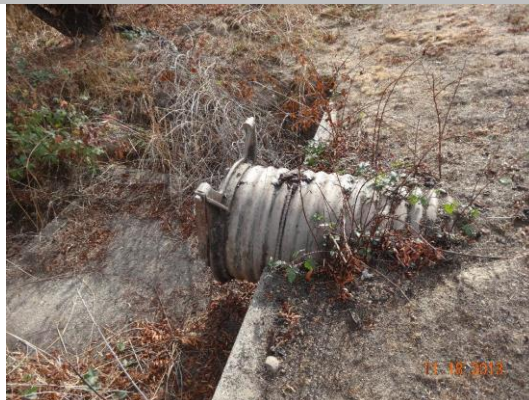
View of pipe, headwall, and flap gate located on waterward side.