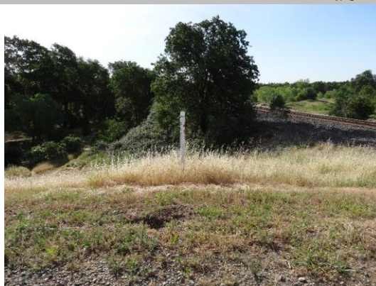
View of marker located on waterward side.