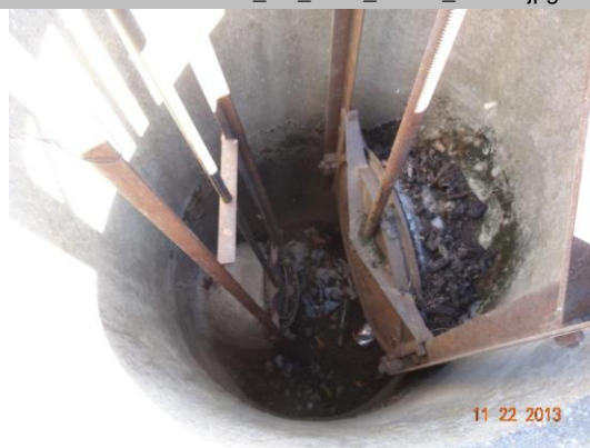
Inside view of concrete standpipe with 2 screw gates inside.