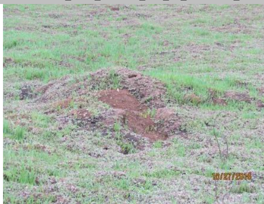
View of rodent hole that has more than 2 cubic feet of material on the waterside.