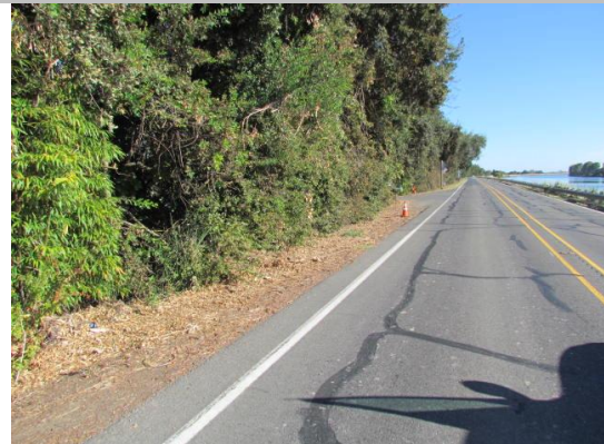
Looking northwest at dense trees on landward shoulder and slope.