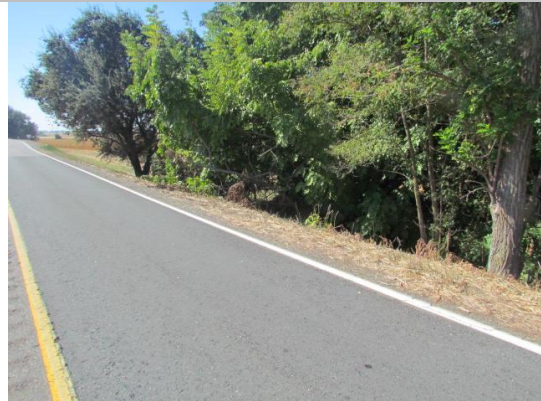
Looking southwest at untrimmed trees on landward toe.