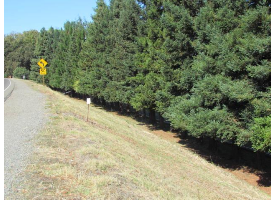
Looking southwest at dense redwood trees on landward toe and berm.