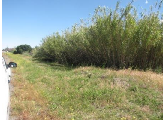
Looking northeast at bamboo on waterside slope. (Fall 2014)