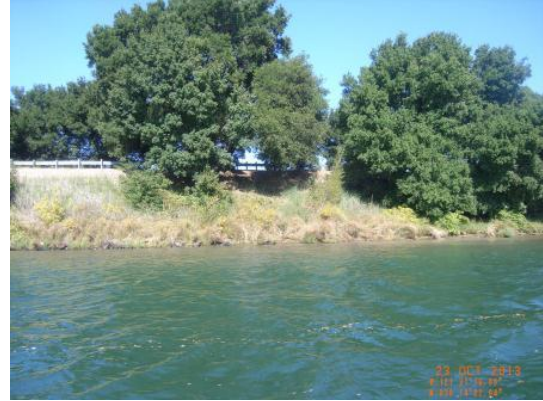
USACE 2013 Photo #2