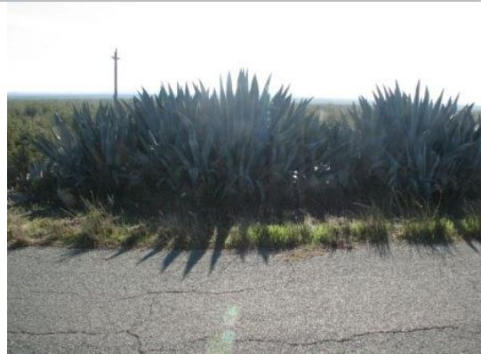
Large cactus on upper levee slope obstructs access and visibility.