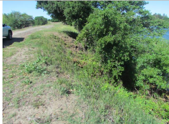
Looking south at erosion on waterward slope.