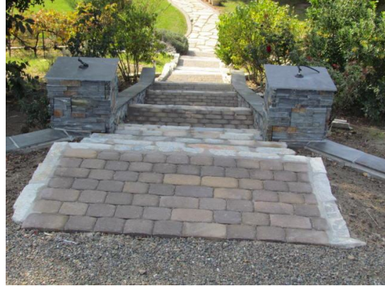
Looking west at stairs on landside slope.