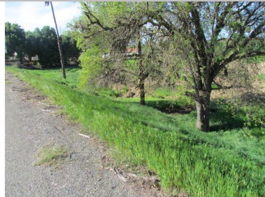
Looking southwest at untrimmed trees on landward toe.