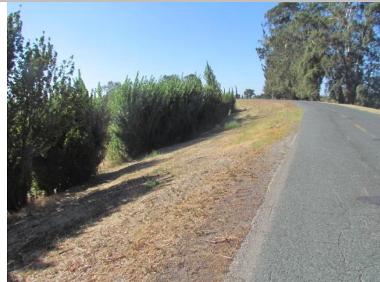
Looking southeast at trees blocking landward toe.