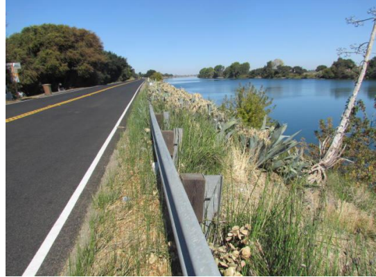
Looking northeast at century plants on waterward shoulder and slope.