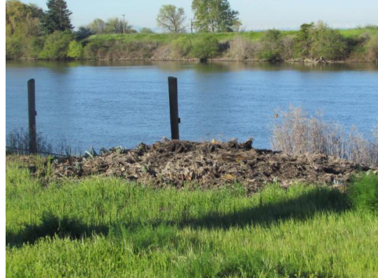
Looking west at mowed/removed century plant on waterward slope.