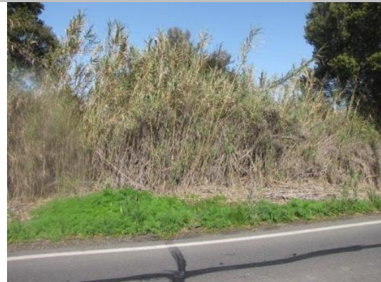
Looking west at dense bamboo on landside slope.