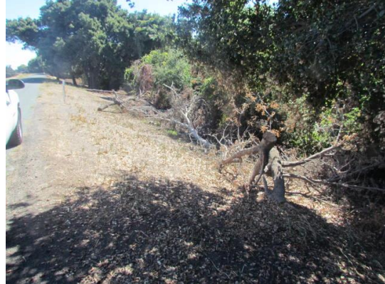
Looking northeast at tree limbs on waterward slope.