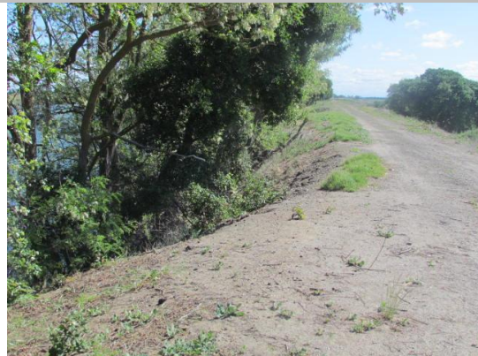
Looking north at erosion on waterward shoulder and slope.