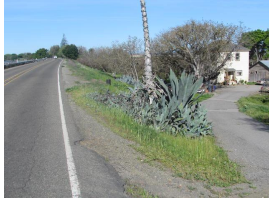
Looking west at century plant on landward slope. (Spring 2015)