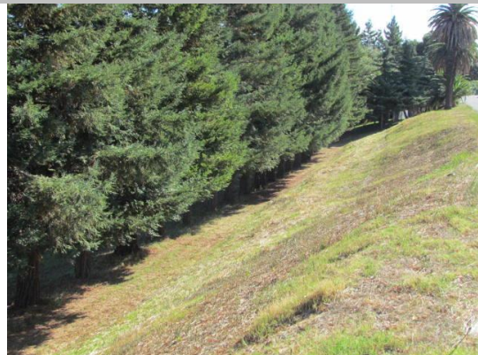
Looking northeast at dense redwood trees on landward toe and berm.