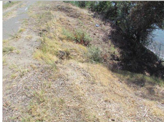
Looking northeast at erosion on waterward slope and toe.