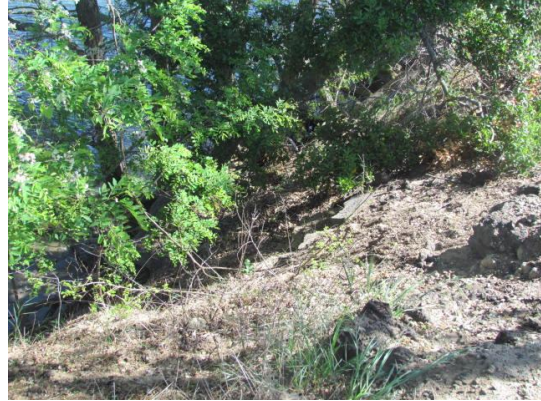
Looking west at erosion on waterward slope.