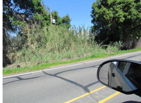
Looking northwest at bamboo on landside slope.