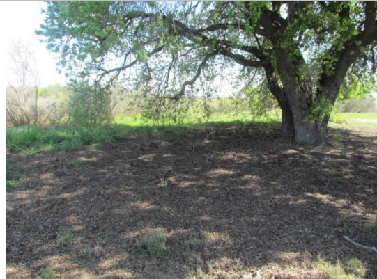
Looking west at untrimmed tree on landward shoulder.