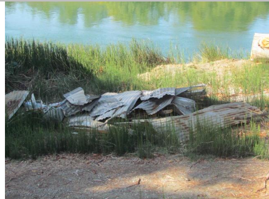
Looking west at tin roofing material on waterward berm.