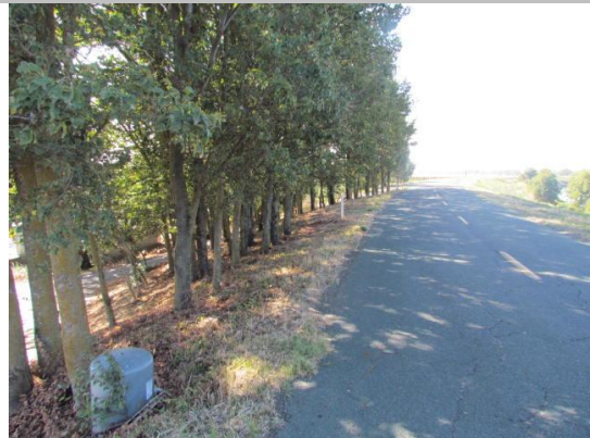
Looking southeast at trees on landward shoulder and slope. (Fall 2014)