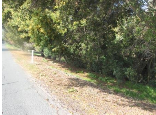
Looking west at dense vegetation on landside slope and toe.