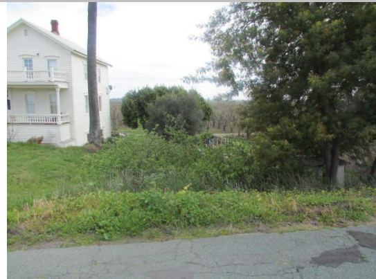
Looking east at vegetation on landside slope.