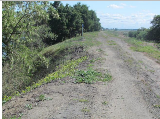
Looking northwest at erosion on waterward shoulder and slope.