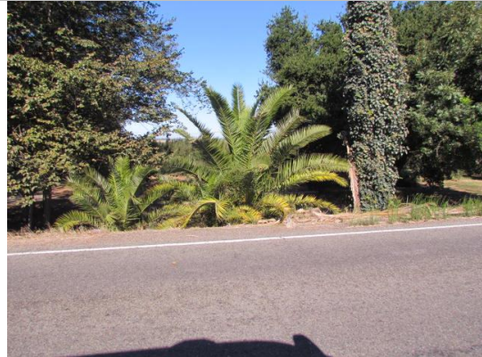
Looking north at palm trees on landward shoulder and slope.