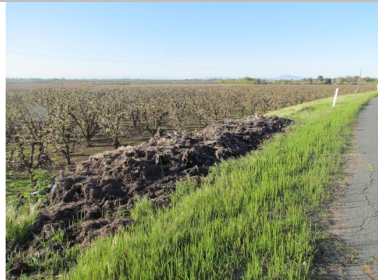
Looking southeast at cactus mowed/removed by the district