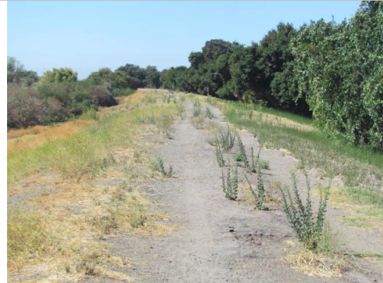
Looking south at levee crown.