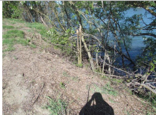
Looking west at erosion on waterward slope.