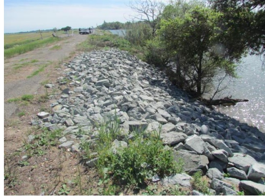
Looking northeast at repaired site on waterward shoulder and slope.