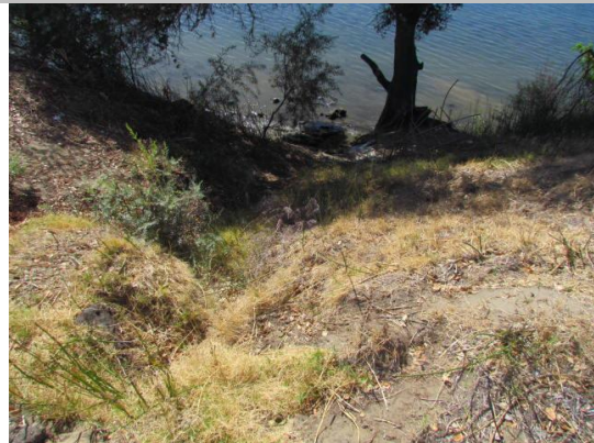
Looking east at erosion that extends from waterward shoulder to waterward toe.