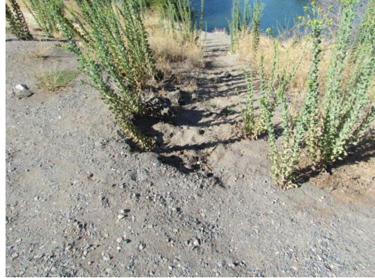
Looking west at foot erosion on waterward slope.