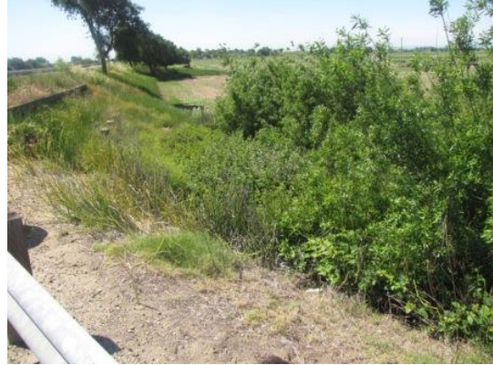
Looking southwest at dense veg. on landside toe.