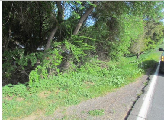
Looking southwest at dense trees on landward slope.