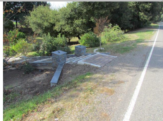
Looking northwest at stairs on landside slope.