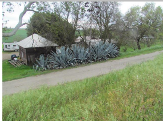
Looking northwest at century plants on landside slope next to ramp.