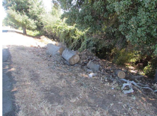
Looking at tree branches and tree limbs on waterward shoulder and slope.