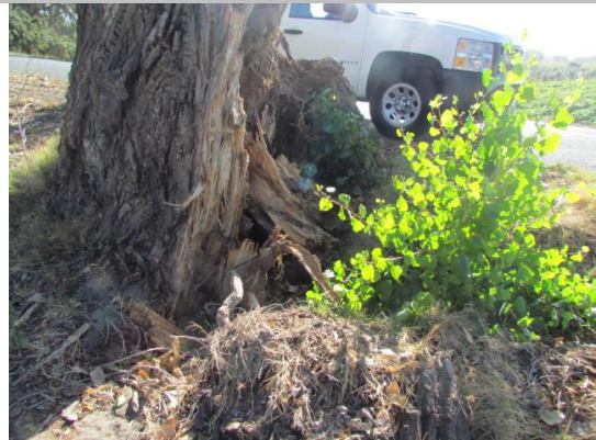
Looking east at a hole next to oak tree on waterward shoulder.