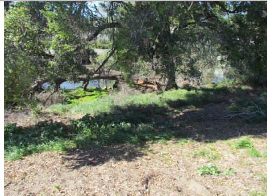
Looking east at downed tree on waterward slope.