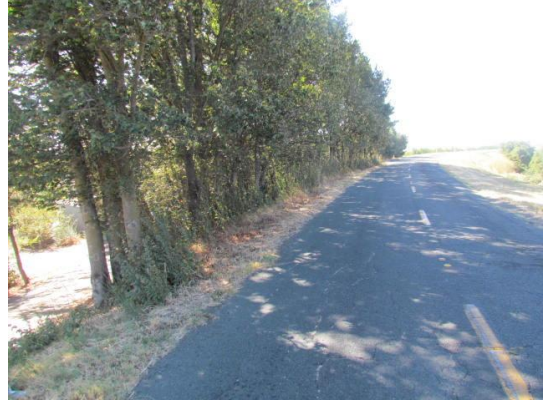
Looking south at trees on landward shoulder and slope. (Fall 2015)