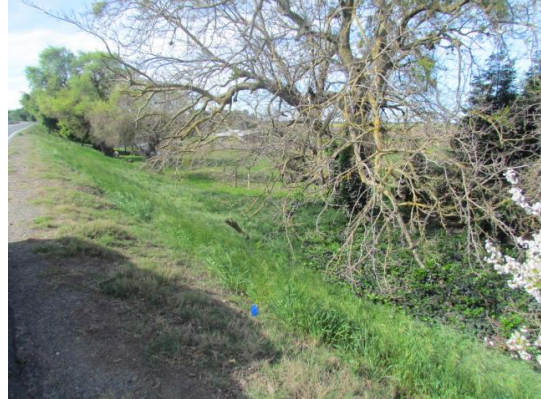
Looking west at untrimmed tree on landward slope.