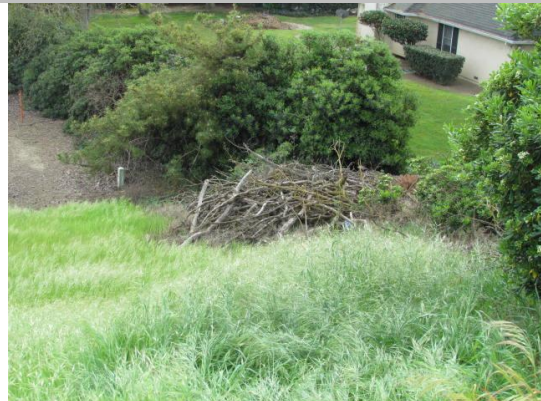
Looking east at prunings on landward slope.