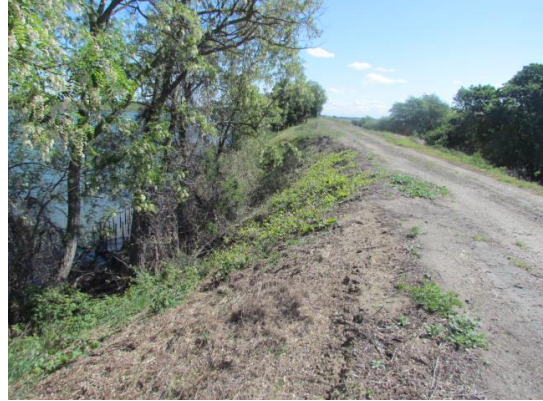
Looking north at erosion on waterward slope.