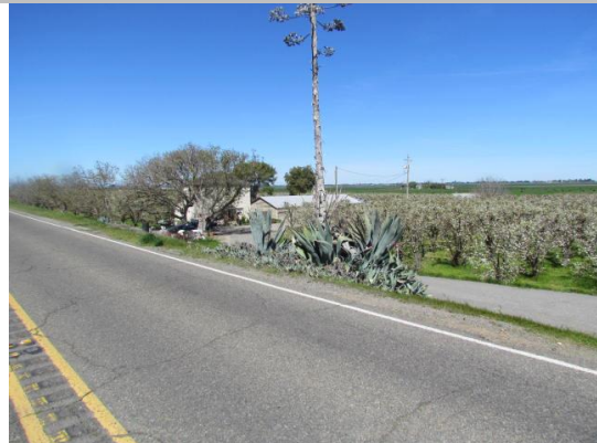
Looking northwest at century plant on landward shoulder and slope.