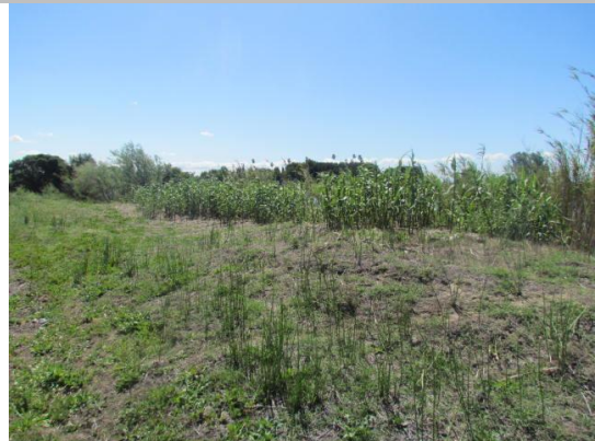
Looking northeast at the new sprouting of bamboo on waterward slope. (Fall 2013)