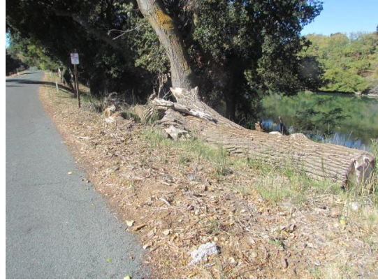
Looking west at tree branch on waterward shoulder and slope. (Fall 2014)