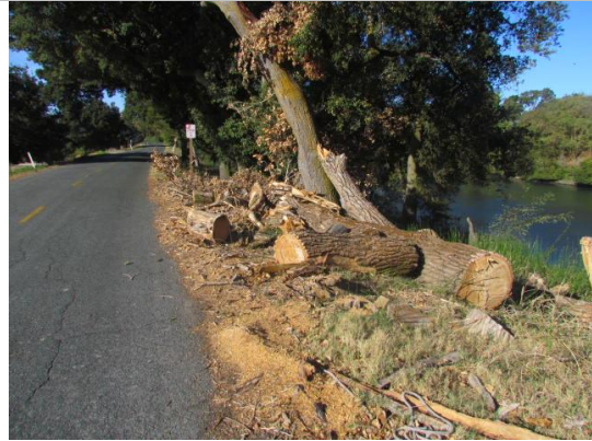
Looking south at tree branches on waterward shoulder. (Spring 2014)