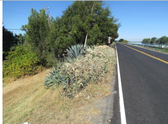
Looking north at century plants on landward shoulder and slope.