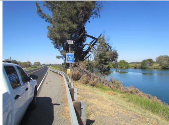
Looking northeast at broken and cracked tree branches on waterward slope.