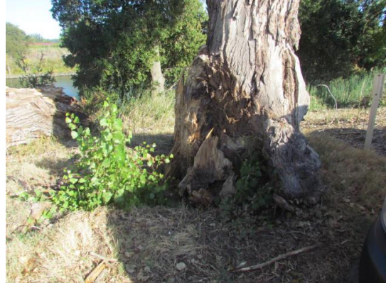
Looking west at a hole next to oak tree on waterward shoulder.