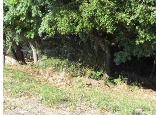
Looking west at palm tree on landward toe.

Photo 1 of 1 : FA_2015_RD0003_25_97_20150914_00076.jpg