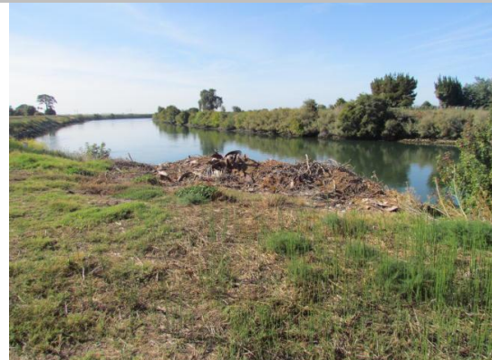
Looking southwest at grass clippings on waterward berm.