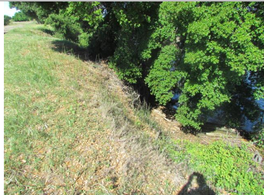
Looking southwest at erosion on waterward slope.