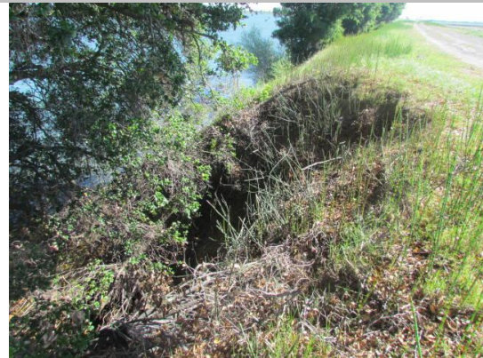
Looking northwest at erosion on waterward slope.