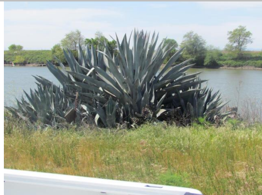
Looking west at century plant on waterward slope.