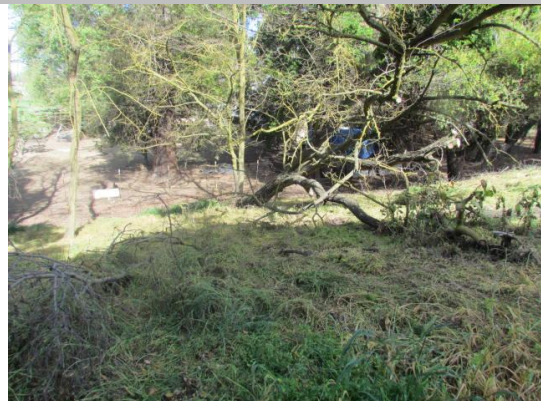
Looking west at fallen tree on landward slope.