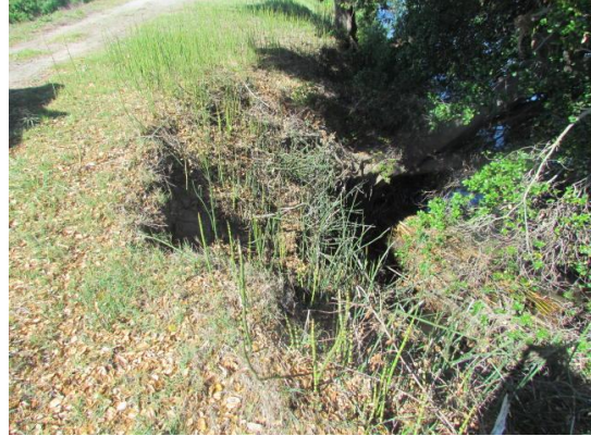
Looking southwest at erosion on waterward slope.