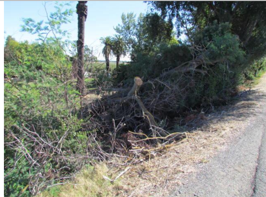
Looking east at downed tree on landward slope.