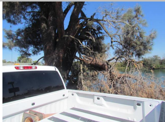
Looking east at broken and cracked tree branches on waterward slope.