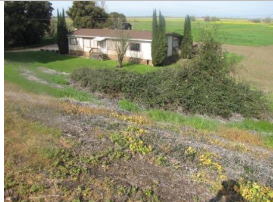
Looking west at berryvines on landside toe.