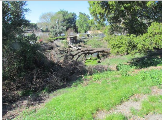
Looking southeast at downed tree on waterward slope.