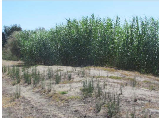
Looking northeast at established bamboo on waterward shoulder and slope (Fall 2015)