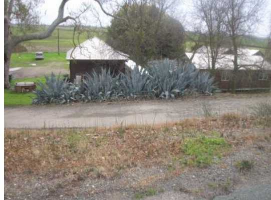
Looking west at century plants on landside slope next to ramp.