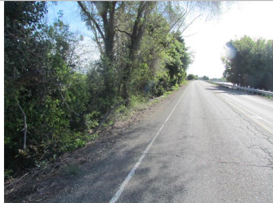
Looking east at untrimmed trees on landward shoulder and slope.